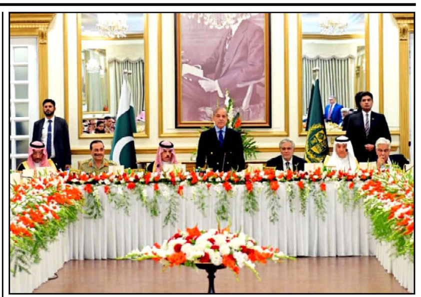
ISLAMABAD: Prime Minister Muhammad Shahbaz Sharif hosted a banquet in honour of Foreign Minister of the Kingdom of Saudi Arabia H. H. Prince Faisal bin Farhan Al Saud and the accompanying Saudi delegation

Replying to various queries, both sides reiterated to further build up and convert the strong partnership into a strategic partnership and further promote economic cooperation for the mutual benefit of the two brotherly coun-