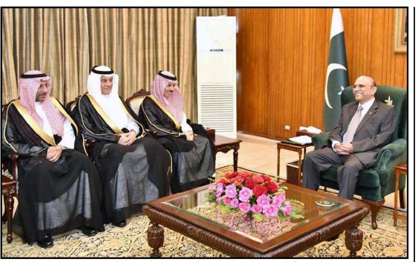
ISLAMABAD: Foreign Minister of the Kingdom of Saudi Arabia, Prince Faisal bin Farhan Al Saud along with his delegation called on President Asif Ali Zardari at Aiwan-i-Sadr.