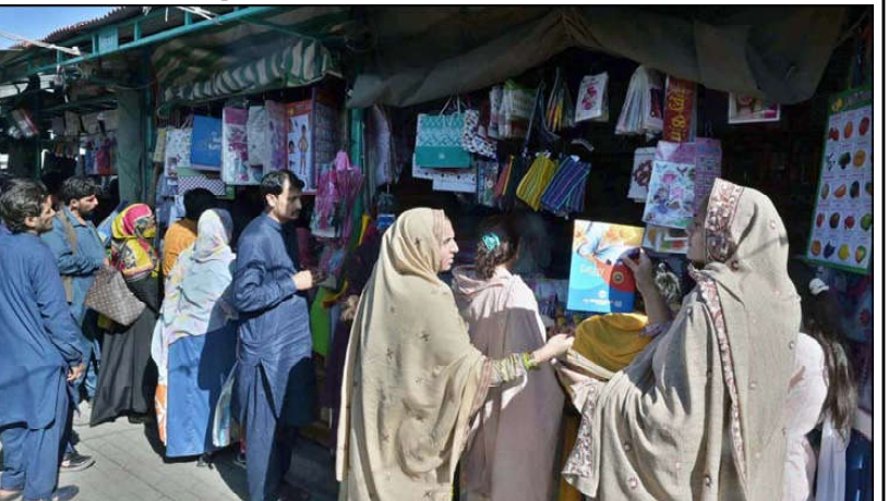
ISLAMABAD: People purchasing stationary and school bags for their chil-