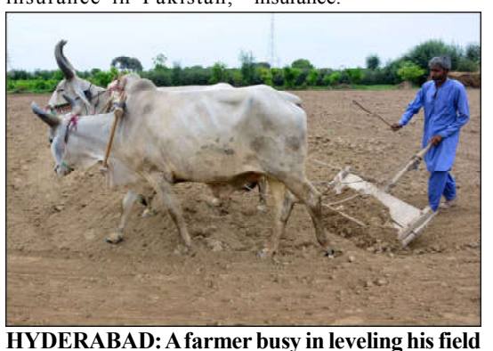
with help of bulls for next crop.

The data collected indicates a concerning status of inclusive insurance market in Pakistan. A total of 12.56 million insurance policies microfinance institutions. Out of these, 89 percent are credit life insurance, indicating a primary focus on covering the underlying credit risk. The SECP's report Moreover, of the 20 lores inclusive insurers offering inclusive