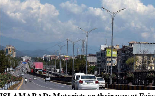
ISLAMABAD: Motorists on their way at Faisal Avenue during sunny weather after two days of rain spell in the city.