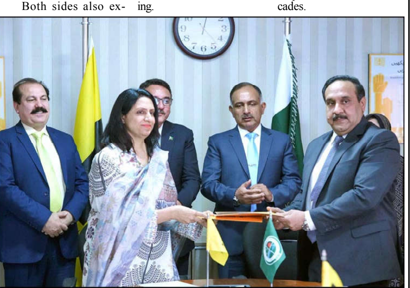
ISLAMABAD: NDMA & IRC representatives exchanging documents after signing LoU for Cooperation on Disaster Resilience & Preparedness at IRC

The Saudi Foreign Minister said that KSA considered its relations with Pakistan very critical and was committed to building a strong partnership with Pakistan. He highlighted that both countries enjoyed strong bonds and had helped each other for de-