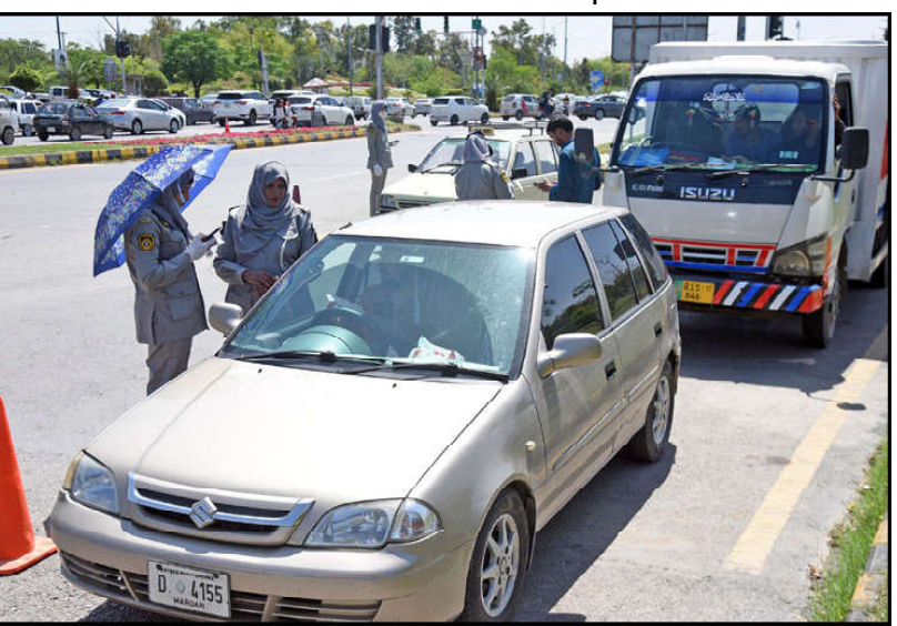
ISLAMABAD: Women traffic wardens giving Chalan ticket to motorist during checking people drives without wearing safety belt, at 9th Avenue in the Federal Capital.

Speaking to a private news channel, he reiterated the unity within the party under the leadership of Nawaz Sharif. He expressed confidence that, they too don't want that with Nawaz Sharif's guid ance, the party will effectively tackle the nation's economic difficulties.