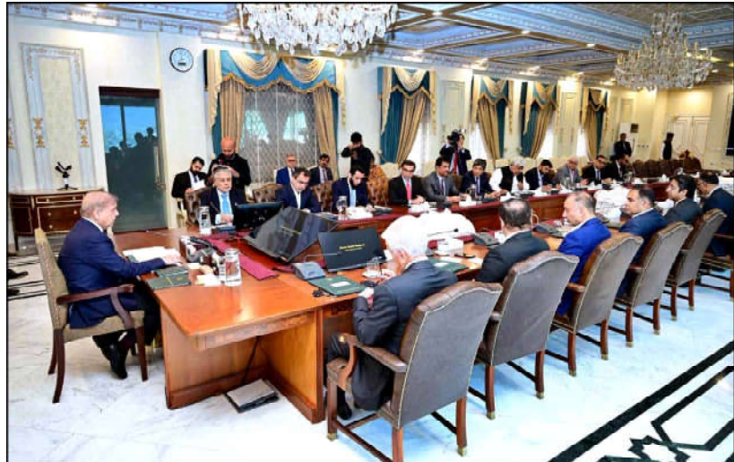
ISLAMABAD: Prime Minister Muhammad Shehbaz Sharif chairs a high level review meeting regarding power sector

The process of auction of those power plants of Generation Companies (GENCOs) that were lying dysfunctional and defective should be accelerated, he further directed.