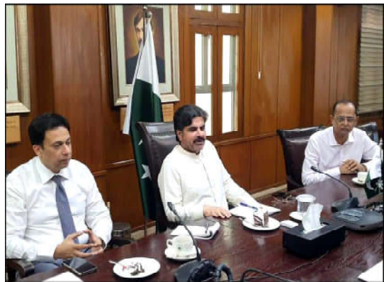
KARACHI: Provincial Minister for Development and Planning Sindh Syed Nasir Hussain presiding over a high-level meeting of P&D Board

Minister added that safe city projects should be started at the divisional level, in this regard the concerned members of the assemblies should be taken onboard, they will be included in this project and they should also be involved in the funding. Nasir Shah emphasized on this occasion that the schemes should be thoroughly reviewed and prepared in such a way that they do not need to be revised. In the case of revising, not only the expenses of the government increase, but due to the delay of the project, the people also have to face difficulties and problems, while it is part of the vision and manifesto of Chairman Bilawal Bhutto that to make Sindh developed.