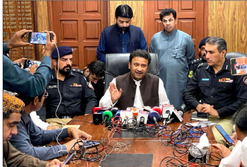
SUKKUR: Sindh Home Minister Zia-ul-Hassan Lanjar along with Sindh Inspector General of Police (IGP), Ghulam Nabi Memon and others addresses to media persons during press conference regarding ongoing operation in the Kashmir and Kacha areas