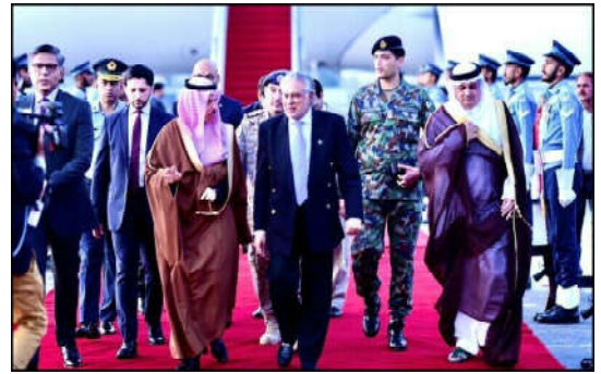
RAWALPINDI: Saudi Foreign Minister Prince Faisal bin Farhan Al Saud received by Foreign Minister Ishaq Dar upon his arrival at Nur Khan Airbase

The Ambassador further said we should take economic security as foundation, and continue to promote the building of an upgraded version of CPEC.