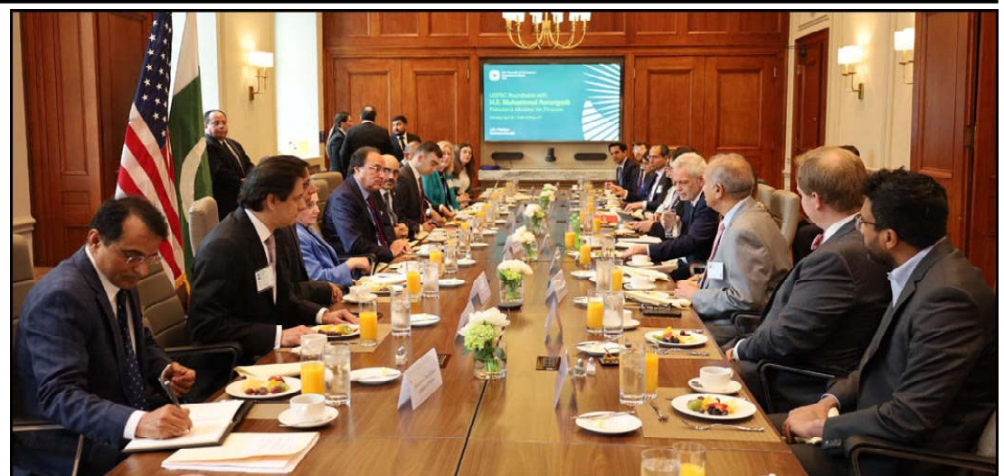
Finance Minister Mr. Muhammad Aurangzeb met with US Pakistan Business Council @ USPBC delegation in Washington D.C. Highlighted govt's commitment to improving business climate & attracting foreign & domestic investments in key sectors including agriculture, IT, mining, & energy.