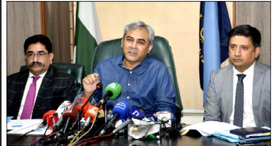
LAHORE: Federal Minister for Interior, Mohsin Raza Naqvi talking to media persons in Lahore

"At this time, all evidence is pointing towards them (India), it is inappropriate to say more before the investigation is completed but the pattern [of killings] is almost the same."