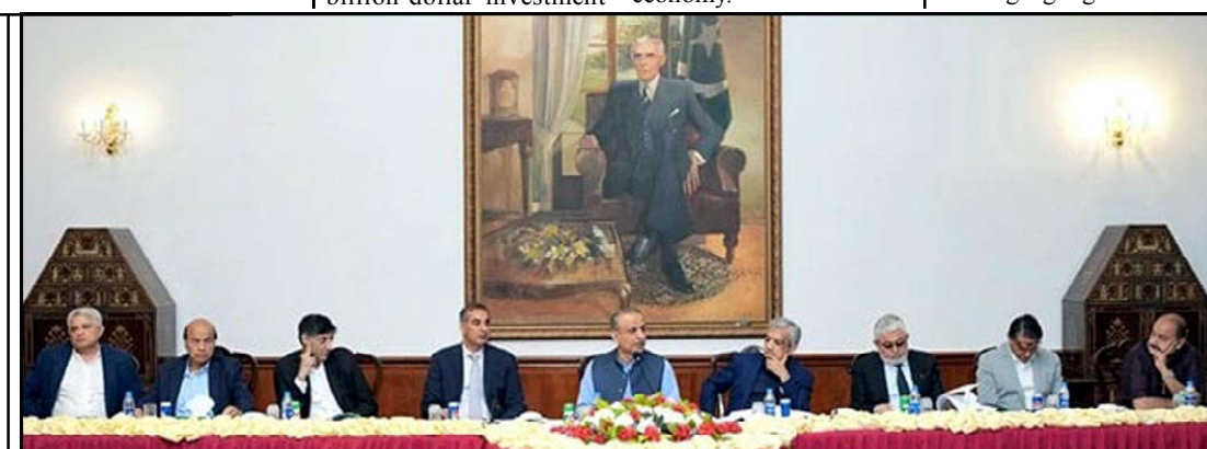
Federal Minister for Privatization, Board of Investment and Communications, Abdul Aleem Khan presided over a meeting of business community in Karachi.

In a key development, Pakistan's economic team led by Finance Minister Muhammad Aurangzeb had left for Washington on Sunday to hold talks with the International Monetary Fund (IMF) for a new bailout programme.