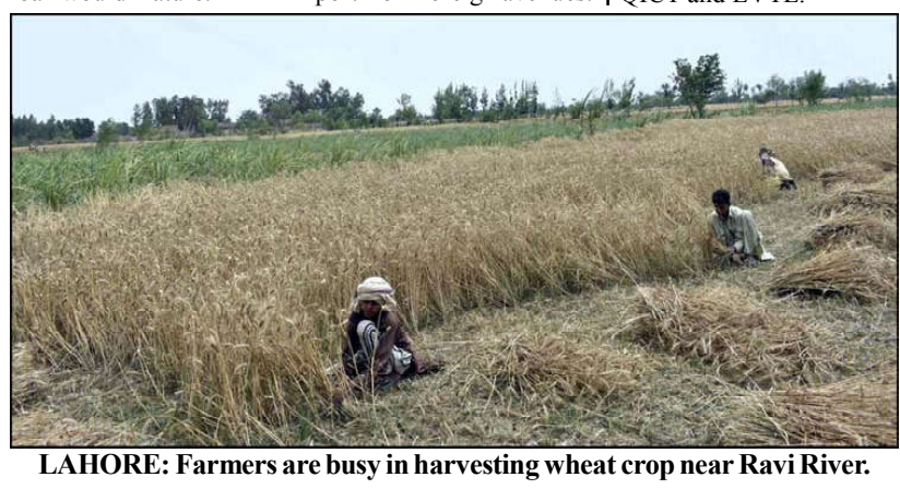
LAHORE: Farmers are busy in harvesting wheat crop near Ravi River.

156 sustained losses, whereas the share prices of 17 remained unchanged. In PSX, the three top trading companies were WorldCall Telecom with 88,622,330 shares at Rs.1.39 per share, Fauji Cement with 33,100,985 shares with Rs.20.01 per share and Fauji Foods Limited with 30,022,192 shares at Rs.10.05 per share. Bata Pakistan Limited witnessed a maximum increase of Rs.25.00 per share price, closing at Rs.1,725.00, whereas the runner-up was Sugar Engineering Works Limited.