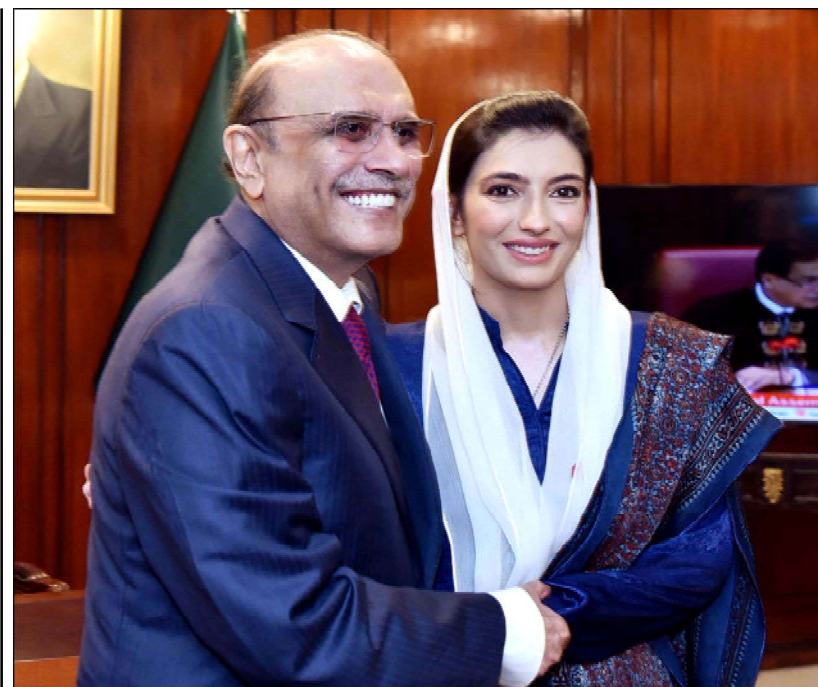
ISLAMABAD: President, Asif Ali Zardari congratulating Aseefa Bhutto Zardari on taking oath as Member of the National Assembly

The rider on the other motorbike survived the accident.