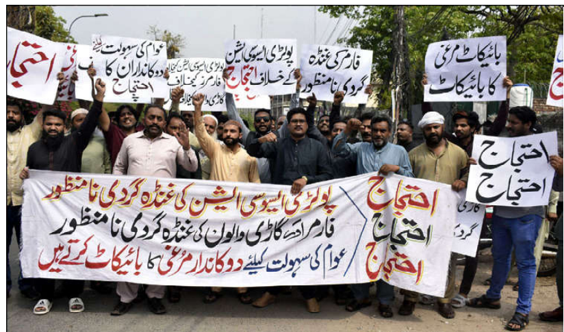
LAHORE: Chicken retailers protesting for their demands in front of the press club in the Provincial Capital.