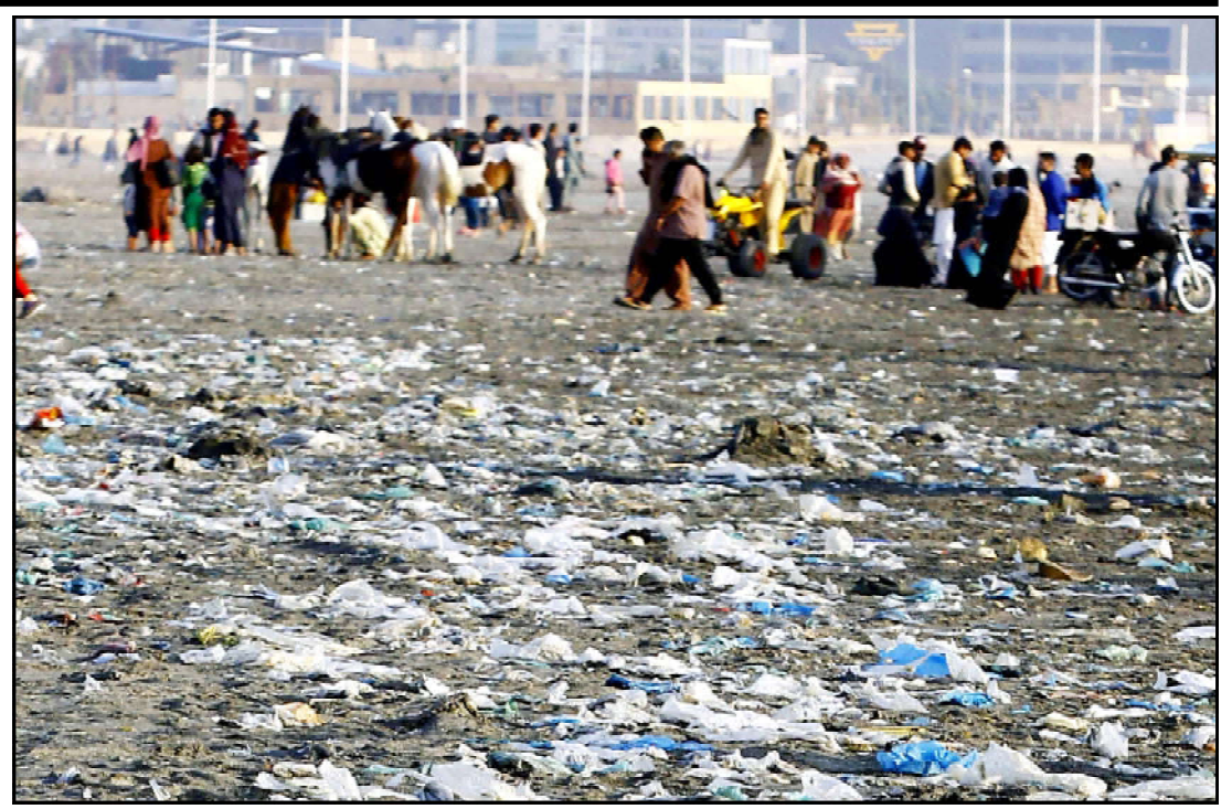
KARACHI: A view of garbage lay along with Sea View Beach creating problems for commuters and unhygienic atmosphere, showing the negligence of concern authorities

KARACHI (INP): A delegation of Muttahida Qaumi Movement-Pakistan (MQM-P) will meet with Prime Minister Shehbaz Sharif to discuss replacing Sindh Governor Kamran Tessori with a new one, sources said on Monday. Sources further said that the MQM-P was interested in bringing a new governor in place of Tessori, and that, too, from the party. The delegation, sources disclosed, would also put forward some names to the prime minister who could replace Tessori. Following the meeting, the advice would be sent to President Asif Zardari, they said, adding that the new governor was expected to be announced this week.