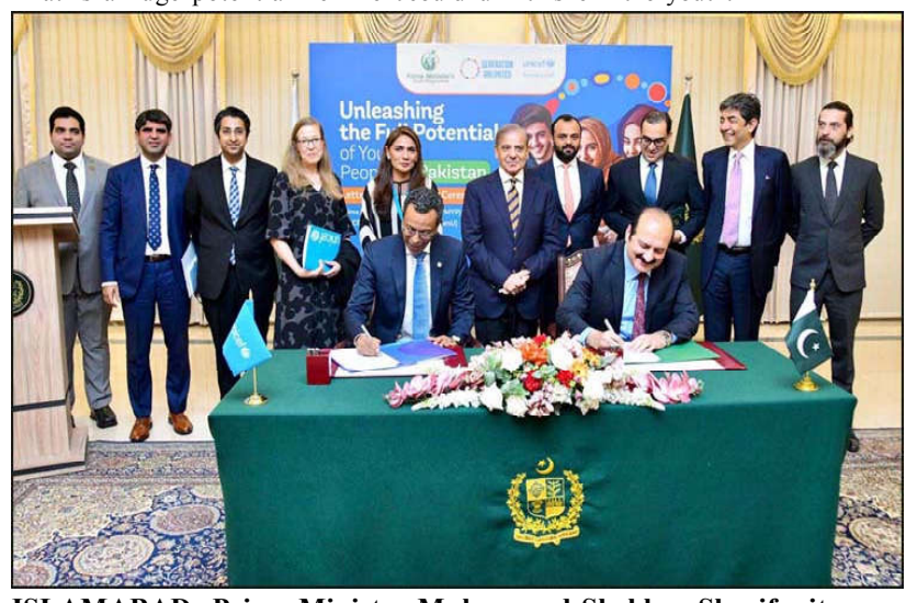
ISLAMABAD: Prime Minister Muhammad Shehbaz Sharif witnesses singing of a letter of intent between Prime Minister's Youth Programme and the United Nations International Children's Emergency Fund.

The minister said that he was proud to inform that Shehbaz Sharif during his stints as chief minister of the Punjab had attached great importance to vocational training and skill development. From day one, the priority of the PML-N was skill development of