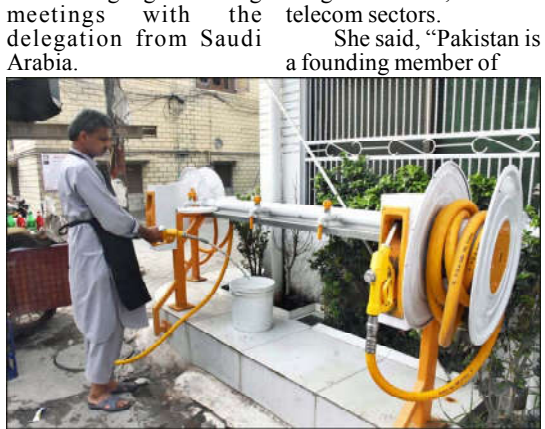
filtration plant with petrol pump style water nozzle at Mubarak Pura.

Shaza Fatima said that the incumbent government was working on various policies and legislation whether it was related to data protection, cyber security, cloud policy to create feasible environment for growth of IT, tech and telecom sectors. She said, "Pakistan is