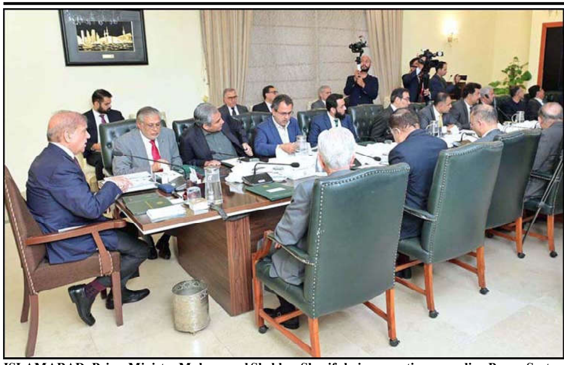
ISLAMABAD: Prime Minister Muhammad Shehbaz Sharif chairs a meeting regarding Power Sector. comprehensive plan in the presented.