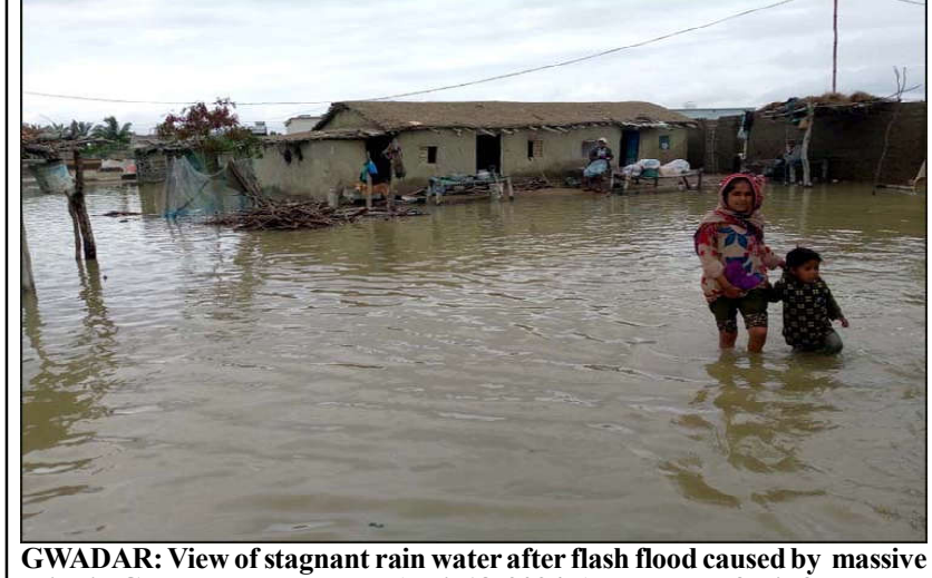
rains in Gwadar on Thursday, April 18, 2024. A new spell of rainfall played havoc with various parts of Balochistan submerging the port city of Gwadar.

He underscored the need to elevate the trade volume between the two countries from the current $2.8 billion to a target range tion across various sectors. of $10 to $25 billion.