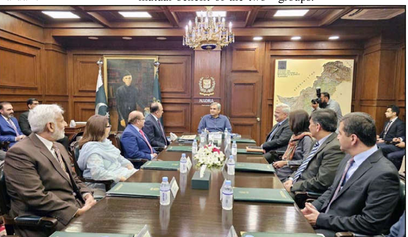
ISLAMABAD: Interior Minister Mohsin Nagyi chairing a meeting at NADRA Headquarters.

He emphasized the continuous exchange and collaboration between the two parliaments through