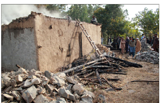
ABBOTTABAD: Local man gathering the remains of a soil hut situated in the village Dheri, after fire eruption, due to short circuit.