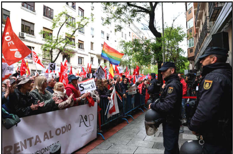
People gather outside Spain's Socialist Party (PSOE) headquarters to show support for the Secretary General of PSOE and Prime Minister Pedro Sanchez, in Madrid, Spain.

almost daily. Ukraine has lost about 80% of its thermal generation and about 35% of its hydropower capacity, officials added. Its energy system was already weakened by a Russian air campaign in the first winter of the war that Russia launched in February 2022. Despite mild spring weather in recent weeks, Ukraine has faced an electricity deficit and the government had to introduce scheduled blackouts in several regions and turn to emergency electricity imports. In the Dnipropetrovsk region, Ukrainian air defence shot down 13 Russian missiles, said Governor Serhiy Lysak.