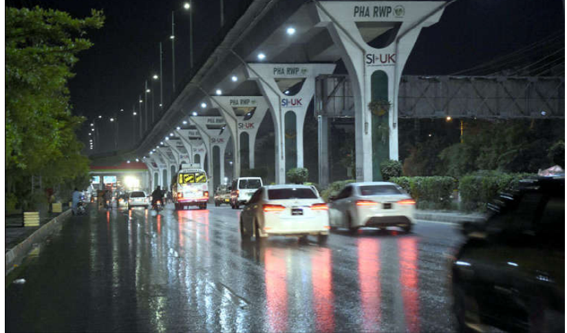
ISLAMABAD: Motorists on their way at Murree road during rain in the city.

The Chilam Josh festival starts at Rumbur valley and then festivities extend to other valleys of Kalash. People pray for the protection of their fields and animals before going to their fields and for this purpose, they usually spread milk on their Gods. On the first day, the Z'oshi/Zosh ceremony takes place, where boys and girls go to the higher pastures to pluck wildflowers and walnut leaves to the beat of drums. On second day, C'irik pi pi (Milk drinking and distribution day) is held, in which goat stables are decorated with wildflowers and walnut leaves, singing rituals, and ceremonies take place in every village.