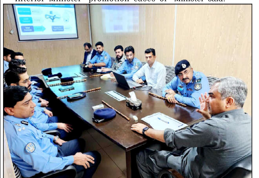
ISLAMABAD: Federal Minister for Interior Mohsin Naqvi chairing a meeting regarding improving Law & order situation and crackdown against criminals in the capital.

They are improving the condition of police stations in Islamabad, better results will be obtained soon, the Interior Minister said.