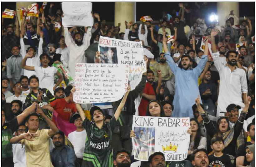
LAHORE: Cricket fans watching 5th T-20 match between Pakistan and New Zealand at Pindi Cricket Stadium in the city.

Shaheen Afridi was once again Pakistan's MVP with the ball as the left-arm took the game away from the visitors with his heroics in the 15th over as he sent James Neesham and Zakary Foulkes back to the pavilion on back-to-back deliveries. He ended his spell with 4/30 figures.