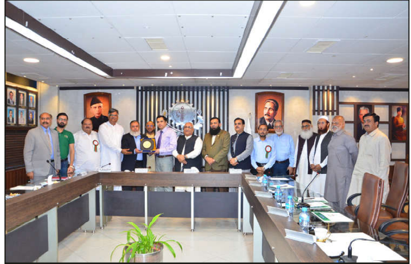
FAISALABAD: A group photo of Faisalabad Chamber of Commerce and Industry.