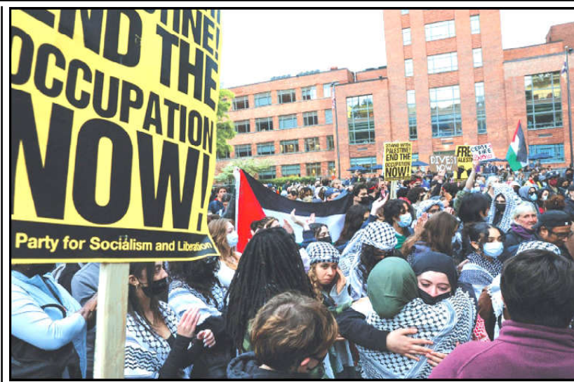
Students and others wearing keffiyeh scarves embrace during a demonstration in support of Palestinians at a protest encampment in the yard of George Washington University in the US capital.