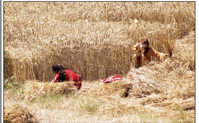
MULTAN: Women Farmers are busy cutting wheat crop in the field.

He said that Khyber Pakhtunkhwa was an important stakeholder in the development of the regional economy and there were very vast and useful opportunities for foreign investors in various sectors, which could be utilized by the regional investors. He said that mutual contacts and holding joint forums were essential for finding the possibilities of investment at local level as bilateral cooperation was important platform for promotion.