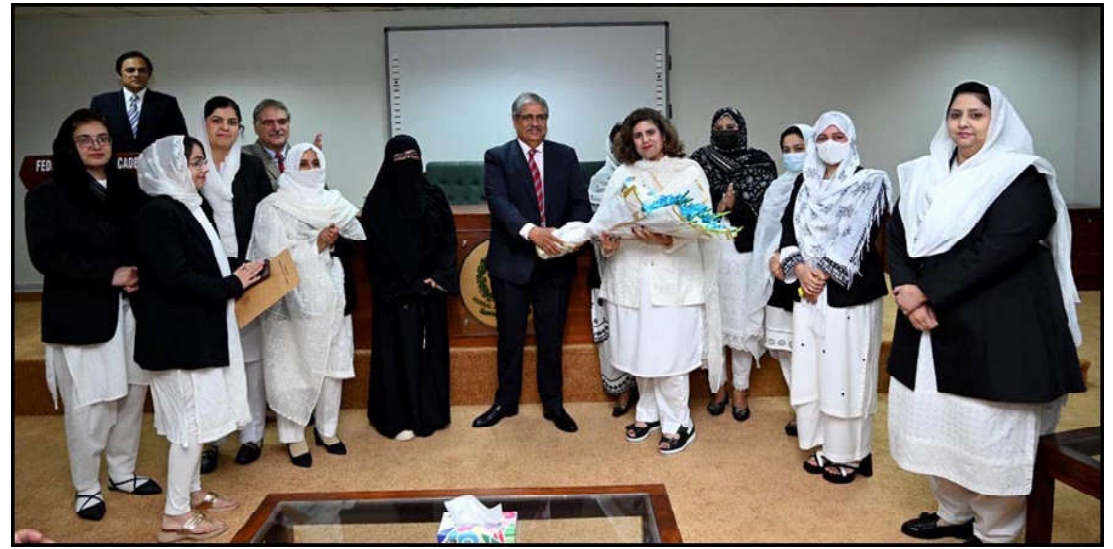
ISLAMABAD: District Judiciary Judges from all over Pakistan presenting a bouquet of flowers to Hon'ble Mr. Justice Athar Minallah in a certificate awarding ceremony at the Federal Judicial Academy.

and shrines were not only the places of holding big religious gatherings, but the pulpits of these institutions have always represented the people's emotions and their political aspirations. "It is for this reason that every anti-Kashmir and Hindutva RSS/BJP ruler, at different times in the history, has tried to weaken the centrality of these religious centers of the territory", the spokesman added.