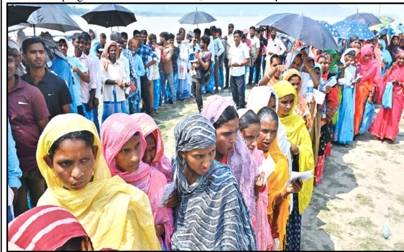
Voters stand in a queue to cast their ballot at a village in Assam.

Monitoring Desk MADRID: Thousands of Socialist Party supporters travelled from across Spain for a rally at the party's Madrid headquarters on Saturday to call on Prime Minister Pedro Sanchez to stay on, after he stunned the country this week by saying he might quit the premiership. Sanchez said on Wednesday he would step back "for a few days" to decide whether he wants to continue leading the government after a court launched a business corruption probe into his wife's private dealings. He said this was part of a sustained campaign of slander against him and his family by political opponents. Sanchez denies the allegations made against his wife, Begona Gomez, and said he will announce his decision on his future on Monday. "Prime Minister, stay, Pedro, stay. We are with you," Maria Jesus Montero, Deputy Prime Minister and Treasury Minister, told a meeting of the party's federal committee. Outside, euphoric supporters thronged the streets and played popular pop songs urging Sanchez to stay, with many waving flags or with their faces painted.