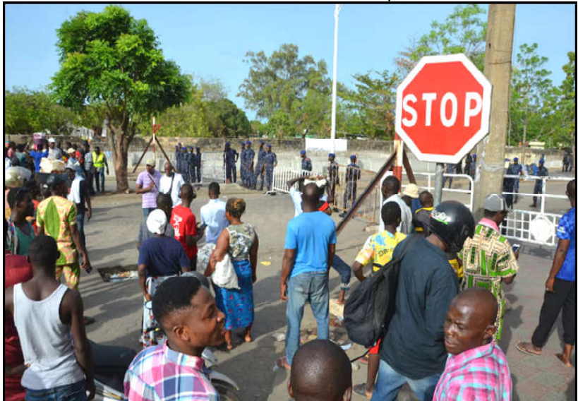
Security forces cordon off a street as members of Benin's Trade unions demonstrate to demand higher wages and better working conditions in Cotonou, Benin.