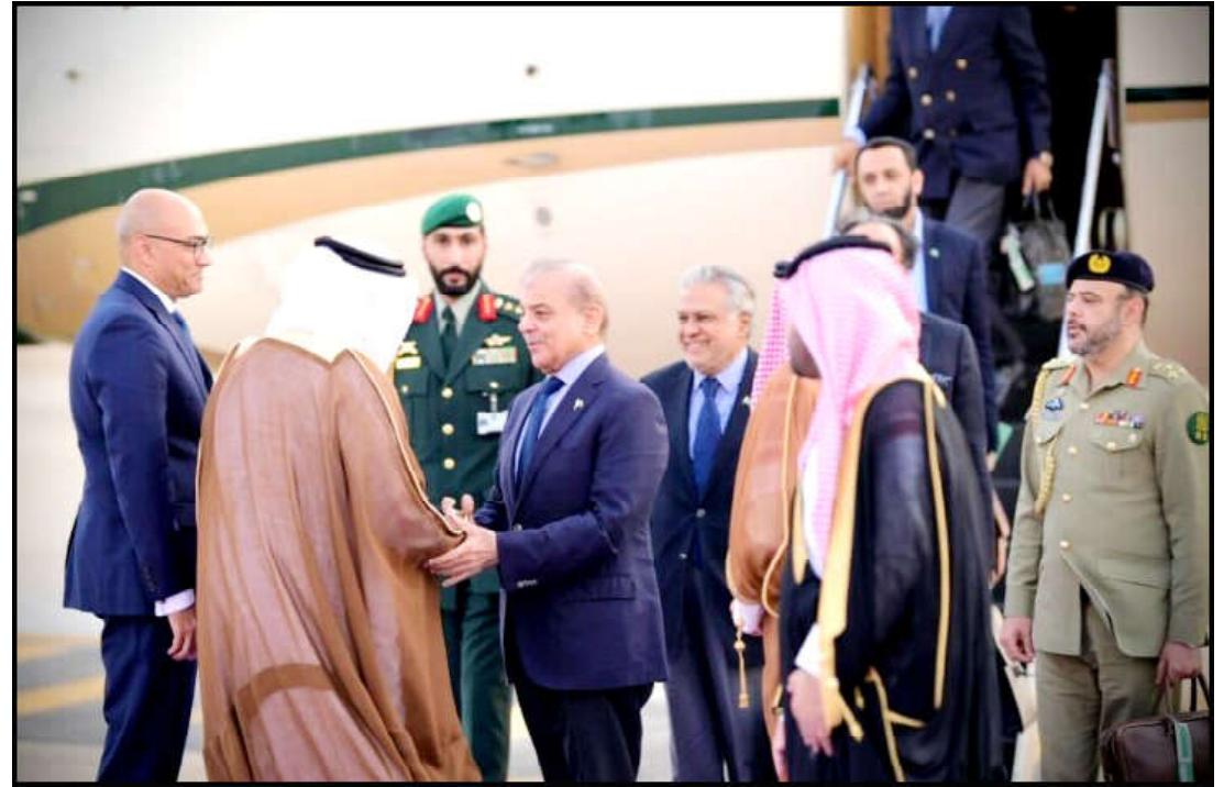
Prime Minister Muhammad Shehbaz Sharif arrived in Riyadh, Saudi Arabia, to attend the special meeting of World Economic Forum on Global Cooperation, Growth and Energy

A proposed 6 to 7-page draft proposing amendments to the judges' code of conduct was also included in the recommendations.