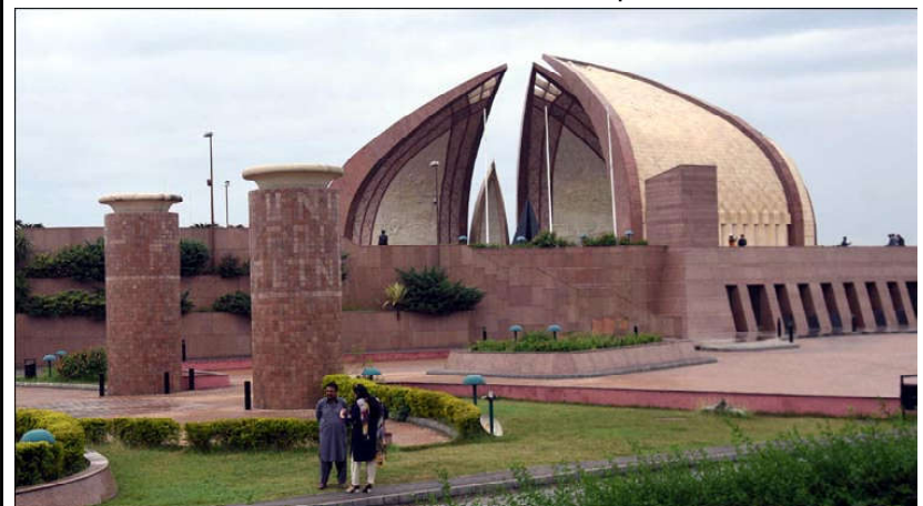
ISLAMABAD: A view of Pakistan Monument of the Federal Capital after rain.

Justice Rahul Bharti in his judgment said, "This court cannot resist but to hold that the preventive detention of the petitioner is mala fide and illegal". He added, "The petitioner has been made to suffer a loss of his liberty for a cumulative period of more than 1,080 days of preventive custody, covered under the span of four detention orders in a row from 2019 to March 2024."