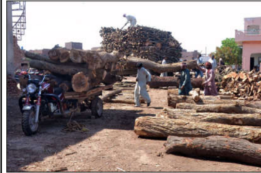
MULTAN: Laborers are loading heavy wood pieces on tricycle Rickshaw and the tractor trolley at the Timber Market.

The price of per tola and ten gram silver remained stagnant at Rs.2,650 and Rs.2,271.94 respectively.