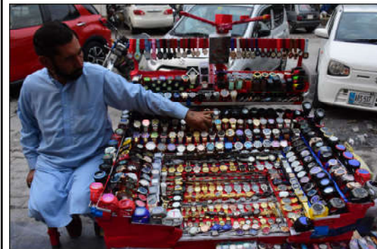
ISLAMABAD: A roadside stall holder selling wrist watches in the Federal Capital.

"At 25-26pc interest rate, it is hard to borrow from the banks," he said, adding that it will be hard for the government to earn revenue due to a decline in large-scale manufacturing.