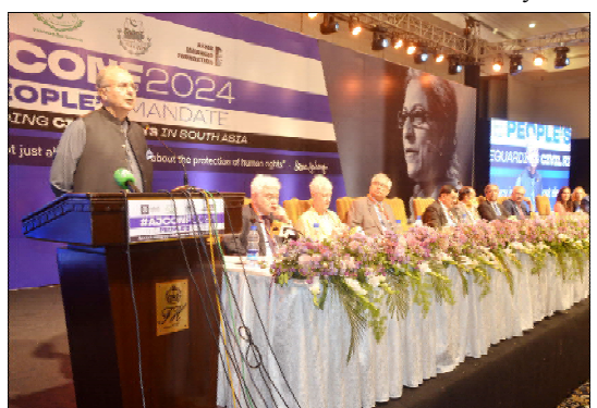
LAHORE: Supreme Court Justice Syed Mansoor Ali Shah addressing the Asma Jahangir conference at the local hotel of the Provincial Capital.

To improve the working and create better environment within judiciary, the senior judge also called for inducting more women in judiciary from the district level to the top and establishing commercial courts in the country.