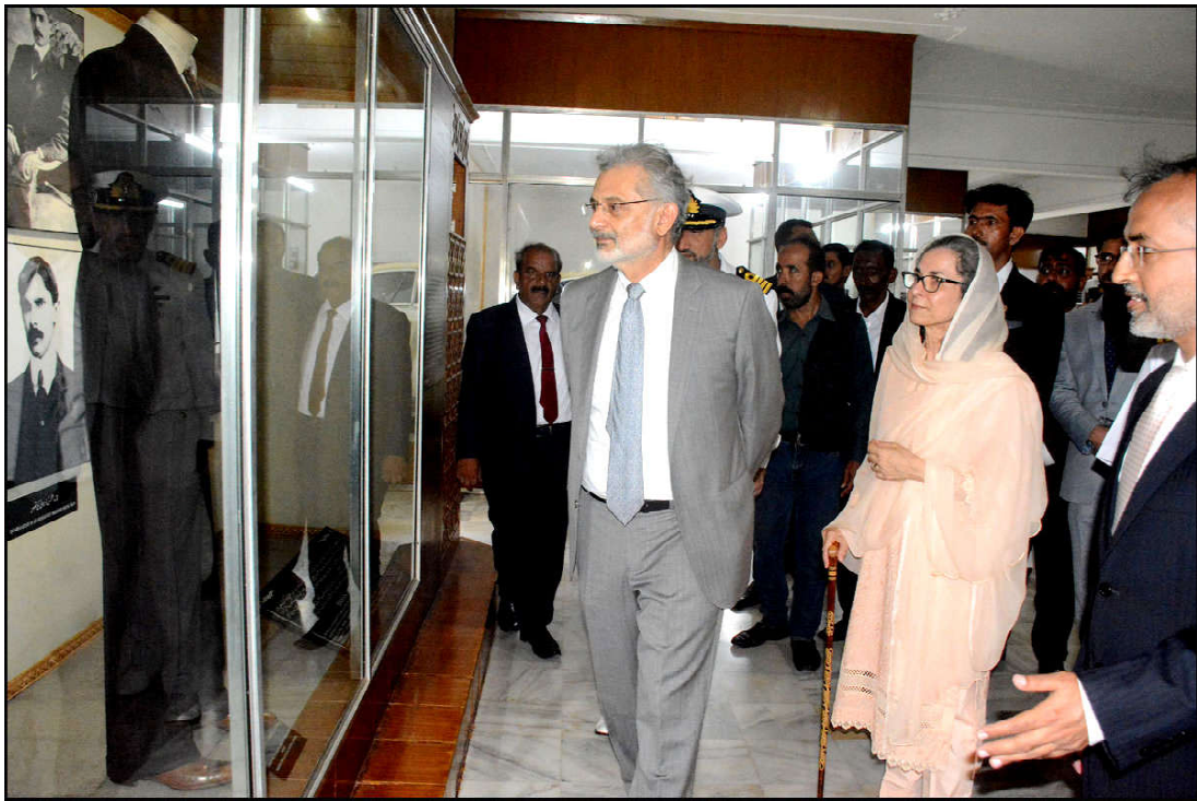
KARACHI: Chief Justice of Pakistan, Justice Qazi Faez Isa visiting a museum at the mausoleum of father of the nation Quaid-e-Azam Mohammed Ali Jinnah.