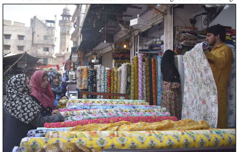
LAHORE: Women buying summer clothes at Delhi Darwaza Bazar of Provincial Capital.

potential market for foreign investors, who still have plans to make fresh investment in the country, but they have continued to wait for the return of economic stability. He highlighted uncertainty in the rupee-dollar parity as one of the major concerns of foreign investors. He said a slowdown in the economy had badly impacted business confidence. It is must for the authorities concerned to first create an enabling environment for the local businessmen desiring to make new investment. Maaz Mahmood advocated the need for raising the country's tax.