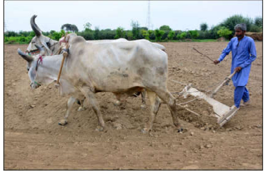
HYDERABAD: A farmer busy in leveling his field with help of bulls for next crop.

The SECP's report Moreover, of the 20 insurers offering inclusive