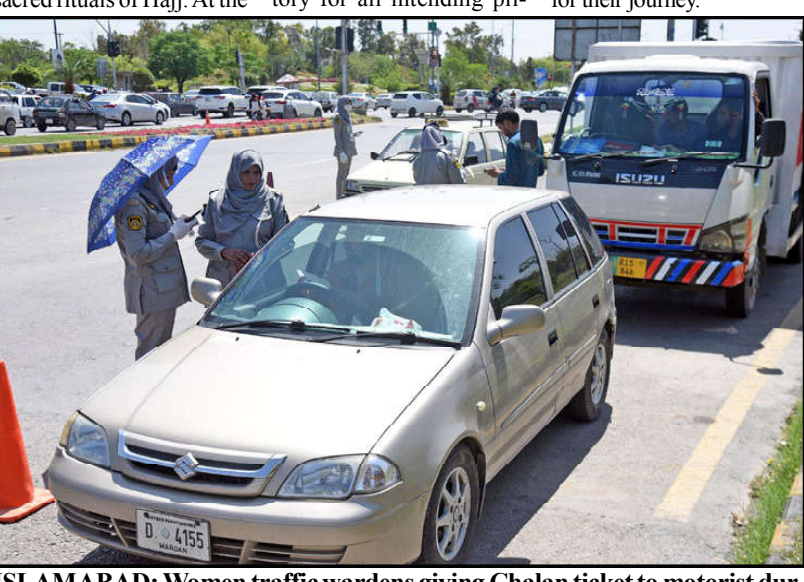
ISLAMABAD: Women traffic wardens giving Chalan ticket to motorist during checking people drives without wearing safety belt, at 9th Avenue in the Federal Capital.

The second phase of Hajj training will continue from April 15 to 30, 2024, he said adding that during this period, participants would receive comprehensive guidance on various aspects of the pilgrimage, ensuring that they are well-prepared for their journey.