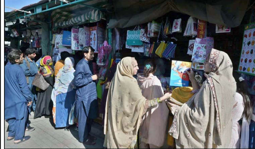
ISLAMABAD: People purchasing stationary and school bags for their children as new session starts in schools at H-9 Weekly Bazaar in Federal Capital.

Rs\ 1.5\ mln\ to\ Rs7.5 mln in Tier 2 and Tier 3 programmes respectively to empower the youth by providing loans for their business objectives through collaborative efforts and empowering them economically. During the meeting, Rana Mashhood Ahmed Khan expressed firm commitment of the government to provide easy access to loans for the youth. He emphasized the government's vision to nurture success stories, envisioning every Pakistani youth as a beacon of prosperity and innovation.