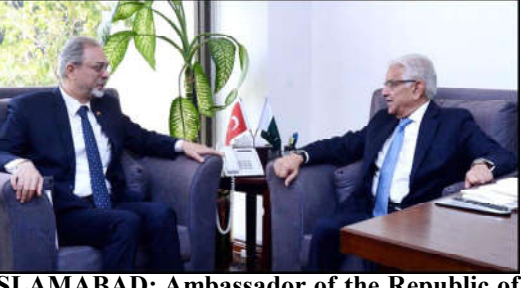
ISLAMABAD: Ambassador of the Republic of Turkiye, H.E. Mehmet Pacaci called on Minister for Defence Khawaja Muhammad Asif.

Ambassador Jadoon identified key challenges in regulating online content, including the decentralized nature of the internet. commercialization of online platforms prioritizing profit over accuracy, and the increasing use of AI tools for spreading false information. He called for the global principles that denounce digital imperialism and upholds core principles such