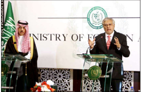
catastrophic situation in

Addressing a joint presser along with Saudi Foreign Minister Prince Faisal bin Farhan Al Saud, Foreign Minister Ishaq Dar said that Pakistan was deeply concerned over the