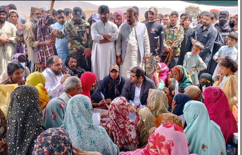
QUETTA: The administration successfully negotiated with the protestors and the protest ended on the assurance of bringing the missing persons to the

firing PESHAWAR (APP): A least three people were killed when unknown assailants fired at them in Malli Khel area of Akora Khattak in Nowshera district on Tuesday. Police said those killed by the firing of He said that differunknown assailants were close relatives adding that the dead bodies have been