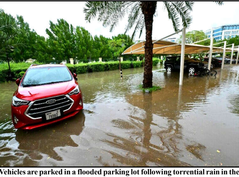
Gulf Emirate of Dubai, UAE.

the wealthy nation. "I will relinquish my