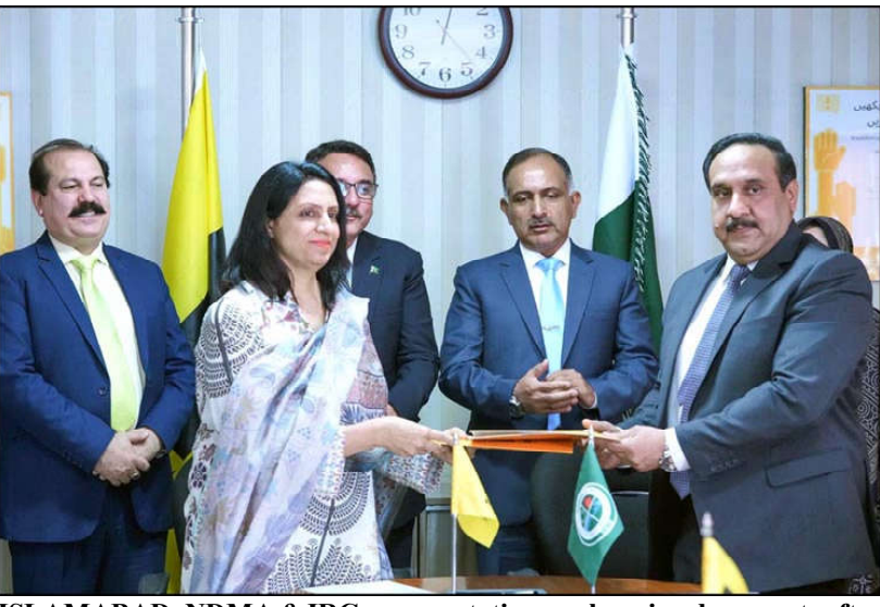
ISLAMABAD: NDMA & IRC representatives exchanging documents after signing LoU for Cooperation on Disaster Resilience & Preparedness at IRC Headquarters.

Both entities will also jointly host engagements for dissemination of findings and learning with relevant stakeholders nationally and provincially.