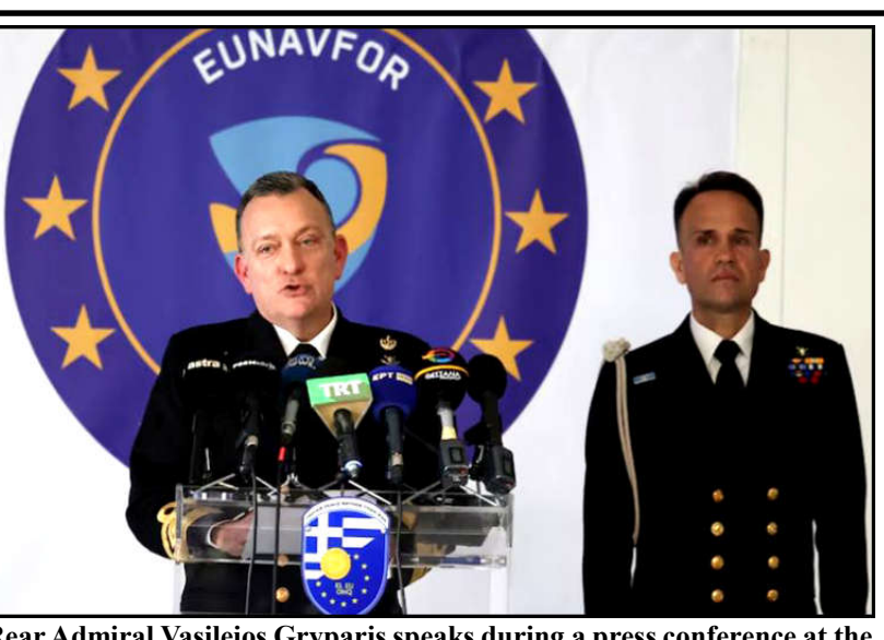
Rear Admiral Vasileios Gryparis speaks during a press conference at the European Union's naval mission "Aspides" headquarters in Larissa, Greece.