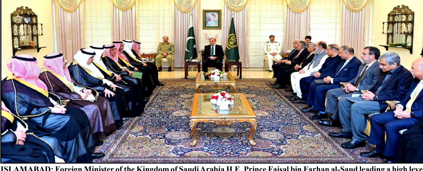
ISLAMABAD: Foreign Minister of the Kingdom of Saudi Arabia H.E. Prince Faisal bin Farhan al-Saud leading a high level delegation called on Prime Minister Muhammad Shehbaz Sharif

The counsel for EC Zaigham Anees assured the court to provide the certified copies before next hear ing. The court adjourned hearing of the case till April