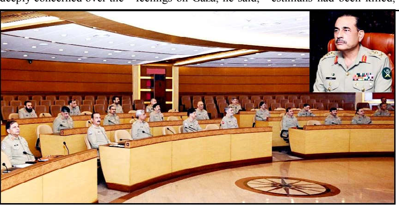
RAWALPINDI: Chief of the Army Staff General Syed Asim Munir presiding over the 264th Corps Commanders Conference at General Headquarters