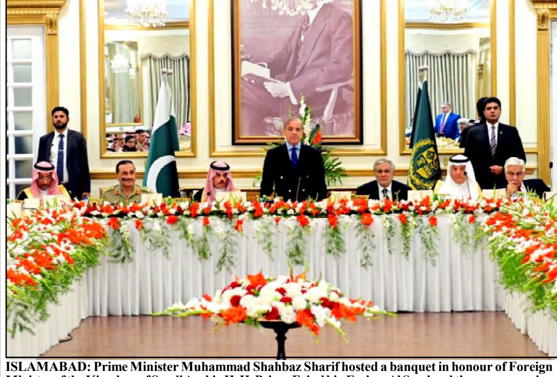
Minister of the Kingdom of Saudi Arabia H. H. Prince Faisal bin Farhan Al Saud and the accompanying