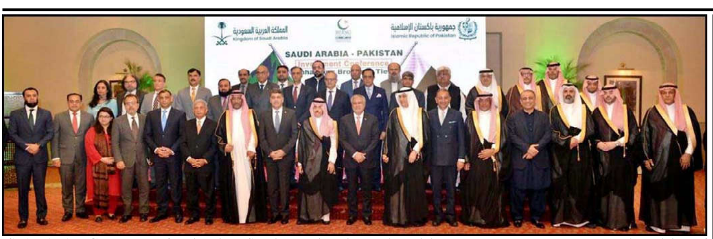
ISLAMABAD: Group photo of Pakistani and Saudi delegation with Foreign Minister, Mohammad Ishaq Dar and Foreign Minister of the Kingdom of Saudi Arabia, Prince Faisal Bin Farhan Al Saud on the occasion of Saudi Arabia - Pakistan Investment Conference.