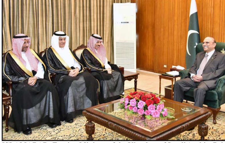
ISLAMABAD: Foreign Minister of the Kingdom of Saudi Arabia, Prince Faisal bin Farhan Al Saud along with his delegation called on President Asif