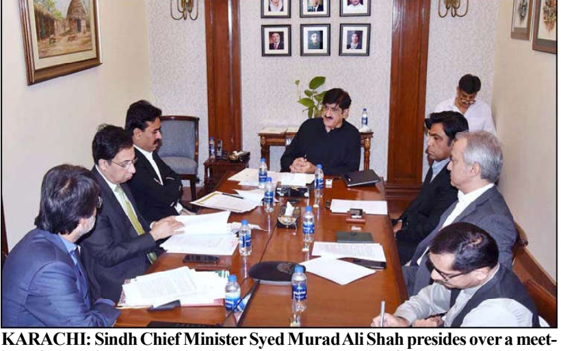
ing of the Irrigation and Agriculture Departments at CM House.