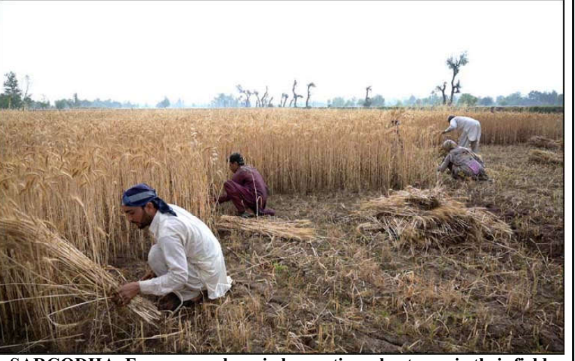
SARGODHA: Farmers are busy in harvesting wheat crop in their field.

measure has been taken to observe the behaviour of pressure fluctuation. Generation from the Power Station will be increased gradually after analysis and deliberations with the Project Consultants, WAPDA spokesman told media here Tuesday.