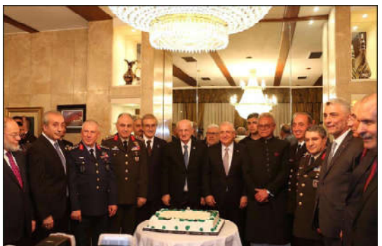
ANKARA: Turkish Minister for National Defence H.E. Yasar Guler, Turkish Minister for Trade H.E. Prof. Dr Omer Bolat, Ambassador H.E. Dr. Yousaf Junaid during Pakistan Day reception.

The Ombudsman praised performance of the doctors and other medical staff of Trauma Center and assured complete support to its administration. He said that the Trauma Center is an exemplary institution which is providing best medical services to the patients. He said that the institutions like Trauma Center would be encouraged and fully supported.