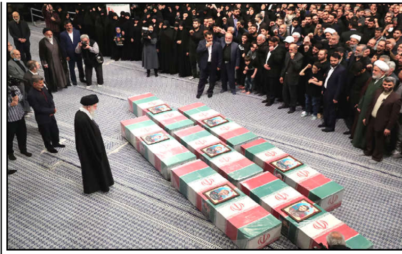
Iran's Supreme Leader, Ayatollah Ali Khamenei looks at the coffins of members of the Islamic Revolutionary Guard Corps who were killed in the Israeli airstrike on the Iranian embassy complex in the Syrian capital Damascus, during a funeral ceremony in Tehran, Iran.

Monitoring Desk BRUSSELS: The United States and European Union will continue to support Armenia and ethnic Armenians displaced from the Nagorno-Karabakh region, leaders from both sides of the Atlantic pledged as they were meeting with Prime Minister Nikol Pashinyan on Friday. Azerbaijan took control of the former breakaway region of Nagorno-Karabakh in September 2023, prompting a mass exodus of its ethnic Armenian population. "We're committed to further growing our support to Armenia's democratic and economic resilience," said U.S. Secretary of State Antony Blinken, adding Washington was backing the country's efforts for more food security, digital infrastructure and diversification of its energy sector. "And we will continue to support the 100,000 ethnic Armenians displaced from the Nagorno-Karabakh region. This is central to Armenia's long-term stability", Blinken added. Armenia is a treaty ally of Russia and traditionally Moscow's closest partner in the South Caucasus, but the two sides' relations have sharply deteriorated in recent months. Yerevan has sought to build ties with the West, blaming Russia for failing to defend it from Azerbaijan, its neighbour and longtime rival, as well as distancing itself from Moscow's war in Ukraine. Russia, Azerbaijan and Baku's close ally Turkey had criticised the Brussels meet-