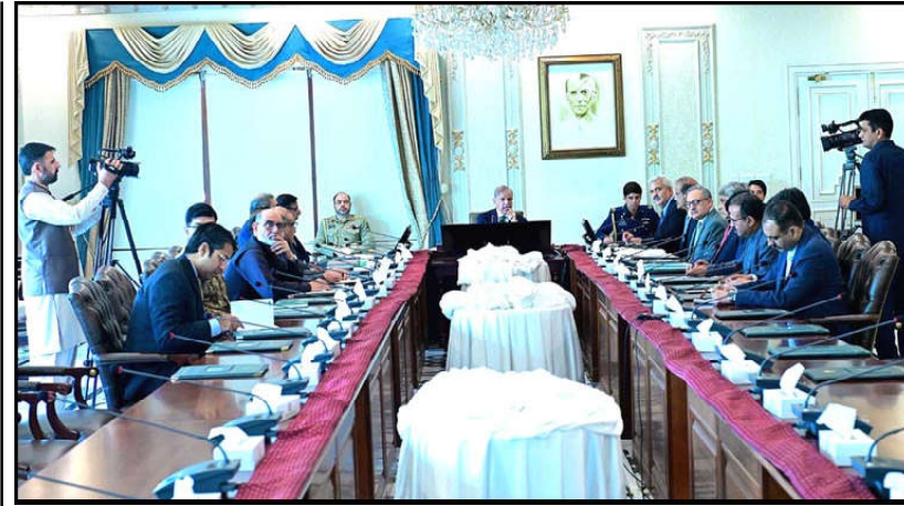
ISLAMABAD: Prime Minister Muhammad Shehbaz Sharif chairs a meeting regarding security situation in the country.

Imran Khan stated that despite people across the world demanding an immediate ceasefire, the powerful continue to remain unmoved as all humanitarian laws, laws of war, the UN Genocide Convention, the Geneva and Vienna Conventions continue to be violated with impunity by Israel.