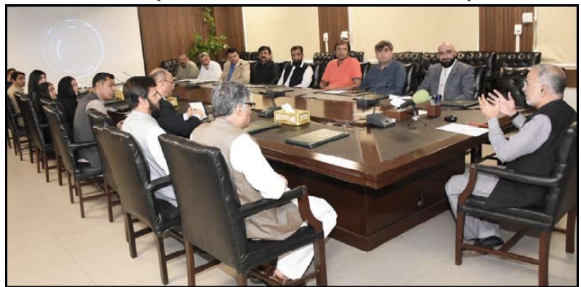
ISLAMABAD: Federal Secretary IPC chaired a meeting for Launching of the E-licencing portal for provision of Online services to users of travel and Hospitality trade in ICT and GB

unprovoked bombing of innocent civilians by Israel continues in Gaza," the prime minister commented. He reiterated Pakistan's demand for the international community to play its role to pressure Israel to stop oppression against the Palestinian people. He also requested the Muslims in Pakistan and all over the world, observing the last Friday of Holy Ramadan to specially pray for their Palestinian and Kashmiri brothers and sisters for their salvation from the atrocities. He also called for prayers for peace, security and prosperity of Pakistan, and its riddance from the economic problems.