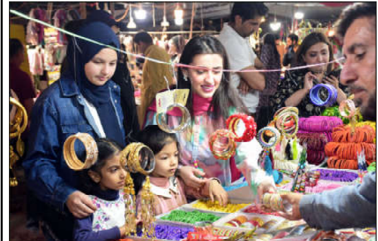
ISLAMABAD: Women busy in shopping for upcoming Eid ul Fitr Festival at a local market, in Federal Capital.

ISLAMABAD (APP): The weekly inflation measured by the Sensitive Price Indicator (SPI), witnessed an increase of 0.96 per cent for the combined consumption groups during the week ended on April 4, the Pakistan Bureau of Statistics (PBS) reported on Friday. According to the PBS data, the SPI for the week under review in the above-mentioned group was recorded at 326.29 points as compared to 323.20 points during the past week. As compared to the corresponding week of last year, the SPI for the combined consumption group in the week under review witnessed an increase of 29.45 per cent. The weekly SPI with the base year 2015-16 =100 covers 17 urban centres and 51 essential items for all expenditure groups. The SPI for the lowest consumption group up to Rs. 17,732, increased by 0.83 per cent and went down to 315.95 points from last week's 313.35 points. The SPI for consumption groups from Rs. 17,732-22,888, Rs. 22,889-29,517; Rs. 29,518-44,175 and above Rs. 44,175, increased by 0.90 per cent, 0.85 per cent, 0.93 and 1.02 per cent respectively. During the week, out of 51 items, prices of 16 (31.37%) items increased, 13 (25.49%) items decreased and 22 (43.14%) items remained stable.