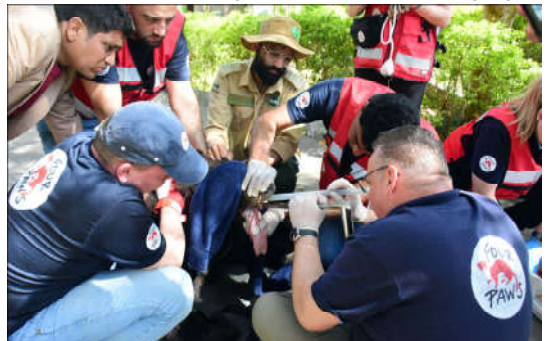
ISLAMABAD: Members of global animal welfare organizations, Four Paws International perform a surgical procedure on a female bear 'Anila' removing her nose ring at the old Islamabad zoo, in the Federal Capital.

nizing, attending, or participating in any public meetings or processions within the constituency's area for a period of 48 hours after the polls end, until midnight. The ECP cautioned that those who breach these regulations could be subject to penalties such as imprisonment for a maximum of two years, a fine of up to Rs 100,000, or both. Arrangements have almost been completed to hold the by-elections in five National and 16 provincial assembly constituencies in Punjab, Khyber Pakhtunkhwa, and Balochistan on April 21. National Assembly constituencies included NA-8 Bajaur; NA-44 Dera Ismail Khan-I; NA-119 Lahore-III; NA-132 Kasur-II; and NA-196 Kamber Shahdadkot-I. Khyber Pakhtunkhwa constituencies included PK-22 Bajaur-IV and PK-91 Kohat-II. Balochistan Assembly constituencies included PB-20 Khuzdar-III and PB-22 Lasbela. Punjab Assembly constituencies included PP-22 Chakwal-Cum-Talagang.