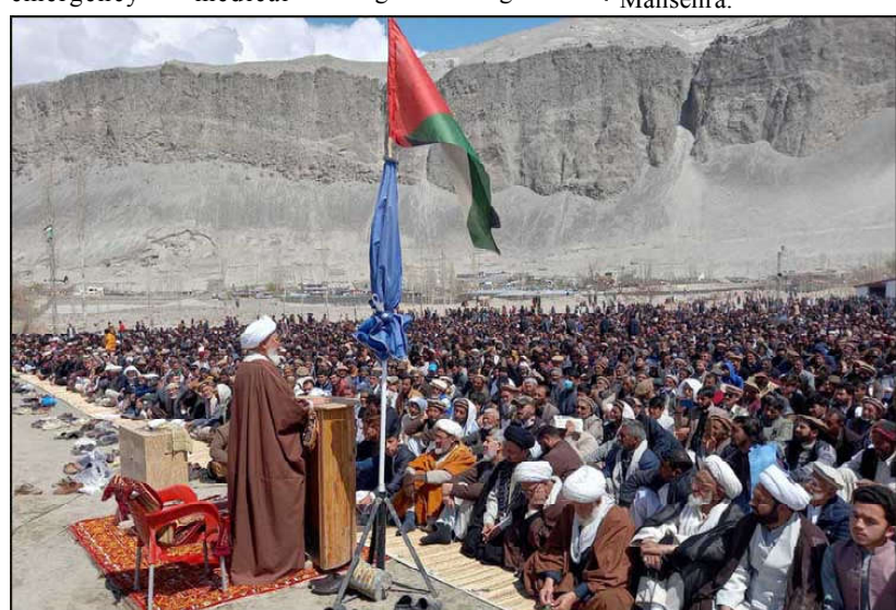
SKARDU: A religious scholar is giving sermon on the last Nimaz-e-Jumma of the holy month of Ramazan at Eidgah Ground.