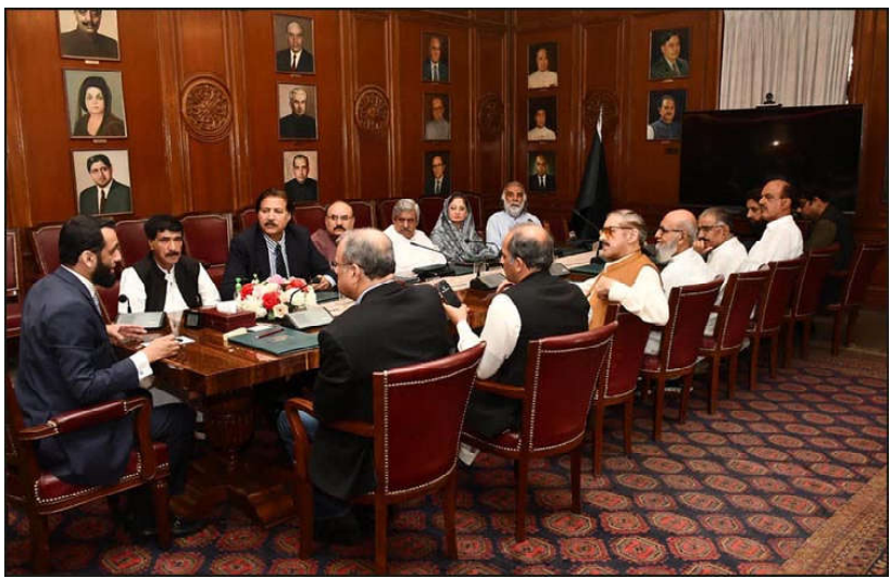
KARACHI: Mr. Attaullah Tarar, Federal Minister for Information and Broadcasting in a meeting with a delegation of CPNE.