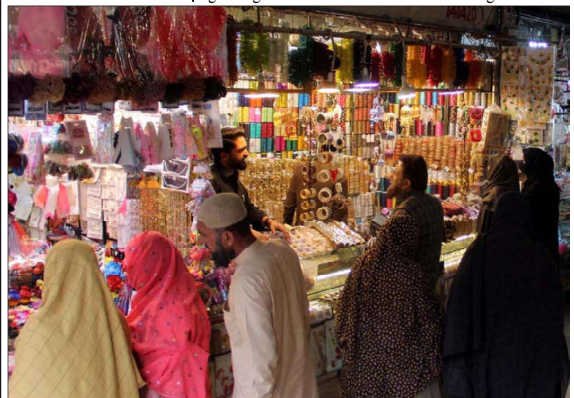
QUETTA: People are busy in Eid shopping ahead of Eid-ul-Fitar during the Holy Month of Ramadan-ul-Mubarak, at Liaquat Bazar in Quetta.

ISLAMABAD (APP): As a direct outcome of these efforts, a substantial number of gas meters were seized, effectively preventing the theft of millions of rupees worth of gas. The operation revealed 10 direct bypass connections in the Bhara Kahu area alone, highlighting the significant financial losses incurred by the department due to gas theft. In a proactive approach to safeguard gas installations and combat theft, SNGPL teams have been strategically deployed in various areas, including Taxila, Wah Cantt, Attock, Fateh Jang, Kohat, Murree, and Islamabad. These teams, working closely with local law enforcement agencies, uncovered illegal pipelines. The crackdown was initiated following directives issued by Managing Director Amer Tufail, emphasizing the need for stringent measures against gas theft. Shahid Akram, spokesperson for SNGPL, said that another operation was carried out at Prince Road Bhara Kahu, uncovering illegal pipelines. The crackdown was initiated following directives issued by Managing Director Amer Tufail, emphasizing the need for stringent measures against gas theft.