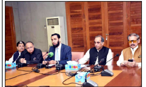
KARACHI: Mr. Attaullah Tarar, Federal Minister for Information and Broadcasting in a meeting with office-bearers of APNS.

The meeting was attended by Federal Minister for Interior Syed Mohsin Naqvi, top brass of the security agencies and the concerned high officials.