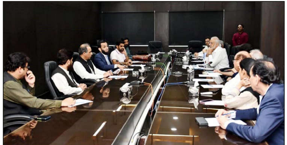
KARACHI: Mr. Attaullah Tarar, Federal Minister for Information and Broadcasting in a meeting with office-bearers of Pakistan Broadcasters Association (PBA).

Ambassador for speaking Urdu fluently and accurately. During their meeting, the CM emphasized the importance of strengthening the bilateral relations between Pakistan and Oman and suggested that the two countries should work together to enhance trade, commerce, and the welfare of the people.