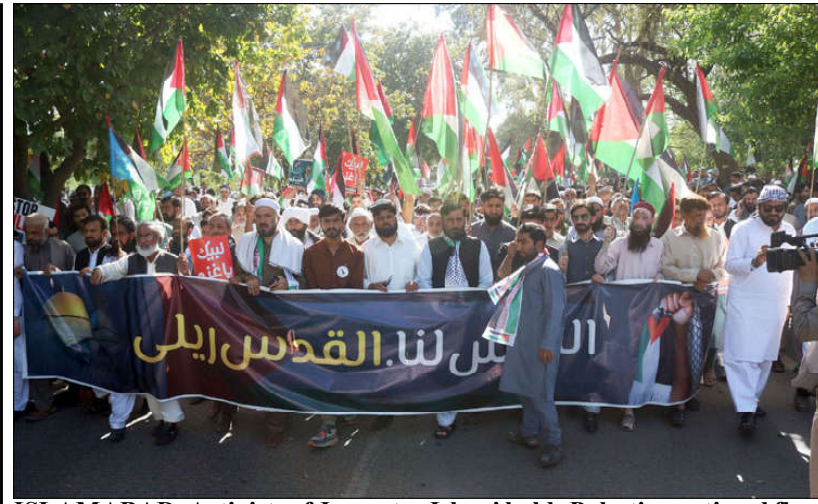
ISLAMABAD: Activists of Jamaat-e-Islami holds Palestine national flags during demonstrate to mark Al-Quds (Jerusalem) day, an annual pro-Palestinian event held on the last Friday of the Islamic holy fasting month of Ramadan, at Aabpara chowk, in the Federal Capital.