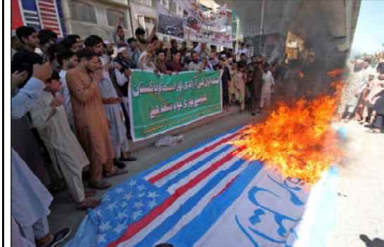
PESHAWAR: Participants are holding demonstration against USA and Israel as they are marking Youm-ul-Quds to show solidarity with people of Palestine, organized by National Ulama and Mashaikh Council outside Sunehri Mosque.

The people have elected us to serve and everyone will be given their right, the Provincial Minister said, adding, "We will use all resources to solve public problems."