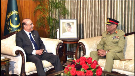
ISLAMABAD: The Chairman Joint Chiefs of Staff Committee (CJCSC), General Sahir Shamsah Mirza, called on President Asif Ali Zardari, at Aiwan-e-Sadr.

He also announced to set up similar schools in other police training centers of the province.