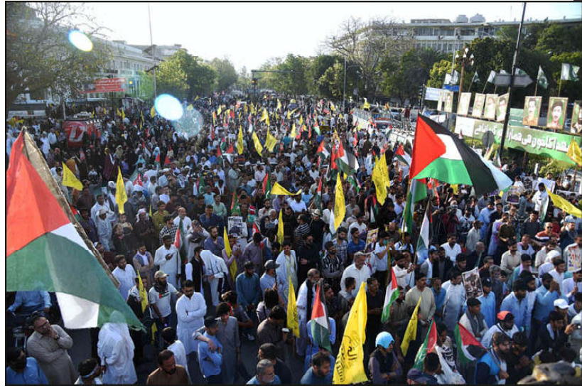
LAHORE: A large number of people participating in Al-Quds rally to express solidarity with the people of Palestine at Mall Road.