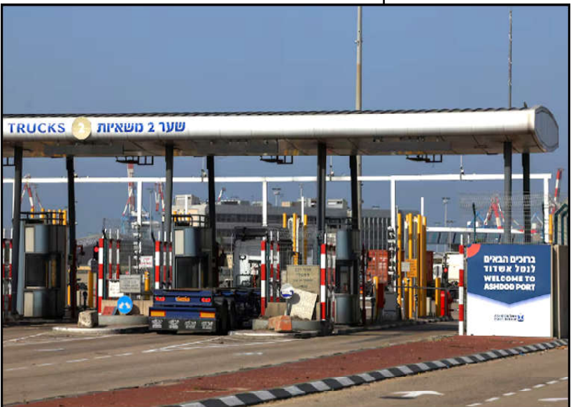
A view of Ashdod port after the Israeli cabinet approved the temporary use of the port for aid deliveries into Gaza, amid the ongoing conflict between Israel and Hamas, in Ashdod.