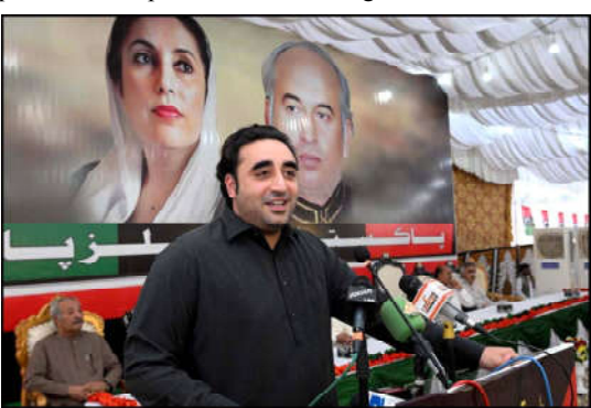
LARKANA: Chairman PPP Bilawal Bhutto Zardari addressing the Iftar organized in honor of Polling Agents, Polling Incharge and Constituency dignitaries of NA 194 Provincial Constituency PS 11 at Bhutto House Naudero.

Moreover, CTD investigators have obtained CCTV footage from the sub-divisional post office of the Satellite Town, capturing potential suspects near the letter boxes from where the letters were potentially posted to the judges. Utilizing advanced identification methods, the National Database and Registration Authority (NADRA) is actively engaged in identifying individuals featured in the footage. In light of these developments, the CTD has initiated investigations targeting individuals deemed suspicious based on the CCTV footage.