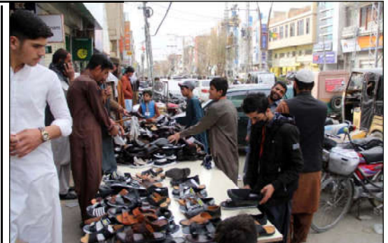
QUETTA: People are busy in Eid shopping ahead of Eid-ul-Fitar during the Holy Month of Ramadan-ul-Mubarak, at Qandhari Bazar in Quetta.

MANILA (Xinhua/APP): Higher prices of goods and services remain Filipinos' top urgent concern, according to a nationwide survey by an independent polling firm released Friday. In a survey of 1,200 adult Filipinos conducted from March 6 to 10, the pollster Pulse Asia said that 70 percent of them considered controlling inflation as their most urgent concern. "The need to control the spiraling prices of basic commodities is the only national concern (out of the 17 included in the survey) considered urgent by most adults in the country as well as across geographic areas and socio-economic classes," the survey showed. Year-on-year inflation in the Philippines rose to 3.7 percent in March due to higher food prices, including rice and meat, the Philippine Statistics Authority said on Friday. Increasing workers' pay came the second place, with 36 percent of the respondents expressing their concern. However, defending national territorial integrity and promoting peace were among the least concerns for Filipinos, with 9 percent and 8 percent.