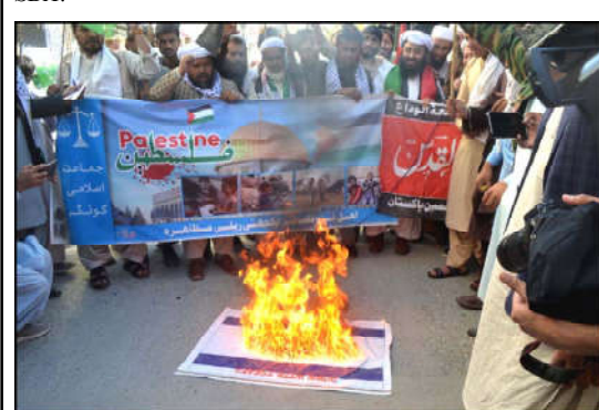
QUETTA: Participants are holding demonstration against USA and Israel as they are marking Yom-ul-Quds to show solidarity with people of Palestine, organized by Jamat-e-Islami (JI), in Quetta.

The spokeswoman of the international lender gave an overview of rounds held between Pakistan and IMF and said: "So, on March 19, IMF staff and the Pakistani authorities reached staff-level agreement on the second and final review under Pakistan's Stand-By Arrangement, SBA."