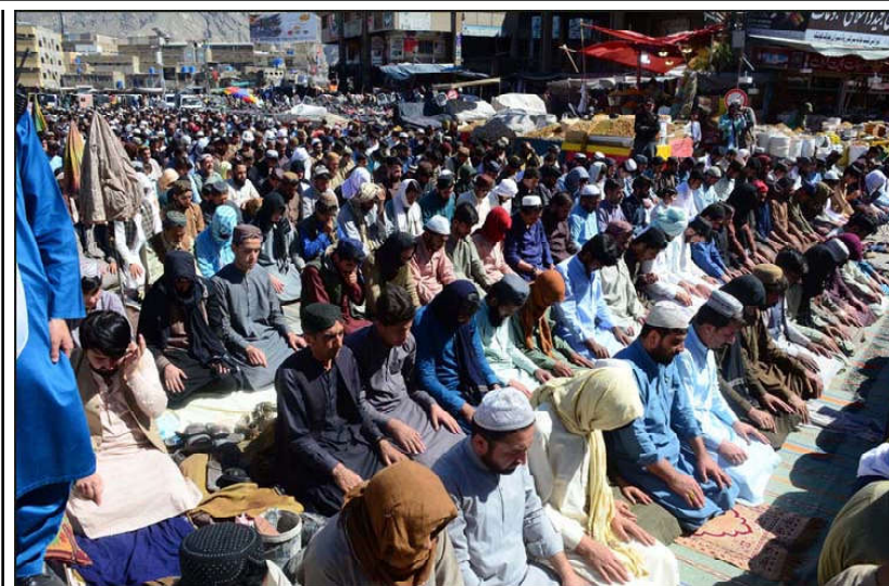
QUETTA: A large number of faithful offering Namaz-e-Jumma Tul Wida during Holy Fasting Month of Ramzanul Mubarak at Meezan Chowk.

against Palestinians. Expressing unwavering solidarity with the Palestinian people, the scholars reiterated their commitment to amplifying their voices until peace is restored in Palestine and its refugees can return to their homes. They condemned the egregious crimes committed by the Zionist government, highlighting the indiscriminate targeting of civilians, including women, children, patients, and hospitals. Amidst escalating tensions, the religious leaders urged international powers to accelerate efforts for an immediate ceasefire in Gaza, warning of the dire consequences of allowing the conflict to escalate further. They affirmed their steadfast support for the Palestinian cause, vowing not to remain silent until justice prevails and peace is achieved there.