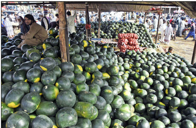
ISLAMABAD: Vendors displayed watermelons attraction for customers at fruits and vegetable market sector I-11, during the Islamic holy fasting month of Ramadan, in the Federal Capital.