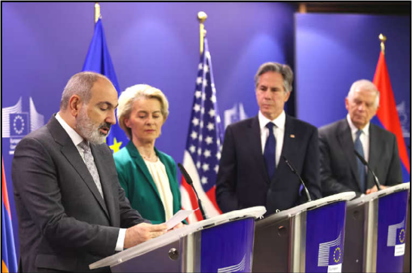
U.S. Secretary of State Antony Blinken, EU Commission President Ursula von der Leyen and European Union foreign policy chief Josep Borrell listen to Armenian Prime Minister Nikol Pashinyan in Brussels, Belgium.

Monitoring Desk WASHINGTON: For the first time in nearly two years, U.S. and Chinese defense officials met this week to discuss unsafe and aggressive ship and aircraft incidents between the two militaries in the Pacific region, restarting a dialogue that Beijing abruptly ended in a dispute involving Taiwan. The meeting, which was Tuesday through Thursday in Hawaii, came as Washington and Beijing work to expand communications between the two world powers and ease escalating tensions. Military-to-military contact had stalled in August 2022, when Beijing suspended all such communication after then-House Speaker Nancy Pelosi's visit to Taiwan, the self-governing island China claims as its own. The thaw in relations between the two countries got a kick-start last November when U.S. President Joe Biden and China's President Xi Jinping met on the sidelines of the Asia-Pacific Economic Cooperation summit in San Francisco. About a month later, Gen. CQ Brown, chairman of the Joint Chiefs of Staff, spoke with his Chinese counterpart in a video call — in the first senior military-to-military contact since the Pelosi visit. Other top-level talks have continued, including a call earlier this week between Biden and Xi, and a visit to China by Treasury Secretary Janet Yellen that began on Thursday. The resurgence of senior military leader discussions includes the relaunch of routine engagements, including the China-U.S. Military Maritime Consultative Agreement meeting.