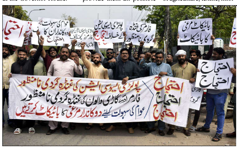
LAHORE: Chicken retailers protesting for their demands in front of the press club in the Provincial Capital.