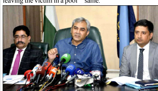
LAHORE: Federal Minister for Interior, Mohsin Raza Naqvi talking to media persons in Lahore

"At this time, all evidence is pointing towards them (India), it is inappropriate to say more before the investigation is completed but the pattern [of killings] is almost the