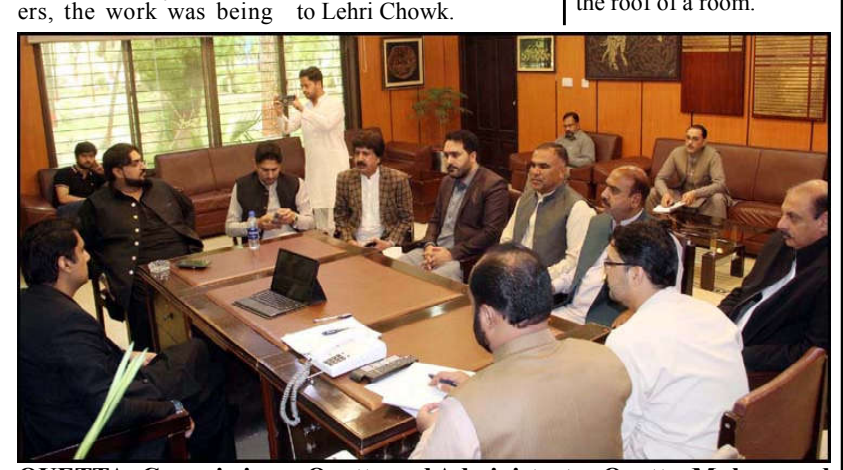
QUETTA: Commissioner Quetta and Administrator Quetta, Muhammad Hamza Shafqaat chairs a high level meeting regarding rain emergency.

PESHAWAR (APP): At least four people of the same family including women and children were killed and six others injured when roof of a room, collapsed due to heavy downpour in Shin Drang area of Bara tehsil in Khyber district on Mon-day. Rescue 1122 officials said the unfortunate incident occurred near Abaseen School in Shin Drang where the roof of a room.