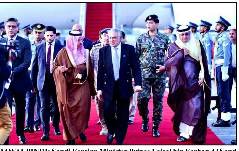
RAWALPINDI: Saudi Foreign Minister Prince Faisal bin Farhan Al Saud received by Foreign Minister Ishaq Dar upon his arrival at Nur Khan Airbase

The meeting was told that by shifting the coal-run plants from the imported fuel would not only save the precious reserves but also would make it possible to reduce power price by Rs 2 per unit for the consum-The prime minister also asked for proposals for ers.