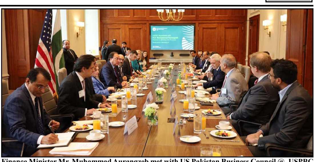
Finance Minister Mr. Muhammad Aurangzeb met with US Pakistan Business Council @ USPBC delegation in Washington D.C. Highlighted govt's commitment to improving business climate & attracting foreign & domestic investments in key sectors including agriculture, IT, mining, & energy.

The participants also expressed their commitment that they would fully cooperate with the highlevel delegation from Saudi