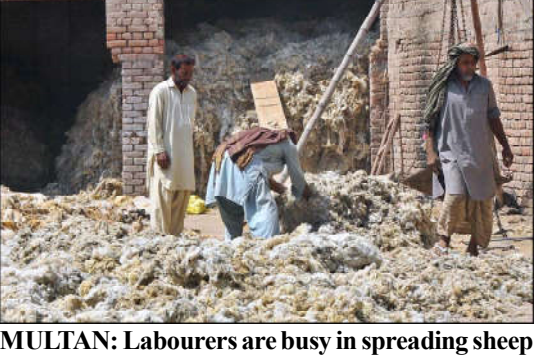
wool for drying at their workplace.

Ashrafi said the visit of Saudi Foreign Minister Faisal bin Farhan, accompanied by representatives from vital ministries and business sectors