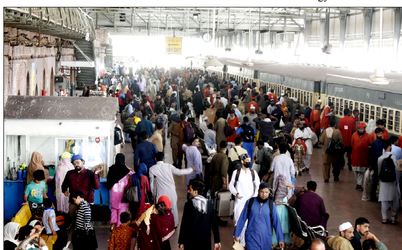
LAHORE: People carrying their luggage coming back from their home towns after spend their Eid-ul-Fitr holidays at Lahore Railway Station, in the Provincial Capital.

The delegation will include Saudi ministers for investment, water and agriculture, environment, industries, mineral resources and energy.