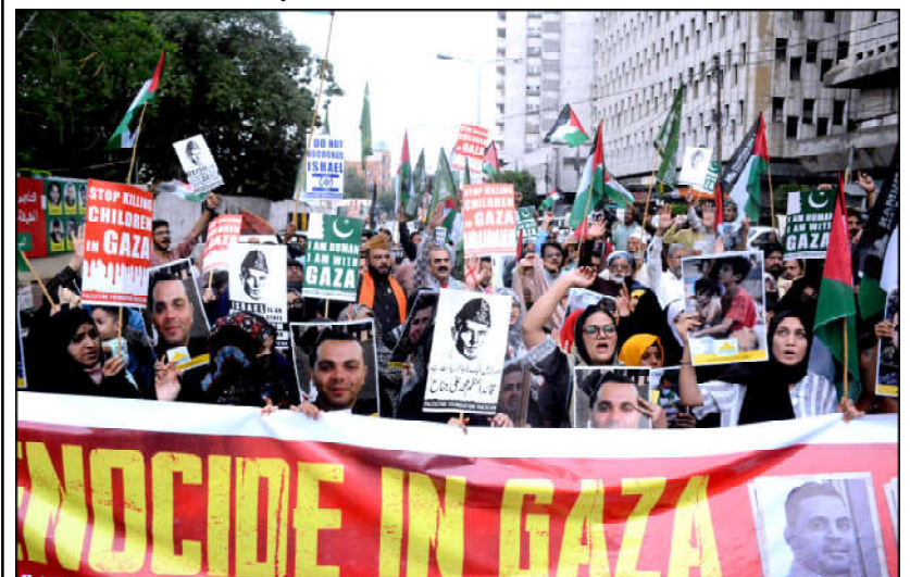
KARACHI: Palestine Foundation stages a protest demonstration against Israeli genocide in Gaza at Karachi Press Club

The Islamic Republic's mission to the United Nations said its actions were aimed at punishing "Israeli crimes", but that it now "deemed the matter concluded".