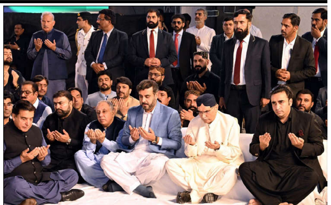
GARHI KHUDBAKHSH: President Asif Ali Zardari, Chairman PPP Bilawal Bhutto Zardari, Chief Minister Balochistan Mir Safaraz Ahmed Bugti, President PPP Balochistan Mir Changez Khan Jamali and others offering Dua on eve of death anniversary of Shaheed Zulfikar Ali Bhutto

ISLAMABAD (INP): The repatriation of Afghan nationals from Pakistan continues at a steady pace, with significant progress made as of April 13, 2024. A total of 535,940 illegal Afghans have now returned to their homeland, marking a significant step in the ongoing efforts. Over the past ten days, from April 3 to April 13, a total of 8,581 Afghan citizens have made the journey back home. Among them, 3,127 men, 1,972 women, and 3,482 children have returned. In a coordinated effort, 310 families have been safely repatriated to Afghanistan, utilizing 287 vehicles for their journey.