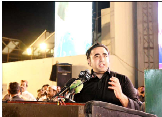
GARHI KHUDA BAKHSH: Bilawal Bhutto Zardari speaking at a public gathering in Garhi Khuda Bakhsh, Sindh on Sunday.

GARHI KHUDA BAKHSH (INP): PPP Chairman Bilawal Bhutto Zardari has said that all politicians and political parties should work on a 'Charter of National Reconciliation' to avoid fighting with each other and shun politics of foul language.