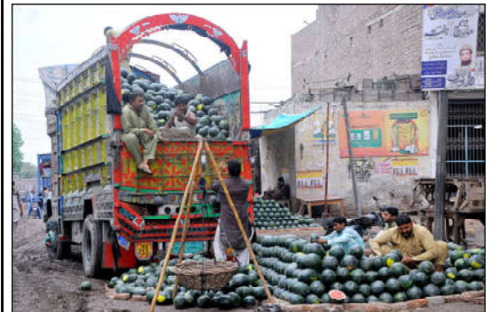
MULTAN: Labourers off-loading watermelons from a delivery truck at the fruit market.

"The Economic & Social Survey of Asia & Pacific Region termed Pakistan's economic indicators excellent. In the UN Report, Pakistan's economic progress has been predicted in the next fiscal year. The growth rate would increase from 2 per cent to 2.3 per cent during the current and next financial year in Pakistan."