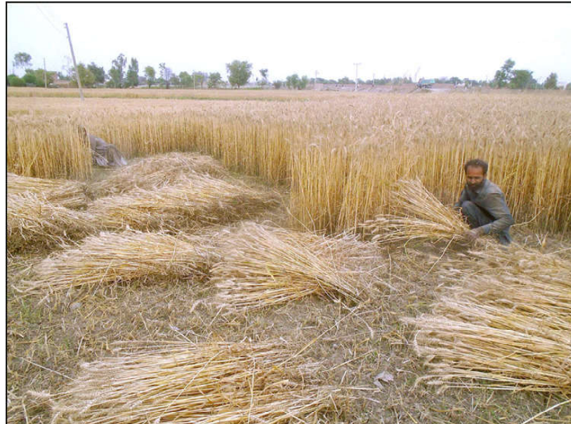
CHINIOT: Farmers harvesting wheat crop starting from 1st of Besakh Month.

The team imposed a fine of Rs 132,000 on the consumers. The SNGPL administration also vowed to continue action against the illegal consumers.