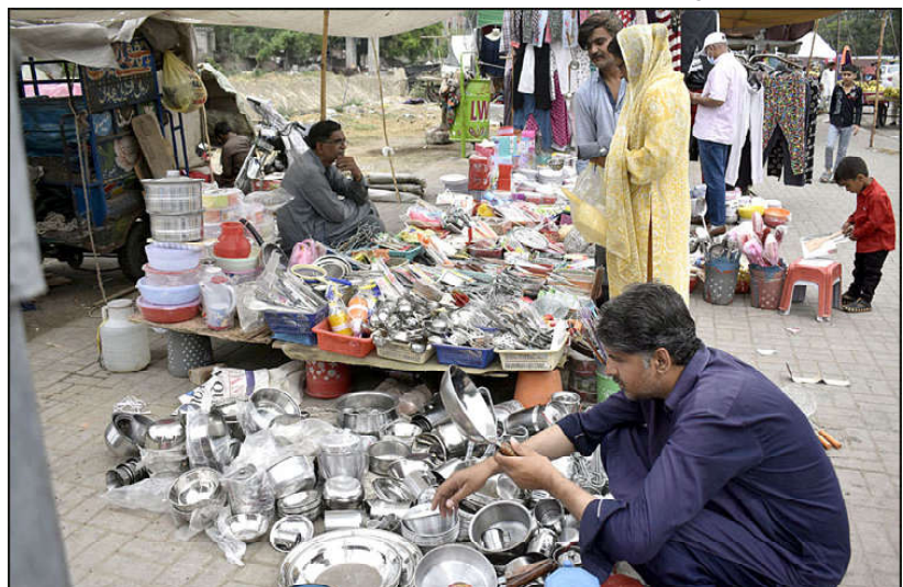
LAHORE: People are buying steel crockery in Sunday weekly bazaar at Shadman area, in the Provincial Capital.