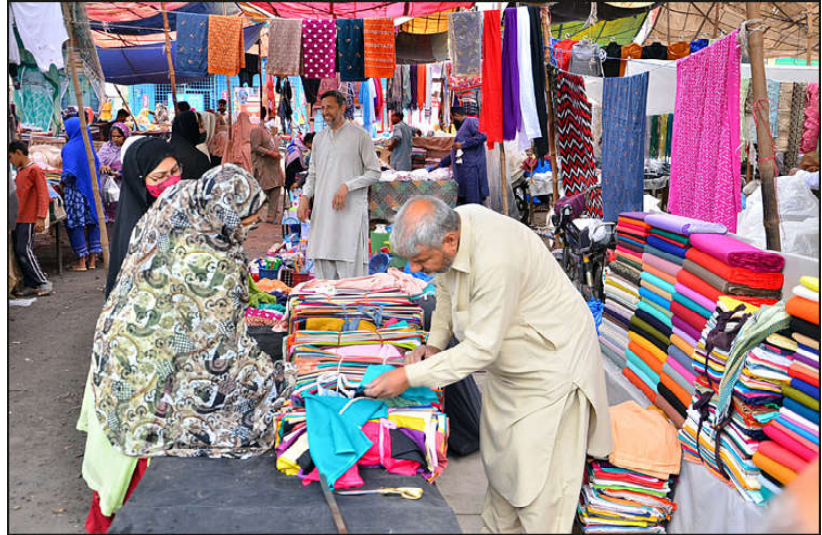
FAISALABAD: Women are buying clothes on a stall at Sunday weekly bazaar in the city.