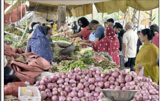
LAHORE: People are buying vegetables in Sunday weekly bazaar at Shadman area, in the Provincial Capital.

They demanded of government to pay focus on condition of car dealers and reduce prices of the cars. Different measures on part of the government could help improve business of car's sale purchase. They also called for reforms in excise and taxation department.