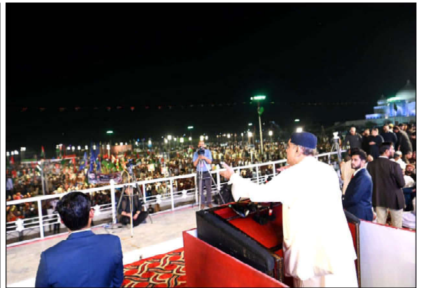
GARHI KHUDA BAKHSH: President Asif Ali Zardari addressing a gathering on the occasion of the 45th death anniversary of Zulfikar Ali Bhutto