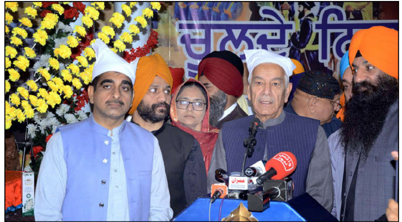
HASSANABDAL: Federal Defence Minister, Khawaja Asif Mehmood addressing the Sikh pilgrims at Gurdwara Panja Sahib on the occasion of Baisakhi Mela.

done in the era of PML-N, he added. The Deputy Chairman Senate said that the PML-N's Quaid, Nawaz Sharif gave government to the nationalist party despite getting heavy mandate in elections in 2013, which had never thought of it (government) in the dream even. He believed that there would be lot of work during next one and two years of PML-N-led government in the country. He said that PML-N has steered the country out of financial crunch, and would do so in future too.