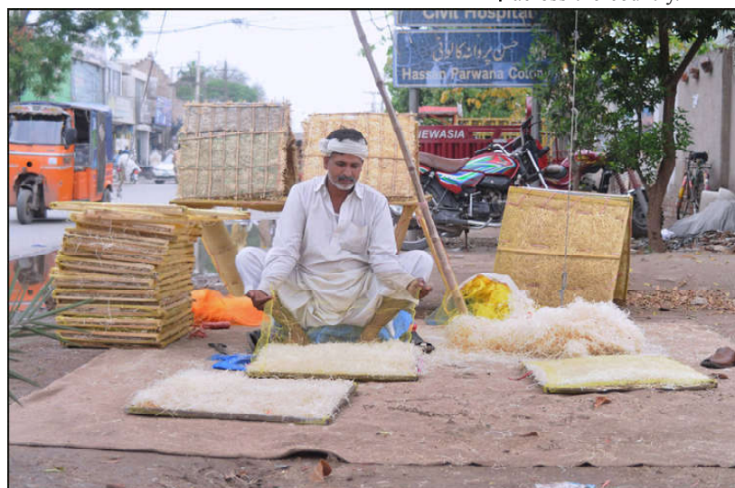
MULTAN: A worker preparing khas for the air cooler at his workplace.

The figures, released every 10 days, are based on the survey of nearly 2,000 wholesalers and distributors in 31 provincial-level regions across the country.