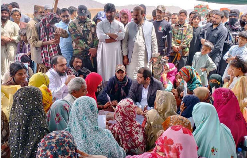
QUETTA: The administration successfully negotiated with the protestors and the protest ended on the assurance of bringing the missing persons to the scene, in Mastung.

He said that differences and disputes are no solution to any issue, and as such everyone should demonstrate patience while discharging their duties.