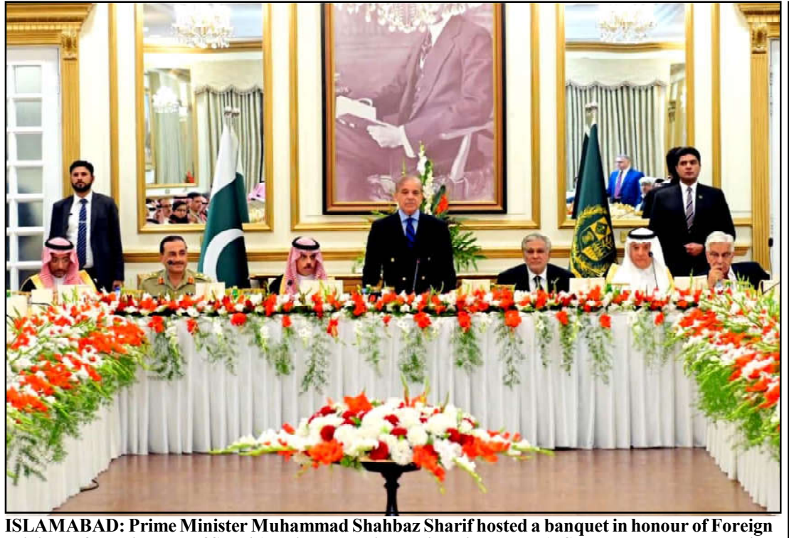
Minister of the Kingdom of Saudi Arabia H. H. Prince Faisal bin Farhan Al Saud and the accompanying

Ph: 2841470/2841473 Vol: XIX No. 296, Shawwal 08, 1445 AH Weednesday April 17, 2024, Pages 04, Price Rs. 15