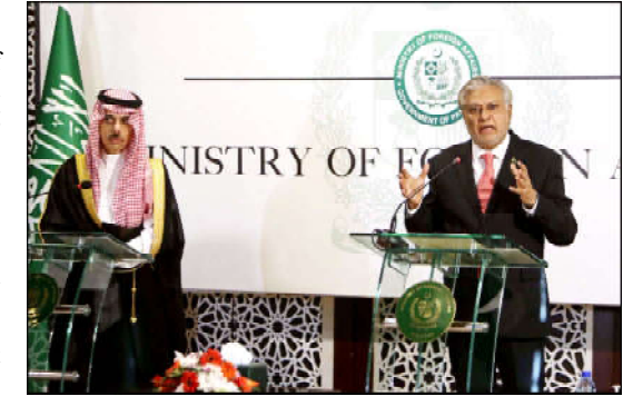
catastrophic situation in

Addressing a joint presser along with Saudi Foreign Minister Prince Faisal bin Farhan Al Saud, Foreign Minister Ishaq Dar said that Pakistan was deeply concerned over the