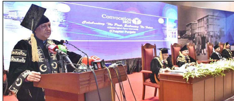
LAHORE: Federal Minister for Law and Justice Senator Azam Nazeer Tarar addressing at 37th Convocation of Allama Iqbal Open University (AIU).