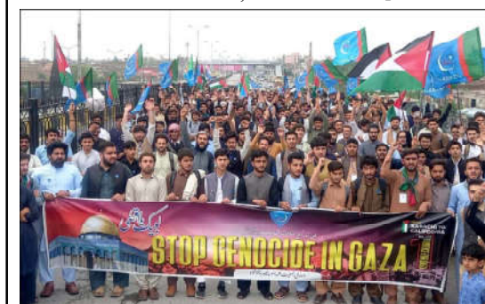
PESHAWAR: Members of Islami Jamiat Tulba are holding protest rally against Israeli cruel and inhumane acts and express unity with the innocent people of Palestine, at GT road in Peshawar.