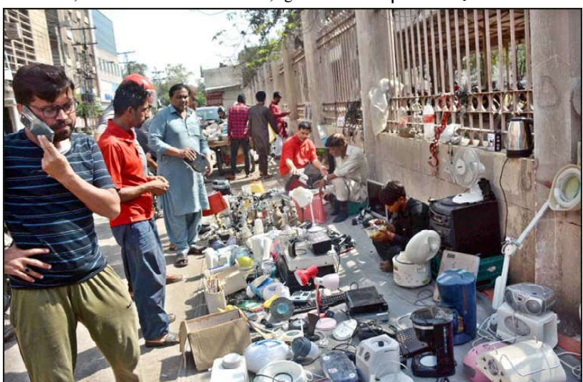
LAHORE: A vendor displaying different daily use items to attract customers at roadside setup.