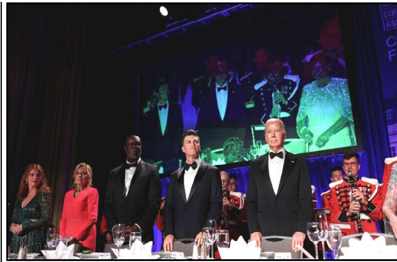
US President Joe Biden, US First Lady Jill Biden, host Colin Jost and Kelly O'Donnell attend the White House Correspondents' Association Dinner in Washington, US.

Trump's rhetoric was a danger particularly after the January 6, 2021 attack on the Capitol, and that "the stakes couldn't be higher." Comedian Jost, a long-time writer and actor with NBC's "Saturday Night Live" who is married to actress Scarlett Johansson, also in attendance, recalled fondly that his recently deceased grandfather had voted for Biden "because you are a decent man." "My grandpa voted for decency and decency is why we are all here tonight," he told the president. Biden's appearance at the banquet is in keeping with longstanding tradition for the event, in which the president and the national media gather for a roast of the US leader — an annual gala that was interrupted during the Trump administration.