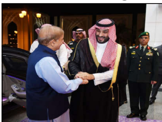
RIYADH (APP): Prime Minister Muhammad Shehbaz Sharif attended the Special Dialogue and Gala Dinner on Sunday evening hosted by Saudi Crown Prince His Royal Highness Prince Mohammed bin Salman during the ongoing Special Meeting of the World Economic Forum in Riyadh.

During the event, the prime minister exchanged views with His Royal Highness the Crown Prince.