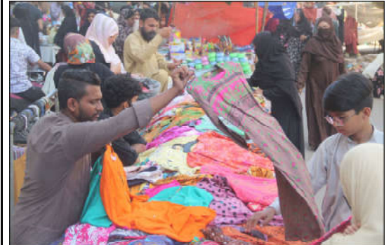
KARACHI: Citizens shopping at Bachat Bazaar in Ramsawami area of Provincial Capital.

RAWALPINDI (APP): Rawalpindi Chamber of Commerce and Industry (RCCI) President Saqib Rafiq said that there were immense opportunities in the nonconventional market sectors like gemstones and jewelry in the country which could play a vital role in enhancing foreign exchange. He remarked that industry had huge potential for value addition and profitability which needed special attention of the relevant stakeholders. The gems and jewelry sector can play a vital role in enhancing exports of the country, contributing immensely in earning of foreign exchange and providing employment to the youth, he said. He said this while speaking to the participants of the International Workshop for Technical Expert Service programme on Gems and Jewelry at Chamber House here on Sunday. Saqib noted that due to lack of interest by the marketers and traders, gems' industry was far below than the regional competitors. They are engaged in the mining, cutting, polishing and trading of gemstones, he said. The chamber's Vice President Faisal Shahzad, former Vice President Fayyaz Qureshi, Chamber members and representatives from the National Productivity Organization (NPO), Pakistan and Asian Productivity Organization (APO) from Thailand and Japan.