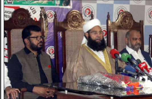
LAHORE: Pakistan Ulema Council Chairman Hafiz Muhammad Tahir Mahmood Ashrafi is addressing a press conference in the press club of the provincial capital.

The victims will not be left alone and will be given all possible support, Ali Amin Gandapur assured the bereaved families.