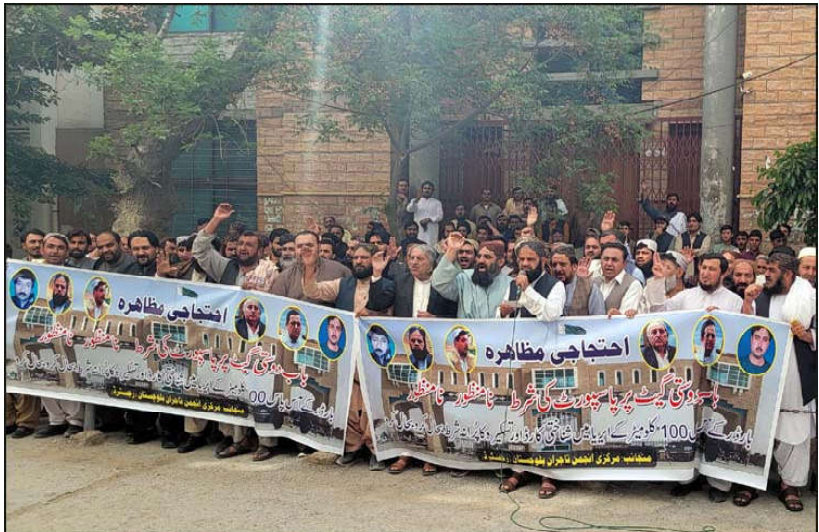
QUETTA: Members of Central Anjuman-e-Tajran Balochistan are holding protest demonstration for acceptance of their demands, at Quetta press club.