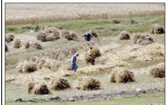
MULTAN: Farmers are busy making bundles after harvesting wheat crop in their field for drying.