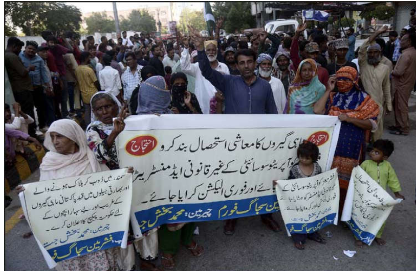
KARACHI: Members of Fishermen Sujag Forum are holding protest demonstration for acceptance of their demands, at Karachi press club.

ISLAMABAD (APP): The National Productivity Organization (NPO) is going to organize a workshop on "mastering talent acquisition: strategies for success" on Tuesday (April 30). Talent acquisition refers to the process of identifying and acquiring skilled workers to meet your organizational needs and its team is responsible for identifying, acquiring, assessing, and hiring candidates to fill open positions within a company.