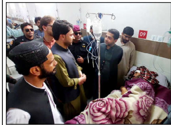
QUETTA: Home Minister Mir Ziaullah Langove inquiring about health of players injured in Kalat during his visit to Civil Hospital

Ambassador Hashmi commended the Pakistani community for its contributions to solidifying the all-weather strategic cooperative partnership between China and Pakistan.