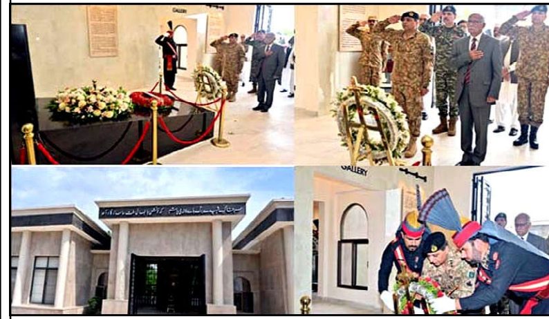
SWABI (Agencies): The Pakistan Army has successfully concluded the reconstruction and renovation work on the shrine of the revered Captain Karnal Sher Khan Shaheed in Swabi.

The meticulously executed project, undertaken by the Pakistan Army, witnessed completion within an impressive timeframe of four months.