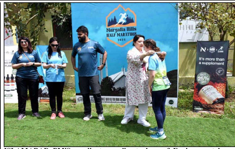
ISLAMABAD: PM'S coordinator on climate change & Environmental coordination Romina Khurshid Alam awarding medal to the winner in Margalla Hills Half Marathon, held at MHNP.