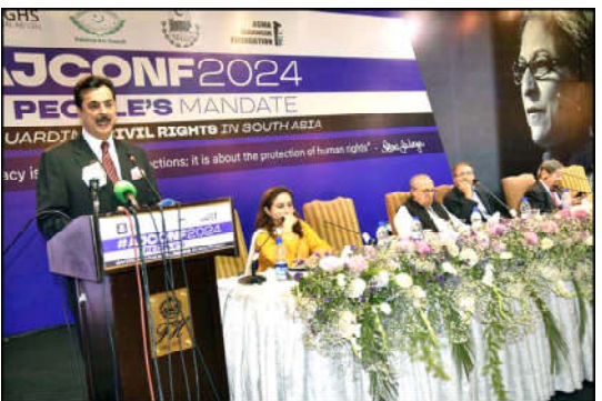
LAHORE: Chairman Senate, Syed Yusuf Raza Gillani addressing to Asma Jahangir conference.

He pledged to make Balochistan the land of peace by eliminating the terrorists.