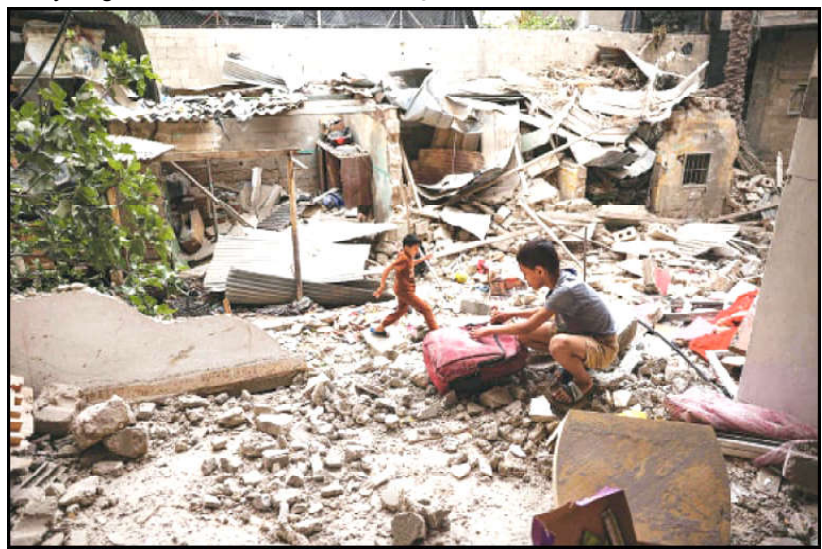
A Palestinian child salvages objects from the debris of a house destroyed by overnight Israeli bombardment in Rafah area of southern Gaza Strip.