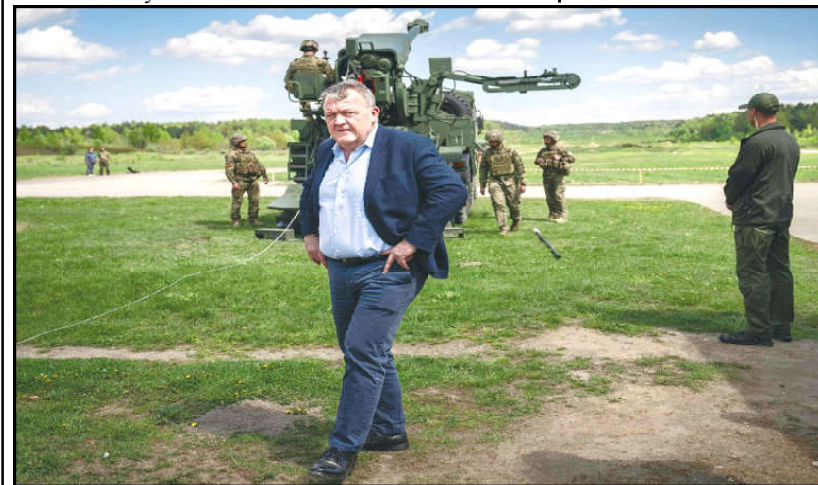
Danish Foreign Minister Lars Lokke Rasmussen attends a demonstration in Lviv of artillery systems produced in Ukraine.

Cyprus said that a ship loaded with food for Gaza — which had previously returned from Gaza after an Israeli strike killed seven aid workers — is heading back towards the territory. Earlier this month, the Jennifer returned to the Mediterranean island with around 240 tonnes of supplies that had not been unloaded after Israeli strikes.