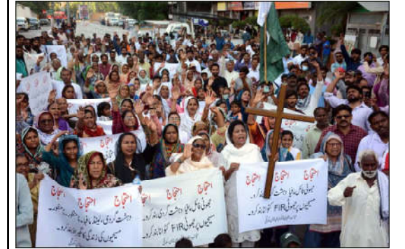
KARACHI: Residents of Mehran Town Korangi are holding protest demonstration against high handedness of land grabbers, at Karachi press club.