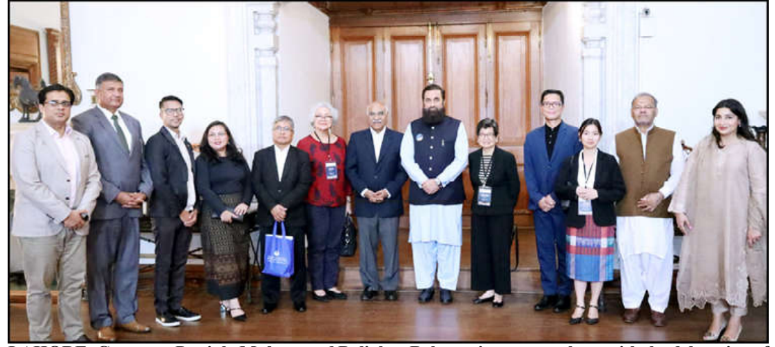
LAHORE: Governor Punjab, Muhammad Balighur Rehman in a group photo with the delegation of Ramon Magsaysay Award Foundation at Governor House.

He said that many foreign delegations meet him and tell him that got a different perception about Pakistan from media before visiting, but they found it otherwise.