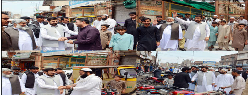
PESHAWAR: Khyber Pakhtunkhwa Governor Haji Guhulam Ali meeting with people and shopkeepers during his visit to interior city Peshawar.