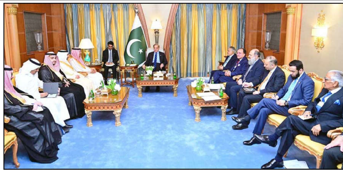
RIYADH: Saudi Minister for Finance H.E. Mohammad Al Jadaan calls on Prime Minister Muhammad Shehbaz Sharif on the sidelines of a Special Meeting of the World Economic Forum.

The prime minister also met the Saudi Minister for Industry. The Saudi minister for industry expressed keen interest for collaboration with Pakistan in the fields of agriculture, mining, information technology and other areas and informed about the progress made in this regard. The Saudi minister said he was in contact with the Saudi private companies regarding investment in Pakistan and the representatives of these companies would soon visit Pakistan.