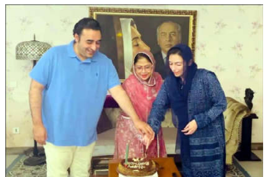
KARACHI: Peoples Party (PPP) Women Wing President, Faryal Talpur cutting her birthday cake along with Bilawal Bhutto Zardari, PPP Chairman and Aseefa Bhutto Zardari, First Lady held at Bilawal House.

stantial investments made by Pakistani-American doctors in various sectors of healthcare, Masood Khan urged for expanded investment in Pakistan, citing promising prospects in telemedicine, pharmaceuticals, and IT. He highlighted Pakistan's burgeoning IT industry, boasting 192 million mobile phone users and 135 million broadband subscribers, which has positioned the country as a cost-effective destination for IT investments. Encouraging confidence in Pakistan as a favorable investment destination, Ambassador Khan reiterated the enduring bond between the Pakistani diaspora and the United States, describing it as a resilient asset for both nations.