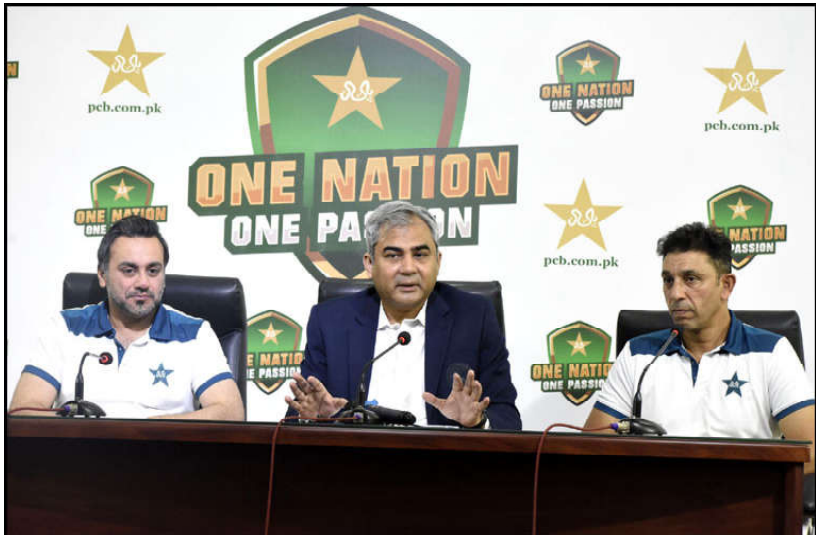
LAHORE: Chairman Pakistan Cricket Board (PCB) and Federal Interior Minister Syed Mohsin Raza Naqvi, Azhar Mahmood answering the questions of journalists in a press conference regarding the performance of the national cricket team in the recent series at the Gaddafi Stadium of the Provincial Capital.

"The PCB is unwavering in its commitment to furnish the national team with top-tier resources and facilities, fostering an environment conducive to unlocking their full potential and consistently delivering stellar performances."