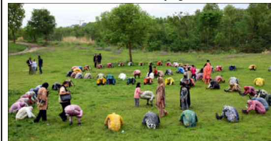
ISLAMABAD: A Sculpture Exhibition organized by Islamabad Arts Gallery, at F-9 Park in the Federal Capital.

He emphasized the importance of the vaccination and asked all residents to ensure their children receive the drops during the campaign.