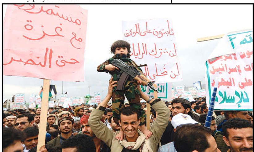
A Yemeni boy, standing on the shoulders of a demonstrator, holds a rifle during a pro-Palestinian rally in Houthi-held Sanaa.

"It's so essential to small businesses and creators; it's my full-time job," the 23-year-old Chicago resident told AFP.