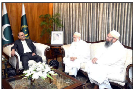
ISLAMABAD: A delegation of Dawoodi Bohra community called on President Asif Ali Zardari, at Aiwan-e-Sadr.