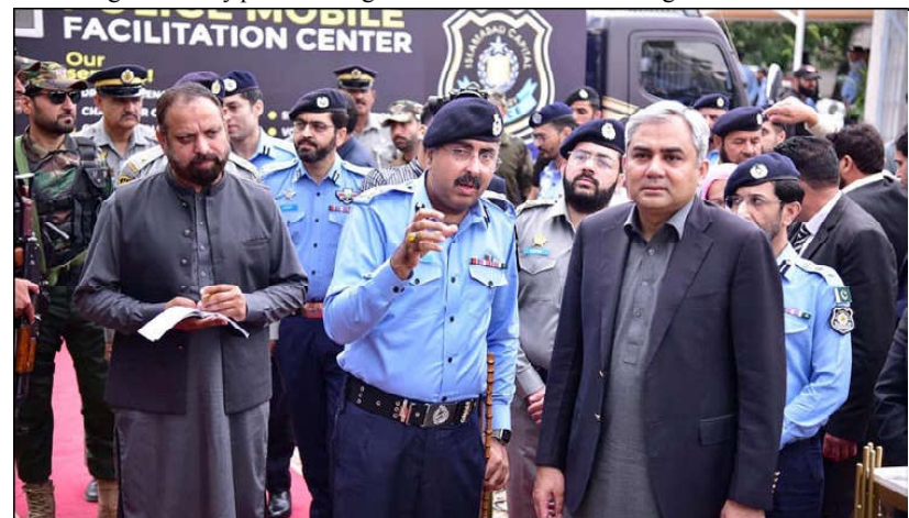
ISLAMABAD: Federal Minister for Interior Mohsin Naqvi visiting Public Facilitation Center.