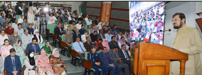
PESHAWAR: Governor Khyber Pakhtunkhwa Haji Gulam Ali addressing at the Global Conference on Health Research-2024 in Rehman Medical Institute (RMI) Hayatabad.

old rivalries on kite battles and traditional food. It provided the human soul the occasion to welcome the warmth in nature and human relationships. Lahore, Gujranwala and Kasur were once considered centers of kite flying while the preparations started months in advance as people got hold of the best 'daur' or 'manjha' (abrasive twine) and hordes of kites. The 'daur' or 'manjha' is a cotton thread coated with crushed glass materials to make it slash other twine. The kite-flying