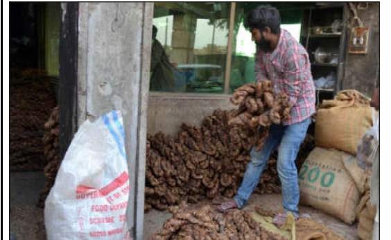
LAHORE: A vendor arranges bundles of tobacco at his shop near to attract customers at Garhi Shahu.