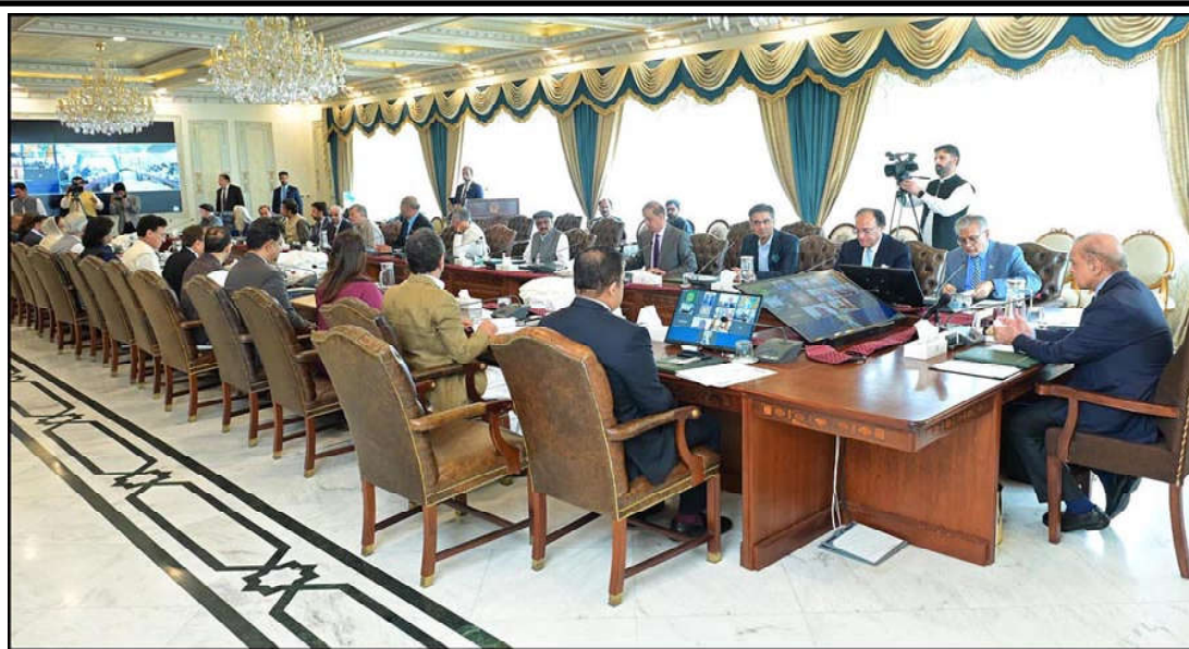
ISLAMABAD: Prime Minister Muhammad Shehbaz Sharif chairs the third meeting of Pakistan Climate Change Council.

The prime minister directed that the provinces and other stakeholders should be taken into confidence regarding the important policy draft on climate change. He said Pakistan was one of the countries badly suffered from the adverse effects of climate change. It was gravely affected by the rains in 2022 and the floods caused by them. As a servant of Pakistan, he said, he worked for the relief and rehabilitation of the flood affected and fought the case of Pakistan all across the world regarding climate change. He said Ahsan Iqbal and Sherry Rehman and all the relevant institutions and ministries took important steps to take Pakistan out of that difficult time and to build infrastructure in the country regarding climate change. He said he and the Pakistani nation were thankful to the friendly countries and the international community particularly Secretary General of the United Nations for coming to the aid of affected Pakistanis.