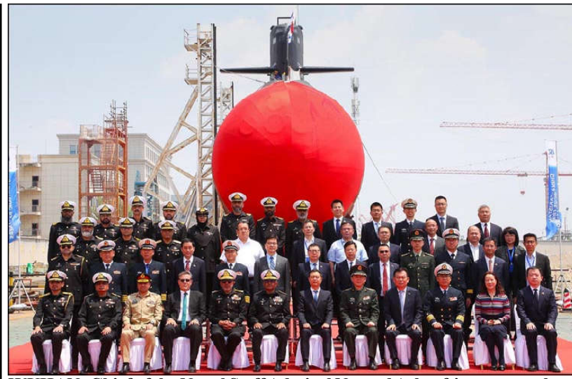
WUHAN: Chief of the Naval Staff Admiral Naveed Ashraf in a group photo with officials of Pakistan Navy and China shipyard during launching ceremony of 1st HANGOR Class submarine of Pakistan Navy at Shuangliu Base at Wuhan China.