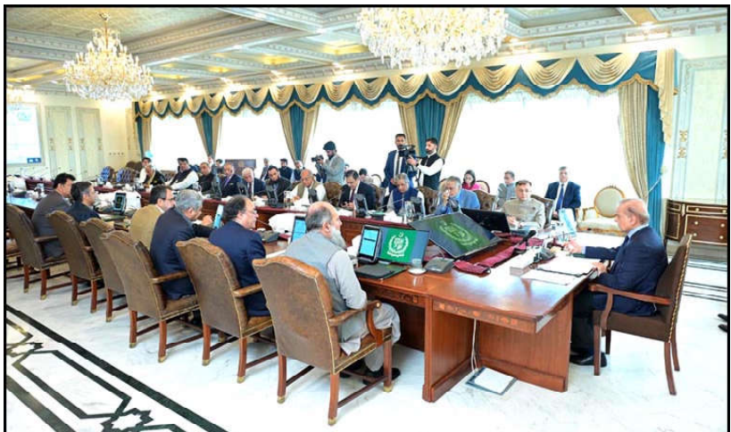
ISLAMABAD: Prime Minister Muhammad Shehbaz Sharif chairs meeting of the Federal Cabinet.

erated in Pakistan's journey of prosperity and development," he asserted. In a call to action, the army chief urged all stakeholders to unite in rejecting negative forces and distractions, and focus on Pakistan's journey of development and stability. "Let us all reject the negative forces, focus on Pakistan journey to development and stability and forge unity besides putting Pakistan on path to development, he added.