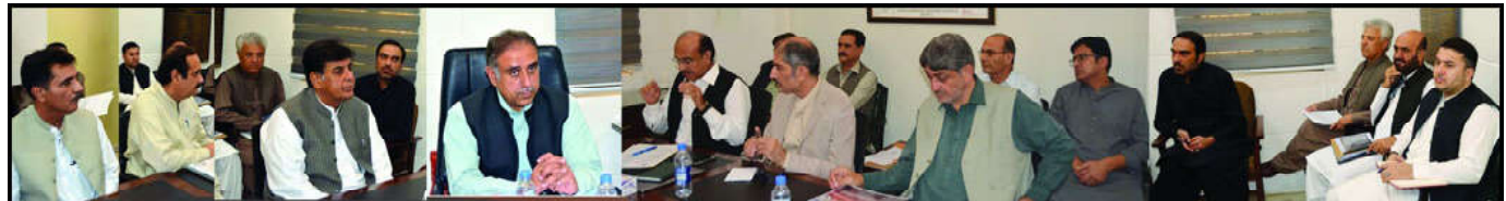
QUETTA: Provincial Minister for C&W Mir Saleem Ahmed Khosa being briefed by Secretary Qambar Dashti regarding different ongoing projects of the department