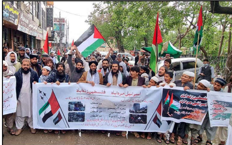
QUETTA: Members of Sunni Tehreek (PST) are holding protest demonstration against Israeli cruel and inhumane acts and express unity with the innocent people of Palestine, at Quetta press club.

The NDMA emphasized that the expected rain this week could lead to flash floods and landslides, particularly in low-lying and mountainous areas.