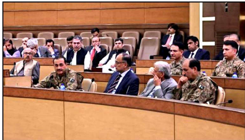
RAWALPINDI: Chief of Army Staff (COAS), General Syed Asim Munir addresses during the Green Pakistan Initiative (GPI) Conference held in Rawalpindi.