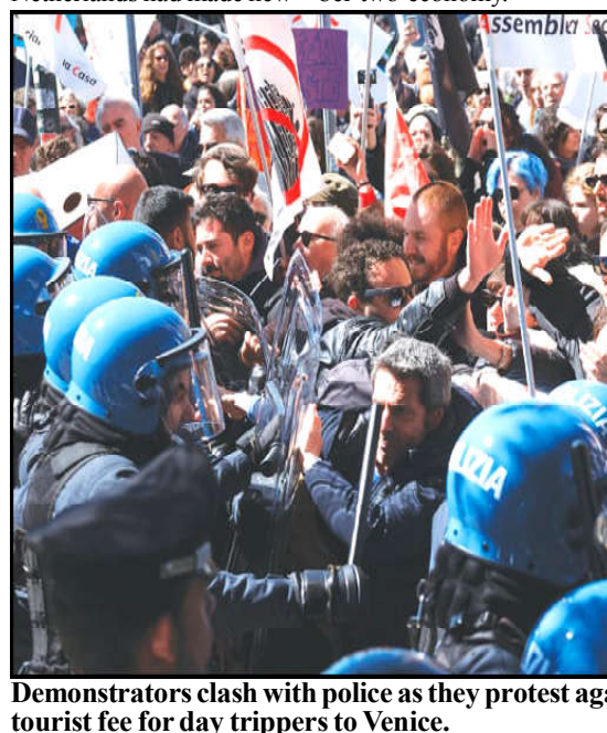
Demonstrators clash with police as they protest against the introduction of a tourist fee for day trippers to Venice.

pledges. "It is now our responsibility to turn these commitments into real deliveries of weapons and ammunition — and to do so quickly," he said.