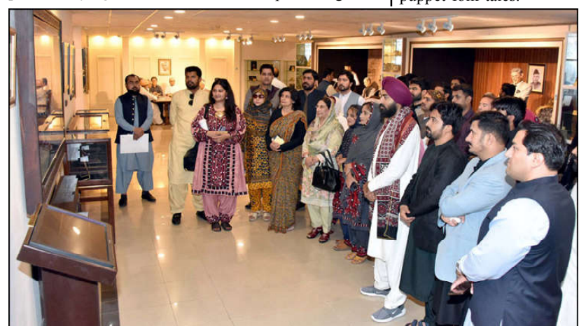
ISLAMABAD: Students of Mehergarh's youth leaders visiting Senate Museum at Parliament House.