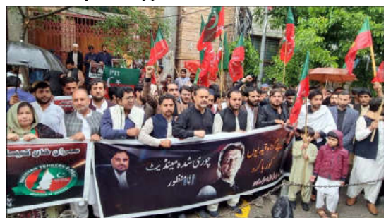
QUETTA: Activists of Tehreek-e-Insaf (PTI) are holding protest demonstration for release of Imran Khan and his wife, at Quetta press club.

ISLAMABAD (APP): The Senate today commenced discussion on the Presidential address to the Joint Sitting of the Parliament. Opening the discussion, Pakistan People's Party Senator Sherry Rehman said President Asif Ali Zardari's invitation for political reconciliation should be welcomed. She said there is a need to do away with the politics of confrontation and turn a new page in politics in order to steer the country out of challenges. Senator Khalil Tahir said consensus should be built on important national issues. He said the politics of anarchy and chaos must come to an end. He said the focus should be on improving economy. Senator Ali Zafar said the treasury and opposition benches should work together on legislation. He said there should be detailed discussion on any issue, tabled for legislation, before its passage by the House. Jam Saifullah Khan paid tributes to the sacrifices of security forces in the war on terrorism. Senator Irfan ul Haque Siddiqui said the opposition should sit with the government to take the country forward on the path of economic development. He said reconciliation cannot be achieved single handedly, but it requires the participation of both sides. Irfan Siddiqui said it is the right of opposition to pinpoint the shortcomings of the government but it should be done in accordance with democratic norms.