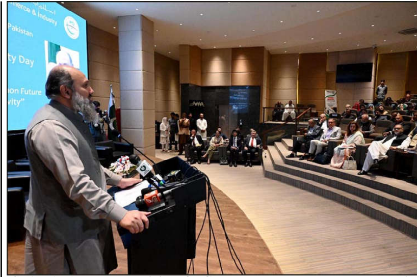
ISLAMABAD: Federal Minister for Commerce, Jam Kamal Khan addressing on the occasion of "World IP Day Seminar 2024" organized by IPO-Pakistan in collaboration with Islamabad Chamber of Commerce & Industry at Islamabad Chamber of Commerce (ICCI).

to advancing policies that strengthen the IP ecosystem, particularly in relation to sustainable development. The government was also intended to invest in capacity-building initiatives to enhance awareness and understanding of IP Rights among entrepreneurs, researchers and innovators for enabling them to leverage IP effectively for sustainable development, he added. He said that the country was passing through challenging time and stressed the need for bringing more innovation to enhance the competitiveness of local products to capture international markets and to enhance exports from the country. The minister lauded IPO-Pakistan and the Islamabad Chamber of Commerce and Industry for the commemoration of this important day and expressed the commitment to promote IP Rights and raising awareness.