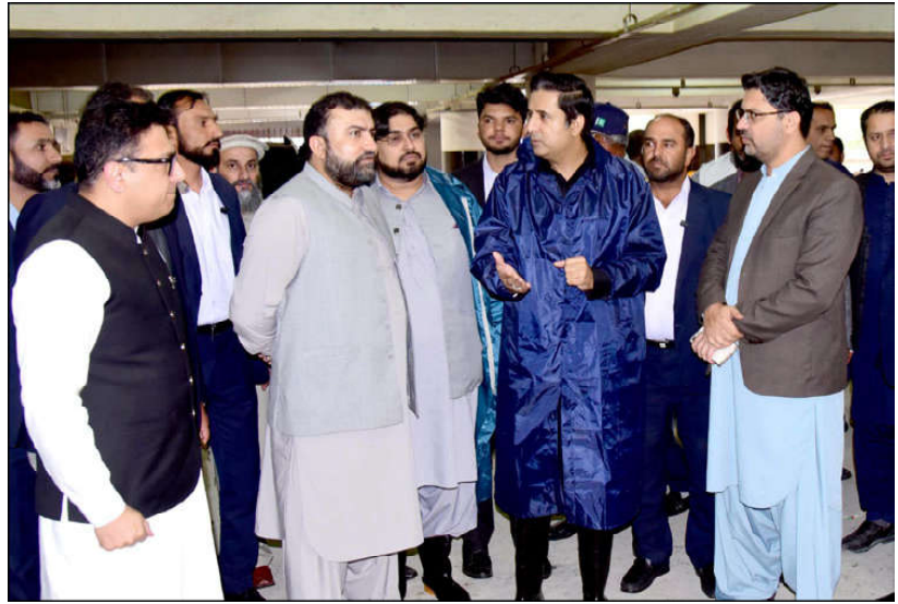
QUETTA: Chief Minister Balochistan Mir Safaraz Ahmed Bugti being briefed by Commissioner Quetta Division Hamza Shafiqat regarding Circular Road Parking Plaza