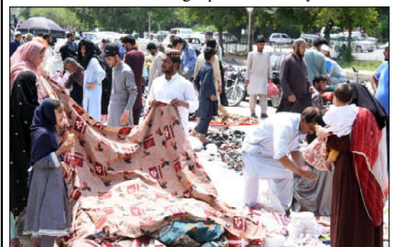
KARACHI: Activists of (PTI) are holding protest demonstration for release of Imran Khan and his wife Bushra Bibi, at Karachi press club.

Industries released by the Pakistan Bureau of Statistics. During the period under review, 32,211 tractors were locally assembled as against the assembling of 19,108 tractors of the same period of last year. However, the manufacturing of heavy machinery in the country during the period under review went down by 53.11 per cent as about 113 units of heavy machinery were locally assembled as against the 241 units assembled in the same period of last year.