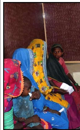
SUJAWAL: Doctors examine patient at free medical camp establish by Pakistan Navy at Jangu Jalbani, District Sujawal, Sindh.

The meeting of the cabinet was held at the PM House under the chairmanship of Prime Minister Muhammad Shehbaz Sharif. The cabinet directed to ensure transparency in the privatization of PIA. Meanwhile, the Secretary Aviation, briefing on the recent measures taken to improve the facilities at Pakistan's airports, particularly Lahore and Karachi, informed that the service counters at the airports had been increased and further improvement of the facilities was in progress. On the recommendation of the Ministry of Law and Justice, the federal cabinet approved the establishment of an additional special court in Makran Division to deal with anti-narcotics cases in Balochistan province. The jurisdiction of this special court will extend to the districts of Panjur, Kech, Gwadar, Hub and