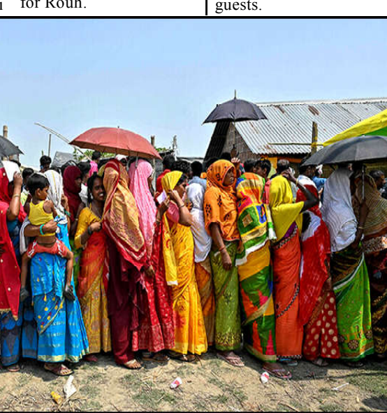
Voters stand in a queue to cast their ballot outside a polling station during the second phase of voting for the India's general election at Gashbari village in Darrang district of Assam state.

Monitoring Desk ROME: Pope Francis will attend this year's Group of Seven (G7) leaders' summit to discuss the challenges posed by Artificial Intelligence (AI), Italian Prime Minister Giorgia Meloni said on Friday.