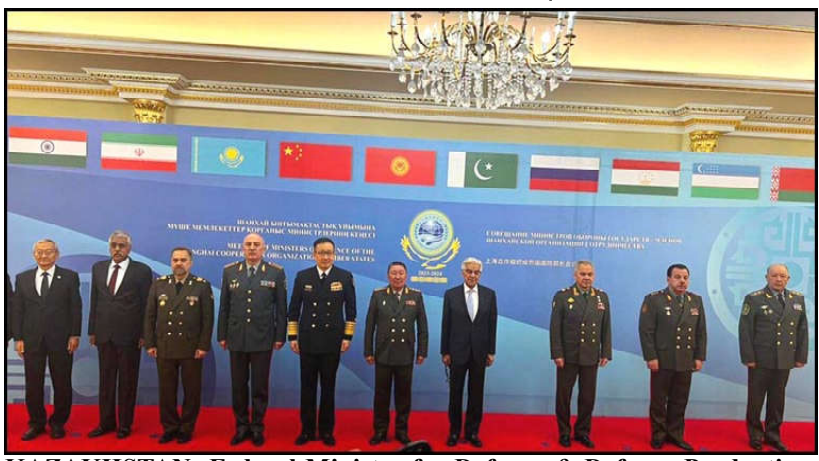
KAZAKHSTAN: Federal Minister for Defence & Defence Production, Khawaja Muhammad Asif in a group photo with Defence Ministers of member states of the Shanghai Cooperation Organization (SCO).

KARACHI (INP): The Karachi administration on Friday denied permission to Pakistan Tehreek-e-Insaf (PTI) to hold a power show at Karachi's Bagh-e-Jinnah on April 28 sources said Friday. According to sources, the police report stated that the permission to hold a public gathering was denied, in light of potential security threats and the recent surge in terrorist activities in the city. In a report to District Commissioner, the Police urged against giving permission to PTI to hold a public gathering as there are threats of a possible terrorist attack in the port city. It is important to mention here that today the Sindh High Court will hear the PTI plea seeking permission to hold power show in Karachi's Bagh-e-Jinnah.