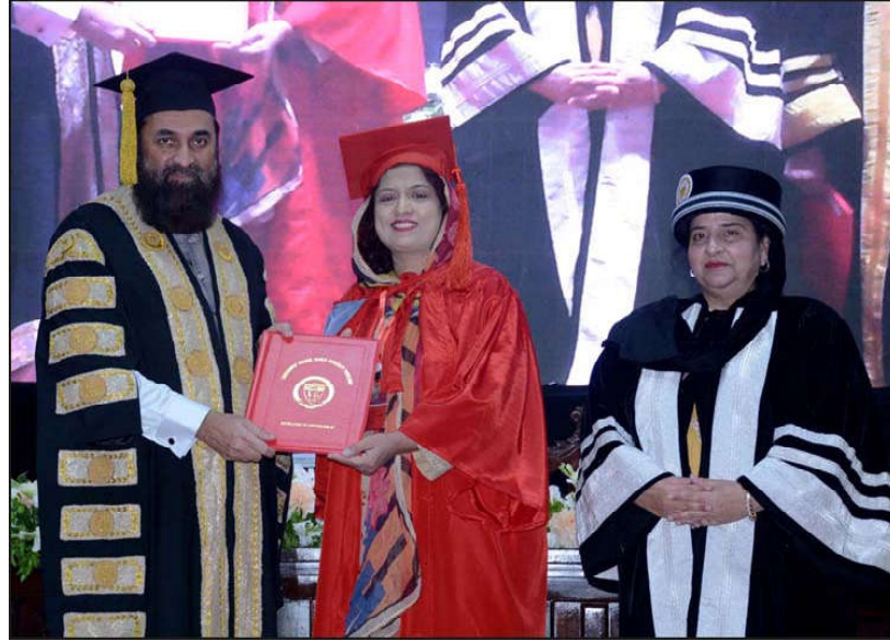
FAISALABAD: Governor of Punjab, Muhammad Balaigh Ur Rehman awarding degrees among the successful students during the 4th Convocation of Government College Women University Faisalabad (GCWUF).

education system) to facilitate children of police employees in best quality education in schools and colleges and preparation of various academic tests such as MDCAT and others, under which the children of police officers will be able to complete their educational journey in the best educational institutions without any problem. He said that according to the MoU, children of police force will get special discounts in schools, colleges, evening coaching, test preparation, key academy and various tests such as MDCAT, etc. Children of police martyrs will get free admission, 100pc discount in education expenses, 50pc discount in admission, and monthly tuition fees for children of serving and deceased employees.