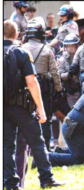
AUSTIN: Law enforcement personnel detain a pro-Palestinian protester at the University of Texas in Austin.

Wang also warned that the question of self-ruled Taiwan was the "first red line" that must not be crossed in China-US relations. Blinken described his talks with Wang at the Diaoyutai state guesthouse — which lasted more than five and a half hours — as "extensive and constructive". The top US diplomat will speak to journalists later on Friday at the US embassy in Beijing.