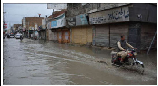
QUETTA: A view of accumulated rain water.

QUETTA (APP): Balochistan Minister for Livestock and Dairy Development Bakht Muhammad Kakar on Friday ordered to ensure maximum facilities to the livestock sector including provision of treatment of animals. In a statement issued here, he said free veterinary camps will be organized in different areas of Balochistan to provide vaccination, medicines to the livestock owners to protect the animals from infectious and non-infectious diseases. Bakht said besides meeting the country's food requirements, valuable foreign exchange can be earned by exporting surplus milk, meat and other products made from it. He said that livestock farmers are providing all possible facilities to achieve the best production of milk and meat and boost its production. He said a special advisory campaign has also been launched for livestock farmers so that they can benefit from the advice of veterinary doctors, livestock experts and contribute to economic development and financial stability, including increasing of meat and milk production. Kakar said besides meeting the country's food requirements, valuable foreign exchange can be earned by exporting surplus milk, meat and other products made from it.