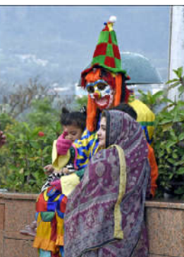
ISLAMABAD: People are taking picture with joker at Pakistan Monument during pleasant weather, in the Federal Capital.

ISLAMABAD (APP): Indus River System Authority (IRSA) on Friday released 113,600 cusecs water from various rim stations with inflow of 178,100 cusecs. According to the data released by IRSA, water level in River Indus at Tarbela Dam was 1448.73 feet and was 34.73 feet higher than its dead level of 1,398 feet. Water inflow and outflow in the dam was recorded as 30,800 cusecs and 5,000 cusecs respectively.