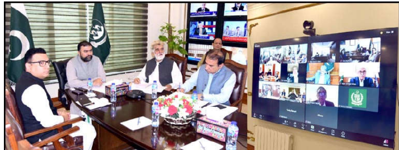
QUETTA: Chief Minister Balochistan Mir Sarfraz Ahmed Bugti attending a meeting through video link presided over by Prime Minister Shehbaz Sharif regarding climate change.