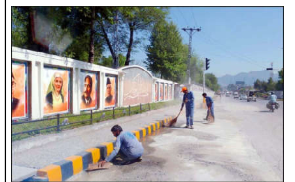
ABBOTTABAD: Workers of Water and Sanitation Services Company Abbottabad (WSSCA) are cleaning and collecting solid waste during cleaning drive campaign at the Main KKH road in Abbottabad.

to compile ideas and suggestions regarding land identification and sought a report within two week time. He said that construction of plazas, shops and parks on the commercial land would play a vital role in revenue generation for WWB. On the occasion, the minister was briefed about vocational, technical and general educational institutions working under WWB.