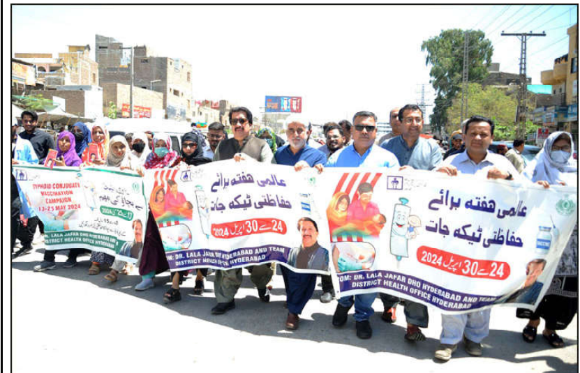
HYDERABAD: Doctors, paramedics and vaccinators hold banners, placards and pamphlets during an awareness walk on World Immunization week and World Malaria Day in the city.

The analysis showed that 755 drivers, 49 underage drivers, 166 pedestrians and 406 passengers were among the victims of road crashes. The statistics show that 294 accidents were reported in Lahore, which affected 3,603 people, placing the provincial capital at top of the list, followed by 101 accidents in Faisalabad with 104 victims, and at third Multan with 78 accidents and 77 victims.