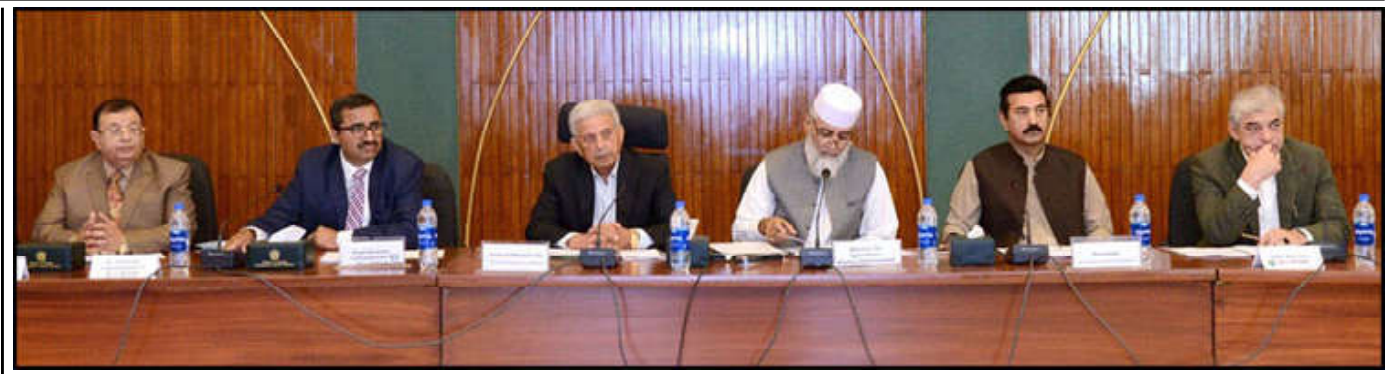
ISLAMABAD: High-powered Federal Committee on Agriculture (FCA) mandated to oversee strategic measures for ensuring food security in the country, held its meeting under the Chairmanship of Rana Tanveer Hussain, Federal Minister for National Food Security & Research.

The maize target was fixed at 9.3 million tons of production over 1.5 million hectares of land. The Committee also fixed the production target of sugarcane for 2024-25 at 76.7 million tons over an area of 1.3 million hectares. The targets for other crops such as mung, mash, and chilies were also fixed in the meeting of the high-powered committee. Pondering over the availability of agricultural inputs for Kharif crops (2024), the water availability in canals head will remain 63.61 million acres feet (MAF) as against last year, which was 61.85 MAF. At present, all the provinces are getting satisfactory supplies in the system, it was informed. The meteorological department informed us that during April to June 2024, normal to slightly above-normal precipitation is expected in most parts of the country, particularly in upper Punjab, during the season May to July 2024.