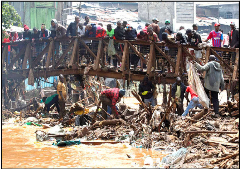
Residents sift through the rubble as they recover their belongings after the Nairobi river burst its banks and destroyed their homes within the Mathare Valley settlement in Nairobi, Kenya.

vest TikTok’s US assets or face a ban. “The facts and the Constitution are on our side and we expect to prevail again.” Biden’s signing sets a Jan. 19 deadline for a sale — one day before his term is set to expire — but he could extend the deadline by three months if he determines ByteDance is making progress. Biden is seeking a second term against former President Donald Trump. “We don’t want to see a ban,” White House spokeswoman Karine Jean-Pierre said on Tuesday.