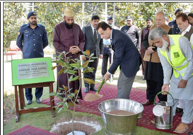
ISLAMABAD: Speaker National Assembly Sardar Ayaz Sadiq planting a sapling of Magnolia Grandiflora in front of Parliament House.

and Coordination through Common Management Unit Malaria, National and international partners, provincial counterparts, NGOs and private stakeholders had significantly enhanced the free malaria testing and treatment facilities in the malaria endemic districts across the country. He said that as the government strived to provide equitable health services to the citizens, the role of the private sector and the global partners was appreciable. He called upon all partners, organizations, healthcare professionals, and individuals to unite in their efforts to end malaria. "We must work collaboratively to strengthen healthcare systems, increase access to quality diagnosis and treatment, and raise awareness about the importance of prevention and controlling measures of malaria," the prime minister added.