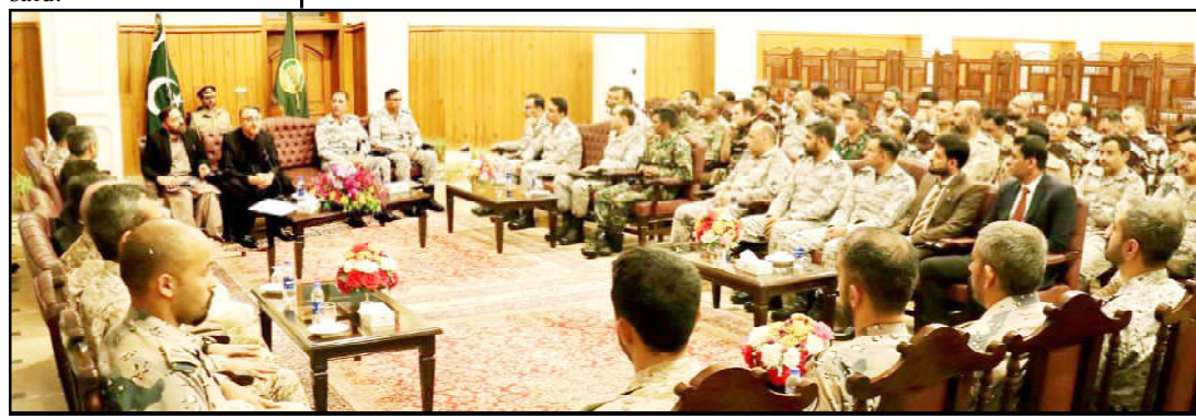
QUETTA: Governor Balochistan Malik Abdul Wali Khan Kakar talking with under trainee officers of Pakistan Navy

"Locals of the area appreciated the operation. The sanitization operation is being carried out to eliminate terrorists, if any, found in the area as security forces are determined to wipe out the menace of terrorism from the country," the ISPR said.