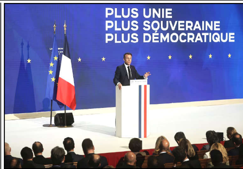
French President Emmanuel Macron delivers a speech on Europe in the amphitheatre of the Sorbonne University in Paris, France.

torrential rains triggered floods that caused chaos across the city, blocking roads and bridges and engulfing homes in slum districts. Kenyans have been warned to stay on alert, with the forecast for more heavy rains across the country, while officials said people living in the most vulnerable areas would be relocated. “The government will do whatever it takes, apply all the required resources in terms of money and personnel to make sure that lives are not lost and the people of Kenya are protected from this disaster,” Deputy President Rigathi Gachagua told a press briefing. Meanwhile, the UN humanitarian response agency OCHA said in an update this week that in Somalia, the Gu (April to June) rains are intensifying with flash floods reported since April 19.