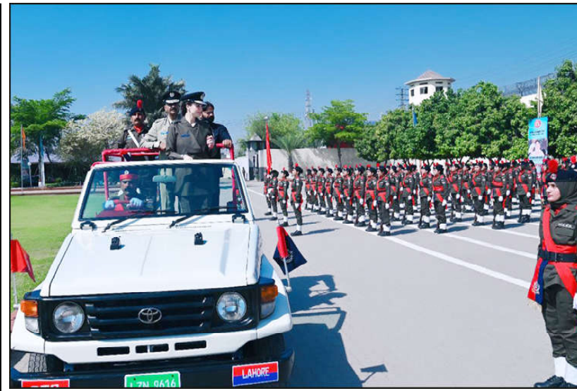
LAHORE: Punjab Chief Minister Maryam Nawaz Sharif wearing Police uniform inspecting parade of lady constable and Traffic Assistant at Police Training College Chung.

will come when the number of lady police will surpass 50 per cent." The chief minister said, "After wearing the police uniform for the first time, I have realised that being a police officer or being sworn in as a CM is a very responsible job." She added, "In the Chief Minister's office, we take decisions, and you get them implemented, you have a heavy responsibility." She explained, "Women are soft-hearted and quick to forgive, but lady police constables! you have to do justice only. All your sympathies should be with the oppressed; there should be no place in your hearts for the oppressors. The oppressor must be punished."