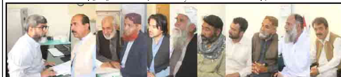
QUETTA: DGNAB (Balochistan) listening complainants during open kutchery at NAB's Complaint Office in DC office

Sealed tenders are invited from reputable firms / authorized dealers for Up-gradation of Training Facilities/ Sports/ Accommodation of Foreign Trainees at Command and Staff College Quetta. Detail is as under:- Ser Description Qty A/U 1 Renovation works at OFCs Street Front (Incl fountains, Landscaping & Tiling) 6000 Sqft 2 Renovation of OFCs Parking Swings 12 Nos. 3 Landscaping, Weather shield, Duster and Uplift of OFCs Park 6800 Sqft 4 Uplift of OFCs Cell Clerks Offices 1 Job Quotations are required to reach this office till 0900 hours on 10 May 2024. This tender will be opened at 1000 hours on same day. The price should be inclusive of income tax, sales tax and any other taxes and should be valid for FY 2023/24. For more information visit (www.cscquetta.gov.pk). The authority of accepting / rejecting the bids lies with the issuing authority. TERMS AND CONDITIONS Note:- The firm must be GST & NTN registered. Incase of exemption, proof should accompany the quotation. R.I. No. 121748 Lieutenant Colonel General Staff Officer Projects, (Grade-I) Command and Staff College Quetta Telephone: 081-9201194