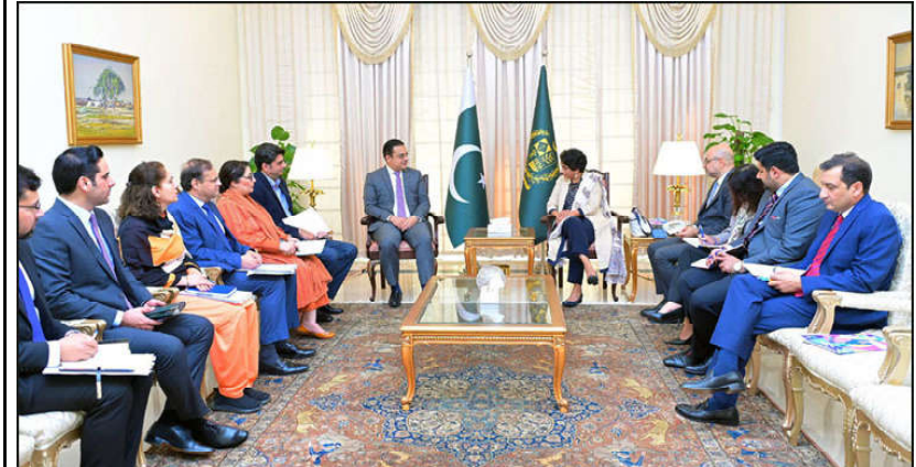
ISLAMABAD: Ms. Kanni Wignaraja, United Nations Assistant Secretary General (ASG), Asia, and the Pacific calls on Federal Minister for Economic Affairs Ahad Khan Cheema.

KARACHI (APP): Shipping activity was reported at the port where nine ships namely, San Francisco, Atlantic Ibis, Marathapolis, MSC Sindy, Sea Pearl, Aisa Liberty, Hansa Oslo, Bateleur and Limra carrying Container, Fertilizer, Palm oil, Gas oil and LPG, berthed at Container Terminal, Grain Terminal, Liquid Terminal, Oil Terminal, Engro Terminal and Gas Terminal respectively during last. Meanwhile another ship 'Haj Muhammad' scheduled to load/offload Cement also arrived at outer-anchorage of the Port Qasim.