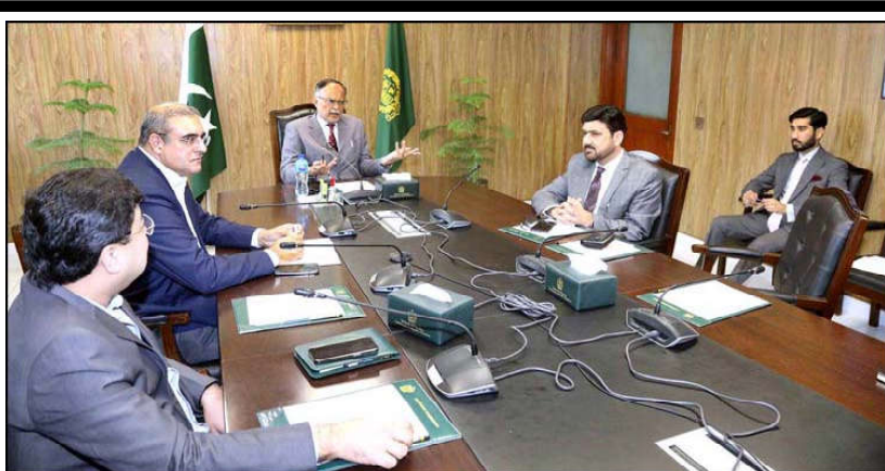
ISLAMABAD: Federal Minister for Planning Development & Special Initiatives, Professor Ahsan Iqbal chairs a meeting to review progress over CPEC Joint Group Works and upcoming 13 JCC.