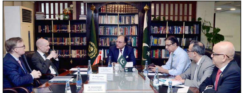
ISLAMABAD: Federal Minister for Finance and Revenue Senator Muhammad Aurangzeb in a meeting with Keith Svendsen, CEO of APM Terminals, accompanied by Ambassador, Ambassador Jakob Linulf.

"This indicates that the debt-to-GDP ratio is significant, but the sustainability of fiscal finances also sends a critical signal to the market, impacting interest rates." During the lecture, Gutierrez imparted critical insights on sustainable fiscal policies across the globe.