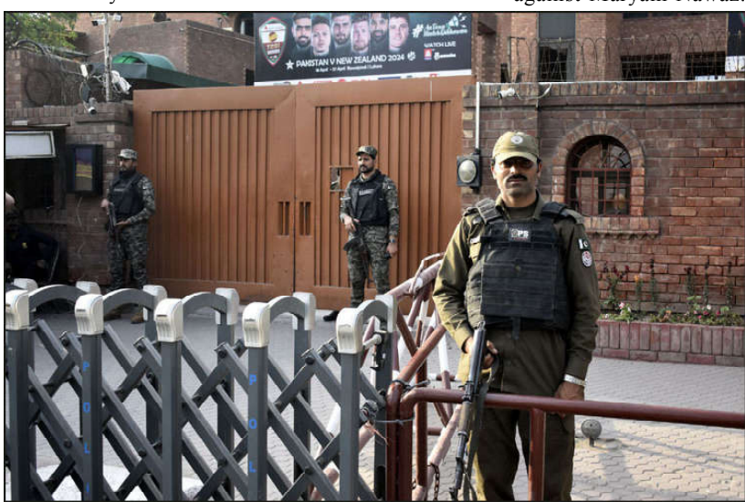
LAHORE: Police and Pakistan Rangers personnel are on alert to deal with any untoward incident outside the Gaddafi Stadium of the provincial government on the occasion of the fourth T20 cricket series match between Pakistan and New Zealand.

The encounters occurred in various parts of the city, where law enforcement officers confronted armed criminals. During the said encounters, illegal weapons, ammunition, and two motorcycles believed to have been used in various criminal incidents were confiscated from the arrested individuals.