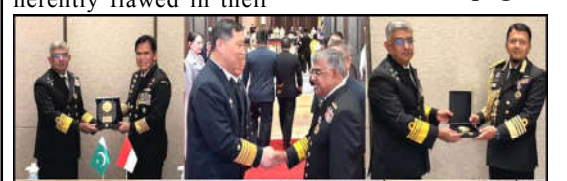
Chief of the Naval Staff Admiral Naveed Ashraf interacting with Naval Heads of various Navies during 19th Western Pacific Naval Symposium in Qingdao China.