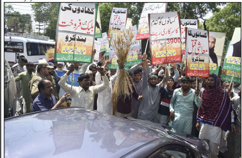
LAHORE: Farmers protesting in favour of their demands in front of the press club of the Provincial Capital.

During his address at the ceremony, Khalid Latif Khan highlighted the Khyber Pakhtunkhwa Government's commitment to digital transformation under Chief Minister Mr. Ali Amin Gandapur's guidance. The investment of 1642 million rupees in Pakistan Digital City, overseen by NESPAK and National Logistics Cell, signifies KP's vision to establish itself as Pakistan's digital hub. The Pakistan Digital City project, evidence to this vision, aims at stimulating economic growth by attracting national and international.