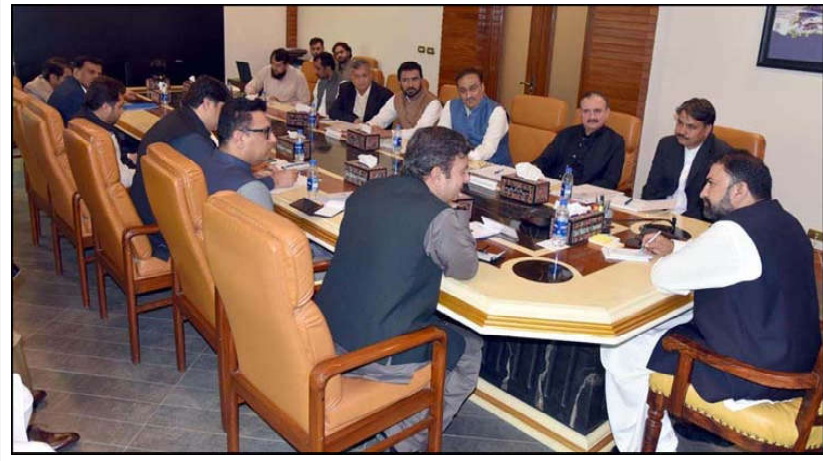
QUETTA: Balochistan Chief Minister, Mir Sarfraz Bugti chairing a review meeting of Welfare Board's Affair.

project. Later it returned the employees. The CJP remarked we have not to run the government. They themselves should run the government. The counsel said the appointments were made under the package of president and governor.