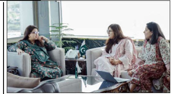
ISLAMABAD: Minister of State for IT and Telecommunication Ms. Shaza Fatima Khawaja in a meeting with Meta delegation.

ISLAMABAD (APP): The per tola price of 24 karat gold increased by Rs. 500 and was sold at Rs. 242,500 on Thursday compared to its sale at Rs. 242,000 on last trading day. The price of 10 grams of 24 karat gold also increased by Rs. 429 to Rs. 207,905 from Rs. 207,476 whereas the prices of 10 gram 22 karat gold went up to Rs. 190,580 from Rs. 190,186, the All Sindh Sarafa Jewellers Association reported.