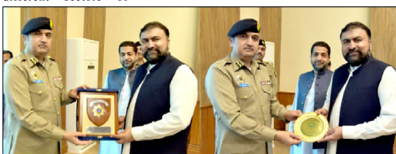
QUETTA: Chief Minister Balochistan Mir Sarfaraz Bugti and Inspector General Motorway Police Salman Chaudhry exchanging souvenirs

She mentioned that we are assisting the government in resettlement of the flood affected people as well as alternative sources of energy, rules of law and sustainable development goals (SDGs) in the province under UNDP.