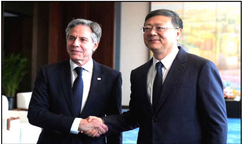
U.S. Secretary of State Antony Blinken meets with Shanghai Party Secretary Chen Jining at the Grand Halls in Shanghai, China.