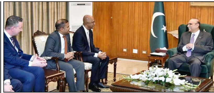
ISLAMABAD: A delegation of Air Asia Aviation Group (AAAG) called on President Asif Ali Zardari at Aiwan-i-Sadr.

tion, he added. PM Shehbaz underscored that the bilateral relations with UK spanned over decades which were further strengthening with the passage of time. He emphasized that there should be collaboration in the fields of research and technology in the universities of the two countries. He further said Pakistan wanted to take benefit of the capacity of the UK's education sector. The delegation expressed their interest in collaborating with Pakistani universities and offered assistance in teacher training and capacity building. The prime minister was informed by the delegation that the scope of the Education Gateway Pakistan was being extended which would help enhance bilateral cooperation in the education sector.