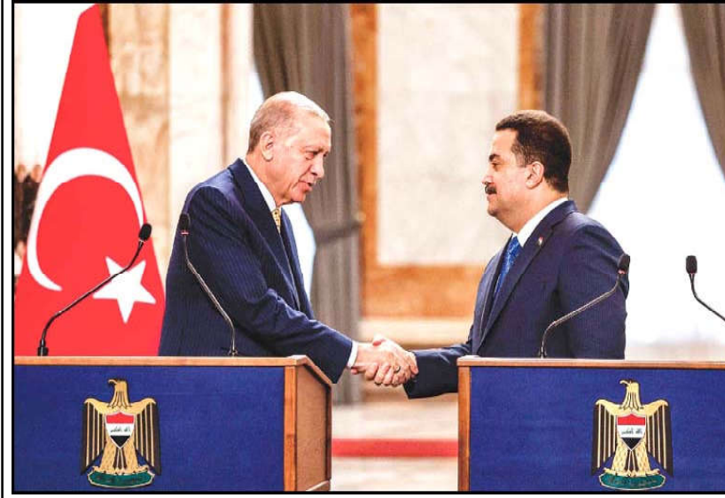
Iraq's Prime Minister Mohammed Shia al-Sudani and Turkish President Recep Tayyip Erdogan shake hands after a joint statement to the media.

and act against non-state armed groups that could be working with terrorist organisations. He did not mention the PKK specifically. An Iraqi government spokesperson said PKK members were welcome in Iraq so long as they did not engage in political activism or carry weapons. He did not elaborate. The PKK took up arms against the Turkish state in 1984 and is designated a terrorist organisation by Ankara and its Western allies. Turkiye has conducted a series of cross-border operations against the group in northern Iraq since 2019.