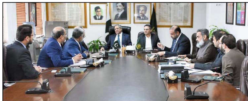
ISLAMABAD: Law Minister Azam Nazeer Tarar along with Attorney General of Pakistan Mansoor Usman Awan in a meeting with the Pakistan Tax Bar Association.

On the occasion, the PCP chairman said that all-out efforts would be made to address the issues facing journalist community and general public.