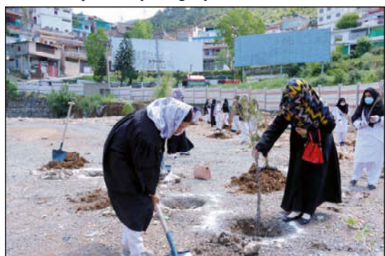
ABBOTTABAD: Students of Government Girls Degree College Nawanshahr planted 300 saplings in Salhad dumping ground with the support of Water and Sanitation Services Company Abbottabad (WSSCA) during the Plantation Campaign 2024, in Abbottabad.