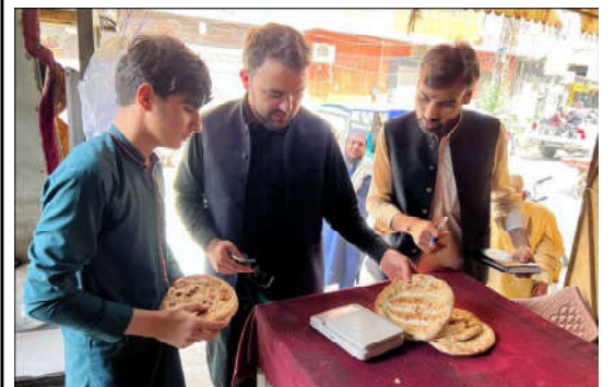
ISLAMABAD: District Administration Department officials inspecting the selling and checking the price control list of different items during crackdown drive against profiteers.

In the operation, PESCO officials disconnected the illegal connections on the spot.