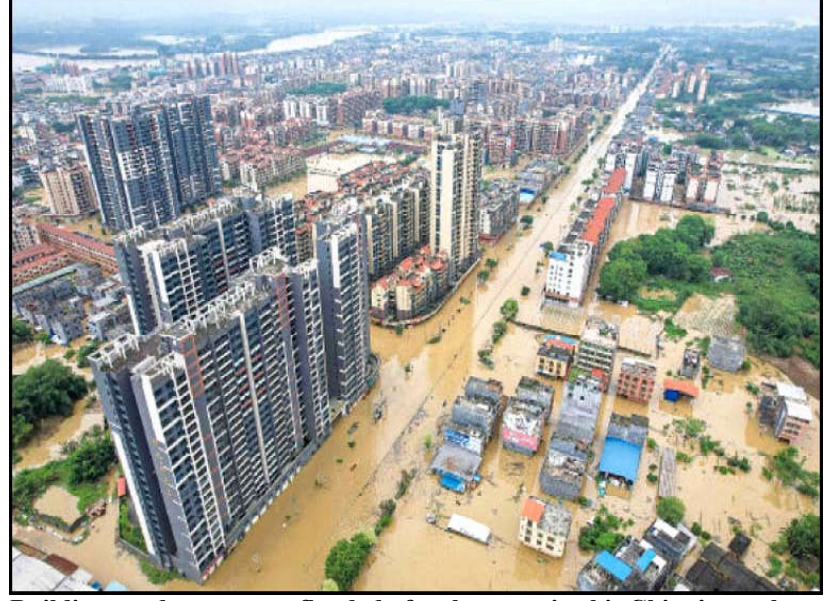
Buildings and streets are flooded after heavy rains hit China's southern Guangdong province.

Monitoring Desk LONDON: Veteran news anchor Huw Edwards resigned from the BBC on Monday on "medical advice", the broadcaster said, nine months after he became embroiled in a scandal over sexually explicit images involving a teenager. Edwards, 62, had been the BBC's lead presenter in key events, such as the death and funeral of Queen Elizabeth II, but was suspended in July 2023 when allegations first emerged.