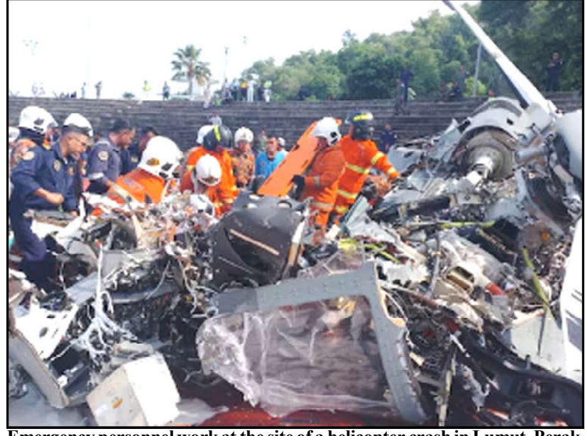
Emergency personnel work at the site of a helicopter crash in Lumut, Perak, Malaysia.

of Rajasthan, Modi said that when the Congress party was in government, "they said Muslims have the first right over the country's resources." If it returns to power, the party "will gather all your wealth and distribute it among those who have more children," he said as the crowd applauded. "They will distribute it among infiltrators," he continued, saying, "Do you think your hard-earned money should be given to infiltrators?" Mallikarjun Kharge, the Congress party's president, described the prime minister's comments as "hate speech" and party spokesperson Abhishek Manu Singhvi called them "deeply, deeply objectionable." The party sought action from the election commission, whose code of conduct forbids candidates from appealing "to caste or communal feelings" to secure votes. The first votes were cast Friday in the six-week election, which Modi and his Hindu nationalist BJP are expected to win, according to most surveys.