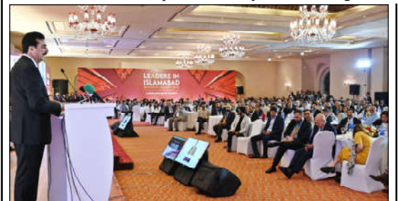
ISLAMABAD: Chairman Senate Syed Yusuf Raza Gillani addressing during Leaders in Islamabad Business Summit 2024 collaborating for Growth.