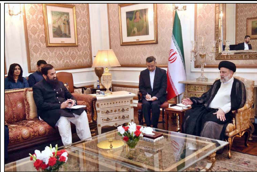
LAHORE: Punjab Governor, Muhammad Balighur Rahman meets with President of the Islamic Republic of Iran Dr. Seyyed Ebrahim Raisi at Governor House.