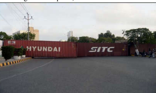
KARACHI: Containers are being placed by Sindh Police for the security arrangements are making fool-proof by police due to security reasons on the arrival of Iranian President Dr. Ebrahim Raisi, at Shahrah-e-Faisal road in Karachi.