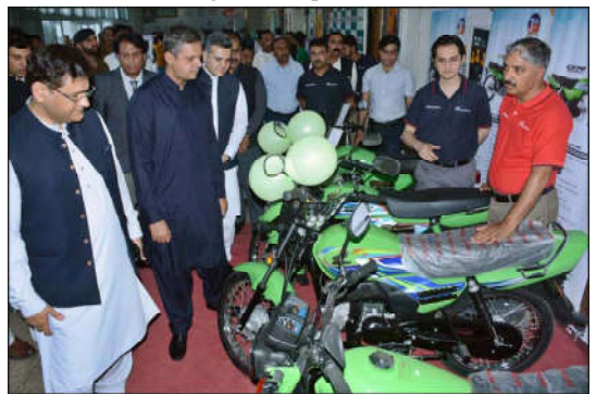
FAISALABAD: Provincial Minister for Transport and Mass Transit Bilal Akbar Khan visiting after inaugurating Urban Transport Plan & Road Show for Electric and Petrol Bikes Scheme at Iqbal Auditorium University of Agricultural.

Keeping in the prevailing scenario, the SCCI chief stressed it is dire need of hour, urging the federal and provincial governments to take proactive steps for promotion of the solar.