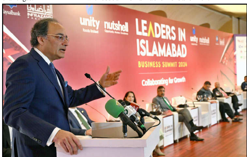
ISLAMABAD: Federal Minister for Finance & Revenue Senator Muhammad Aurangzeb addressing during Leaders in Islamabad Business Summit 2024 collaborating for Growth.

The agriculture credit disbursement during the period from July-February, 2024 witnessed 33.6 percent growth as compared to the same period of last year, he said adding that during the period under review the current account deficit decreased by 74 percent and reached to $1.00 billion as against the deficit of $3.9 billion.