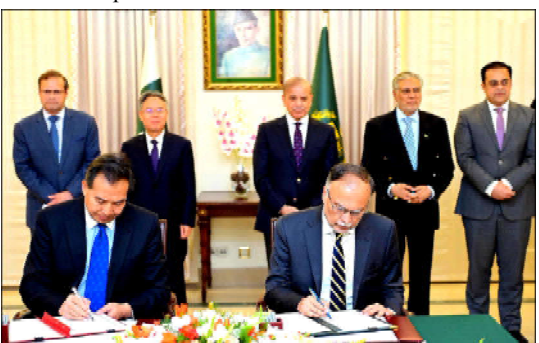
ISLAMABAD: Prime Minister Muhammad Shehbaz Sharif witnesses the signing of different agreements between China and Pakistan regarding cooperation in various fields.

Mian Bugti called for concerted efforts to uplift the region, urging the concerned for provision of gas facilities to the local population.