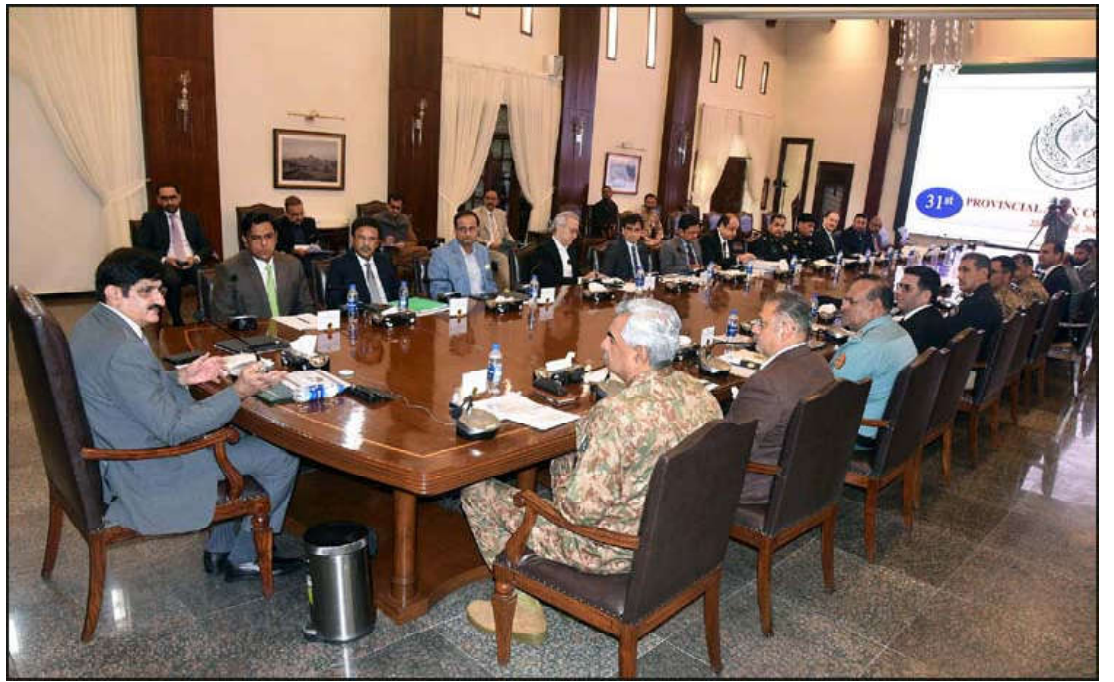
KARACHI: Sindh Chief Minister, Syed Murad Ali Shah presides over the 30th APEX Committee meeting, held at CM House in Karachi.

Comparative figures for the first three months (January to April) of 2023 and 2024 indicate a decrease in the number of theft cases reported. In 2024, 15,345 two-wheelers were stolen which is 953 cases less than the 16,298 incidents reported in 2023. Similarly,