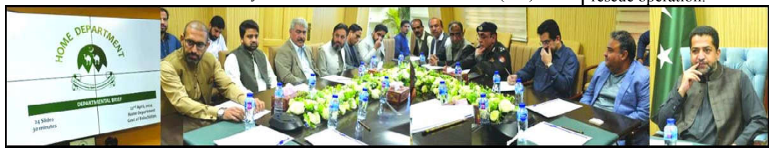
QUETTA: Home Minister Mir Ziaullah Langove presiding over a meeting regarding law and order situation in the province