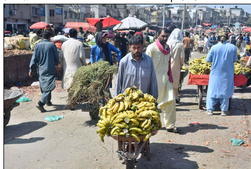
ISLAMABAD: Labourer Carrying Bananas on cart at Fruit Market.

the previous financial year 2021-22. "The CDNS has set a reviewed saving target of Rs 1.4 trillion for the current financial year (2021-22) which will promote savings culture in the country," he said. Given the current market trend in the country, the ambitious target had been set to improve the savings culture further, he added. The official said that work was being done on institutional reforms in CDNS and new reforms and innovations.