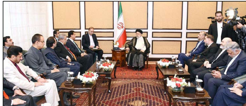
ISLAMABAD: Speaker National Assembly Sardar Ayaz Sadiq in a meeting with President of Iran Dr. Seyyed Ebrahim Raisi.

He also shared concerns over recent developments in Indian Illegally Occupied Jammu and Kashmir, highlighting the volatile situation and expressed gratitude for Iran's continued support towards the just cause of the Kashmiri people.