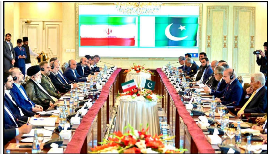
ISLAMABAD: Prime Minister Muhammad Shehbaz Sharif and Iranian President H.E. Dr. Seyyed Ebrahim Raisi in a delegation level talks between Iran and Pakistan.