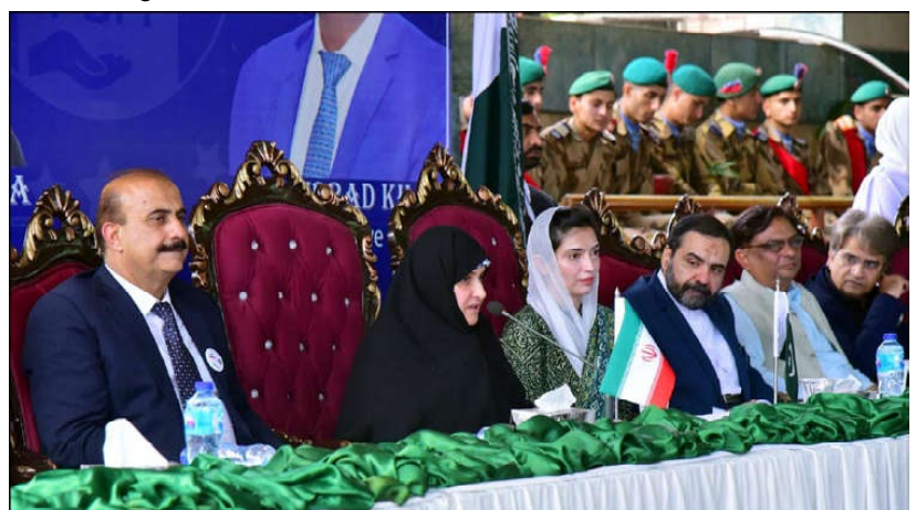
H.E. Dr. Jamileh Alamolhoda, wife of the Honourable President of the Islamic Republic of Iran paid a visit to Pakistan Sweet Home an orphanage for abandoned children across the country providing basic necessities of life including education and shelter Islamabad.

tion to unite and resist India's attempts to erase the political, cultural, and religious identity of the Kashmiri people. The Indian government is not only trying to erase the Kashmiri identity but also suppressing political activities and silencing the voices of the oppressed. Harassment against civil society, religious scholars, academics, journalists, and human rights defenders continues unabated. The recent visits of Indian Prime Minister Narendra Modi and Home Minister Amit Shah to the territory were seen as a cruel joke played on the people of Jammu and Kashmir. The BJP government is misleading the world about the real situation in IIOJK.