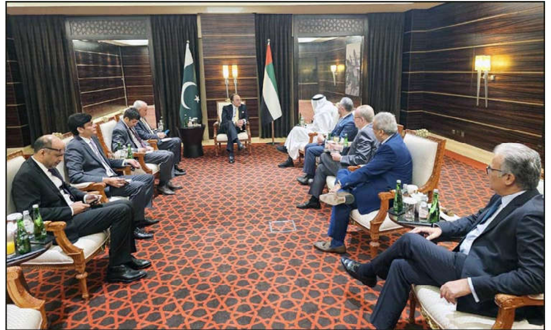
DUBAI: Finance Minister Muhammad Aurangzeb in a Meeting with Senior Officials of Mashreq Bank and First Abu Dhabi Bank.

country in the world with a significant youthful population, Pakistan recognized the critical importance of safeguarding food systems for future generations. Agriculture, he said, was the backbone of the country's economy, contributing substantially to its GDP and employing a significant portion of its labour force. Ambassador Usman Jadoon referred to Pakistan's 2022 devastating floods, which destroyed 4.4 million acres of standing crops, and said that the catastrophe led to a stark realization of the extreme vulnerability of food systems.