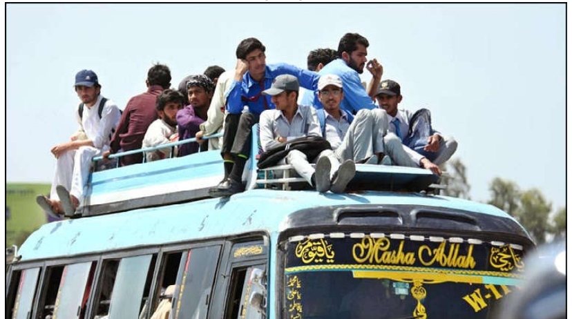
ISLAMABAD: People travelling on the top of a passenger bus at Khanna Pul may cause any mishap and needs the attention of concerned authorities.