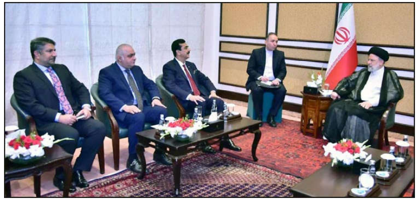
ISLAMABAD: Chairman Senate, Syed Yousaf Raza Gilani in a meeting with Iranian President Ebrahim Raisi.

State counsel said we on our own are seeing about establishment of sub jail.