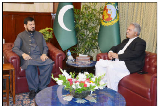
PESHAWAR: Provincial President PML-Q Intikhab Khan Chamkani meeting with Khyber Pakhtunkhwa Governor Haji Ghulam Ali.

LAHORE (APP): Senior Provincial Minister Marriyum Aurangzeb has said the Punjab government has initiated a comprehensive effort to combat pollution and enhance environmental quality. In a statement on Earth Day, she said, "Today marks the launch of the 'No to Plastic' campaign with a complete ban on plastic bag usage slated for June 5 to foster a cleaner environment."