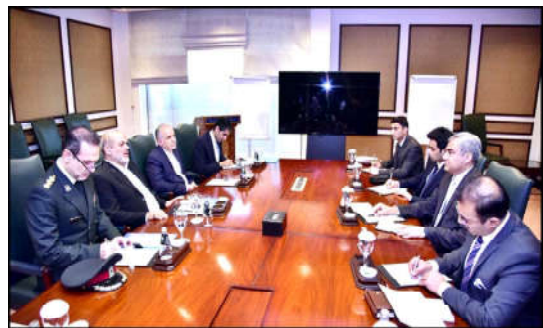
ISLAMABAD: Federal Minister for Interior Mohsin Naqvi in a meeting with his Iranian counterpart Dr. Ahmad Vahidi and Iran's Justice Minister Amin Hosein Rahimi.

He thanked Dr. Seyyed Ebrahim Raisi for being the first Head of State to visit Pakistan after the general elections, which reflected his deep personal commitment to Pakistan.