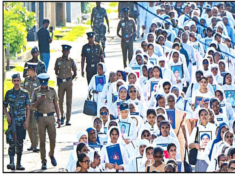
NEGOMBO: Catholic nuns carry photos as they pay tribute to the victims killed in the 2019 Easter Sunday bombings at Katuwapiya St. Sebastian's Church.

Monitoring Desk DUBAI: The first group of Iranian pilgrims in nine years made its way to Saudi Arabia on Monday for the Umrah, or minor pilgrimage, Iran's official news agency reported, as a result of improving ties between the two Middle Eastern powers. Iranian media had said in December that Saudi Arabia had lifted restrictions on Iranians wanting to perform Umrah but flights were delayed until now due to what Tehran called "technical problems". In March 2023, China mediated an agreement under which Iran and Saudi Arabia restored full diplomatic relations that were cut since 2016 over Riyadh's execution of a Shi'ite Muslim cleric and the subsequent storming of the Saudi embassy in Tehran.