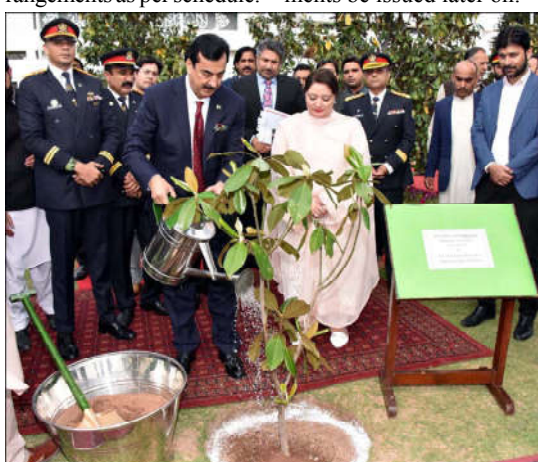
ISLAMABAD: Chairman Senate, Syed Yusuf Raza Gilani planting a sapling of magnolia tree in the lawn of the Parliament House.

During hearing, the ECP's lawyer pleaded that the election commission has ordered for re-elections keeping in view all the facts. He said that the commission was providing opportunity to the two sides to contest the polls. The lawyer said that there were the decisions of the court that re-elections would be conducted on unnatural voting turn out. He said that the ECP has ordered re-polling in seven polling stations, out of which, the polling has been concluded in three stations. Petitioner's lawyer adopted the stance that they didn't get the Form-45, adding that the ECP uploaded it for some time and then removed from the website. After hearing arguments, the bench announced the short order while the detailed judgments be issued later on.