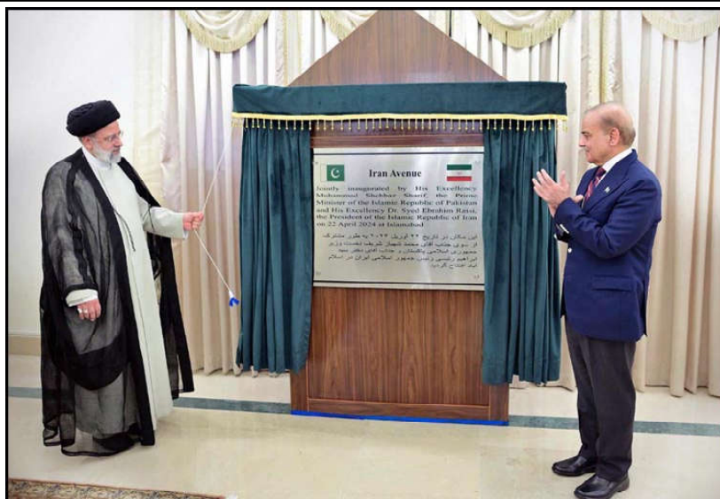
ISLAMABAD: President of Iran H.E. Dr. Seyyed Ebrahim Raisi and Prime Minister Muhammad Shehbaz Sharif unveiling plaque of renaming an avenue of Islamabad as Iran Avenue.

tires, two children presented bouquet of flowers to the dignitary, who is accompanied by his spouse and a high level delegation comprising the foreign minister and other members of the cabinet, senior officials as well as a large business delegation. During the three-day visit, President Raisi will meet the President and the Prime Minister of Pakistan, Chairman of Senate and Speaker of National Assembly. He will also visit Lahore and Karachi and meet with the provincial leadership. Besides discussing regional and global developments, the two sides will have a wide-ranging agenda to further strengthen Pakistan-Iran ties and enhance cooperation in diverse fields including trade, connectivity, energy, agriculture, and people-to-people contacts.