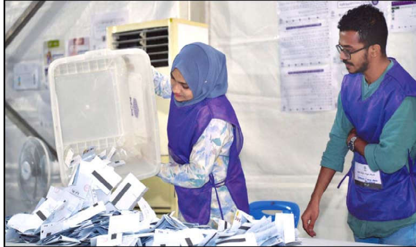
Officials count votes during the parliamentary elections, at a polling station in Maldives's capital Male.

clearly say who won and who lost," Tusk said Monday. "But if we compare these results, especially in the most attractive places, on these attractive battlefields... then I actually have reasons for satisfaction." "Law and Justice has simply disappeared in many places," Tusk added at a news conference, referring to the main opposition party. The results put Civic Coalition in a favorable position as the country looks next to elections to the European Parliament on June 9.