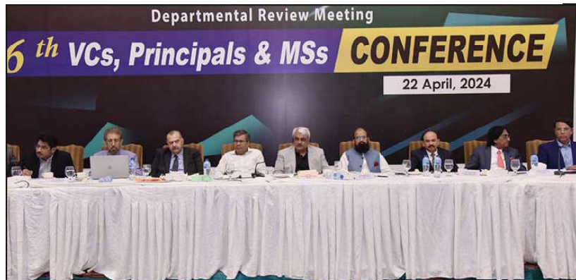
LAHORE: Provincial Minister for Health and Emergency Services Punjab Khawaja Salman Rafique addressing the participants of 6 th VCs, Principals and MSs conference.