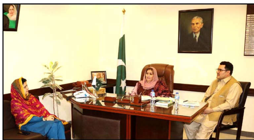
QUETTA: Provincial Education Minister Raheela Hameed Durrani meeting with acting Speaker Balochistan Assembly Ghazala Gola

He said that Balochistan has suffered due to the killings in tribal disputes. Therefore, it is our responsibility to stop killings in the tribal disputes. He said that annually, Rs. 55 billion are being spent on law and order in the province but we are not satisfied with the law and order situation. He stressed that we have to take meaningful steps for eliminating terrorism. He asked all the institutions to remain alert for coping with the security challenges. Meanwhile, the meeting expressed dissatisfaction over performance of the civil defence.