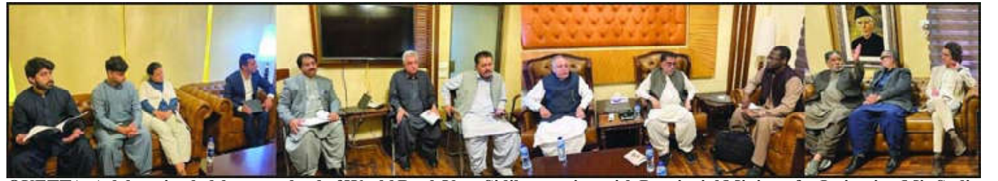
QUETTA: A delegation led by team lead of World Bank Yoro Sidibe meeting with Provincial Minister for Irrigation Mir Sadiq Umrani.

It emphasized the urgent need to combat plastic pollution, as highlighted by the theme "Planet versus Plastic," and safeguard the planet's health.