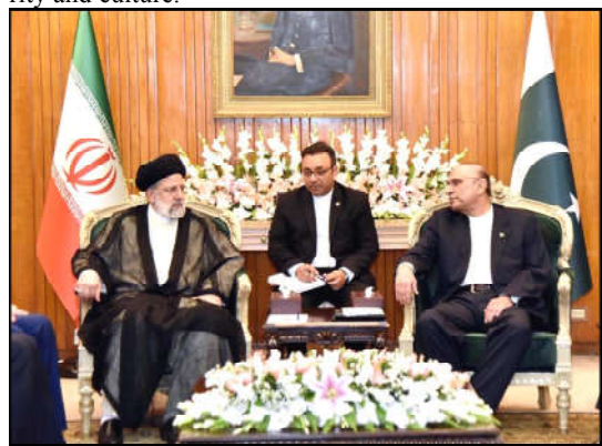
ISLAMABAD: President Asif Ali Zardari and the Iranian President, Dr. Seyyed Ebrahim Raisi, held a meeting, at Aiwan-e-Sadr.