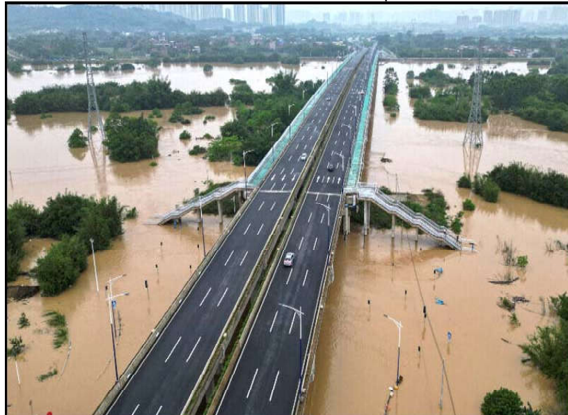
A drone view shows roads submerged in floodwaters following heavy rainfall, in Qingyuan, Guangdong province, China.

mains a lot of work to be done on it," Canadian Environment Minister Steven Guilbeault and host of the Ottawa talks told AFP. According to him, the goal this round is to "achieve a text with 60 to 70 percent of the elements endorsed" by delegates who are meeting through April 29. The stakes are high, with widespread plastic pollution having potentially grave impacts on oceans and climate. Although there is a broad consensus on the need for a treaty, environmental activists pleading for a 75 percent cut in plastic production by 2040 are at odds with oil-producing nations and the plastics industry itself that favor recycling. "This treaty presents a monumental opportunity in a time of urgency," said oceans scientist Neil Nathan of the University of California Santa Barbara. "Legally binding and specific measures are necessary to avoid a watered-down agreement that fails to meet the moment."