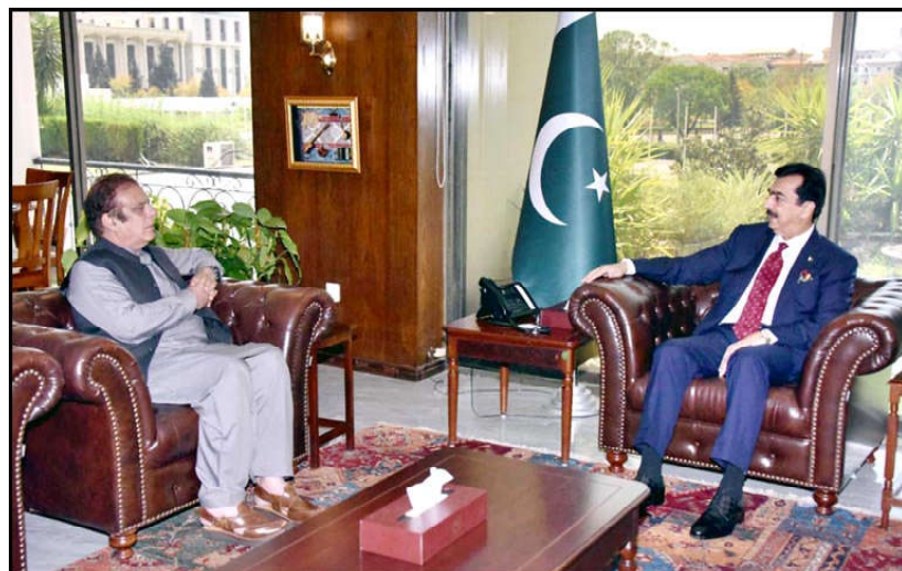
ISLAMABAD: Chairman Senate, Syed Yusuf Raza Gilani in a meeting with Leader of opposition in the Senate Senator Shibli Faraz at Parliament House.