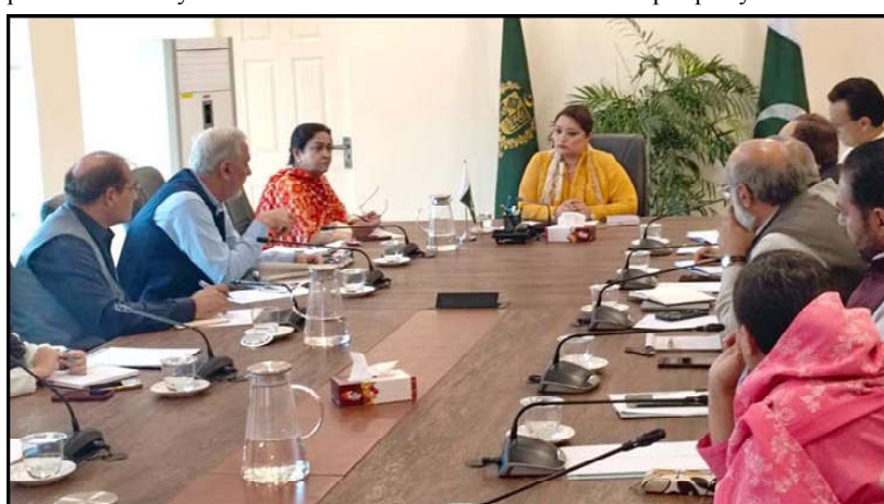
ISLAMABAD: PM's coordinator on climate change & environmental coordination Romina Khurshid Alam chairs review meeting to discuss implementation of measures against plastic use in the country.

ISLAMABAD (APP): The National Highways and Motorways Police (NHMP) foiled a drug smuggling attempt and recovered 121 kilograms of drugs here on Monday. According to the Motorway Police spokesman, the police signaled a suspicious vehicle near Sawabi to stop but the accused drove away and left the vehicle on being chased. During the search, the NHMP police recovered 87 kg of hashish and 34 kg of heroin from the secret compartments of the vehicle. After completing the preliminary reports, the drugs were handed over to ANF Peshawar for further proceedings, the spokesman added.