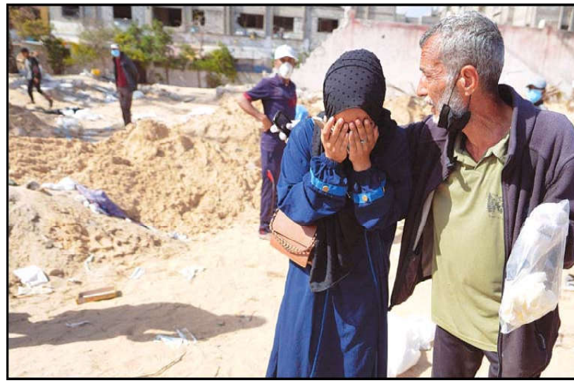
A grieving woman is consoled by a man after the body of her relative was discovered, buried by Israeli forces in a mass grave in the Nasser hospital compound in Khan Younis.

Omer Celik, spokesman for Erdogan's ruling party, said last week that Ankara considers the creation of the marine parks "a step that sabotages the normalization process" in relations, and said Turkey would "in no way allow actions toward the declaration of marine parks in the Aegean Sea." Mitsotakis, speaking last week after a meeting of European leaders in Brussels, expressed surprise at what he described as "Turkey's totally unjustified reaction to an initiative which at the end of the day is of an environmental nature." The Greek prime minister said the recent improvement in relations between Greece and Turkey was "undeniable and measurable," but that this did not mean Turkey had changed its positions on the delineation of maritime zones in the Aegean and the eastern Mediterranean.