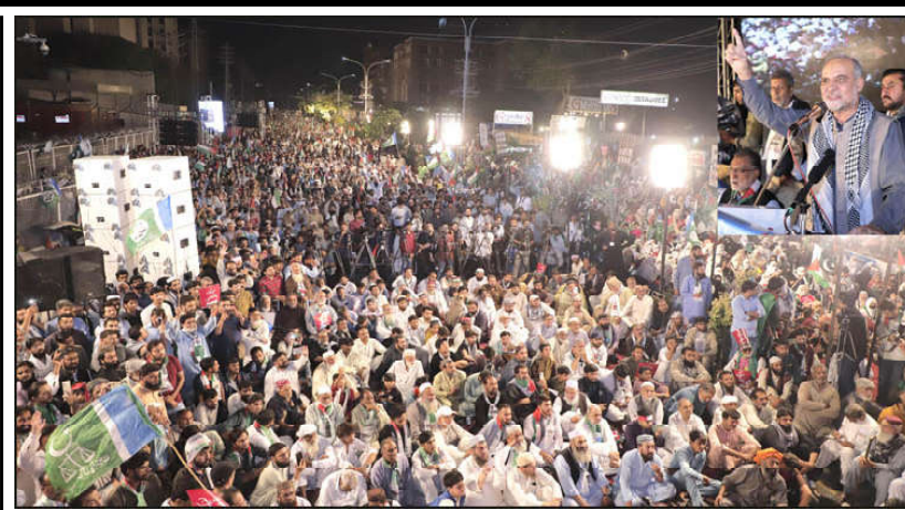
LAHORE: Amir Jamaat-e-Islami Hafiz Naemur Rehman addressing "Labaik Ya Aqsa" march.

and PTI founder always instigated the people to de-stabilize the country for his personal gains. The PTI leadership instigated people to carry out May 9 incident, he added. He highlighted, "The court has declared both PTI founder and his spouse guilty in theft cases and now they wanted to create chaos in the country to divert attention of the people from their wrongdoings."