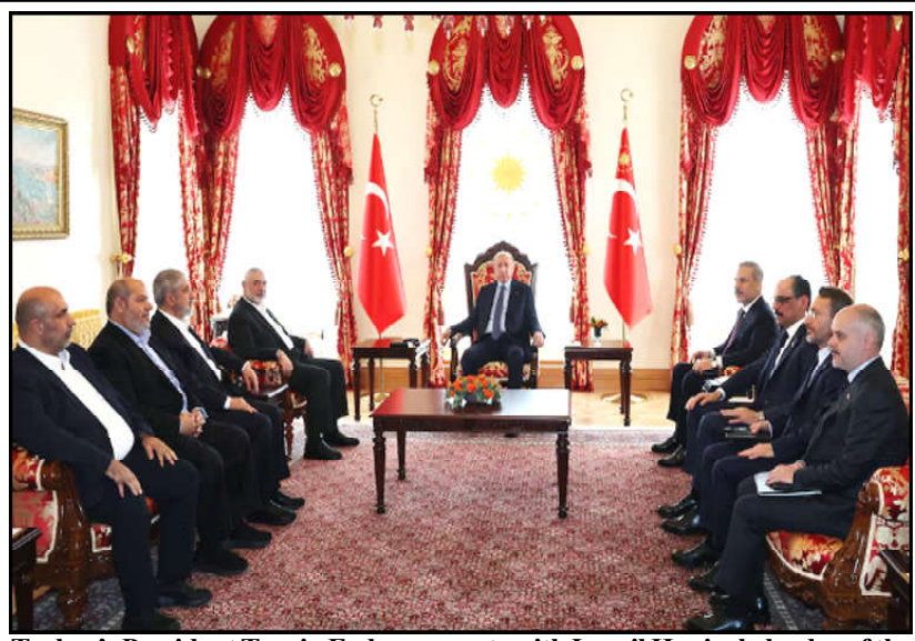
Turkey's President Tayyip Erdogan meets with Ismail Haniyeh, leader of the Palestinian Islamist group Hamas, in Istanbul, Turkey.

Monitoring Desk PANAMA CITY: Hearings in the money-laundering trial of the heads of the now-defunct law firm Mossack Fonseca, the epicentre of the global "Panama Papers" scandal, concluded on Friday in the Panamanian capital.