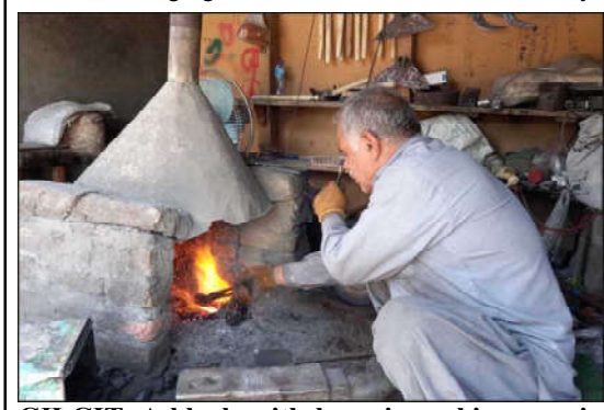
GILGIT: A blacksmith busy in making saw in traditional way on his work place at River view road.