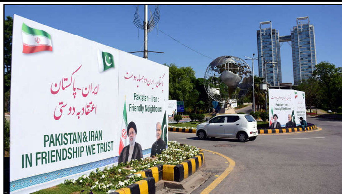
ISLAMABAD: The Constitution Avenue of Federal Capital decorated with Pak-Iran flags and banners ahead of visit of President of the Islamic Republic of Iran, Dr. Seyyed Ebrahim Raisi, undertaking an official visit to Pakistan from 22 to 24 April 2024.

of land rights for individuals and communities. The helpline received two calls specifically requesting free legal assistance. These inquiries sought guidance and support on various legal matters, including criminal cases, civil disputes etc. He further added that a total of 288 calls fell under the miscellaneous category, encompassing a wide range of inquiries that did not fit into the other predefined categories. These inquiries covered topics such as employment rights, social welfare, consumer protection, and various other individual concerns.