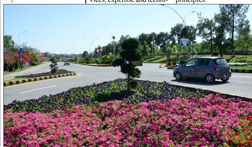
ISLAMABAD: An attractive eye catching view of blooming flowers to mark the spring season at Constitution Avenue of the Federal Capital.

ISLAMABAD (APP): UNESCO has announced MAB Young Scientists Awards 2024 for the young researchers carrying out interdisciplinary research in line with UNESCO's Man and the Biosphere (MAB) Programme. The researchers (under the age of 35) either pursuing research in UNESCO Biosphere Reserves or potential sites or their work contribute to the achievement of the 2030 Agenda and its Sustainable Development Goals may apply for the awards. According to the ECOSF Pakistan, the deadline for submission of applications for the MAB Young Scientists Awards is May 15 while the priority will be given to projects carried out in biosphere reserves. Created in 1989, the grant sheds light on interdisciplinary research in line with UNESCO's Man and the Biosphere Programme carried out by young scientists. Since 2022, with the generous support from the Principality of Monaco, five additional annual fellowships are granted specifically to studies on marine, island and