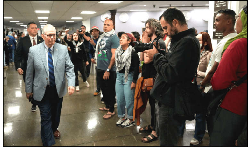
Lawmakers walk past pro-Palestinian protesters prior to a US House of Representatives vote on legislation providing $95 billion in security assistance to Ukraine, Israel and Taiwan, at Capitol Hill in Washington, US.

Monitoring Desk KYIV: Ukrainian President Volodymyr Zelenskiy expressed gratitude for the passage by the U.S. House of Representatives of a military aid bill for his country and said the assistance would save lives and "bring a just end" to the war with Russia.