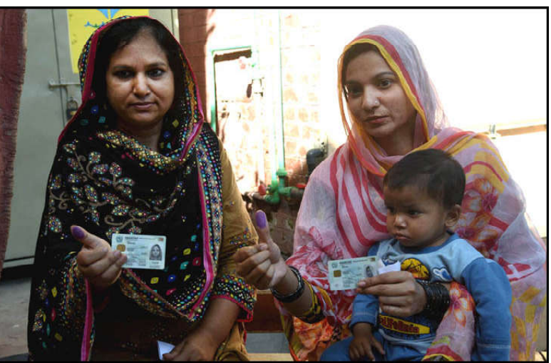
LAHORE: Women voters showing their national identity cards and marked thumbs after casting their votes during the by-election 2024 at Garhi Shahu School.