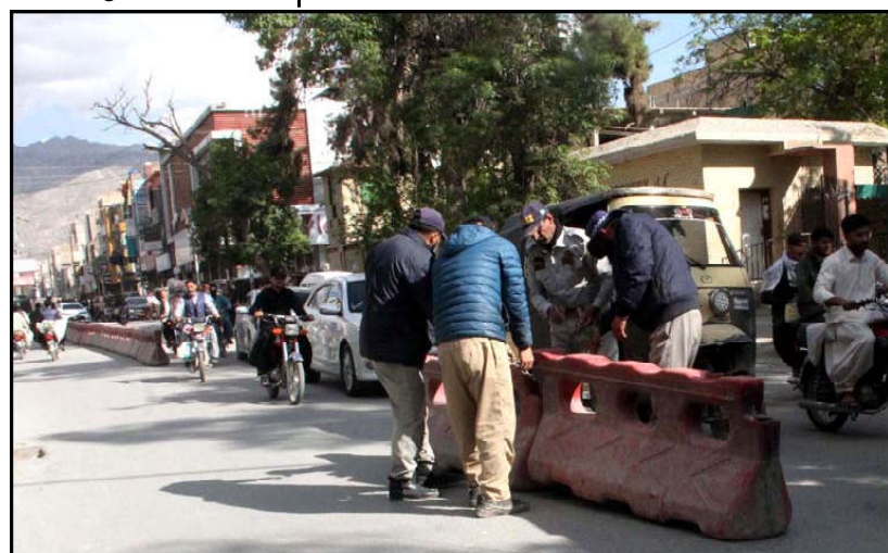
QUETTA: Traffic Police officials are keeping a barrier for traffic in the middle of the road due to traffic rush, in Quetta.

Continued from page 1 the masses who shown their trust in the government by voting the PML-N that had kicked off the journey of economic stability in the country by curbing inflation and increasing foreign reserves. On the other hand, the minister said the people had rejected the false and misleading narrative of the PTI whose leadership was allegedly conspiring against the country from behind the bars to achieve their ulterior motives. "They are issuing statements from jails that seriously damage credibility of Pakistan at international level," he said, adding the anti-state narrative was further pushed through such false statements. The people of Pakistan had rejected the PTI founder's "politics of hatred, chaos, division, falsehood and hypocrisy", the minister remarked. He said the performance of the PML-N governments in federation and Punjab spoke volume and the results of today's by-polls is its true manifestation. PML-N stood victorious in most of by-polls today, he said vowing that the government was aggressively taking measures to restore stature of the country at international level and provide relief to the masses by stabilizing the economy. He paid tribute to the people for exercising their democratic right and standing by truth and burying the narrative of the falsehood. He thanked the Almighty for the victory of PML-N in today's by-polls.