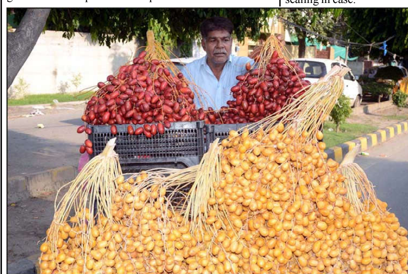
LAHORE: A vendor displaying raw dates to attract the customers at his roadside setup.