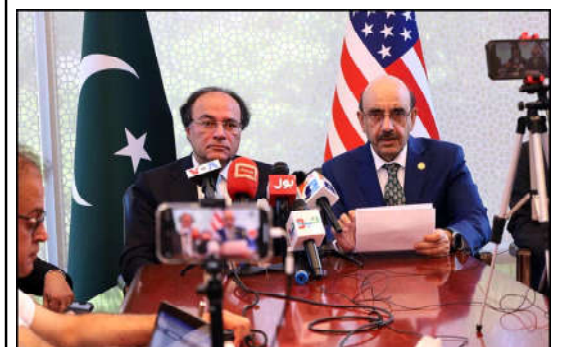
WASHINGTON DC: Finance Minister Mr. Muhammad Aurangzeb's interaction with Pakistani media at Pakistan Embassy.