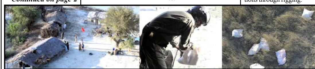
Pakistan Navy rescue teams air dropping ration bags to trapped people of Muradi, Dando and Kulanch near Gwadar.

Pakistan Navy Rescue teams immediately coordinated the efforts and air dropped ration bags to affected people of Muradi, Dando, Kulanch and adjoining isolated areas of Gwadar District. Pakistan Navy Sea King helicopters undertook multiple sorties to ensure ration supply to hundreds of stranded families.