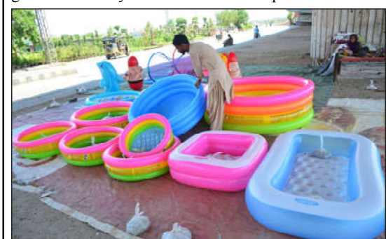
HYDERABAD: A vendor displaying the inflatable pools to attract the customers at roadside.