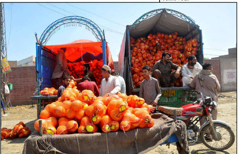
MULTAN: Traders are displaying melons on the delivery trucks to attract customers at the fruit Market.