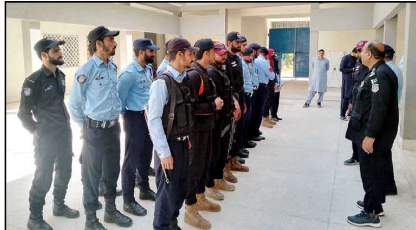
ISLAMABAD: Capital Police and ATF Officials participating in search and combing operation.