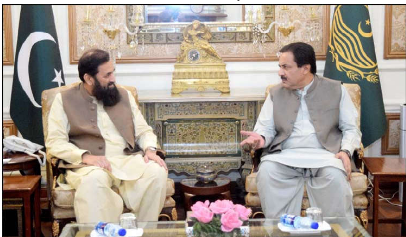
LAHORE: Deputy Chairman Senate Syedal Khan Nasir in a meeting with Governor Punjab Muhammad Balighur Rehman at Governor House.