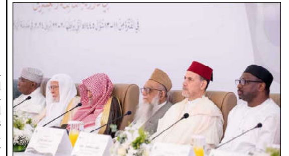
RIYADH: Senator Prof. Sajid Mir representing Pakistan in International Conference of Muslim World League.

to the collapse of walls and roofs in different districts, of which 477 were completely damaged and 2,725 were partially damaged. Due to heavy rains, life and financial accidents occurred in various districts, including Khyber, Dir Upper and Lower, Chitral Upper, Swat, Bajaur, Shangla, Mansehra, Mohmand, Malakand, Karak, Tank, Mardan, Peshawar, Charsadda, Nowshera, Buner, Hangu, Batagram, Bannu, North and South Waziristan, Kohat, DI Khan, and Orakzai. On the special in-