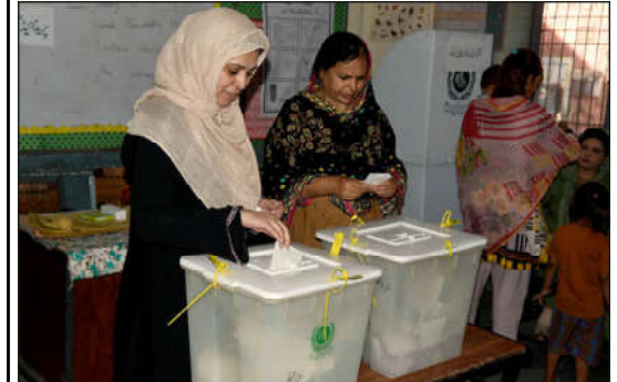
LAHORE: Female voters casting their votes in a polling station during the by-election 2024 at Garhi Shahu School.