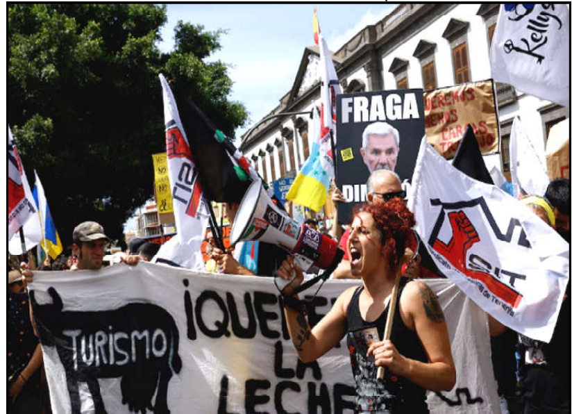
A woman uses a megaphone during a demonstration for a change in the tourism model in the Canary Islands, in Santa Cruz de Tenerife, Spain.

Some Chinese aircraft on Saturday got as close as 40 nautical miles (70 km) from the northern and southern parts of Taiwan, according to a map the Taiwanese ministry provided, though that remains outside its contiguous zone, which is 24 nautical miles from Taiwan's coast.