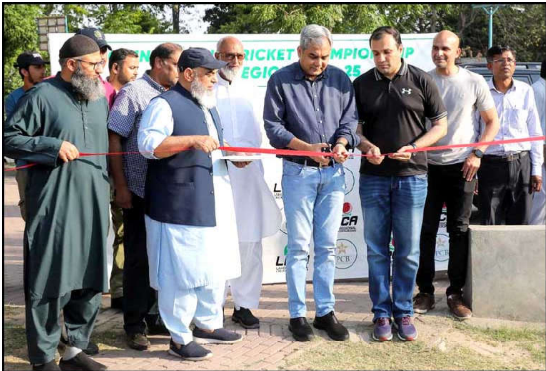
LAHORE: Interior Minister and Chairman PCB Mohsin Naqvi inaugurating Inter-Club Cricket Championship