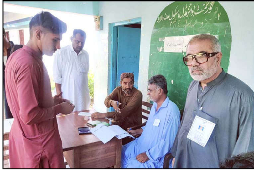
The ballot casting process is underway at a polling station during the By-Election in PB-22 constituency in Lasbela

"They will also discuss regional and global developments and bilateral cooperation to combat the common threat of terrorism," the statement read.