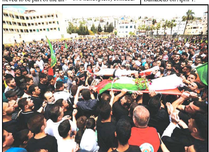
Mourners carry the bodies of Palestinian men killed during an attack by Israeli settlers on Aqraba, a village in the Israeli-occupied West Bank.

National Congress has asked voters to elect a majority that will swiftly fulfil his presidential campaign pledges. Opposition parties, criticising Muizzu's government on areas including foreign policy and the economy, are seeking a majority that can hold his government accountable.