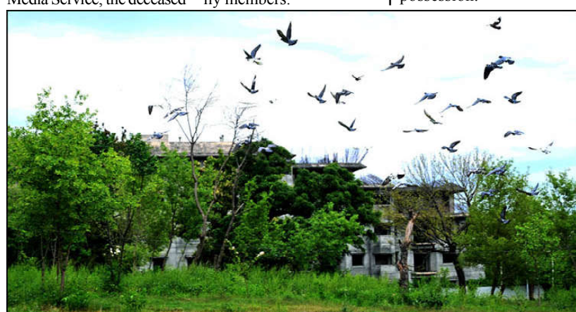
ISLAMABAD: A graceful flock of pigeons takes flight along the roadside in the heart of the Federal Capital.

the door-to-door campaign in rural area of Bhara Kahu in Islamabad. The survey revealed hilarious facts as 52% of the survey respondents believed that household waste is not hazardous. Similarly, 53% of the respondents opined that garbage cannot be segregated whereas it is possible by imparting training to females at home. It proved the little knowledge of the community on waste management that needed to be improved through awareness and education. She also noted that 58% of the respondents thought it was not illegal to burn waste, whereas 47% thought it was a smart way to burn and manage waste. The survey found out that females burning waste at the household level were few whereas the major problem was at the communal level at open dumping sites where communities and waste management officials were involved in setting up trash at fire. Interestingly, Aqsa Arshad, a Quaid-i-Azam