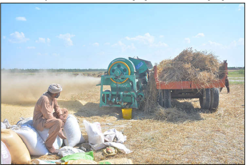
FAISALABAD: Farmers feed harvested wheat crop into a thresher during the ongoing harvesting season, at Sumundari Road in the City.

MULTAN (APP): The owners of agriculture industry on Sunday have expressed resolved to extend maximum cooperation towards the farming community in order to enhance cotton production. During a meeting with Secretary Agriculture Punjab Iftikhar Ali Sahu, the delegation from private agriculture industry extended offer of maximum cooperation in government's efforts to enhance cotton production. Punjab Secretary Agriculture Iftikhar Sahu appreciated the gesture shown by the industrialists and stated that coordination and cooperation between stakeholders was of vital importance. They also discussed different aspects of cotton enhancement plan. It was decided that adoptive tehsil groups would be introduced for proper patronage of the farmers at tehsil level. The industry owners will impart all possible technical assistance towards the farming community. It was also decided that comprehensive campaign at mainstream, local and social media would be run to create maximum awareness.