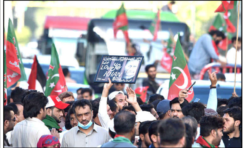
KARACHI: Supporters of PTI take part in a rally at Shahrah-e-Faisal.

For New Zealand, leg-spinner Ish Sodhi was the best bowler with 2-25. New Zealand, who lost the second match by seven wickets at the same venue on Saturday, made two changes with pacer Will O'Rourke and allrounder Zac Foulkes making T20I debut. They replaced Ben Lister and Ben Sears. Pakistan rested pacer Mohammad Amir in a like-for-like replacement in Abbas Afridi. The first match, also in Rawalpindi, was washed out after just two deliveries. The remaining matches are in Lahore on April 25 and 27. Teams Pakistan: Babar Azam (captain), Usman Khan, Abrar Ahmed, Iftikhar Ahmed, Mohammad Rizwan, Abbas Afridi, Muhammad Irfan Khan, Naseem Shah, Saim Ayub, Shadab Khan, Shaheen Shah Afridi New Zealand: Michael Bracewell (captain), Mark Chapman, Cole McConechie, Jacob Duffy, Dean Foxcroft, Jimmy Neesham, Tim Robinson, Will O'Rourke, Zac Foulkes, Tim Seifert, Ish Sodhi