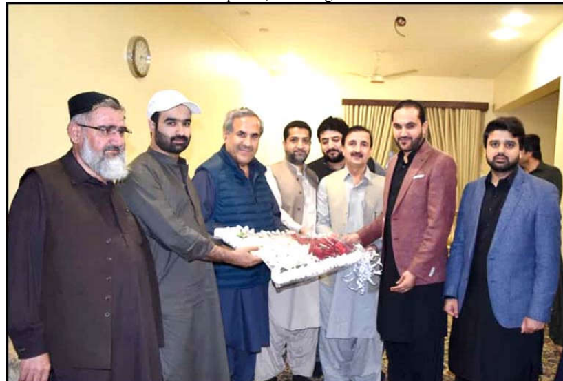
QUETTA: Former Chief Minister Balochistan Senator Abdul Qudus Bizenjo, Home Minister Mir Ziaullah Lango and MPA Asghar Rind congratulate Justice Hashim Khan Kakar on becoming Chief Justice of Balochistan High Court.