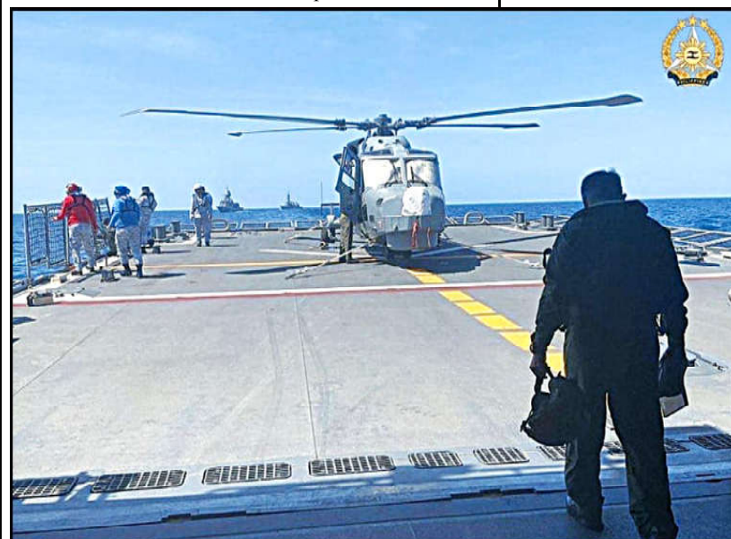
A Philippine Navy helicopter pilot walks towards the helideck during the first multilateral drills.