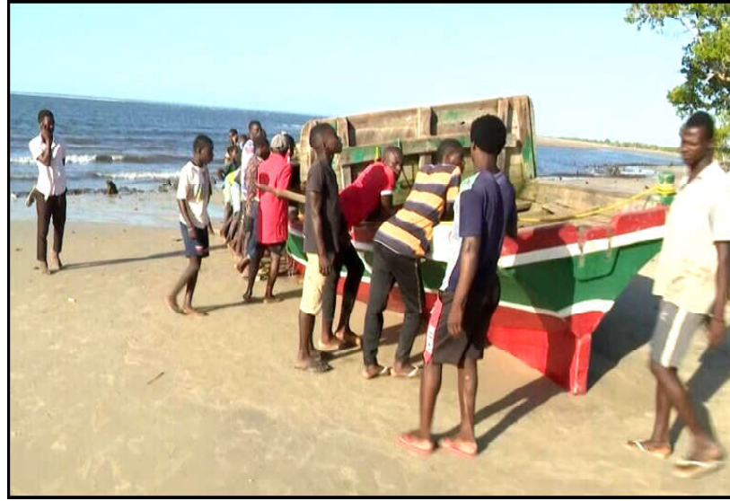
Boat that sunk off the north coast of Mozambique killing 96 people on the Island of Mozambique.

"On Sunday we registered a maritime incident where at least 94 people died when a barge carrying 130 people capsized.