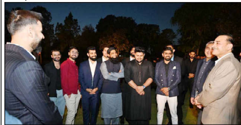
RAWALPINDI: General Syed Asim Munir, NI (M), Chief of Army Staff (COAS) interacting with players of Pakistan cricket team during an Iftar dinner hosted by him

RIYADH: According to the moon sighting committee in Saudi Arabia, the Shawwal moon was not sighted on Monday (April 8). As a result, Ramadan will continue until April 9, completing 30 days, and Eidul Fitr will be celebrated on April 10 in Saudi Arabia. In the UAE, the Emirates Astronomical Society also predicts that Eid will commence on April 10.