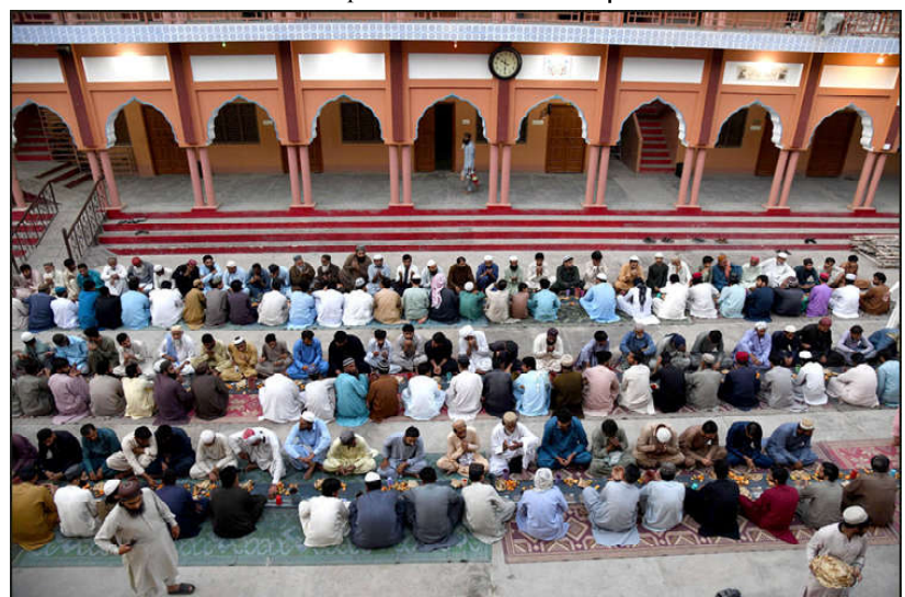
LARKANA: A large number of people breaking fast (Iftar) in the holy month of Ramzan ul Mubarak at Madarsa Jamia Ishtatul Quran Wal-Hadees.

He issued these directives while presiding over a meeting regarding the prevention of aerial firing and maintenance of smooth flow of traffic on the occasion of Eidul Fitr in