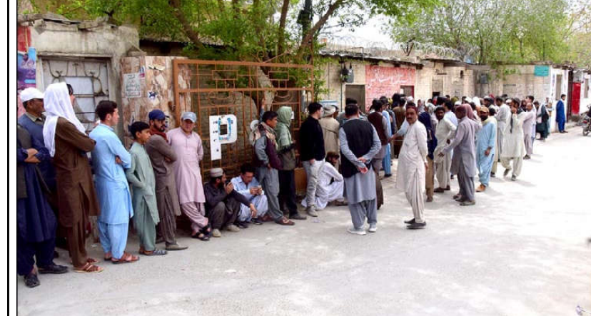
QUETTA: A large number of people standing in queue to deposit gas bill

FIA officers are already deputed in Peshawar, Sukkur and Hyderabad Electric Supply Companies. The Power Division has recovered over Rs1.50 billion during a country-wide power theft crackdown from March 24 to 31, taking the overall recoveries to Rs84 billion. To minimize the losses in the power sector, the caretaker government and military leadership of Pakistan in September 2023 decided to launch a country-wide crackdown on power thieves to minimize the losses. Pakistan has so far recovered Rs84 billion fine during a country-wide crackdown on the power pilfers while over 62,000 people have been taken into custody from September 1 till date.