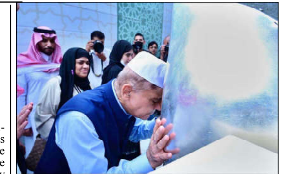
MAKKAH MUKARAMAH: Prime Minister Muhammad Shehbaz Sharif kisses Hajr-e-Aswad as part of Ziaaraat of Al-Masjid e Haraam.