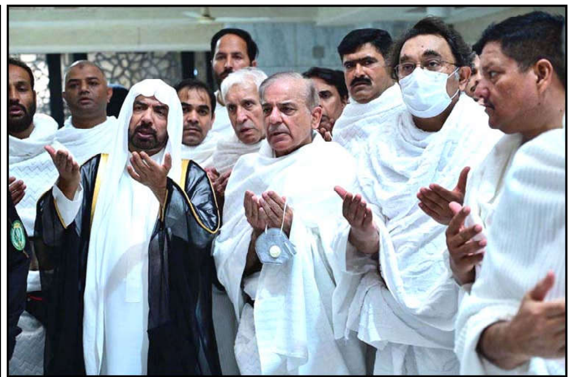
MAKKAH MUKARAMAH: Prime Minister Muhammad Shehbaz Sharif performs Umrah.

ISLAMABAD (INP): Former prime minister Shahid Khaqan Abbasi, who has parted ways with the PML-N, approached the Election Commission of Pakistan (ECP) on Monday for the registration of a new political group. According to sources, the disgruntled PML-N leader has submitted the necessary documents to the ECP in this respect. During an informal interaction with a group of journalists, the former premier said that all necessary documents have been provided to the ECP for the registration of a new political group. The former prime minister further said that the new political party would participate actively in the upcoming elections.