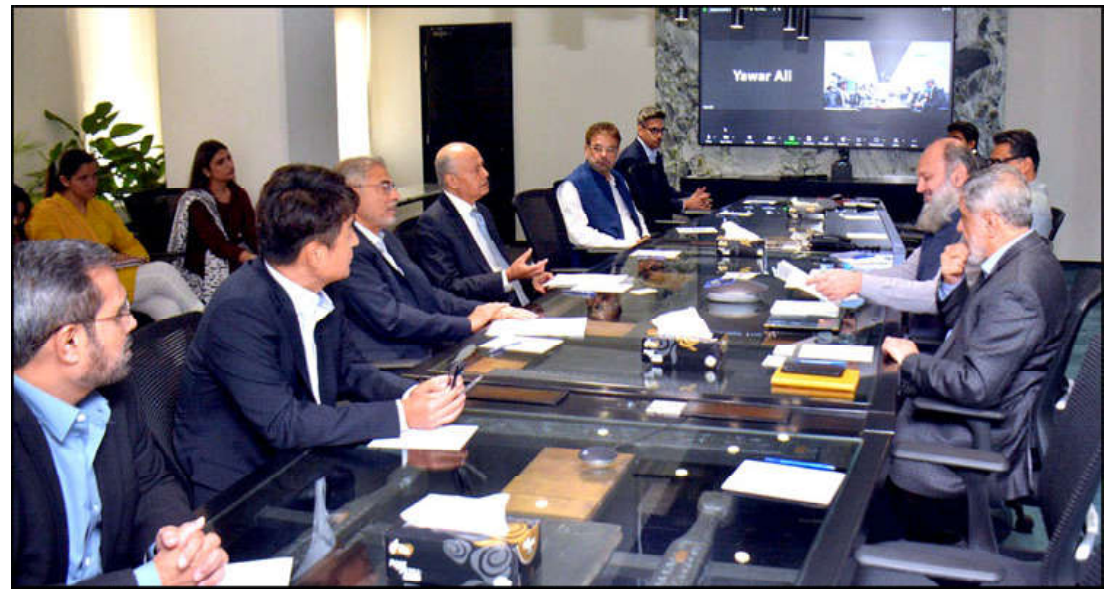
KARACHI: Federal Minister for Commerce, Jam Kamal Khan meeting with Pakistan Business Council.

over for our progress and prosperity. He told another questioner that the road map of exports is not like pushing a button to improve the exports immediately rather it is a gradual and continuous process and therefore we will have to take appropriate steps accordingly. He lauded the performance of the previous caretaker government, and said that many things were streamlined by the caretaker setup in the past six months as smuggling was also controlled to a greater extent and some of the initiatives needed to be taken ahead.