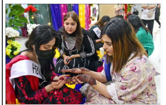
ISLAMABAD: Beautician applies traditional henna designs to the hand of a customer ahead of the Muslim festivities of Eid al-Fitr.

The prevailing inflation has limited the purchasing capacity of the salaried class, so I completed all shopping for my family at a local market, she said while talking to APP. Eid-ul-Fitr is the biggest festival for all Muslims across the world, and Muslims celebrate this festival with great religious zeal and enthusiasm.