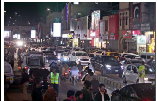
PESHAWAR: A large number of vehicles stuck in traffic jam at Saddar market while people busy in shopping as they are preparing for the occasion of Eid-ul-Fitar coming ahead, in Peshawar.

There have been some incidents, the purpose of which is that the police is fighting with the dacoits. IG Sindh said that if we challenge the dacoits. If you do, there will be problems. Currently, there are no hostages in the Sukkur range, there are no robbers in the possession of the dacoits, not only the robbers, but also the noble people, that's why they conduct intelligence operations. Earlier, he also presided over a high-level meeting attended by top police officers and apprised them about the situation in the area.