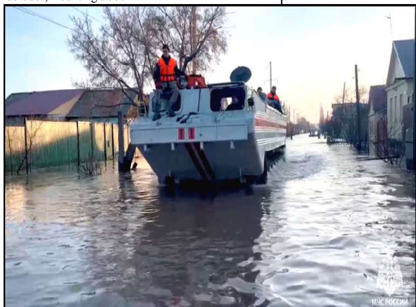
Rescuers search for residents to evacuate as they drive in a flooded residential area in the city of Orsk, Russia.

Footage released by the county fire department on Saturday showed Roger, an eight-year-old Labrador, mounting a boulder