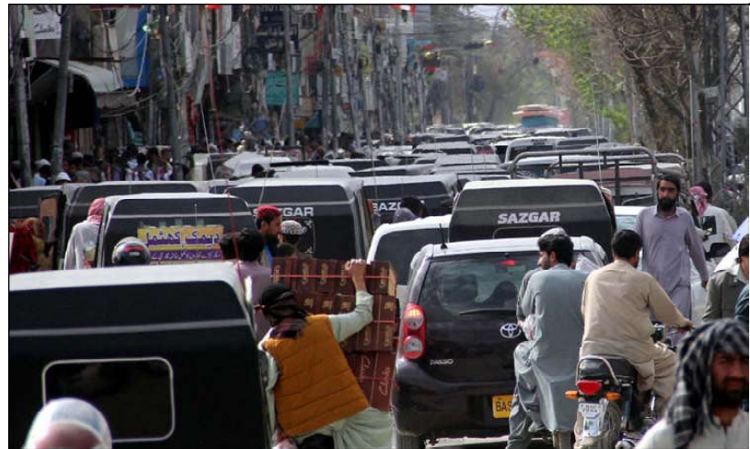
QUETTA: A large number of vehicles stuck in traffic jam at Bacha Khan Chowk while people busy in shopping as they are preparing for the occasion of Eid-ul-Fitar coming ahead, in Quetta.