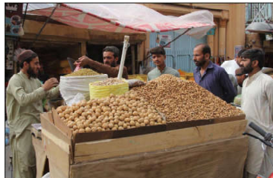
QUETTA: People purchasing dry fruit from Qandhari Bazaar.

warning to business owners dealing with food items, emphasizing the importance of complying with government-set prices or facing severe legal consequences. Appealing to citizens, the team urged them to promptly report any artificial price hikes to the food department and provide evidence of responsible citizenship. They reaffirmed the provincial government's dedication to providing relief to the public by undertaking all necessary measures.