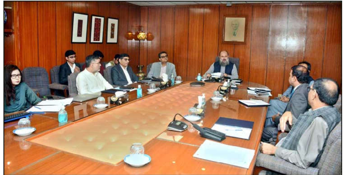
KARACHI: The Federal Minister for Commerce Jam Kamal Khan getting briefing at Trade Development Authority of Pakistan (TDAP).