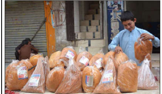
QUETTA: A vendor selling vermicelli.

KARACHI (APP): Shipping activity was reported at the port where three ships, Elephant, Swansea and FSM, scheduled to load/offload Rice, Coal and LPG berthed at Multi-Purpose Terminal, Bulk Terminal and Engro Terminal respectively on Sunday. Meanwhile another ship, Gall carrying Palm oil also arrived at outer anchorage of the port during the same day. A total of ten ships were engaged at PQA berths during the last 24 hours, out of them two ships, Ardmore Cherokee and Al-Khor sailed out to sea on Monday morning and another ship FSM.