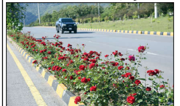
ISLAMABAD: A beautiful view of red rose flowers full blooming on a green belt at 7th Avenue in the Federal Capital.

In Gilgit-Baltistan/Kashmir, rain-wind/thunderstorm with snowfall over high mountains is expected in Gilgit-Baltistan including Diamir, Astore, Ghizer, Skardu, Hunza, Gilgit, Ghanche, Shigar and in Kashmir including Neelum valley, Muzaffarabad, Rawalakot, Poonch, Hattian, Bagh, Haveli, Sudhanoti, Kotli, Bhimber and Mirpur with occasional gaps from April 10-15. Isolated heavy fall and hailstorm is also expected from April 13-15. In Punjab/Islamabad, rain-wind/thunderstorm is expected in Muree, Galiyat, Islamabad/Rawalpindi, Attock, Chakwal on April 10 and then April 12 (evening/night) to April 15 with occasional gaps while Jhelum, Mandi Bahauddin, Gujrat, Gujranwala, Hafizabad, Sialkot, Narowal, Lahore, Kasur, Okara, Faisalabad, Toba Tek Singh, Jhang, Khushab, Sargodha.