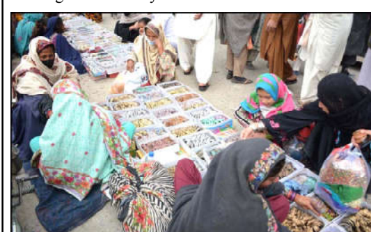
QUETTA: Woman selecting and purchasing bangles for Eid ul Fitr preparation.

ISLAMABAD (INP): The World Bank has approved 149.7 million dollars in financing for two projects in Pakistan, says in media reports. As per details, the funds were okayed to support the projects related to digital economy and improved flood resilience. This has been stated in a statement issued by the international financial institution. The allocated funding of 78 million dollars for the Digital Economy Enhancement Project is expected to enhance financial management through technology-driven solutions and data-driven decision-making. The investment in digital economy is also likely to streamline public services, increase transparency and foster economic growth. Simultaneously, the 71.7 million dollars allocation for Sindh Barrages Improvement Project is likely to ensure greater flood resilience.