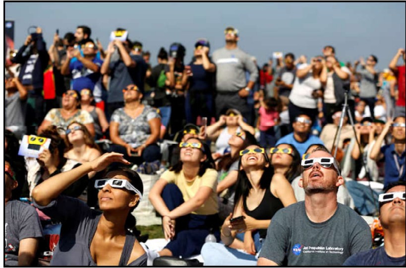
People watch the solar eclipse on the lawn of Griffith Observatory in Los Angeles, California, U.S.

Israeli Prime Minister Benjamin Netanyahu has said the campaign will not stop until Hamas is eliminated, so the bombardment and destruction are expected to continue.