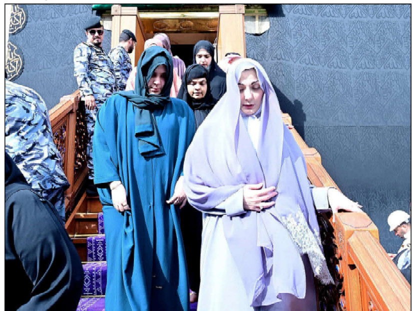
MAKKAH MUKARAMAH: Chief Minister Punjab Maryam Nawaz Sharif coming out of Khana Kaaba