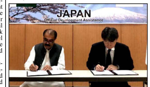
QUETTA: Consul General of Japan and Chairman Kuchlak Welfare Association signing a MoU