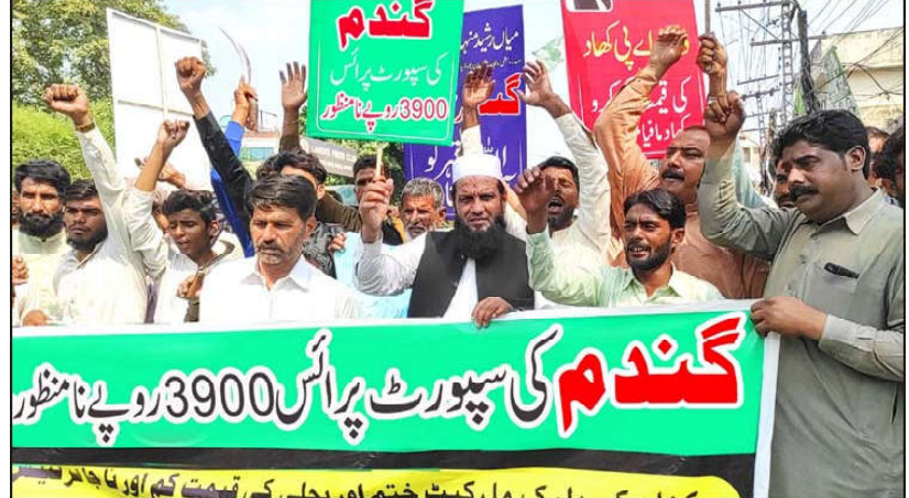
LAHORE: Members of Kissan Board Pakistan are holding protest demonstration against wheat support price, in Lahore.