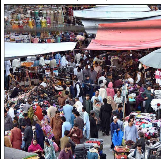
RAWALPINDI: People are busy in shopping for Eid ul Fitr Festival at Baara Market.

MULTAN (APP): Sui Northern Gas Pipelines Limited (SNGPL) punished 12 citizens and imposed a fine Rs 34,000 on illegal use of gas, on Monday. According to officials of Task Force, the alleged outlaws were using gas illegally as they were found making commercial use of gas, offering illegal connections to others and gas theft. The consumers who were involved in illegal activities were punished. A fine amount totaling Rs 34,000 was imposed on them. The department urged citizens to cooperate and informed about illegal use of gas at phone number 0619220085 as secretary would be maintained.