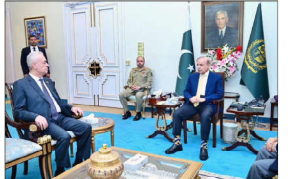
ISLAMABAD: The Ambassador of Palestine Ahmed Jawad A.A. Rabei called on Prime Minister Muhammad Shehbaz Sharif.

UNITED NATION (INP): In an upcoming session scheduled for Friday, the United Nations will address a resolution proposed by Pakistan aimed at banning arms sales to Israel. The draft of this resolution, submitted by Pakistan to the Organization of Islamic Cooperation (OIC) on behalf of 55 member countries of the United Nations, has stirred significant anticipation and debate within the international community. The comprehensive eight-page resolution places forth stringent demands on Israel, calling for an immediate end to its occupation of Palestinian territories and Gaza. One of the key provisions of the resolution is the demand for Israel to cease its illegal blockade on the Gaza Strip. Moreover, the resolution underscores the urgency of preventing the sale or transfer of explosives and other military equipment to Israel, emphasizing the need to curb the proliferation of arms that exacerbates the ongoing conflict in the region. The proposal has garnered widespread support from the majority of OIC member countries, reflecting a collective effort to address the longstanding humanitarian and security concerns stemming from the Israeli-Palestinian conflict. The resolution symbolizes a unified stance against the injustices and violations of international law perpetrated by Israel, particularly in its treatment of the Palestinian population.