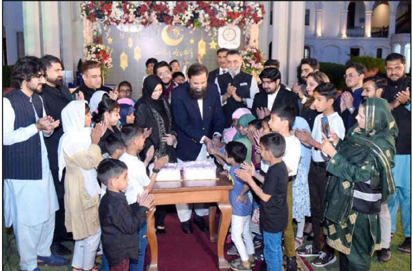
LAHORE: Governor Punjab Muhammad Balighur Rehman cutting the cake during Iftar dinner organized by Pakistan Youth Parliament in honour of children belonging to different Sweet Homes at Governor House Lahore.

The irrigation department should pay special attention to digitize all its affairs, Ali Amin Gandapur told the meeting. Set timelines in contracts for all works department development projects and penalties should be imposed on the contractor in case of non-progress on the contracts within the stipulated timelines, the CM warned.