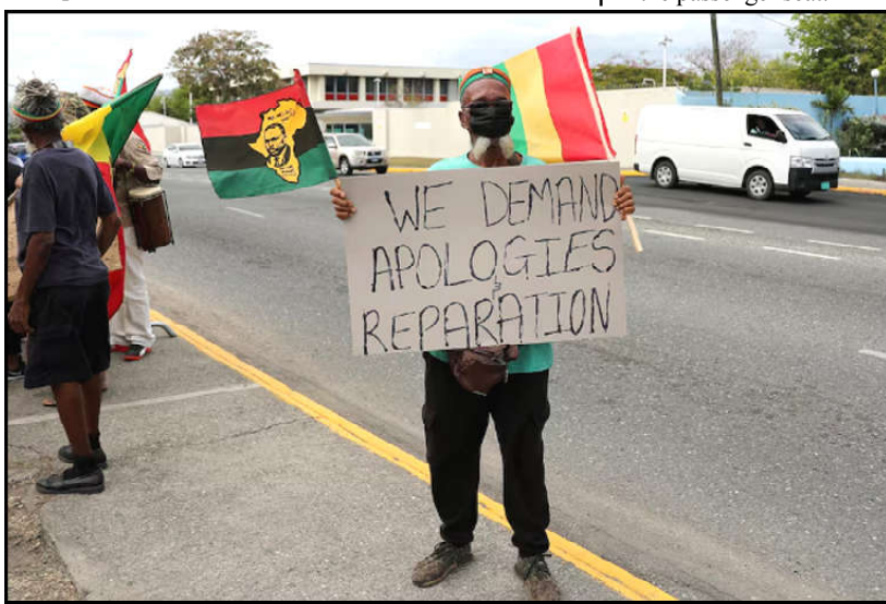
A protester holds a sign during a rally to demand that the United Kingdom make reparations for slavery, ahead of a visit to Jamaica by the Duke and Duchess of Cambridge as part of their tour of the Caribbean, outside the British High Commission, in Kingston, Jamaica.

hours to leave the country, and ordered the closure of the Ethiopian consulates in Somaliland and the semi-autonomous region of Puntland, the foreign ministry said.