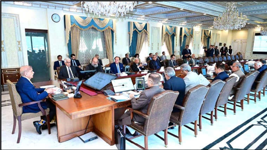
ISLAMABAD: Prime Minister Muhammad Shehbaz Sharif chairs a meeting of the Federal Cabinet.

Ph: 2841470/2841473 REG: No. BC-116 B/ID-445 Vol XXV No. 226, Ramzan 25, 1445 AH Friday April 05, 2024 Pages 08, Price Rs.15