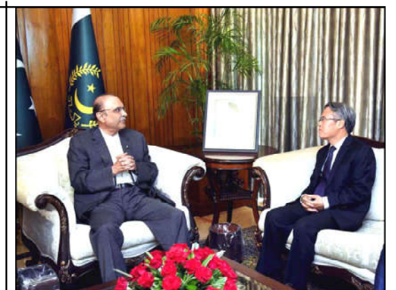
ISLAMABAD: The Ambassador of the People's Republic of China in Pakistan, Mr Jiang Zaidong, calls on President Asif Ali Zardari, at Aiwan-e-Sadr.