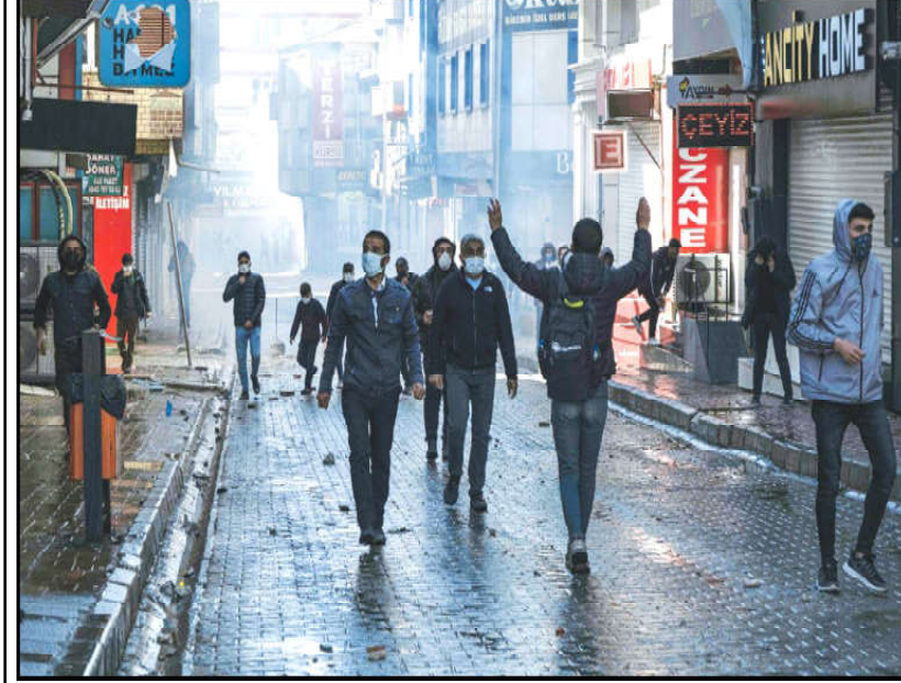
Supporters of a pro-Kurdish party clash with police in Van.

Monitoring Desk JERUSALEM: The Israeli military halted leave for all combat units on Thursday amid concerns of a possible escalation in violence after the killing of Iranian generals in Damascus this week drew threats of retaliation.