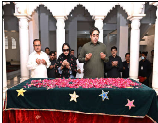
LARKANA: Chairman PPP, Bilawal Bhutto Zardari along with Central President PPP Women Wing MPA Ms. Faryal Talpur and other offering Fataha at the grave of Shaheed Mohtarma Benazir Bhutto at Garhi Khuda Bakhsh.

Sources also indicate that several projects are in the pipeline for Pakistan in Saudi Arabia, underscoring the commitment of both countries to deepen their partnership across various sectors.