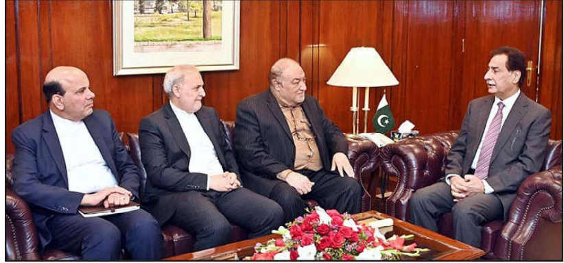
ISLAMABAD: Speaker National Assembly Sardar Ayaz Sadiq in a meeting with Iranian Parliamentary Delegation at Parliament House.