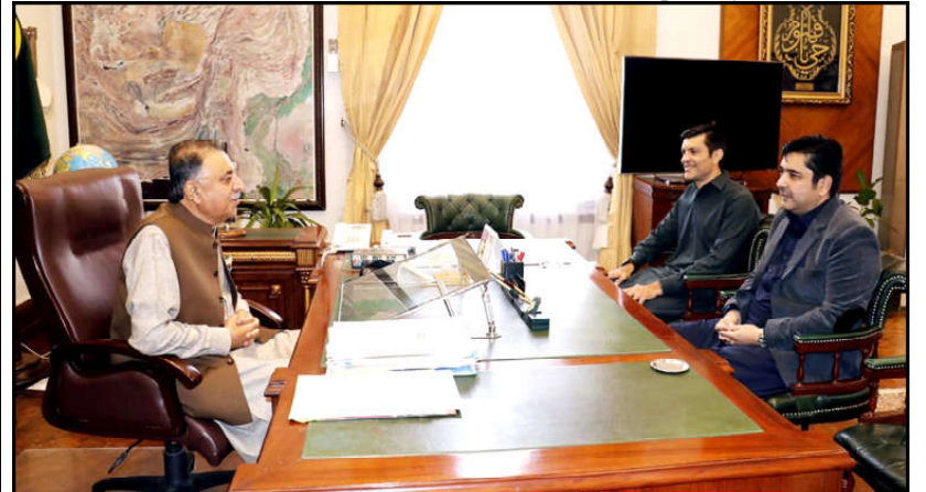
QUETTA: Former caretaker Provincial Minister Yahya Nassar meeting with Governor Balochistan Malik Abdul Wali Khan Kakar

Devastating floods in 2022 — which scientists linked to climate change — that affected more than 30 million people also severely impacted Pakistan's cotton crop that year.