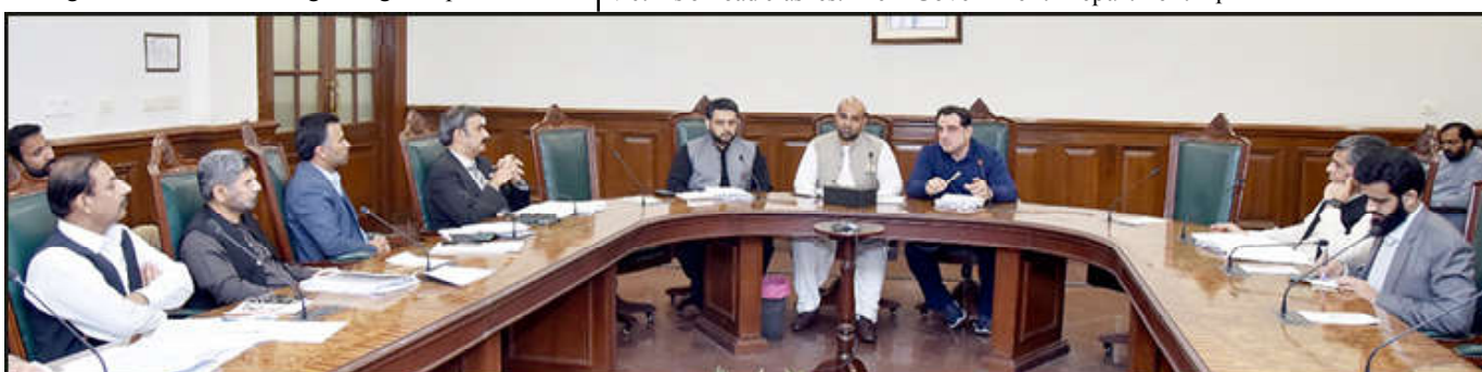
LAHORE: Provincial Minister Bilal Yasin presides over the cabinet committee meeting regarding cheating in Exam and irregularities in ongoing exam process. Provincial Minister for Education Rana Sikandar Hayat and other high ups also present.

Bilal Yasin said that all examination centres that provincial ministers were visiting and the management's reports were contrary to facts and would not work because the undercover teams in the field were bringing out all