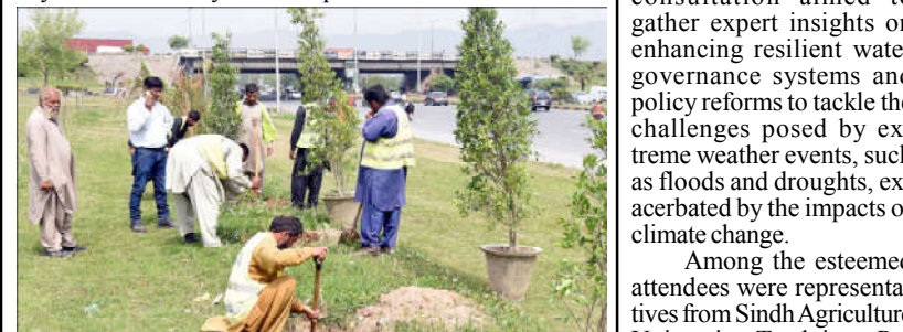
ISLAMABAD: Capital Development Authority (CDA) staff planting the trees on green belt along with expressway in the federal capital.