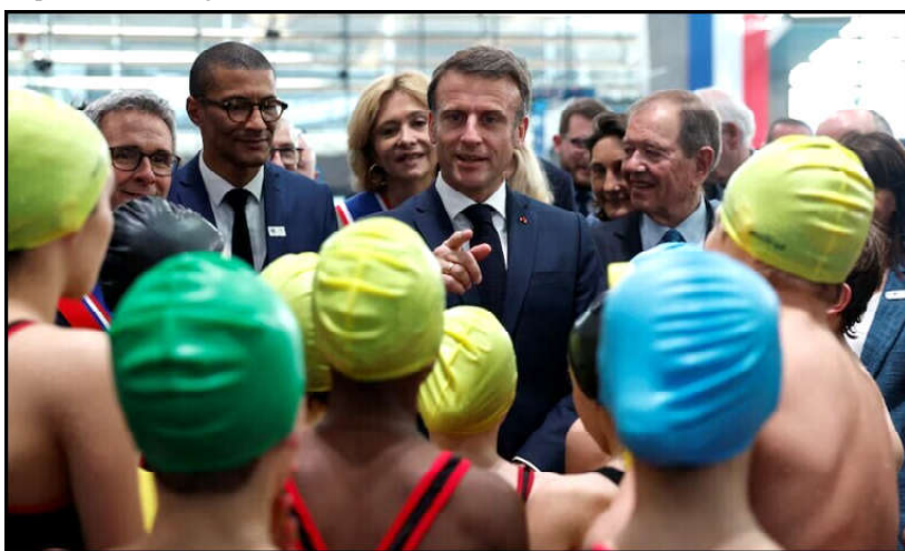
French President Emmanuel Macron talks to children after their swimming performance during the inauguration of the Olympic Aquatics Centre (CAO), a multifunctional venue for the 2024 Paris Olympic Games construction site which is under the management of the "Metropole Grand Paris" in Saint-Denis, near Paris, France.

Ukrainian Foreign Minister Dmytro Kuleba, who met his Nato counterparts there, urged the 32 member states to provide his country with new additional air defence systems, especially US-made Patriot missiles.