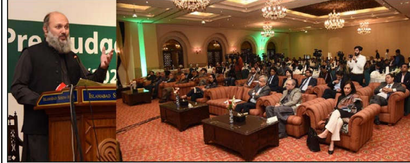
ISLAMABAD: Federal Minister for Commerce Jam Kamal Khan addressing the Pre-Budget Seminar in Islamabad, focusing on tariff rationalization and its implications for trade competitiveness and economic growth.