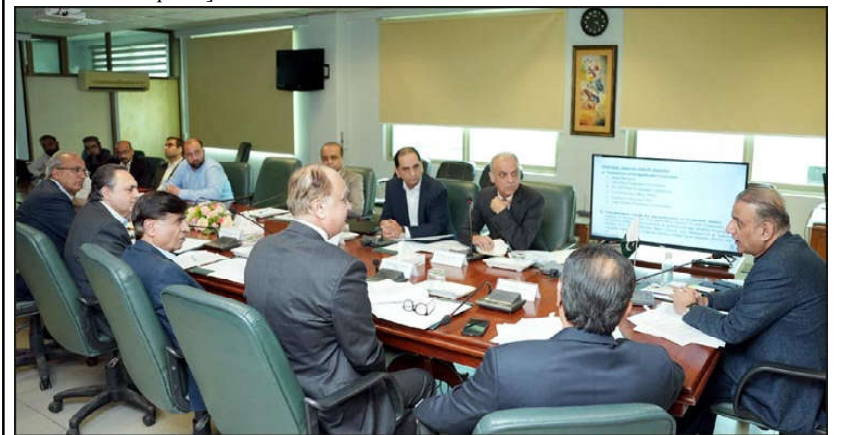
Federal Minister for Privatisation, Abdul Aleem Khan chairing the meeting of Privatisation Commission Board in Islamabad.