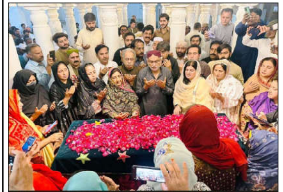
GARHI KHUDA BUX: Leaders and activists of Peoples Party showering rose petals and offer Fateha at the grave of martyred Zulfikar Ali Bhutto, Founder of Peoples Party (PPP), in connection of his 45th Death Anniversary ceremony held at Bhutto Mausoleum in Garhi Khuda Bux.

Governor Punjab said that he is deeply grateful to Sweet Homes, their organizers and staff for providing good care and education to these children. Governor Punjab further said that it is the responsibility of all members of the society to contribute to the care of these children.