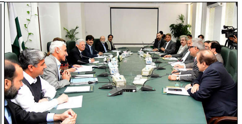
ISLAMABAD: Federal Minister for Industries & Production, Rana Tanveer Hussain chairs a meeting of the Sugar Advisory Board (SAB).