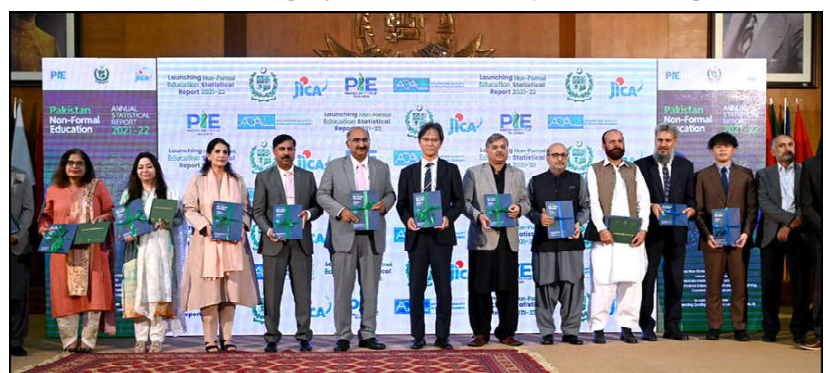
ISLAMABAD: The launching ceremony of Pakistan Non Formal Education Annual Statistical Report 2021-22 jointly organized by Pakistan Institute for Education-PIE, Ministry of Federal Education and Professional Training & JICA-AQAL Project at Allama Iqbal Open University.

ISLAMABAD (APP): A diverse group of experts convened on Thursday for a groundbreaking consultation on community-led Climate Resilient Water Governance Models in Pakistan. Hosted by the International Rescue Committee and National Disaster Risk Management Fund, the consultation aimed to gather expert insights on enhancing resilient water governance systems and policy reforms to tackle the challenges posed by extreme weather events, such as floods and droughts, exacerbated by the impacts of climate change. Among the esteemed attendees were representatives from Sindh Agriculture University, Tandojam, Pakistan Council of Research in Water Resources, Member Planning Commission, voice of local communities into project designs and policy formulations. They stressed the need for active engagement, ensuring water rights awareness, and harnessing local wisdom and indigenous knowledge for project designs. Additionally, clear guidelines for engaging semi-urban/urban segments in water governance systems were discussed, along with the challenges of scalability and gaps in the planning of community-driven initiatives. Foster Financially Viable Solutions and addressing hill torrent and urban flooding was one of the key discourse drivers, participants stressed the need for watershed management, focusing on water safety, research and development.