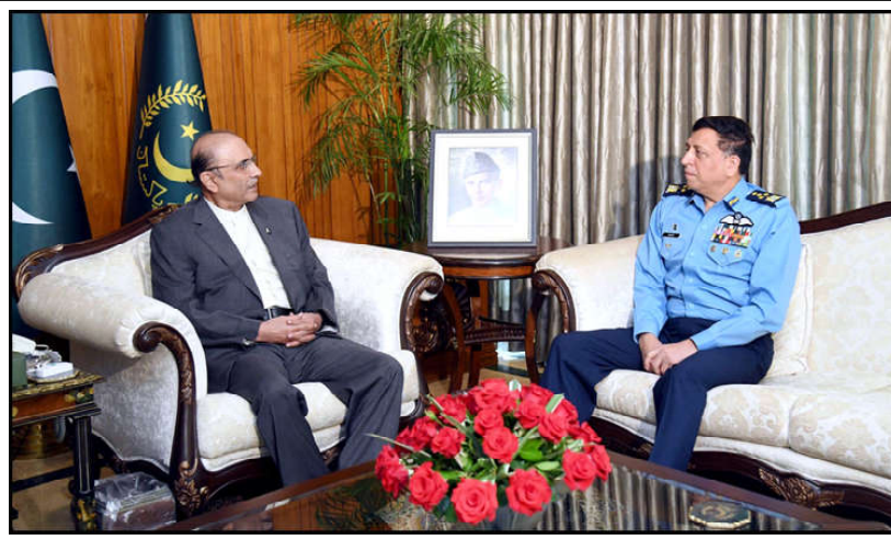
ISLAMABAD: Chief of the Air Staff, Air Chief Marshal Zaheer Ahmed Baber Sidhu, calls on President Asif Ali Zardari, at Aiwan-e-Sadr.

ISLAMABAD (APP): Federal Board of Revenue (FBR) Spokesperson on Thursday said that all unregistered wholesalers, retailers, dealers and all shopkeepers must register by 30 April 2024 under Trader Friendly Scheme. He said that already registered shopkeepers don't need to re-register for the Scheme.