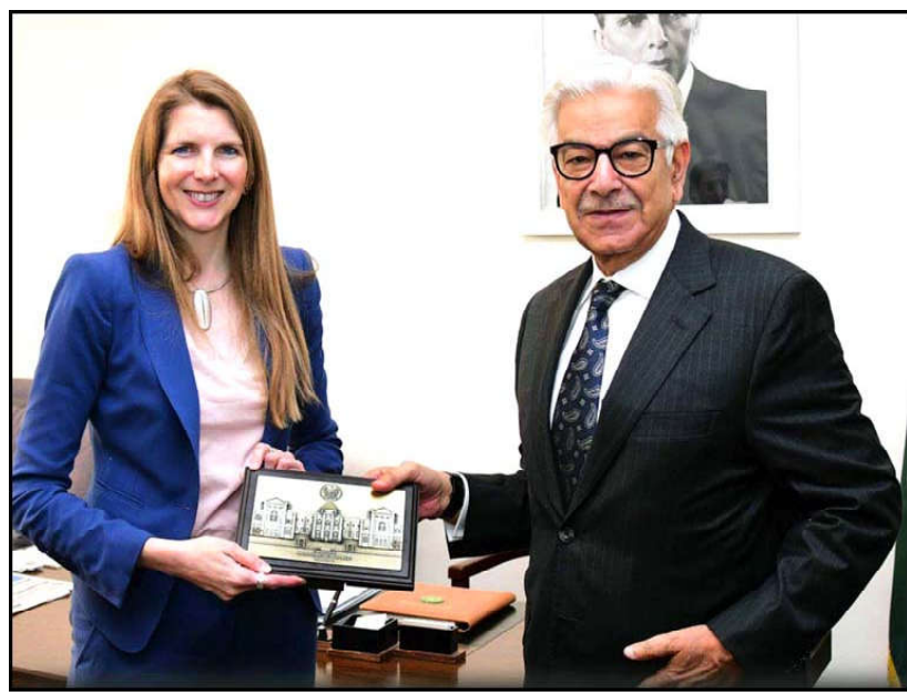
ISLAMABAD: Minister for Defence, Khawaja Muhammad Asif presenting a souvenir to British High Commissioner, Ms. Jane Marriott.

In response to a question regarding APP, the Federal Minister said that a committee has been formed to investigate the recent incident in the APP. Senior officials of the Ministry of Information were investigating the incident. The federal said that the recommendations of the inquiry committee would be followed.