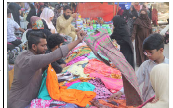
KARACHI: Citizens shopping at Bachat Bazaar in Ramaswami area of Provincial Capital.

He said that taxes cannot be collected by increasing the tax rate. Instead, economic activity will have to be increased, he added. On the occasion, economist Syed Ali Hasnain said that discussing regarding imposing taxes wasn't new and added that taxation was the most regressive in Pakistan.