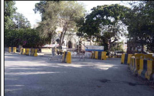
KARACHI: View of illegal blocked outside Sindh Secretariat creating problems for commuters, showing negligence of concerned authorities to draw its attention toward issue, in Karachi.

Saudi minister for finance said that a delegation of Saudi investors would soon visit Pakistan. Pakistan was a priority for their investment and Saudi Arabia would continue to fully cooperate in the fields of agriculture, information technology and energy.