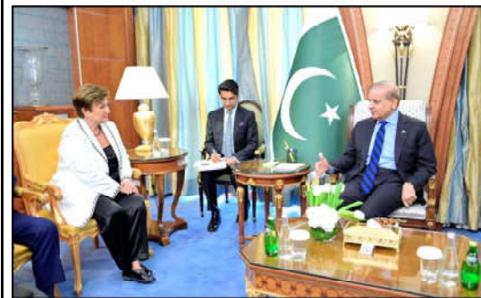
RIYADH: Managing Director of International Monetary Fund calls on Prime Minister Muhammad Shehbaz Sharif on the sidelines of a special meeting of the World Economic Forum.

"Arrested man also made information gathering of a military camp in Nasirabad, Balochistan," DIG-South said. "Several personnel were martyred in the terrorist attack," police officer said.