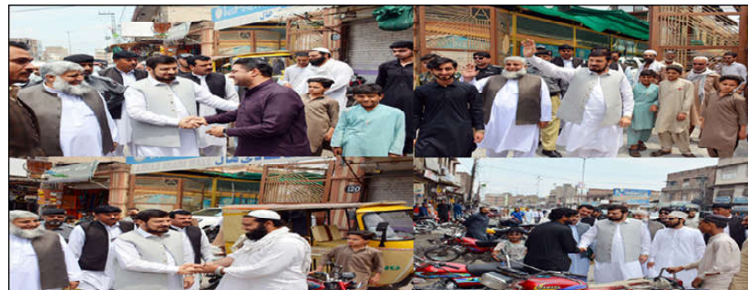
PESHAWAR: Khyber Pakhtunkhwa Governor Haji Gulam Ali meeting with people and shopkeepers during his visit to interior city Peshawar.