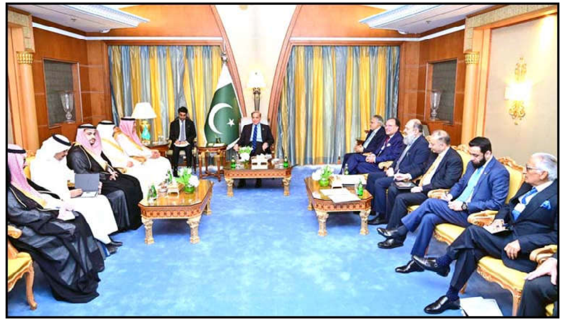
RIYADH: Saudi Minister for Finance H.E. Mohammad Al Jadaan calls on Prime Minister Muhammad Shehbaz Sharif on the sidelines of a Special Meeting of the World Economic Forum.

this regard. The Saudi minister said he was in contact with the Saudi private companies regarding investment in Pakistan and the representatives of these companies would soon visit Pakistan. Collaboration between the private companies of two countries was a priority for his government, he added. While talking to the Saudi ministers, the prime minister thanked Custodian of the Two Holy Mosques, His Majesty King Salman bin Abdulaziz and Crown Prince and Prime Minister Mohammed bin Salman bin Abdulaziz for supporting Pakistan in very difficult time.