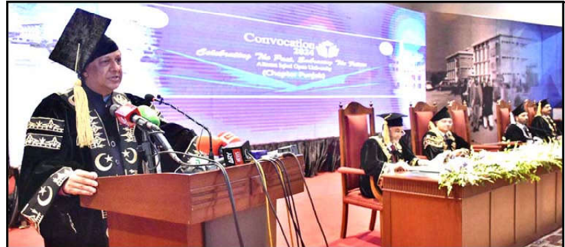
LAHORE: Federal Minister for Law and Justice Senator Azam Nazeer Tarar addressing at 37th Convocation of Allama Iqbal Open University (AIU).