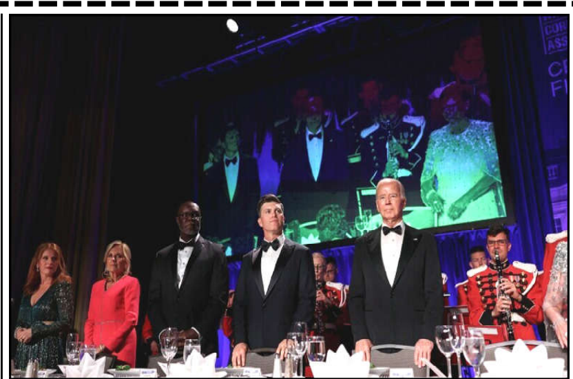
US President Joe Biden, US First Lady Jill Biden, host Colin Jost and Kelly O'Donnell attend the White House Correspondents' Association Dinner in Washington, US.

ery and ribbing of the press, the 81-year-old president took sharp-elbowed jabs at his 77-year-old presumptive November election rival, quipping that "age is the only thing we have in common. My vice president actually endorsed me." Both Jost and Biden struck a more serious tone in addressing what many Americans feel is a politically fraught moment, with Biden telling attendees Trump's rhetoric was a danger particularly after the January 6, 2021 attack on the Capitol, and that "the stakes couldn't be higher."