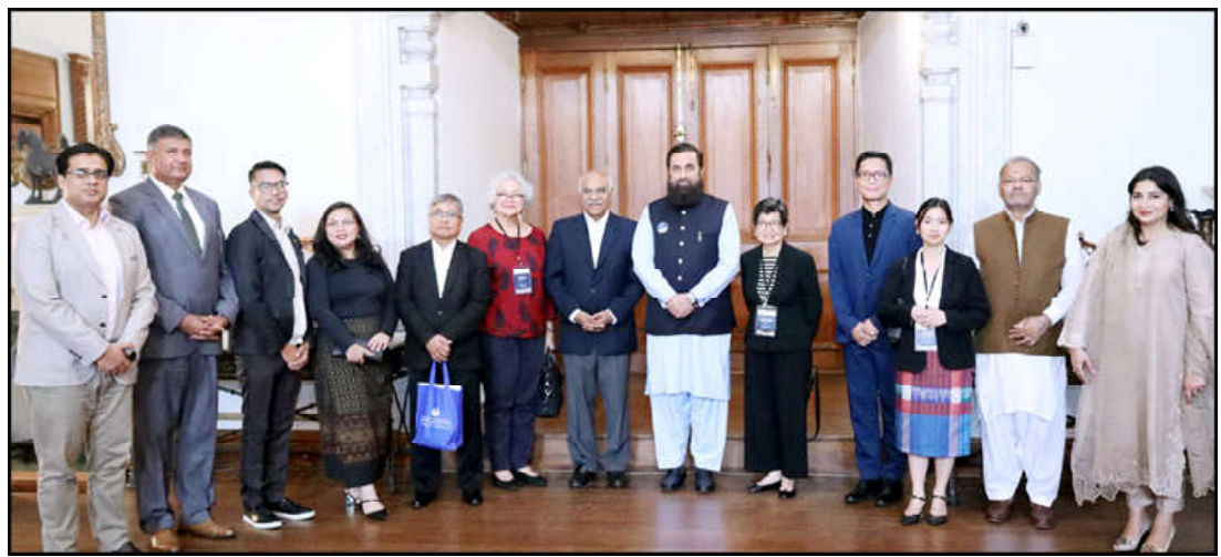
LAHORE: Governor Punjab, Muhammad Balighur Rehman in a group photo with the delegation of Ramon Magsaysay Award Foundation at Governor House.

the government in poverty alleviation and social development. Governor Punjab said that people to people contact is very important in the relations between the two countries. He said that many foreign delegations meet him and tell him that got a different perception about Pakistan from media before visiting, but they found it otherwise.