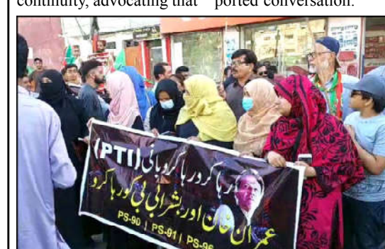
KARACHI: Activists of Tehreek-e-Insaf (PTI) are holding protest demonstration for release of PTI Founder Imran Khan, at Shah Faisal Colony in Karachi.

KARACHI (INP): Over the past week, Sindh police have reported conducting 16 encounters, resulting in the arrest of 18 robbers and 949 suspects. As per the police spokesperson, 141 different types of illegal weapons and 40.49 kg of drugs were recovered from the possession of the accused criminals. The spokesperson further highlighted that a total of 49 stolen motorcycles and one car have been taken into custody from the accused.