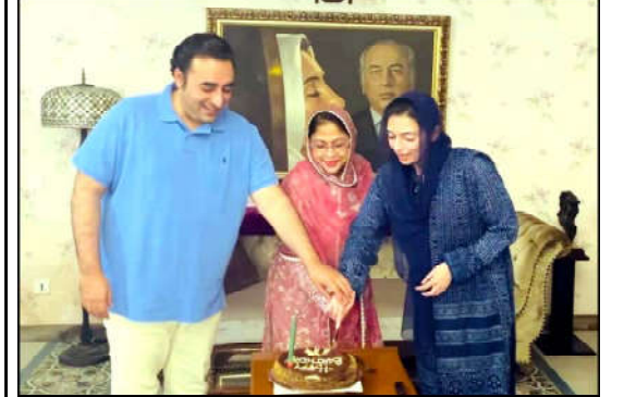
KARACHI: Peoples Party (PPP) Women Wing President, Faryal Talpur cutting her birthday cake along with Bilawal Bhutto Zardari, PPP Chairman and Aseefa Bhutto Zardari, First Lady held at Bilawal House in Karachi.

They cut the cake and wished best days to her ahead.