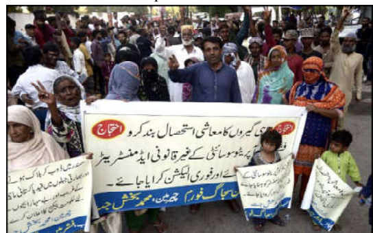
KARACHI: Members of Fishermen Sujag Forum are holding protest demonstration for acceptance of their demands, at Karachi press club.