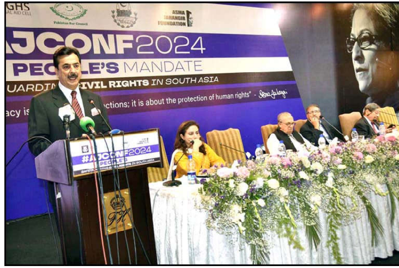
LAHORE: Chairman Senate, Syed Yusuf Raza Gillani addressing to Asma Jahangir conference.

The JUI-F chief claimed that those who fought for power gained it by poll rigging.