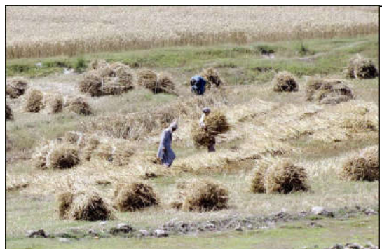
MULTAN: Farmers are busy making bundles after harvesting wheat crop in their field for drying.

He observed that IDB's beneficial partnership with Pakistan was not only providing job opportunities and assisting in reconstruction efforts but also supporting the government's endeavours for achievement of objectives of sustainable progress.