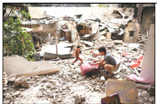
A Palestinian child salvages objects from the debris of a house destroyed by overnight Israeli bombardment in Rafah area of southern Gaza Strip.

put out fires at several energy facilities in the western regions of Lviv and Ivano-Frankivsk, which border Nato members Poland and Romania. After strikes on energy facilities in the central Dnipropetrovsk region, running water supplies were disrupted in President Volodymyr Zelensky's hometown of Kryvyi Rih, officials said. Ukrainian air defences brought down 21 of the 34 incoming missiles, the commander of the air force said in a statement. None of the facilities hit was identified by name, a security measure intended to prevent Russia quickly assessing the impact of its strikes. Russia denies targeting civilians, but says the Ukrainian energy system is a legitimate military target.