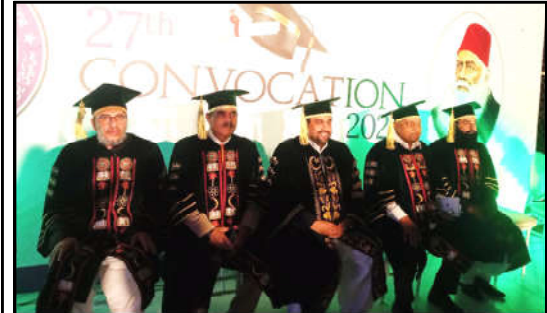
PhD were awarded their degrees. Governor Sindh Muhammad Kamran Tessori was the chief guest at the event.