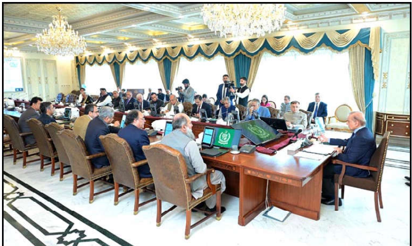
ISLAMABAD: Prime Minister Muhammad Shehbaz Sharif chairs meeting of the Federal Cabinet.

"Let us all reject the negative forces, focus on Pakistan journey to development and stability and forge unity besides putting Pakistan on path to development," he added.