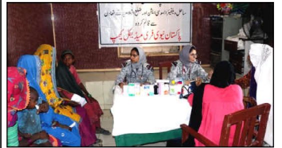
SUJAWAL: Doctors examine patient at free medical camp established by Pakistan Navy at Jangu Jalbani, District Sujawal, Sindh.

KARACHI (APP): The Pakistan Meteorological Department on Friday forecast hot and dry weather in most parts of the Sindh province during the next 24 hours. However, dust raising/gusty winds are expected during afternoon. Mainly, hot and dry weather is likely to prevail in the province.