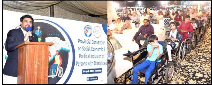
KARACHI: Governor Sindh Kamran Khan Tessori addressing a ceremony held in honour of special persons organized by Disable Welfare Association.