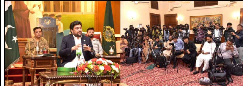
KARACHI: Governor Sindh Kamran Khan Tessori addressing a Press conference regarding starting Rozgar Scheme under Governor Sindh Initiative.

Addressing the convocation, Governor Kamran Tessori said that Sir Syed University was an ideological academic insti-