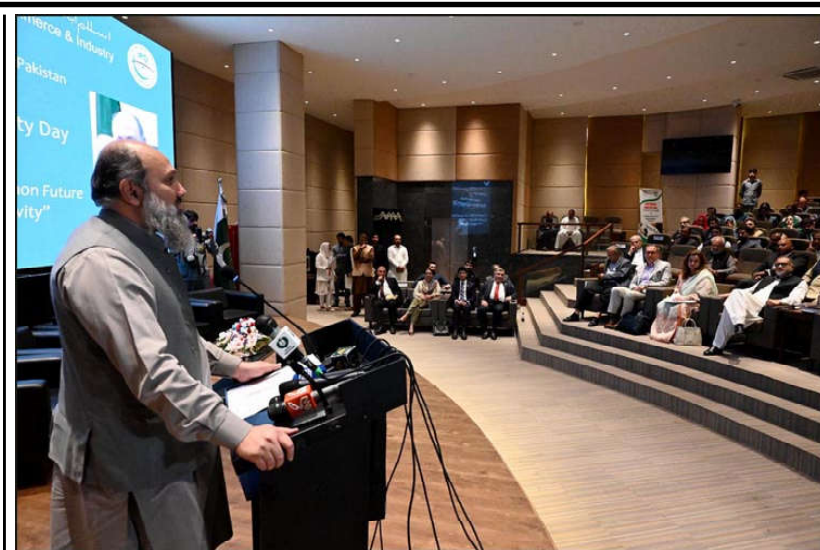
ISLAMABAD: Federal Minister for Commerce, Jam Kamal Khan addressing on the occasion of "World IP Day Seminar 2024" organized by IPO-Pakistan in collaboration with Islamabad Chamber of Commerce & Industry at Islamabad Chamber of Commerce (ICCI).

Nestle Pakistan Limited witnessed a maximum increase of Rs 131.74 per share price, closing at Rs 7,822.61.