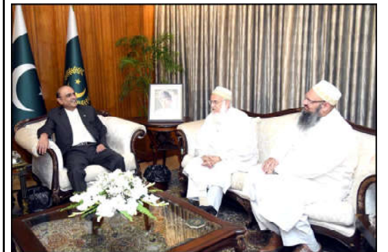
ISLAMABAD: A delegation of Dawoodi Bohra community called on President Asif Ali Zardari, at Aiwan-e-Sadr.

However, he maintained that lot of work needed to be done. The government will perform 'major surgical operation' to get rid of the deep-rooted flaws in the country's economy, he added.