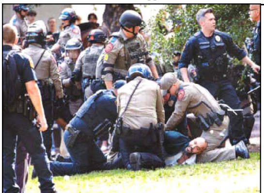
AUSTIN: Law enforcement personnel detain a pro-Palestinian protester at the University of Texas in Austin.

In his speech, he accused the US-led QUAD and AUKUS blocs of trying to reshape the security structure in the Pacific to suit themselves, and said that increasing pressure was being exerted on China over Taiwan.