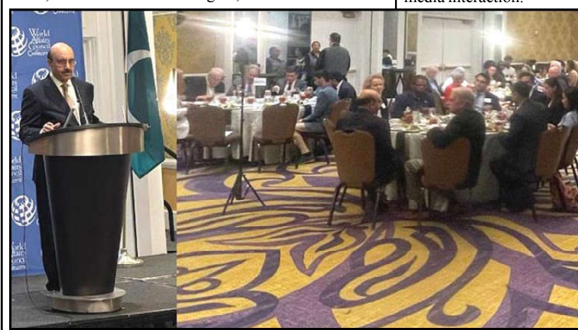
Masood Khan addressing a gathering of scholars, intellectuals and opinion-makers during Ambassador Circle Series organized by World Affairs Council of Charlotte in US state of North Carolina.

WASHINGTON (APP): Pakistan has a "rough" neighbourhood that requires strong defence capabilities, Ambassador Masood Khan said on Wednesday at an event in Charlotte, North Carolina, while hoping that Islamabad's defence ties with the US will continue. "We have had strategic partnerships. We have had peaks and troughs. We had agreements, disagreements. But we have remained steadfast partners throughout these seven and a half decades," the Pakistani envoy told a gathering of scholars, intellectuals and opinion-makers during 'Ambassador Circle Series' organized by World Affairs Council of Charlotte, North Carolina. "And," he added, "we want to continue this partnership." The Council's 'Ambassador Circle Series' provides opportunity for the current and former ambassadors and high-ranking government officials who visit Charlotte to share their insights on diplomatic relationships between the United States and nations around the world. Underlining that the terrorist threat was still potent, the Ambassador said that "it has not disappeared because the United States has come back (from Afghanistan)." "It is a lethal threat not only to Pakistan and Afghanistan, but to United States and its allies in the region, Masood Khan added.