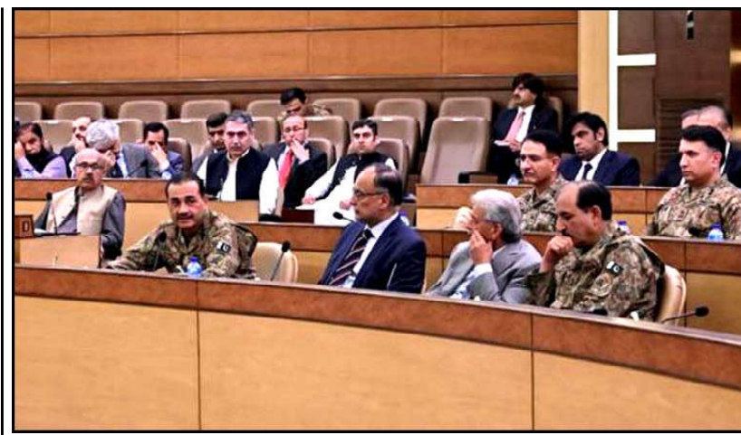
RAWALPINDI: Chief of Army Staff (COAS), General Syed Asim Munir addresses during the Green Pakistan Initiative (GPI) Conference held in Rawalpindi.