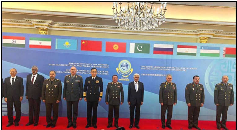
KAZAKHSTAN: Federal Minister for Defence & Defence Production, Khawaja Muhammad Asif in a group photo with Defence Ministers of member states of the Shanghai Cooperation Organization (SCO).

However, the federal government and the State Bank of Pakistan (SBP) are expected to announce a public holiday on May 1.