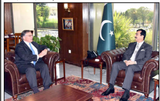
ISLAMABAD: US ambassador Donald bloom met with Chairman Senate Syed Yousaf Raza Gillani at parliament house, in the Federal Capital.

Chairman of China International Development Cooperation Agency (CIDCA), Mr Luo Zhaohui, briefed the president about CIDCA's role in Pakistan's socio-economic development as well as its contributions in the health and education sectors. He also underlined the need to promote tourism and agricultural cooperation between the two countries.