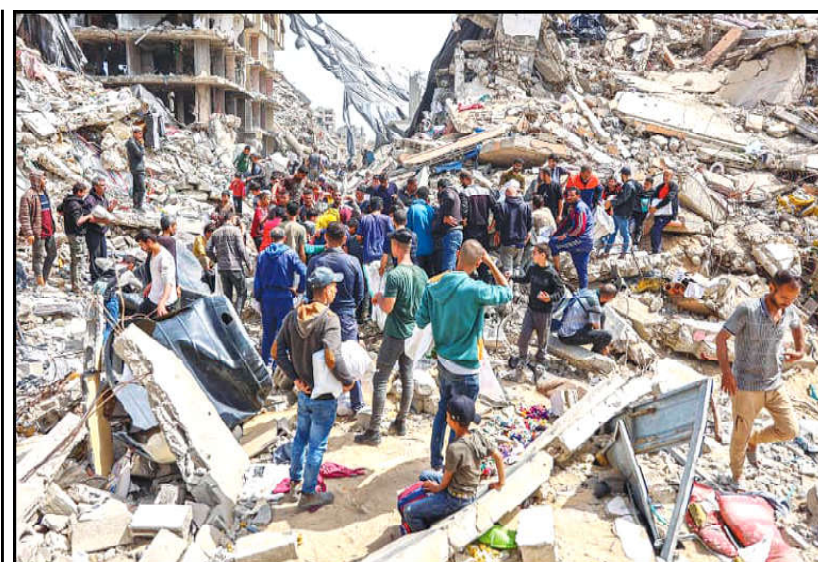
People gather by a destroyed building at the site of a drop of humanitarian aid in the northern Gaza Strip.

The bill, which could trigger the rare step of barring a company from operating in the US market.