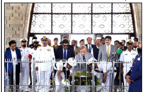
KARACHI: Prime Minister Muhammad Shehbaz Sharif lays down a floral wreath at the Mausoleum of Quaid-e-Azam Muhammad Ali Jinnah during his visit to Karachi.

Earlier, Prime Minister Shehbaz Sharif arrived on a day long visit to Karachi and was received by Sindh Governor Kamran Khan Tessori and Chief Minister Syed Murad Ali Shah at Karachi Airport.