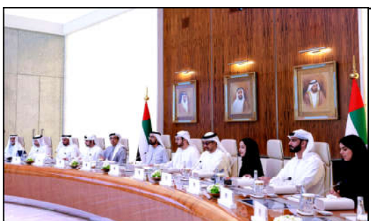
United Arab Emirates announced $544 million to repair the homes of Emirati families in a cabinet meeting.

Two Russian S-300 missiles struck Kharkiv, Ukraine's second-largest city near the border with Russia, during the night, injuring six people, and another two hit the Kharkiv region town of Zolochiv where no casualties were reported, local officials said.