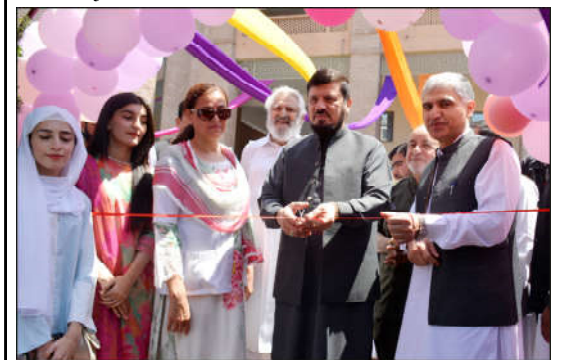
PESHAWAR: Governor Khyber Pakhtunkhwa Haji Ghulam Ali inaugurates Blossom Festa Fun Fair during his visit to Khyber Girls Medical College.

He also invited the students of Khyber Girls Medical College to visit the Governor House.