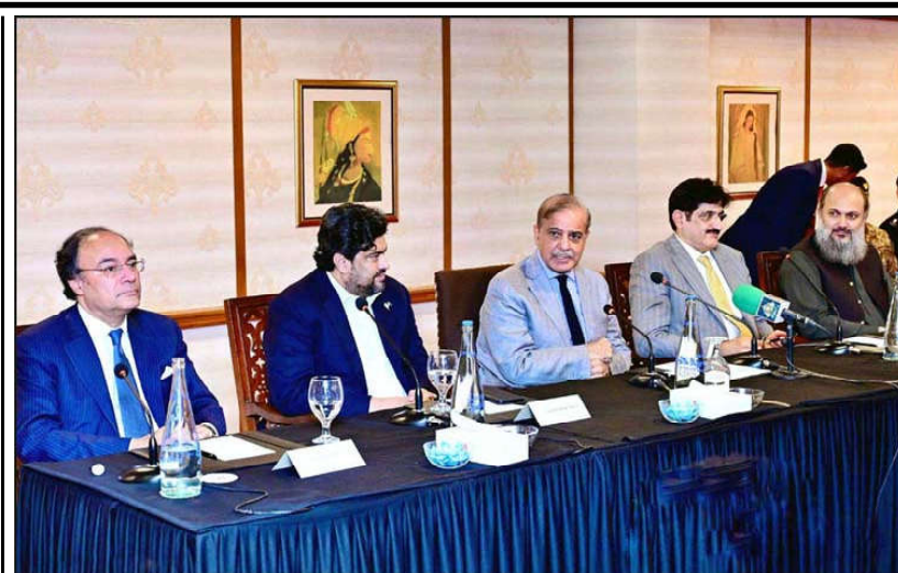
KARACHI: Prime Minister Muhammad Shehbaz Sharif addressing business community during his visit to Karachi.

There was no change in the price Emirates Dirham as it closed at Rs75.79, and the Saudi Riyal increased by 01 paise to at Rs74.22.