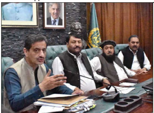
GILGIT: Provincial Minister Gilgit-Baltistan addressing a press conference after cabinet meeting at CM Secretariat.