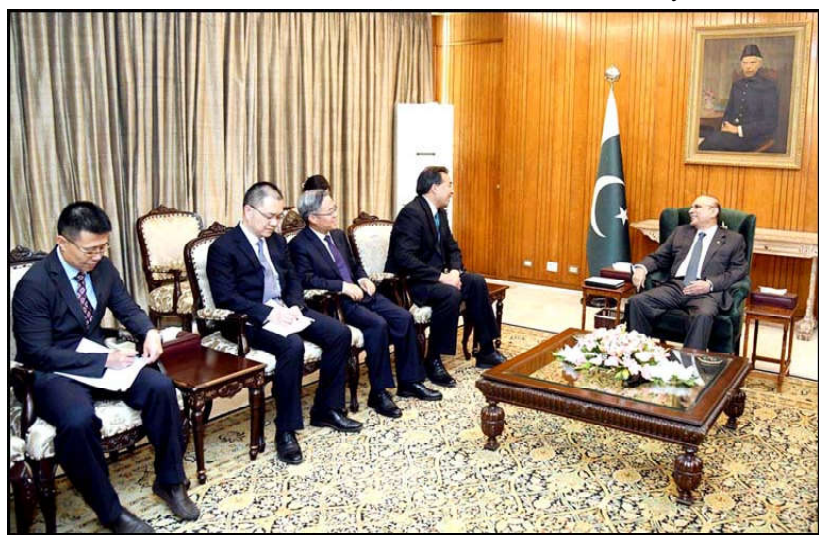
ISLAMABAD: Chairman of China International Development Cooperation Agency, Luo Zhaohui, along with his delegation call on President Asif Ali Zardari, at Aiwan-e-Sadr.

Shehbaz Sharif mentioned his camaraderie developed with CM Murad Ali Shah and said that in case of any problem, they talked and sorted out things immediately.