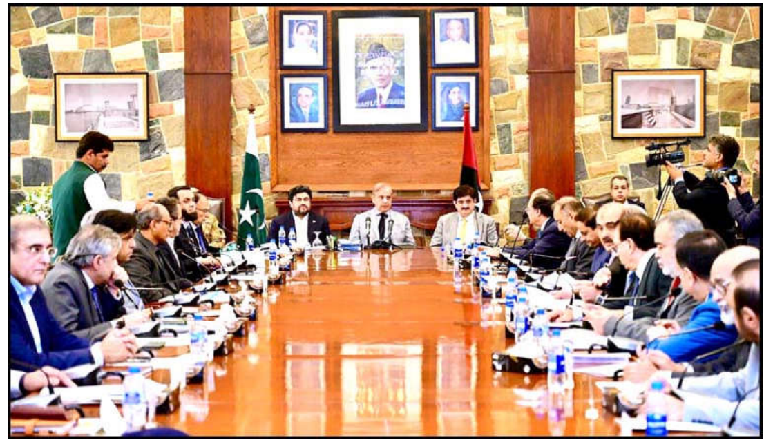
KARACHI: Prime Minister Muhammad Shehbaz Sharif chairs a meeting of the Karachi Chamber of Commerce in CM House.