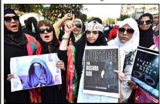
KARACHI: Activists of PTI women wing hold protest.

He also highlighted the flourishing gaming industry in Pakistan and called for enhanced cooperation in the digital sector.