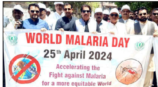
HYDERABAD: DHO and Health workers hold a rally on the eve of World Malaria Day.