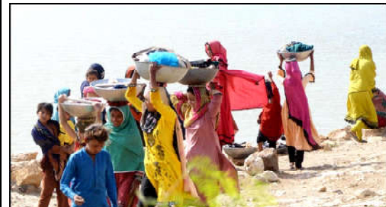
HYDERABAD: Gypsy women carrying clothes on their way to Latifabad bund to wash.