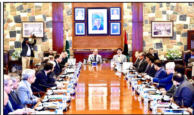
KARACHI: Prime Minister Muhammad Shehbaz Sharif chairs a briefing regarding various developmental projects of the Sindh Government.

Police said two passersby were among those who received bullet injuries and died while another man was critically injured.