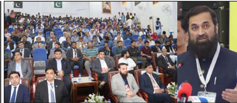
LAHORE: Governor Punjab Muhammad Balighur Rehman addressing the opening session of the International Climate Change Conference organized by a private university in Sialkot.