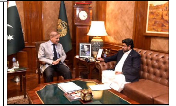
KARACHI: Prime Minister Muhammad Shehbaz Sharif met with Sindh Governor Kamran Khan Tessori at governor house.

ISLAMABAD (INP): Defence Minister Khawaja Asif has said Pakistan is willing to enjoy cordial relationship with the neighbouring countries including India. Talking to media on Wednesday, the defence minister said Taliban defeated the colonial powers without modern equipment which was a fact praiseworthy. "Pakistan's relations with Afghanistan are not ideal this time and we need to work on improving ties with them," he said. The federal minister said the US should ban Israel instead of Pakistan. "Israel has committed genocide in Gaza which is continuing unabated," he reiterated.