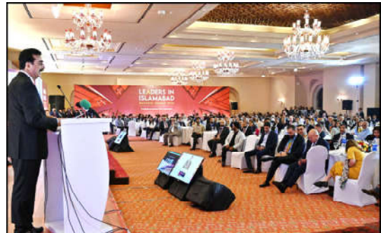
ISLAMABAD: Chairman Senate Syed Yusuf Raza Gilani addressing during Leaders in Islamabad Business Summit 2024 collaborating for Growth.

He further said Pakistan wanted to take benefit of the capacity of the UK's education sector.