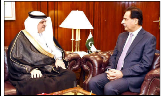
ISLAMABAD: Ambassador of Saudi Arabia Nawaf Bin Saeed Ahmed Al-Malkiy called on Speaker National Assembly Sardar Ayaz Sadiq at Parliament House.

Referring to parliament-to-parliament relations, Ayaz Sadiq emphasized that parliamentary diplomacy was of utmost importance to strengthen bilateral relations.