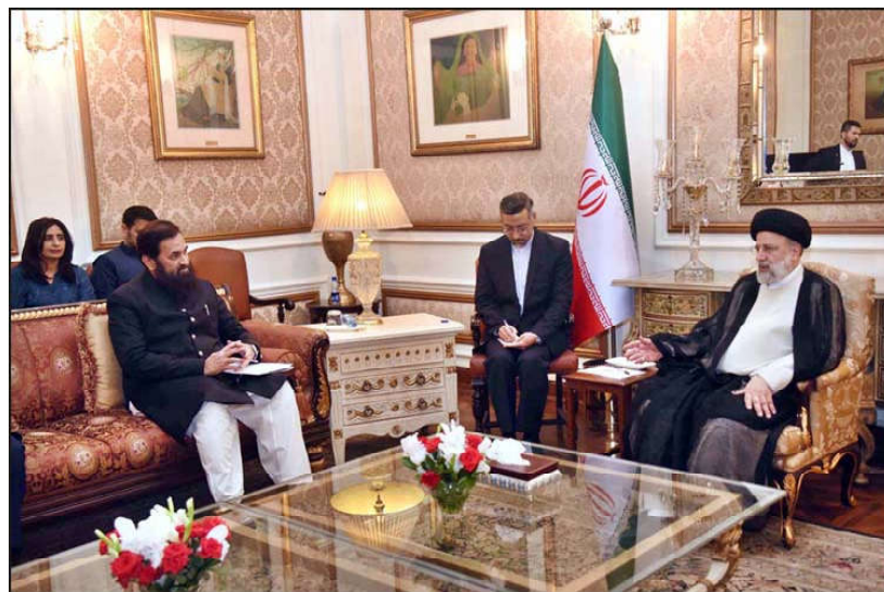
LAHORE: Punjab Governor, Muhammad Balighur Rahman meets with President of the Islamic Republic of Iran Dr. Seyyed Ebrahim Raisi at Governor House.