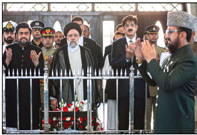
KARACHI: Iranian President Dr. Seyyed Ebrahim Raisi along with others paying homage to Quaid-e-Azam Muhammad Ali Jinnah during ceremony held at Jinnah Mausoleum in Karachi.

A ceremony was held in which an honorary doctorate was awarded to the Iranian president by Gov-