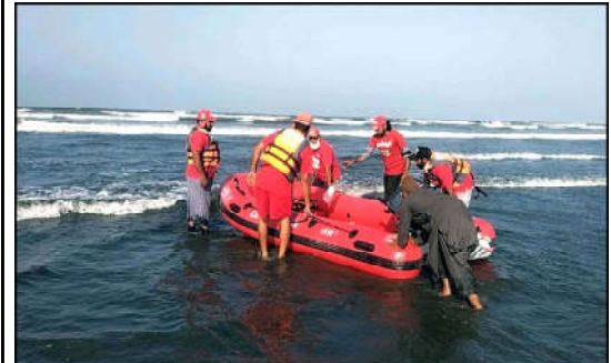
KARACHI: Edhi Marine Services team is busy in rescue operation after the report of a man jumping into the sea, in Karachi.

He said that Pakistan and Iran should work together to clear the border areas of terrorists and build border markets and border trade.