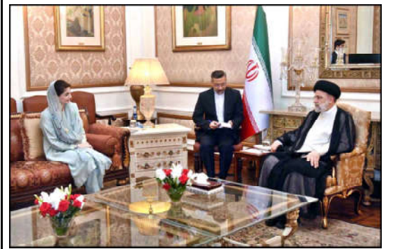
LAHORE: Chief Minister of Punjab, Maryam Nawaz meets with President of the Islamic Republic of Iran Dr. Seyyed Ebrahim Raisi at Governor House.

Referring to the Pakistan friendship spanned over decades, the chief minister said that her government wished to carry out economic projects to alleviate poverty.