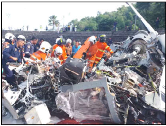
Emergency personnel work at the site of a helicopter crash in Lumut, Perak, Malaysia.

"We call on Germany to desist from exploiting the espionage accusation to politically manipulate the image of China and defame China," a spokesperson for the embassy said in an emailed statement.