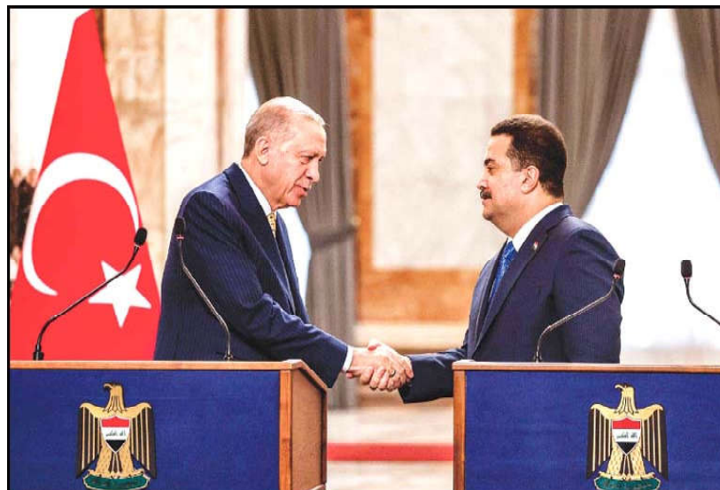
Iraq's Prime Minister Mohammed Shia al-Sudani and Turkish President Recep Tayyip Erdogan shake hands after a joint statement to the media.

The PKK took up arms against the Turkish state in 1984 and is designated a terrorist organisation by Ankara and its Western allies. Turkiye has conducted a series of cross-border operations against the group in northern Iraq since 2019.