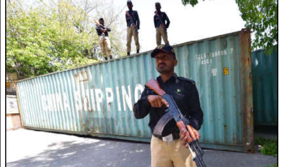
KARACHI: A view of closed road due rot arrival of Iranian President in provincial capital.