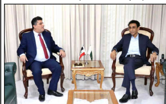
ISLAMABAD: Syrian Ambassador to Pakistan Ramiz Al-Rai called on Federal Minister for Education Dr. Khalid Maqbool Siddiqui.

No secret talks of PTI founder are taking place with any one, he said adding whenever talks are held and a message comes we will inform openly.