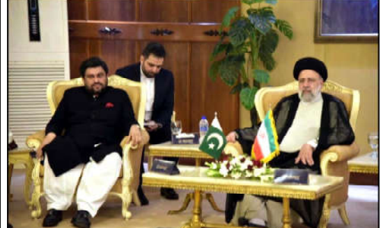
KARACHI: Governor Sindh, Kamran Tessori exchanging views with Dr. Syed Ebrahim Raisi, Iranian President during meeting held at Governor House in Karachi.

He also addressed environmental challenges, advocating for sustainable practices and public awareness to mitigate climate change impacts. He highlighted the significance of social welfare programs like the Benazir Income Support Program and stressed the need for efficient resource utilization in social safety-net initiatives.