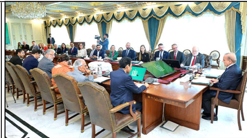
ISLAMABAD: A delegation of representatives of the leading universities of United Kingdom calls on Prime Minister Muhammad Shehbaz Sharif.

In response, Federal Minister for Finance and Revenue Muhammad Aurangzeb said that federal government is committed to implementing minimum wages in the capital and its affiliated departments.