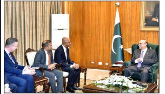
ISLAMABAD: A delegation of Air Asia Aviation Group (AAAG) called on President Asif Ali Zardari at Aiwan-i-Sadr.

The delegation apprised the president of the AAAG and its flight operations.