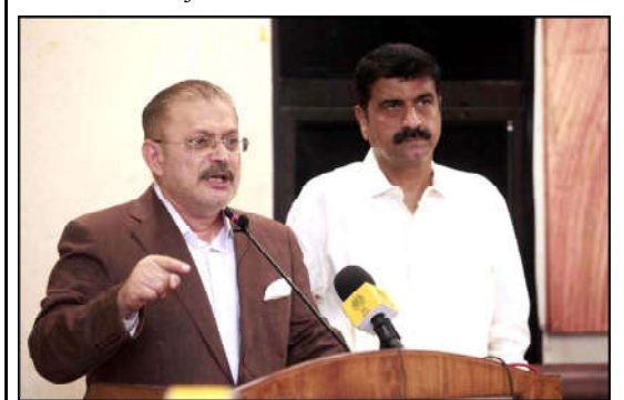
KARACHI: Sindh Minister for Excise and Taxation, Transport, and Mass Transit, Sharjeel Inam Memon addresses to media persons during Meet the Press Programme, held at Karachi press club.

He said that Imran Khan offered General Bajwa a lifetime extension, urging him to prevent the success of the no-confidence motion.