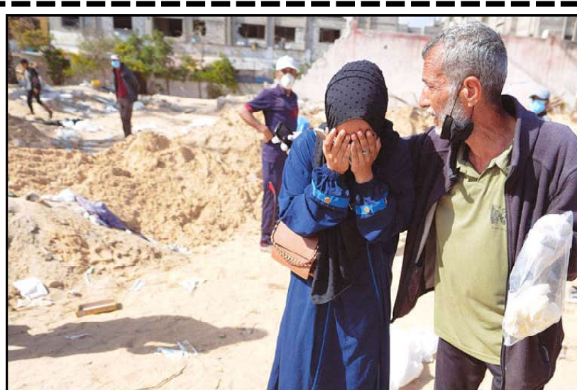
A grieving woman is consoled by a man after the body of her relative was discovered, buried by Israeli forces in a mass grave in the Nasser hospital compound in Khan Younis.

Greece will create two marine parks for the protection of sea mammals and birds — one in the Ionian Sea in western Greece and one in the central Aegean — has angered Turkey. Omer Celik, spokesman for Erdogan's ruling party, said last week that Ankara considers the creation of the marine parks "a step that sabotages the normalization process" in relations, and said Turkey would "in no way allow actions toward the declaration of marine parks in the Aegean Sea." Mitsotakis, speaking last week after a meeting of European leaders in Brussels, expressed surprise at what he described as "Turkey's totally unjustified reaction to an initiative which at the end of the day is of an environmental nature."