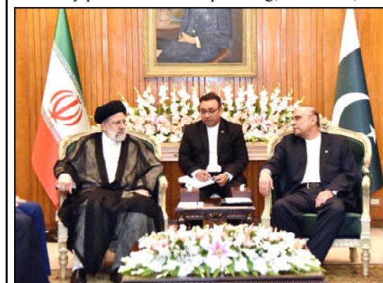
ISLAMABAD: President Asif Ali Zardari and the Iranian President, Dr. Seyyed Ebrahim Raisi, held a meeting, at Aiwan-e-Sadr.

A pilot project should be started with 4,000 devices. The IG police reported that the Rules have been drafted and Standard Operating Procedures (SOPs) are being formulated. The meeting was informed that 67 Investigation Officers have been assigned to cases of robbery with murder, robbery, and injury.