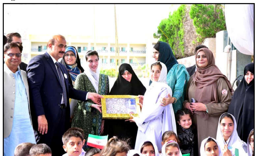
ISLAMABAD: H.E. Dr. Jamileh Alamolhoda, wife of the Honourable President of the Islamic Republic of Iran paid a visit to Pakistan Sweet Home orphanage for abandoned children across the country providing basic necessities of life including education and shelter.