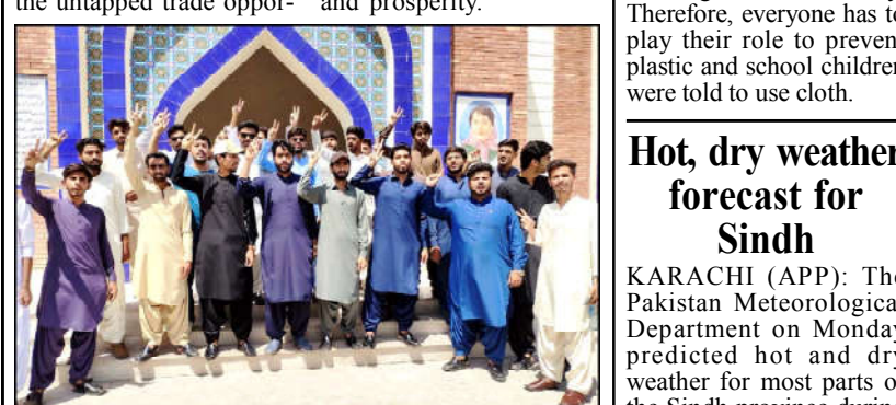
LARKANA: Students of University of Larkana are holding protest demonstration against the headedness of Head of Department (HOD) English Subject, at University premises in Larkana.

KARACHI (INP): The Mari Petroleum Company Limited (MPCL) on Monday announced new discovery of hydrocarbon deposits in Sindh's Daharki area. The new find, resulting from exploratory efforts at Shawal-1 well, drilled in Mari Development & Production Lease (D&PL), the exploration firm informed the stock market on Monday. According to the filing, Shawal-1 well was spud-in on January 27, 2024, and successfully drilled down to a total depth of 1,136 meters. During testing, the well produced 1,040 barrels of crude oil along with 2.5 million standard cubic feet per day (MMSCFD) of associated gas at wellhead flowing pressure (WHFP) of 953 pounds per square inch (Psi) at 32/64 inch choke size.