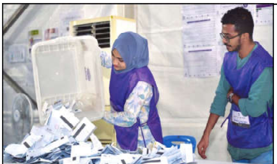
Officials count votes during the parliamentary elections, at a polling station in Maldives's capital Male.

during an Israeli raid on a refugee camp in the occupied West Bank. The Israeli army said it killed 10 people during the operation at Nur Shams camp. "Inside the Nasser Medical Complex there are mass graves dug by the Israeli occupation... we were shocked by the presence of bodies of 50 martyrs in one of the pits yesterday," said Mahmud Bassal, spokesman for the Gaza civil defence agency. "We are continuing the search operation today and are waiting for all graves to be exhumed in order to give a final number of martyrs." He said some of those killed had been tortured. "There were no clothes on some bodies, which certainly indicates (the victims) faced torture and abuse," Mr Bassal said.