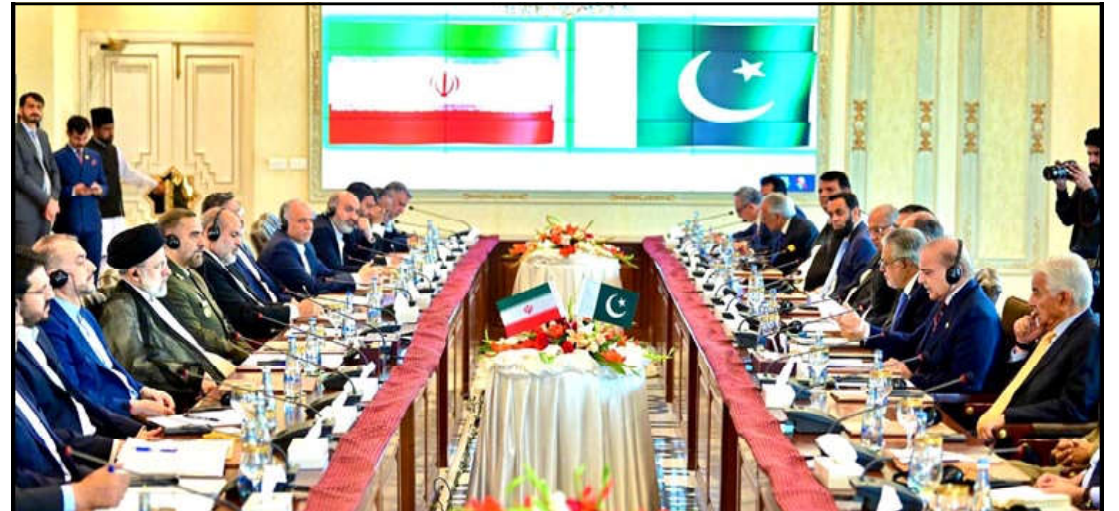
ISLAMABAD: Prime Minister Muhammad Shehbaz Sharif and Iranian President H.E. Dr. Seyyed Ebrahim Raisi in a delegation level talks between Iran and Pakistan.

who arrived here on Monday on three-day official visit to Pakistan along with a high-powered delegation, said that the trade volume between the two brotherly countries was not below the existing potential and they wanted to increase the volume to US $10 billion annually.