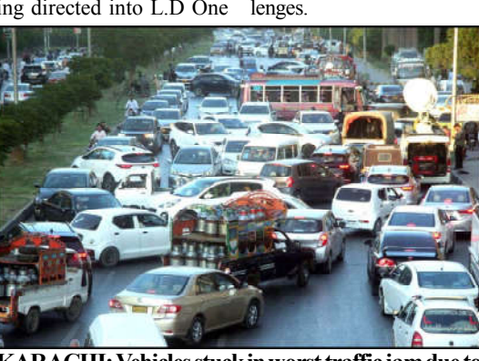
KARACHI: Vehicles stuck in worst traffic jam due to PTI rally on Shahra-e-Faisal, in the Provincial Capital.

systems, incapable of handling the demands of the burgeoning population, necessitate the construction of modern pumping sta-