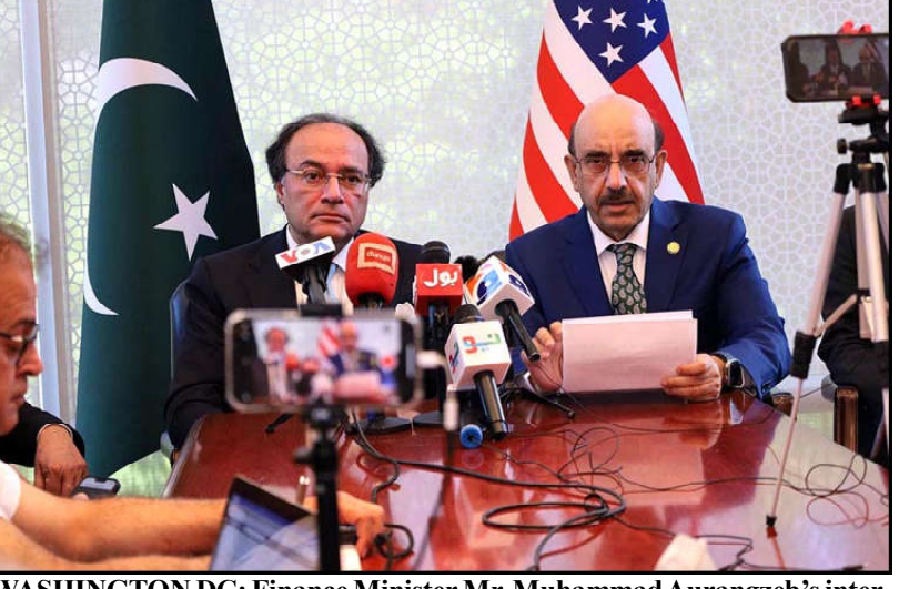
WASHINGTON DC: Finance Minister Mr. Muhammad Aurangzeb's inter action with Pakistani media at Pakistan Embassy.