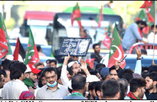
KARACHI: Supporters of PTI take part in a rally

The polling will continue till five in the evening without any break.