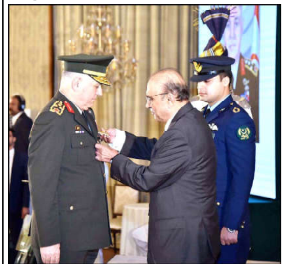
ISLAMABAD: President Asif Ali Zardari conferring the award of Nishan-i-Imtiaz (Military) upon the Chief of Turkish General Staff, Republic of Turkiye, General Metin Gurak in recognition of his services in strengthening defence relations between Pakistan and Turkiye at Aiwan-e-Sadr.

Welcoming the delegation, the president said that Pakistan was committed to further deepening mutually beneficial cooperation with Turkiye in all areas of common interest.