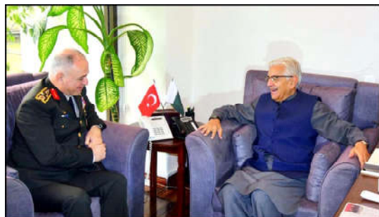
ISLAMABAD: Chief of the Turkish General Staff, General Metin Gurak called on Minister for Defence & Defence Production, Khawaja Muhammad Asif.

He remarked that President Asif Ali Zardari strengthened the federation by championing the slogan of "Pakistan Khappe."