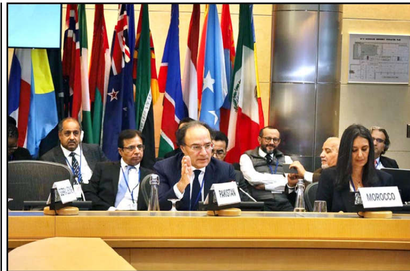
WASHINGTON: Finance Minister, Muhammad Aurangzeb attending the "Roundtable on Implementing for Faster Results and Greater Impact" organized by the World Bank.

lines of IMF and World Bank Spring meetings in Washington. During the meeting, the finance minister briefed them about key economic indicators and how macro-economic stabilization has been achieved after entering into Stand-by Arrangement with the IMF. Aurangzeb highlighted key priorities of the government around tax reforms, energy sector reforms and privatization agenda. He said the government wanted to tap international capital markets with a focus on Middle East and China. He also addressed key questions related to inflation, level of foreign exchange reserves, debt repayments, external account vulnerability and domestic liquidity.