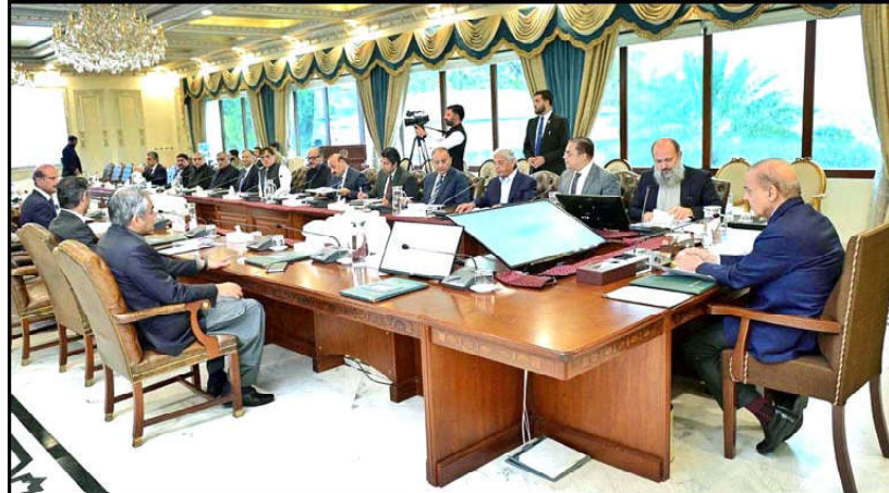
ISLAMABAD: Prime Minister Muhammad Shehbaz Sharif chairs a meeting regarding country wide Anti-smuggling drive.

It was told that, after consultation with the stakeholders, a national anti-smuggling strategy was in final stage which would be presented for approval.