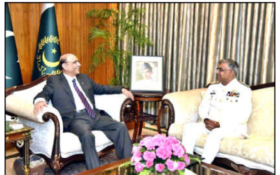
ISLAMABAD: Chief of the Naval Staff, Admiral Naveed Ashraf called on President Asif Ali Zardari at Aiwan-e-Sadr.

The banking ombudsman while giving briefing to the president highlighted the role and performance of the Banking Mohtasib for the expeditious redressal of grievances of the banking customers who had been deprived of their hard-earned money and life-savings by fraudsters. He further informed that BMP had recently introduced a user-friendly system of online portal, making it easier for complainants to register their grievances. President Zardari highlighting the significance of providing expeditious justice to fraud victims said that the banking Mohtasib, as an institution, played an important role in delivering free-of-cost justice to people and promoting good governance. He stressed the need to keep pace with technological advancements to expeditiously dispose of complaints.