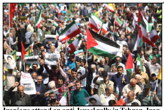
Iranians attend an anti-Israel rally in Tehran, Iran.

Monitoring Desk TEHRAN: Explosions echoed the Iranian city of Isfahan on Friday in what sources described as an Israeli attack, but Tehran played down the incident and indicated it had no plans for retaliation — a response that appeared gauged towards averting region-wide war. Israel had previously warned it would hit back after Iran fired hundreds of missiles and drones at Israel almost a week ago, in retaliation for a deadly strike — which Tehran blamed on its foe — that levelled Iran's consular annex at its embassy in Syria. While most of the Iranian strikes were intercepted, fears of a major regional spillover from Israel's Gaza offensive have since soared. The limited scale of the attack and Iran's muted response both appeared to signal a successful effort by worldwide diplomats who have been working round the clock to avert all-out war since the Iranian move last weekend. Iranian media and officials described a small number of explosions, which they said resulted from Israel's air defences hitting three drones over the city of Isfahan. Notably, they referred to the incident as an attack by "infiltrators", rather than by Israel, obviating the need for retaliation. A senior Iranian official told Reuters there were no plans to respond against Israel for the incident. "The foreign source of the incident has not been confirmed. We have not received any external attack, and the discussion leans more towards infiltration than attack," the official said.