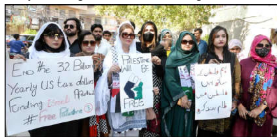
HYDERABAD: Members of Civil Society hold a protest against Israeli aggression in Gaza.

The agenda included formation of committees to improve the efficiency of all departments of the municipal corporation, providing mosquito spray machines to every Unit committee, setting up 'Bachat' bazars to provide relief to the citizens, eliminating traffic congestion and repairing of roads in Lahori Mahalla, setting up public washrooms in markets, distributing sewing machines to poor women. The agenda was unanimously approved by all the council members.