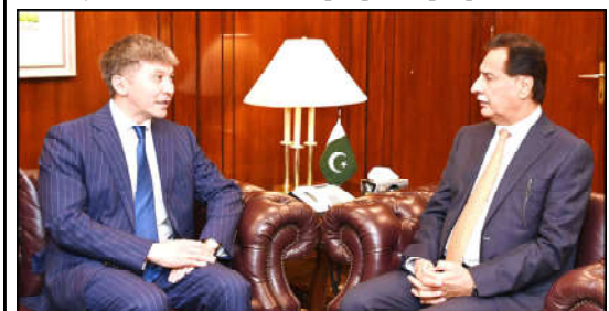
ISLAMABAD: Ambassador of the Republic of Kazakhstan Yerzhan Kistafin called on Speaker National Assembly Sardar Ayaz Sadiq at Parliament House.

He said that Pakistan-Azerbaijan bilateral trade volume was $ 10 million that has witnessed a three time growth after start of direct flight operation. He hoped that air connectivity with the biggest city of the country will help bolstering the trade relation between the brotherly countries. Karachi is not only economic and financial hub of Pakistan but it is gateway to a number of tourist places, he said and hoped that it would help strengthening people to people contacts.