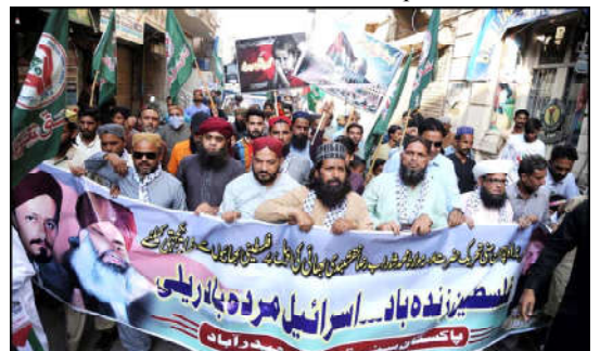
HYDERABAD: Workers of Pakistan Sunni Tehreek hold a protest rally against Israeli aggression in Gaza.

The meeting was attended by Deputy Commissioner Sukkur and other senior officers concerned. The meeting focused on reviewing the advancement of development projects in various sectors including electricity, roads, health, education, and tourism.