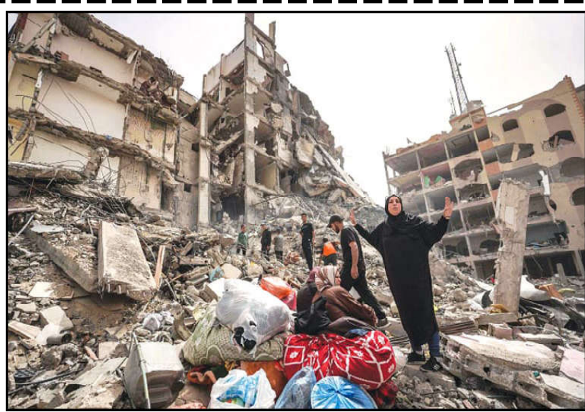
Palestinians attempt to salvage their belongings from the rubble of a damaged building in the city of Nuseirat, in central Gaza Strip.

sideration of a retaliatory strike against Iran. President Joe Biden has urged Israel not to conduct a large-scale offensive in Rafah to avoid more Palestinian civilian casualties in Gaza, where Palestinian health authorities say more than 33,000 people have been killed in Israel's assault. At the United Nations, Secretary General Antonio Guterres painted a dark picture of the situation in the Middle East, warning that spiraling tensions over the war in Gaza and Iran's attack on Israel could devolve into a "full-scale regional conflict." Guterres also said Israel's military offensive in the Gaza Strip had created a "humanitarian hellscap" for civilians trapped in the besieged territory.