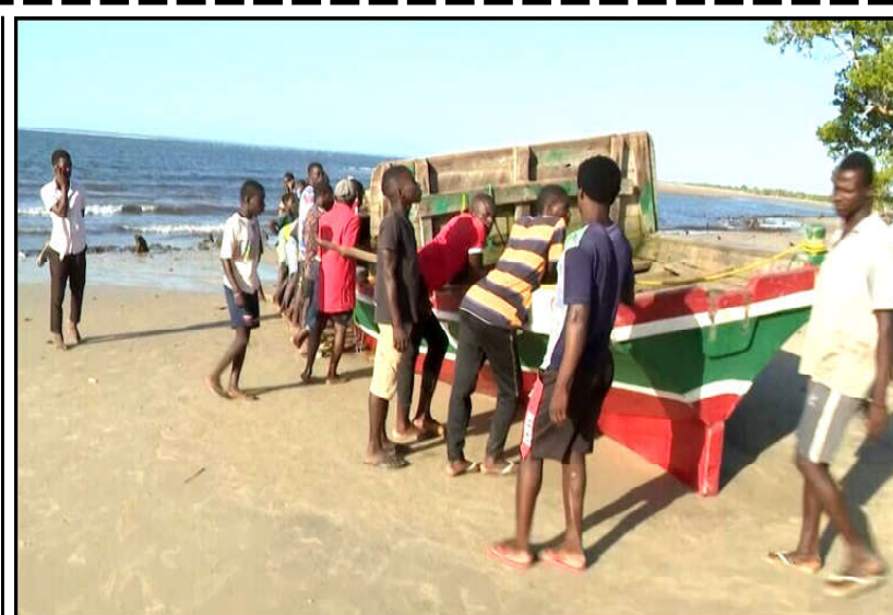
Boat that sank off the north coast of Mozambique killing 96 people on the Island of Mozambique.