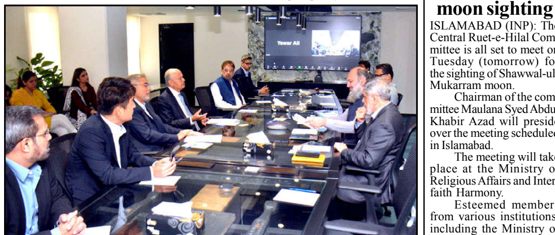
KARACHI: Federal Minister for Commerce, Jam Kamal Khan meeting with Pakistan Business Council.

The commerce minister told that trade diplomacy has been a very vital factor throughout the globe which helps the countries to improve their diplomatic ties. He said that the government as well as the business community are considering the available options to move the things in the positive direction. Jam Kamal Khan said that the government is very hopeful and taking things forward in a progressive way and in near future we will share with the media and the masses the opportunities we need to ponder over for our progress and prosperity.