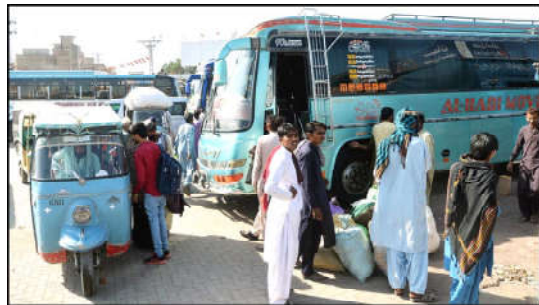
HYDERABAD: People arrives at Badin Bus Stand, to leave for hometowns to celebrate Eidul Fitr with their loved ones.

ments, he said that the Sukkur Municipal Corporation (SMC) should take full measures to ensure cleanliness around all mosques and Eidgahs. Mayor Sukkur directed that special measures should be taken regarding water supply and sewage while all manholes should be covered.