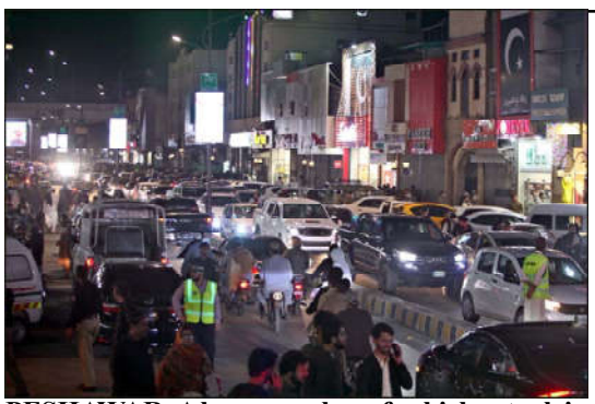
PESHAWAR: A large number of vehicles stuck in traffic jam at Saddar market while people busy in shopping as they are preparing for the occasion of Eid-ul-Fitar coming ahead, in Peshawar.

Jinnah. According to the instructions of Mayor Karachi Barrister Murtaza Wahab, arrangements are being completed for the Eid-ul-Fitr gathering at the Old Polo Ground. The flags of different Muslim countries are being raised to express solidarity. Apart from cleanliness around the Eid Gah, the entrance and exit routes are also being made better for the faithfuls. Strict security arrangements have been made for Eid prayers. Along with arrangements for ablation for the citizens coming for Eidgah, cleaning and disinfecting spray will also be performed.