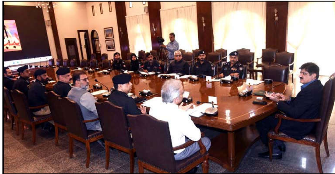
KARACHI: Sindh Chief Minister, Syed Murad Ali Shah presides over a meeting to review Law and Order in the city, at CM House in Karachi.