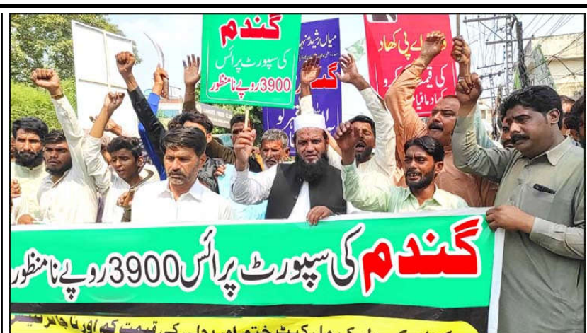
LAHORE: Members of Kissan Board Pakistan are holding protest demonstration against wheat support price, in Lahore.

However, according to the Forex Association of Pakistan (FAP), the buying and selling rates of the dollar in the open market stood at Rs277.3 and Rs280.4 respectively. The price of the Euro decreased by 09 paise to close at Rs301.07 against the last-day closing of Rs301.16, according to the State Bank of Pakistan (SBP). The Japanese Yen remained unchanged and closed at Rs1.83, whereas an increase of 10 paise was witnessed in the exchange rate of the British Pound, which was traded.