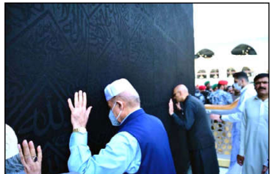
MAKKAH MUKARRAMAH: Prime Minister Muhammad Shehbaz Sharif during Ziaaraat of Al Masjid e Haraam.

cease hostilities, adhere to international law, and facilitate unhindered humanitarian aid access to Gaza. Two sides discussed the need for advancing the peace process in accordance with relevant resolutions of the Security Council and the General Assembly as well as the Arab Peace Initiative aimed at finding a just and comprehensive solution, to establish an independent Palestinian state with East Jerusalem as its capital.