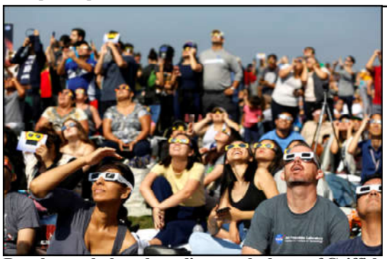
People watch the solar eclipse on the lawn of Griffith Observatory in Los Angeles, California, U.S.

Ukraine attacked the plant three times on Sunday with drones, first injuring three near a canteen, then attacking a cargo area and then the dome above reactor No 6. "Zaporizhzhia nuclear power station has been subjected to an unprecedented series of drone attacks, a direct threat to the safety of the plant," Rosatom said. "The radiation levels at the plant and the surrounding area have not changed," it said. A Ukrainian intelligence official said Kyiv had nothing to do with any strikes on the station and suggested they were the work of Russians themselves. "Russian strikes, including imitation ones, on the territory of the Ukrainian nuclear power plant ... have long been a well known criminal practice of the invaders."