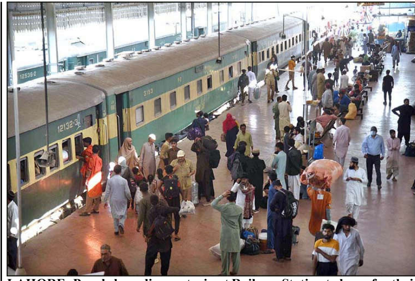
LAHORE: People boarding on train at Railway Station to leave for their hometowns to celebrate Eid-ul-Fitr with their loved ones.

officers to work with a renewed spirit of national reconstruction in view of the various challenges being faced by the province and focus on achieving the goals. He said that tourism and culture officers have to leave their offices and work side by side with the field staff for obtaining better results so that they could be aware of the ground realities of their respective fields. Likewise, he said development schemes should not be delayed in any way, while in case of unavoidable situations, financial or administrative difficulties should be directly brought to his notice so as to ensure its timely resolution at the highest level.