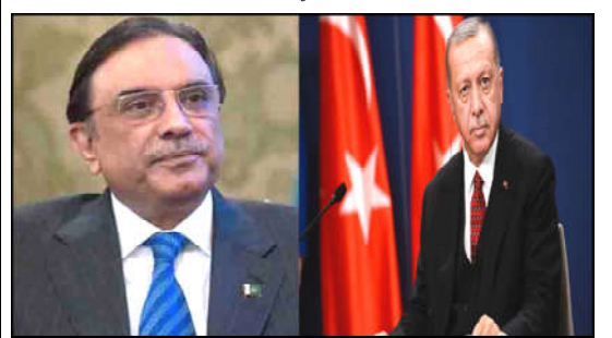
The two leaders spoke over the phone and discussed matters of mutual interest, a post on President of Pakistan X account said.

ISLAMABAD (APP): President Asif Ali Zardari and President of Türkiye Recep Tayyip Erdogan on Sunday called for further strengthening of bilateral relations between the two countries in various fields.