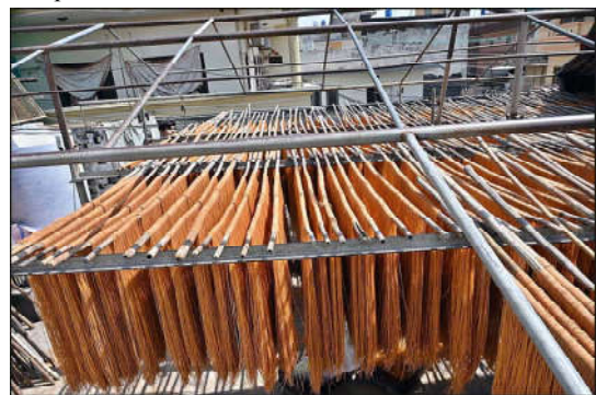
RAWALPINDI: A worker hanging vermicelli for dry at his workplace as demand increased for upcoming Eidul Fitr Festival.

The head office received a total of 313 complaints against Islamabad Electric Supply Company, 268 Peshawar Electric Supply Company, 223 Hyderabad Electric Supply Company, 419 K-Electric, 133 Sukkur Electric Supply Company.