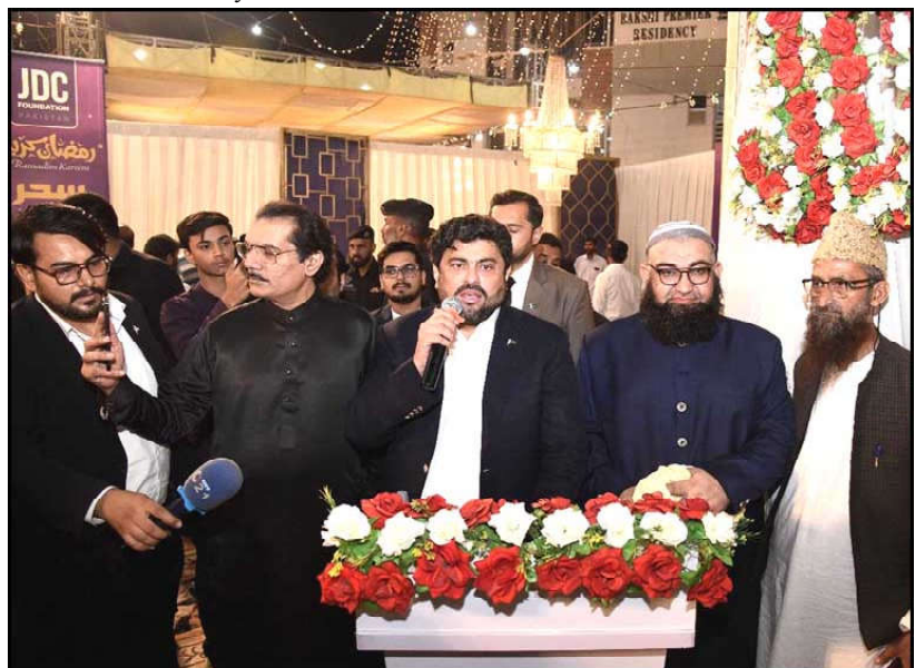
KARACHI: Governor Sindh Kamran Khan Tessori talking with media men on eve of participating in 27th Sehri organized by JDC.

The announcement came through the latest report issued by Norway's Police Security Service, which holds responsibility for intelligence and security matters within the country.