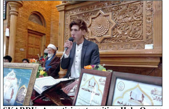
SKARDU: A participant reciting Holy Quran during the Husn-e-Qiraat and Hafiz Quran competition at Jamia Masjid Skardu-Baltistan in the Holy Month of Ramadan.

LAHORE (APP): In a significant crackdown on illegal mining activities, a major operation, led by Provincial Minister for Mines & Minerals, Sardar Sher Ali Gorchani, uncovered rampant corruption and illicit practices in the sand and stone supply chain, amounting to millions of rupees in losses to the national exchequer. The operation, conducted in the mountainous region of Sakhi Sarwar, DG Khan, revealed widespread irregularities in the supply