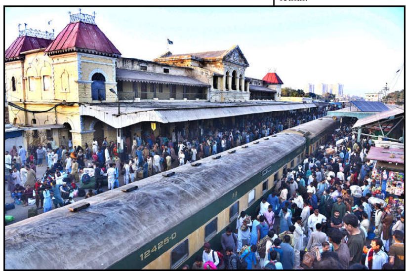
KARACHI: A large number of people getting board on Eid Special Train at Cantt Railway Station, departing to their home towns to celebrate Eidul Fitr, festive with their loved ones.

He had been fighting cancer and receiving treatment in Jinnah Hospital in Lahore, according to the family sources.