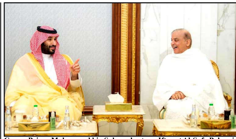
Crown Prince Mohammed bin Salman hosts an Iftar at Al-Safa Palace in Makkah for PM Shehbaz Sharif.

According to the official, the laying down of the 80-km section of the pipeline is essential to avoid arbitration in France which may lead to the imposition of the aforesaid penalty on Pakistan.