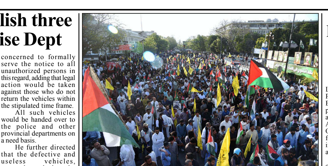
LAHORE: A large number of people participating in Al-Quds rally to express solidarity with the people of Palestine at Mall Road.

The court while issuing notices to the respondents sought reply and adjourned the hearing of the case till May 2. Nawaz Sharif will inaugurate the program,