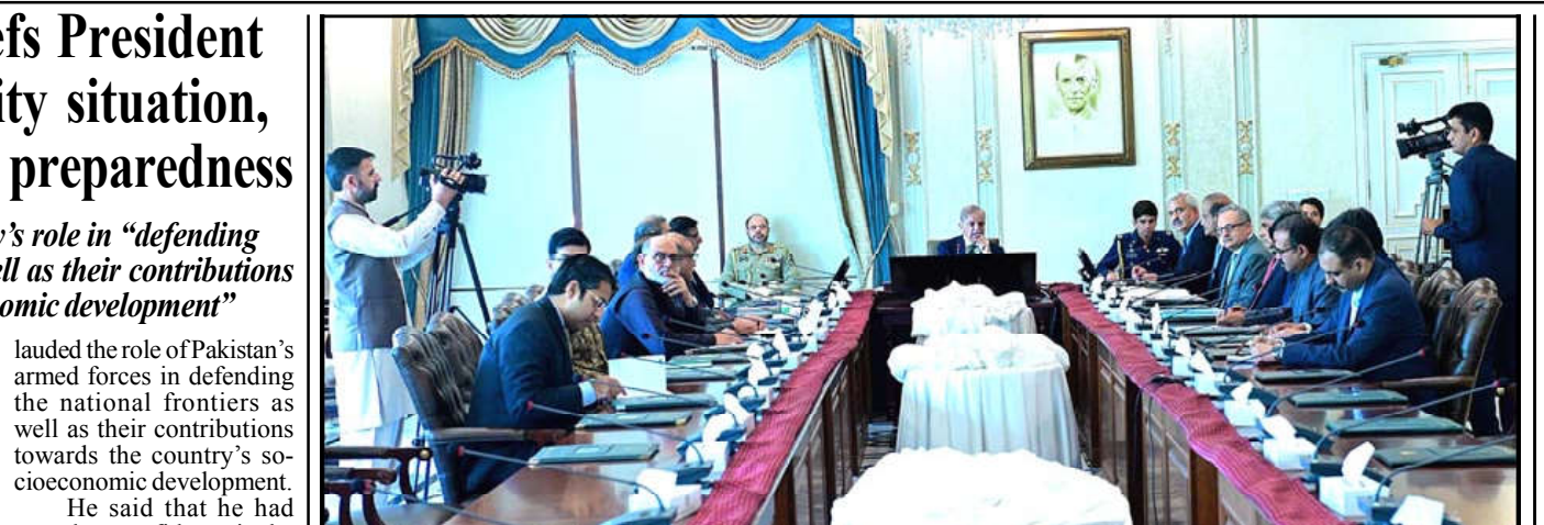
complete confidence in the ISLAMABAD: Prime Minister Muhammad Shehbaz Sharif chairs a meeting regarding security situsecurity forces of the counation in the country. try to successfully over-