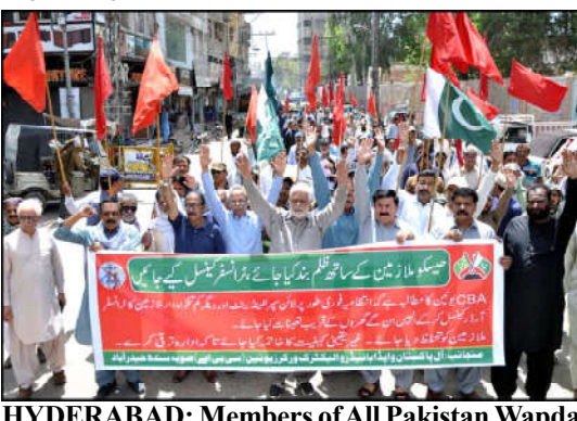
HYDERABAD: Members of All Pakistan Wapda Hydro Electric Workers Union (CBA) Sindh are holding protest rally against transfers in HESCO. near Labour Hall in Hyderabad.