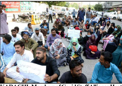
KARACHI: Members of Covid Staff Alliance Heath Department Sindh are holding protest demonstration against non-payment of their dues salaries and for acceptance of their demands, held at Karachi

The MPAs strongly called for constructing new water lagoons to increase storage capacity as the existing capacity was not able to meet the district's water Zahid Hussain Shar and demand beyond a few days.