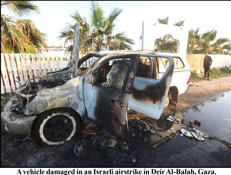
A vehicle damaged in an Israeli airstrike in Deir Al-Balah, Gaza.

from a "brain death". Now, four-and-a-half years later, the alliance has grown to 32 members with the addition of Sweden and Finland after what Macron described as the "electroshock" of Russia's all-out assault in 2022. In response, NATO has ramped up troop numbers on its eastern flank and put in place new plans to deal with any Russian attack. "NATO has been reenergised after the invasion