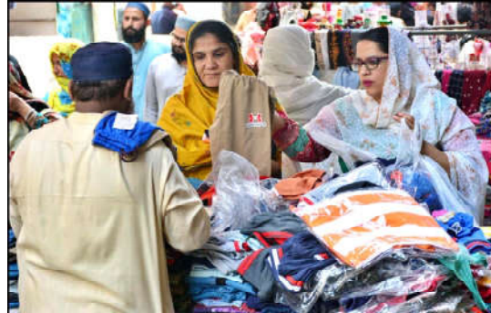
HYDERABAD: Women selecting and purchasing dress from vendor at cloth market at Latifabad for upcoming Eid-ul-Fitr celebrations.

Minister for Information and Broadcasting, Ataulah Tarar, said that this matter was sub-judice and the Supreme Court had also constituted a bench on this matter. He said politics should not be done on such matters. Malik Amer Dogar said that the letter written by the judges was a very important issue, and instead of discussing any other matter in the House, the adjournment motion should be debated. The Speaker said that he had preserved the ruling on this matter and the House would be informed on it.