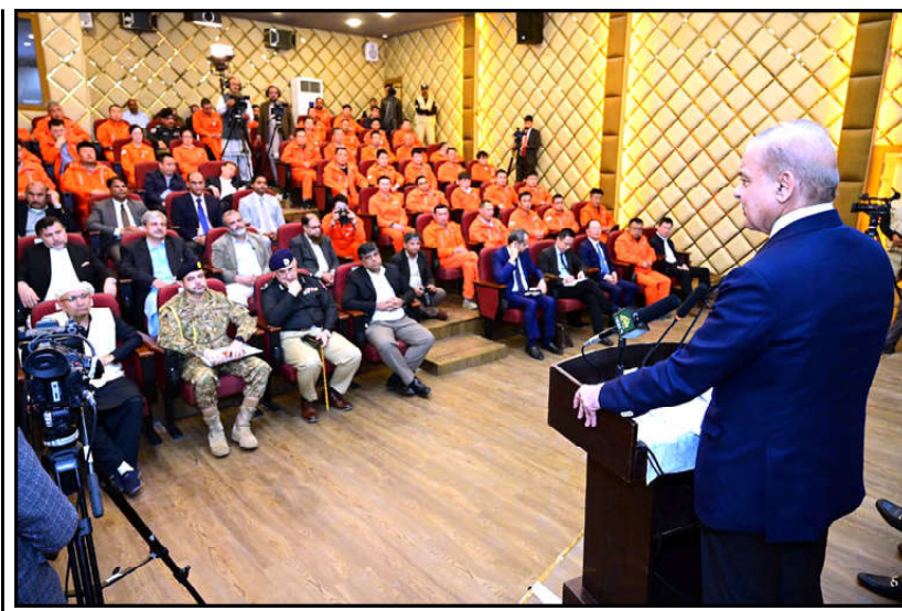
DAASU: Prime Minister Muhammad Shehbaz Sharif addresses the Chinese Engineers and government officials at Kass camp of China Gezhouba Group Company (CGGC).

Prime Minister Sharif said that they shared the moment of sadness and sorrow and assured that the government would not leave any stone unturned and would not spare any opportunity to ensure the best possible security measures for the Chinese families and nationals.