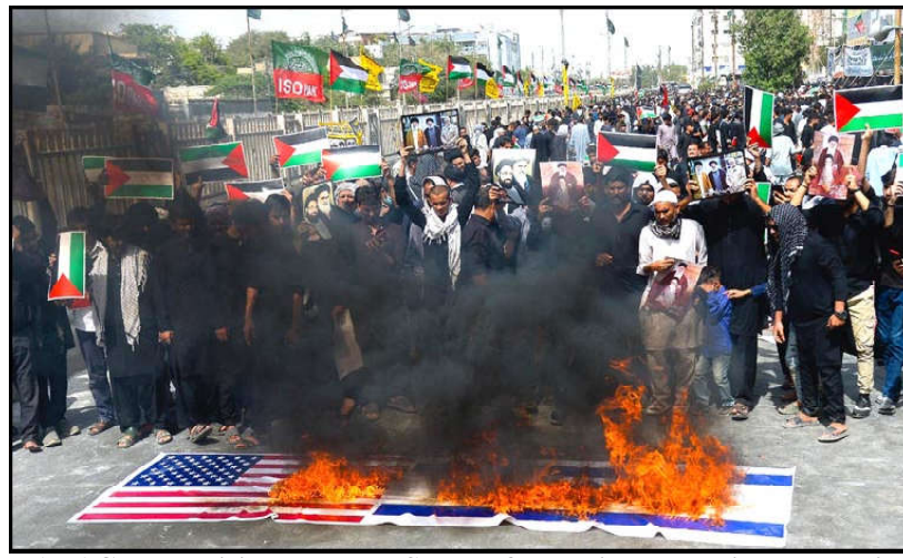
KARACHI: Participants burn US-Israel flag during procession on occasion of youm-e-Ali.