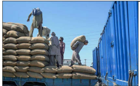
ISLAMABAD: Laborers busy unloading wheat sacks from delivery truck at grain Market in the Federal Capital.