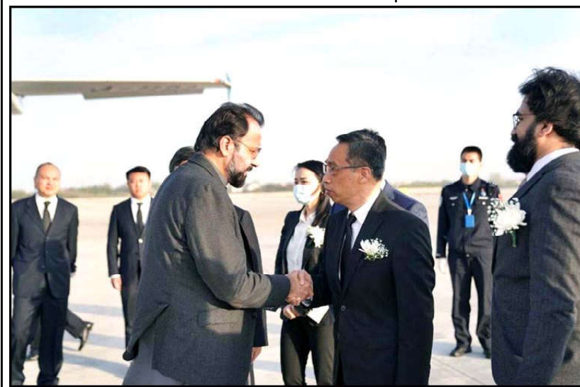
WUHAN: To express solidarity with the government and people of China, Chaudhry Salik Hussain, Federal Minister for Overseas Pakistanis and Human Resource Development arrived in Wuhan, China, on the special flight that carried the mortal remains of five Chinese personnel, who died in a terrorist attack on 26 March, 2024. The Federal Minister was received by high ranking government officials and Pakistan Embassy representative at Wuhan airport, China.

The orders were passed by the SHC bench on a plea moved against kite flying in the metropolitan. Stray strings of kite flyers have claimed several lives of people, while the police were not taking any 'action' against the people involved in the kite flying. The applicant urged the SHC to pass orders for action against kite makers and flyers in Karachi.