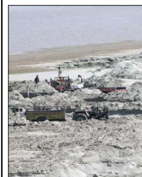
MULTAN: Labourers are busy loading sand on the tractor trolleys from the dry bed of the Chenab River.

The ministers were informed about the project and told that KPCIP Peshawar interventions in water supply, green urban spaces and integrated solid waste management. Besides Peshawar, the project is also going on in four cities of the KP including Mingora, Kohat, Mardan and Abbottabad.