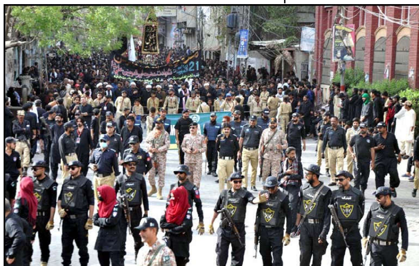
HYDERABAD: Security officials stand high alert on route to avoid any untoward incident as security has been tightened during mourning procession on the occasion of Youm-e-Ali (R.A), the day of martyrdom 21st Ramadan-ul-Mubarak, in Hyderabad.

The minister was briefed about the performance of different wings and progress on ongoing projects of the agriculture department.