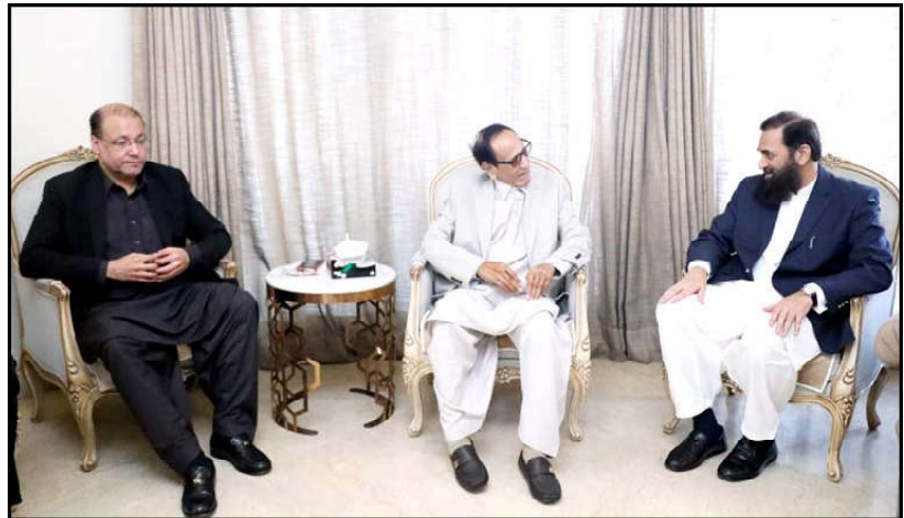
LAHORE: Governor Punjab Muhammad Balighur Rehman meeting with Chaudhry Shujaat Hussain at his resident. Provincial Minister Chaudhry Shafay Hussain is also present.

side markets looked dull this time. Sale of various commodities was found low in different markets in the district since the beginning of Ramadan. The people from different walks of life giving their views said that prices were much high this year. The district administration has beefed up security measures to avert any untoward situation during the pre-Eid and Eid days. The police personnel have been deployed in the city and adjoining areas to maintain law and order on the occasion. The arrangements for Eid-ul-Fitr congregations have also been finalized in all principal mosques, Eidgahs, Imambargahs and open spaces. The main Eid congregations in Sukkur will be held at Eidgah, Eidgah road, Jinnah Municipal Stadium, Jamia Masjid, Allah Wali Masjid, Sufaid Masjid, Faisal Masjid, Moti Masjid and Al-Raheem Masjid.