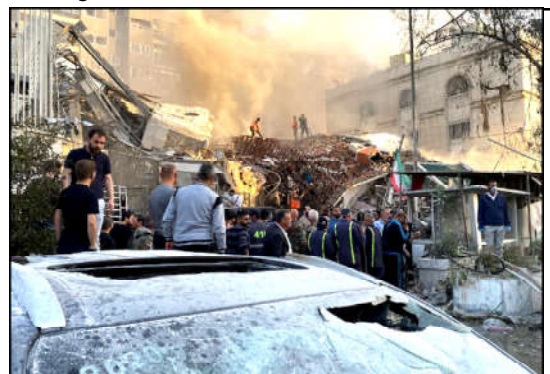
Smoke rises after what the Iranian media said was an Israeli strike on a building close to the Iranian embassy in Damascus, Syria.

Swathes of Afghanistan are littered with unexploded mines, grenades and mortars from decades of conflict, spanning from the Soviet invasion in 1979, the civil war that followed, and the 20-year Taliban insurgency against foreign-backed governments. Violence has reduced dramatically since the Taliban seized power in August 2021, ending their insurgency. Unexploded ordnance and mines, however, still claim lives regularly, with the International Committee of the Red Cross saying children are the main victims. Also on Sunday, another child died and five other people were wounded when unexploded ordnance went off in Herat province, local police said on social media platform X.