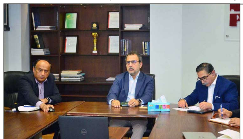
ISLAMABAD: Minister for Power Sardar Awais Ahmad Khan Leghari holds a meeting with PITC.