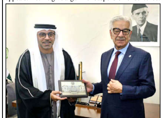
ISLAMABAD: Minister for Defence, Khawaja Muhammad Asif presenting a souvenir to Ambassador of the United Arab Emirates (UAE), H.E. Hamad Obaid Ibrahim Salem Al Zaabi.

The court suspended the sentence of PTI founder and Bushra Bibi in Toshakhana case. The sentence was suspended in the light of NAB prosecutor statement. NAB prosecutor said they have reviewed the decision and this is case of suspension of sentence.