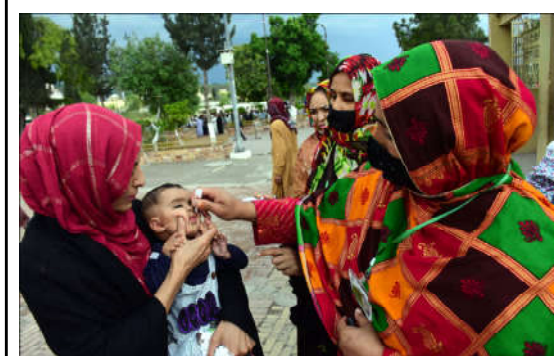
ISLAMABAD: Lady Health workers administering polio drops during Anti Polio drive in the Holy Shrine of Bari Imam Sarkar R.A in the Federal Capital.

The minister lamented the underperformance of the KP province compared to Punjab and Sindh, calling for a learning curve from their development models. About the blames of the KP Chief Minister on the federal government over resource allocation, he highlighted the equitable distribution through the National Finance Commission (NFC) award. The minister questioned the chief minister's insistence on federal funds, emphasizing adherence to established financial mechanisms. Regarding opposition politics, Amir Muqam denounced the tendency for selective acceptance of court decisions and criticized the tendency to incite unrest while shunning accountability.