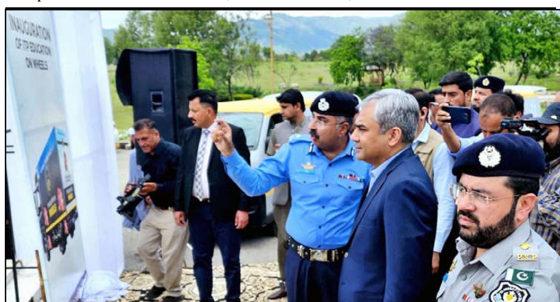
ISLAMABAD: Interior Minister Mohsin Naqvi inaugurating Islamabad Traffic Police Education on Wheels & Islamabad Traffic Police Education on Wheels.

He said his father and his brothers were sons of a poor farmer in undivided India and they migrated to Lahore, Pakistan at the time of partition. With the sheer dint of hard work, in 1965 his father and family raised the largest steel engineering company in Pakistan but it was nationalized on January 2, 1972, he said, adding his family stood up and accepted the challenge and in next 18 months set up six new small factories to avoid further nationalization.