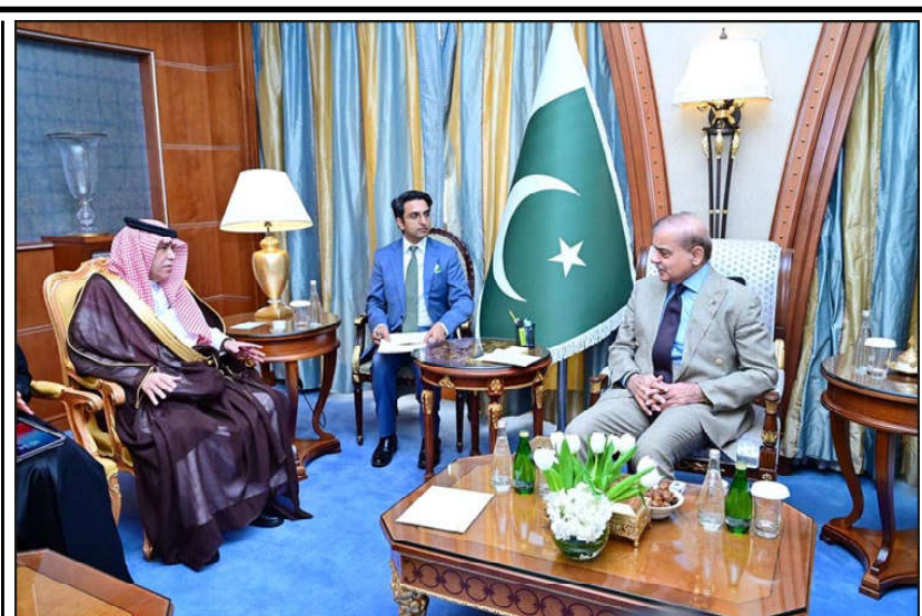
RIYADH: Saudi Minister for Commerce H.E. Majid Al Kasabi calls on Prime Minister Muhammad Shehbaz Sharif.

The Emirates Dirham and the Saudi Riyal witnessed no change and closed at Rs75.79 and Rs74.22 respectively.