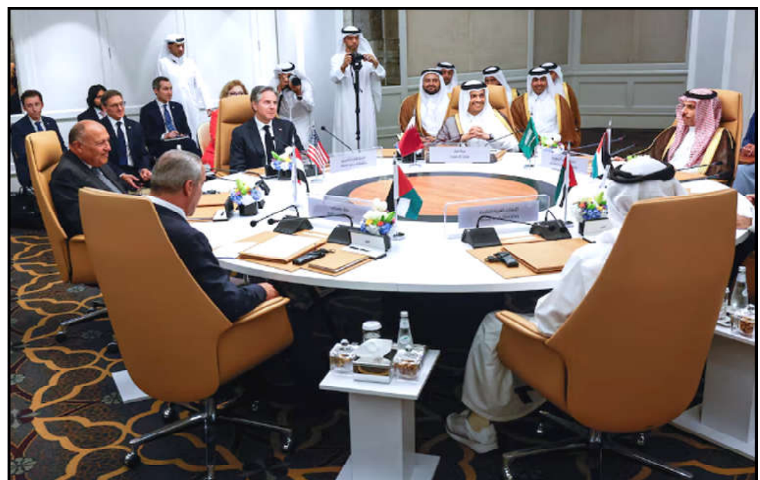
U.S. Secretary of State Antony Blinken attends the U.S.-Arab Quint Meeting with representatives from Egypt, Jordan, Saudi Arabia, Qatar, the United Arab Emirates and the Palestinian Authority, at the Four Seasons Hotel in Riyadh, Saudi Arabia.

U.S. Secretary of State Antony Blinken said Monday that Israel must still do more to increase the flow of humanitarian aid into the besieged Gaza Strip and that he would use his current Middle East trip — his seventh to the region since the Israel-Hamas war started in October — to press that case with Israeli leaders.