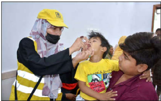
FAISALABAD: A lady health worker administering polio drops to a child during 7-days anti polio campaign in the city.

He said, "If you want to establish your place in the world of education and research, you need to go through the process of continuous learning. We have established departments like National Center for Satellite Technology.