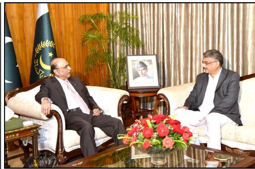
ISLAMABAD: Prime Minister of Azad Jammu and Kashmir (AJK), Anwar-ul-Haq called on President Asif Ali Zardari at Aiwan-e-Sadr.

vital to protect future generations from this crippling disease. In addition to polio, Prime Minister Shehbaz and Bill Gates also discussed progress on ongoing activities between Pakistan and the Foundation in the areas of immunization, nutrition, and financial inclusion. The prime minister said that the Gates Foundation was a trusted partner in Pakistan's socio-economic development and sought collaboration in other areas including IT, STEM education and disaster management. Recalling Bill Gates' visit to Pakistan in February 2022, the prime minister extended an invitation to him to visit Pakistan again at a time of his convenience.