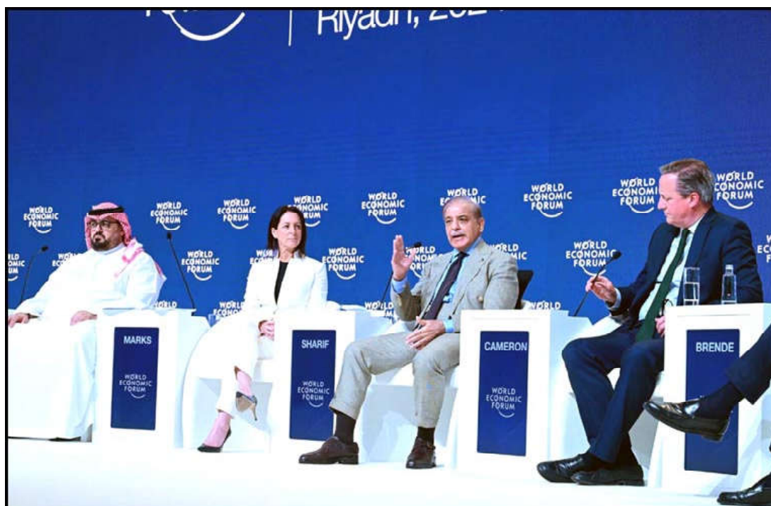
RIYADH: Prime Minister Muhammad Shehbaz Sharif speaks at a Closing Plenary-Rejuvenating Growth, at a Special Meeting of the World Economic Forum.

Former prime minister Shahid Khaqan Abbasi said on Sunday that seeking another IMF programme was akin to "admitting failure".