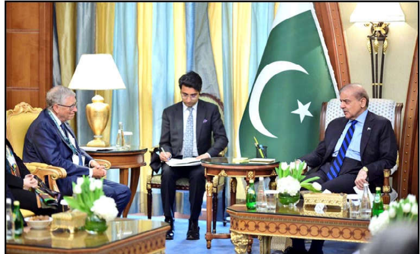
RIYADH: Founder and Co-chair of the Bill and Melinda Gates Foundation Bill Gates calls on Prime Minister Muhammad Shehbaz Sharif on the sidelines of a special meeting of the World Economic Forum.

Gilgit and Khyber Pakhtunkhwa, affecting travel and trade in the region. Efforts to reopen the highway have been hampered by the presence of mountain debris on the road. Despite machinery being dispatched to the site, clearance work has been delayed pending favourable weather conditions.