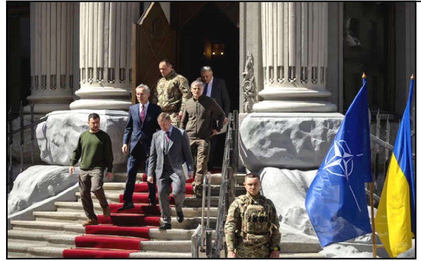
Ukraine's President Volodymyr Zelenskyy and NATO Secretary-General Jens Stoltenberg arrive for a press conference, amid Russia's attack on Ukraine, in Kyiv, Ukraine.