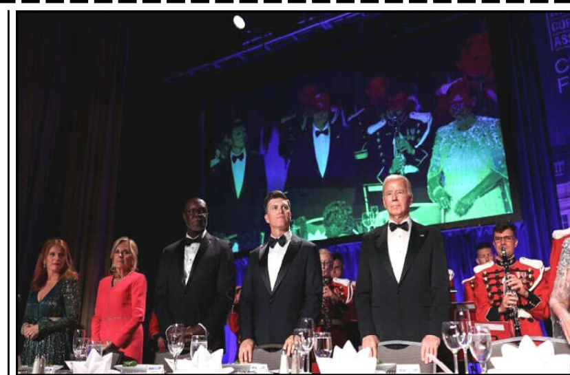
US President Joe Biden, US First Lady Jill Biden, host Colin Jost and Kelly O'Donnell attend the White House Correspondents' Association Dinner in Washington, US.

ery and ribbing of the press, the 81-year-old president took sharp-elbowed jabs at his 77-year-old presumptive November election rival, quipping that "age is the only thing we have in common. My vice president actually endorsed me." Both Jost and Biden struck a more serious tone in addressing what many Americans feel is a politically fraught moment, with Biden telling attendees Trump's rhetoric was a danger particularly after the January 6, 2021 attack on the Capitol, and that "the stakes couldn't be higher."