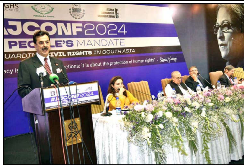
LAHORE: Chairman Senate, Syed Yusuf Raza Gillani addressing to Asma Jahangir conference.

The appointment of four-time finance minister as foreign minister suggested a ramped up role for economics in the nation's diplomacy as the country tries to secure another International Monetary Fund Deal and shore up external financing from foreign capitals.