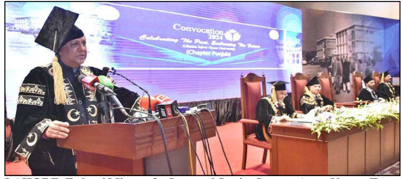
LAHORE: Federal Minister for Law and Justice Senator Azam Nazeer Tarar addressing at 37th Convocation of Allama Iqbal Open University (AIU).

Farooq H. Naik, the Chairman of the Executive Committee of the Pakistan Bar Council and former Law Minister, said that Asma Jahangir's services for human rights should not be ignored.