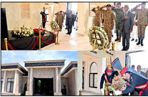
tain Karnal Sher Khan's life and sacrifices.

In a testament to honoring the legacy of the valiant martyr, the newly renovated shrine now stands adorned with commemorative photographs and artifacts, meticulously curated to reflect the profound essence of Cap-