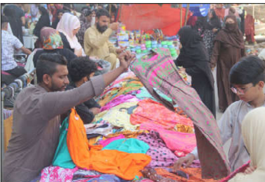
KARACHI: Citizens shopping at Bachat Bazaar in Ramsawami area of Provincial Capital.

He said that taxes cannot be collected by increasing the tax rate. Instead, economic activity will have to be increased, he added. On the occasion, economist Syed Ali Hasnain said that discussing regarding imposing taxes wasn't new and added that taxation was the most regressive in Pakistan.