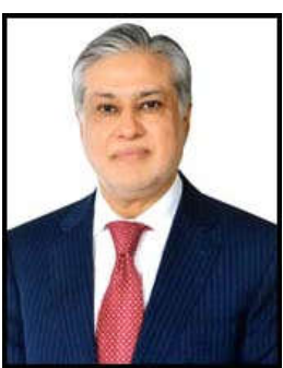
ISLAMABAD (APP): Prime Minister Muhammad Shehbaz Sharif has designated Minister of Foreign Affairs Ishaq Dar as Deputy Prime Minister.

The Cabinet Division had issued the notification of the appointment. At present, the foreign minister is accompanying