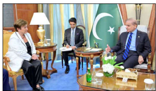
A PM Office press release.

RIYADH (APP): Prime Minister Shehbaz Sharif on Sunday met with Managing Director (MD) of the International Monetary Fund (IMF) Kristalina Georgieva wherein he reiterated his government's commitment to put Pakistan's economy back on track.