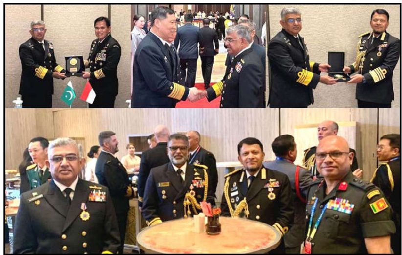
Chief of the Naval Staff Admiral Naveed Ashraf interacting with Naval Heads of various Navies during 19th Western Pacific Naval Symposium in Qingdao China.