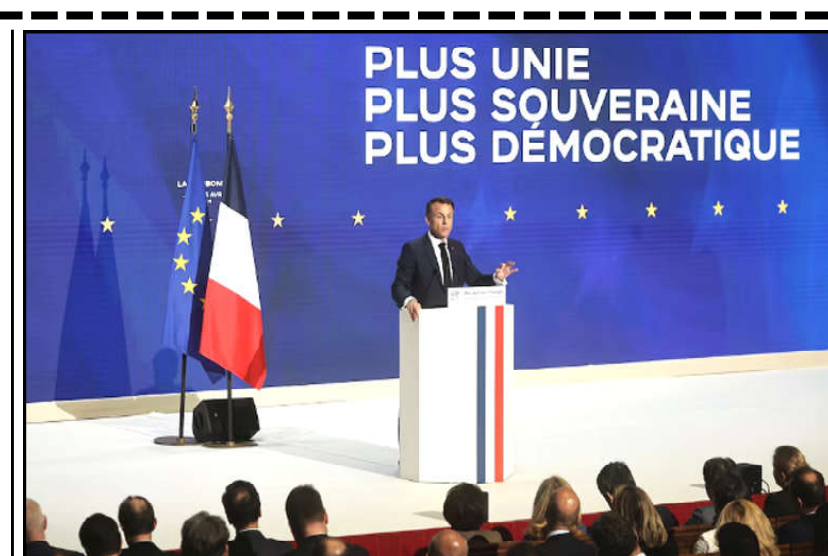
French President Emmanuel Macron delivers a speech on Europe in the amphitheatre of the Sorbonne University in Paris, France.