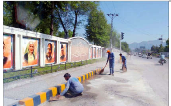
ABBOTTABAD: Workers of Water and Sanitation Services Company Abbottabad (WSSCA) are cleaning and collecting solid waste during cleaning drive campaign at the Main KKH road in Abbottabad.

relevant authorities to commence work on this project. He further instructed them to ensure the completion of all necessary arrangements for tendering the CRBC Left Canal Project by July of the current year. The Chief Minister emphasized that the CRBC Left Canal Project is indispensable for the food security of the province and highlighted its importance for the country's food security. He stressed the need for early completion without any further delay. The Chief Minister stated that the provincial government would provide funds on a priority basis for projects, considering the economic viability of the project.