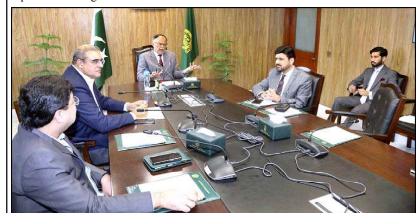
ISLAMABAD: Federal Minister for Planning Development & Special Initiatives, Professor Ahsan Iqbal chairs a meeting to review progress over CPEC Joint Group Works and upcoming 13 JCC.

civilians. Silence of the United States on the continuing genocide in Gaza runs counter to the stated objectives behind the so-called country reports on human rights," she remarked. The spokesperson reiterated that Pakistan remained steadfast in its commitment to strengthen its own human rights framework, constructively engage to promote international human rights agenda and uphold fairness and objectivity in the international human rights discourse. "If the US must engage in this exercise, then we expect the US State Department to at least exercise due diligence when conducting the assessment