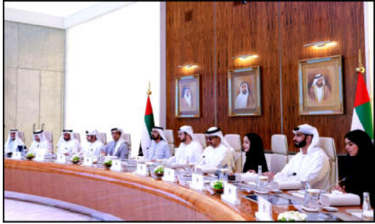
United Arab Emirates announced $544 million to repair the homes of Emirati families in a cabinet meeting.

The world's busiest for international passengers. "A ministerial committee was assigned to follow up on this file [...] and disburse compensation in cooperation with the rest of the federal and local authorities," said Sheikh Mohammed, who is also the ruler of Dubai, which was one of the worst hit of the UAE's seven sheikhdoms. The rainfall, the UAE's heaviest since records began 75 years ago, killed at least four people, including three Filipino workers and one Emirati. UAE authorities have not released an official toll. Cabinet ministers also formed a second committee to log infrastructure damage and propose solutions, Sheikh Mohammed said in a post on X, formerly Twitter.