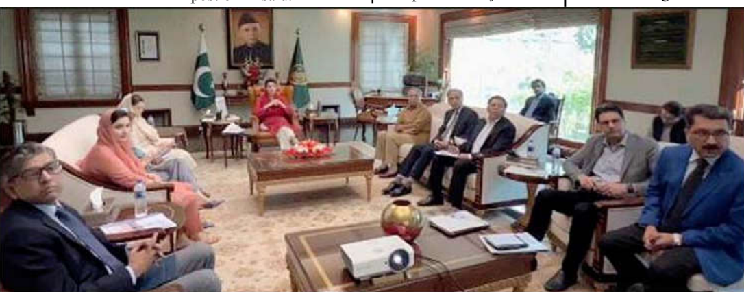
LAHORE: Punjab Chief Minister Maryam Nawaz Sharif presides over the meeting to review the 'Apni Chhat, Apna Ghar' [Own Roof, Own Home] project.