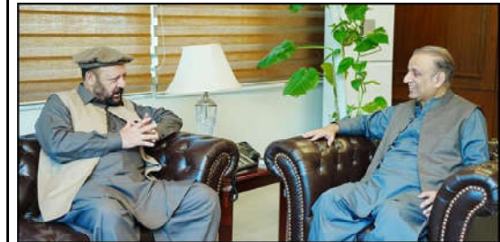
Chief Minister of Gilgit-Baltistan, Haji Gulbar Khan called on Federal Minister for Privatization, Board of Investment and Communications, Abdul Aleem Khan in Islamabad.

formance of the institution as well as its administrative matters. The president was told that the IIUI had formulated a Strategic Plan 2022-2026 to promote research and development, innovation and digitalisation that would also help improve the university's financial and administrative affairs. In the briefing, President Zardari was told that Kingdom of Saudi Arabia was extending assistance for the university's uplift and development as it had already funded the construction of a new university block and for the provision of modern educational facilities.