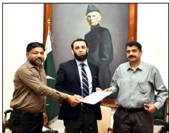
Federal Minister for Information and Broadcasting Mr. Attaullah Tarar handing over a cheque to Karachi Press Club at Governor House Karachi.

Lakki police informed on Wednesday that the incident occurred in village Akri Khanzada Khail, Lakki Marwat where six people fell prey to a longstanding rivalry and were killed by their rivals during a wedding.