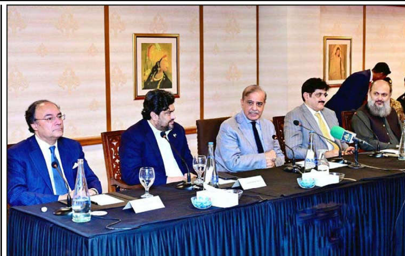
KARACHI: Prime Minister Muhammad Shehbaz Sharif addressing business community during his visit to Karachi.

There was no change in the price Emirates Dirham as it closed at Rs75.79, and the Saudi Riyal increased by 01 paise to at Rs74.22.