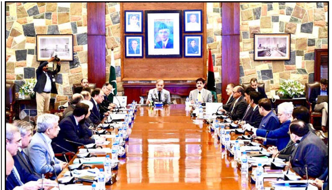
KARACHI: Prime Minister Muhammad Shehbaz Sharif chairs a briefing regarding various developmental projects of the Sindh Government.

As a result of February 8 election, the people of Pakistan gave mandate to Pakistan People's Party in Sindh while in Punjab, they gave opportunity to Pakistan Muslim League (N). However, he said, "in federation there is a split mandate and we have to respect it."