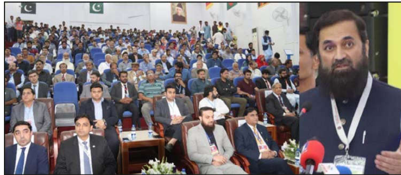
LAHORE: Governor Punjab Muhammad Balighur Rehman addressing the opening session of the International Climate Change Conference organized by a private university in Sialkot.

The cabinet also approved the acquisition of 327 kanal land for the 88 MW Gabral Kalam Hydropower project being financed by the World Bank in District Swat. On commissioning the project is expected to generate over Rs. 7.4 billion incomes per year for the Province. It also approved the additional compensation in respect of land and built-up property based on an independent valuation study for executing the 300 MW Balakot Hydropower project on Kunhar River Manshara. The cabinet approved the shifting of manual registration books to automated motor vehicle registration smart cards.