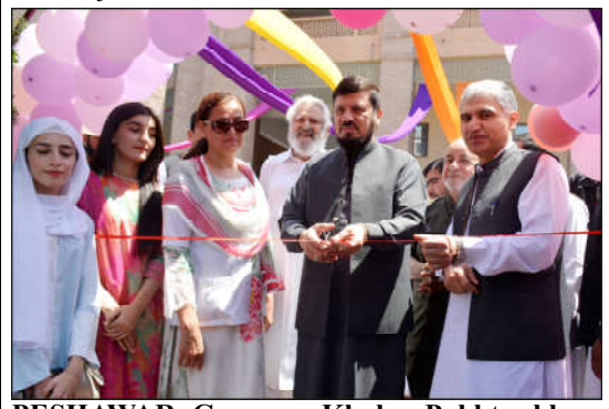
PESHAWAR: Governor Khyber Pakhtunkhwa Haji Ghulam Ali inaugurates Blossom Festa Fun Fair during his visit to Khyber Girls Medical College.

He said it is a great and happy moment to see students' love for pets. "I'm happy to see female students actively participating in such activities."