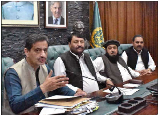
GILGIT: Provincial Minister Gilgit-Baltistan addressing a press conference after cabinet meeting at CM Secretariat.