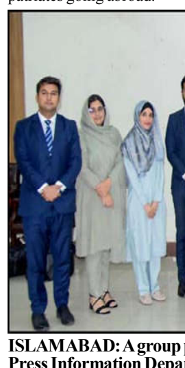
ISLAMABAD: A group photo of delegation of Information Service Academy (ISA) with senior officers of Press Information Department (PID)