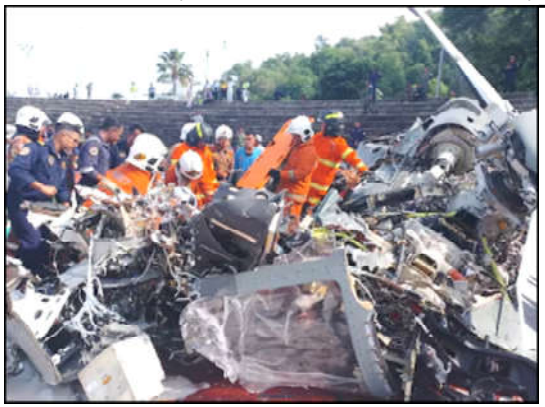
Emergency personnel work at the site of a helicopter crash in Lumut, Perak, Malaysia.

UK parliament as a researcher. The German arrests and British charges come amid repeated Western warnings of Chinese intelligence services targeting advanced technologies. German Interior Minister Nancy Faeser warned of the "considerable danger posed by Chinese espionage in business, industry and science". "The area affected in the current case — innovative technologies from Germany that can be used for military purposes — is particularly sensitive," Faeser said. China firmly rejects accusations that it carried out spying activities in Germany, its embassy in Berlin said on Monday, after three Germans were arrested on suspicion of working with the Chinese secret service. "We call on Germany to desist from exploiting the espionage accusation to politically manipulate the image of China and defame China," a spokesperson for the embassy said in an emailed statement.