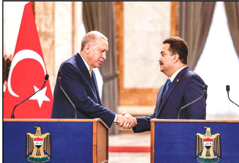
Iraq's Prime Minister Mohammed Shia al-Sudani and Turkish President Recep Tayyip Erdogan shake hands after a joint statement to the media.

and act against non-state armed groups that could be working with terrorist organisations. He did not mention the PKK specifically. An Iraqi government spokesperson said PKK members were welcome in Iraq so long as they did not engage in political activism or carry weapons. He did not elaborate. The PKK took up arms against the Turkish state in 1984 and is designated a terrorist organisation by Ankara and its Western allies. Turkiye has conducted a series of cross-border operations against the group in northern Iraq since 2019.