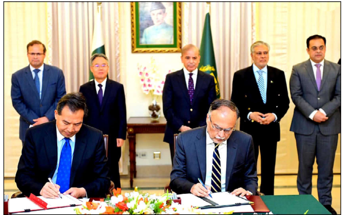
ISLAMABAD: Prime Minister Muhammad Shehbaz Sharif witnesses the signing of different agreements between China and Pakistan regarding cooperation in various fields.

She told the Iranian president that immense opportunities were available in Punjab for investment in the environment-friendly green energy sector.