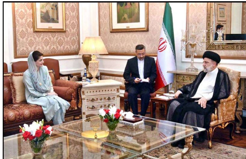
LAHORE: Chief Minister of Punjab, Maryam Nawaz meets with President of the Islamic Republic of Iran Dr. Seyyed Ebrahim Raisi at Governor House.