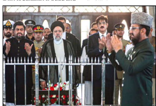
KARACHI: Iranian President Dr. Seyyed Ebrahim Raisi along with others paying homage to Quaid-e-Azam Muhammad Ali Jinnah during ceremony held at Jinnah Mausoleum in Karachi.

After PM Shehbaz Sharif's visit, Saudi Crown Prince Mohammed bin Salman will also travel to Pakistan.