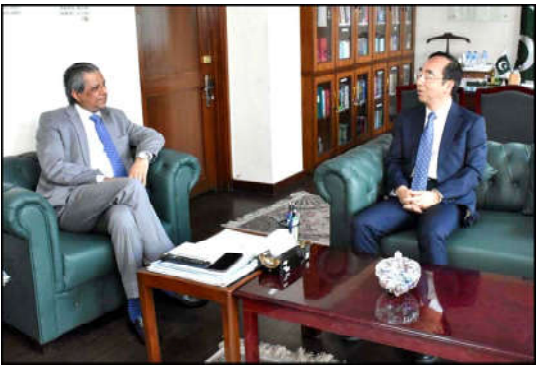
ISLAMABAD: H.E. WADA Mitsuhiro, Ambassador of Japan to Pakistan paid a courtesy call to Minister for Law and Justice Senator Azam Nazeer Tarar.

Mian Bugti called for concerted efforts to uplift the region, urging the concerned for provision of gas facilities to the local population.