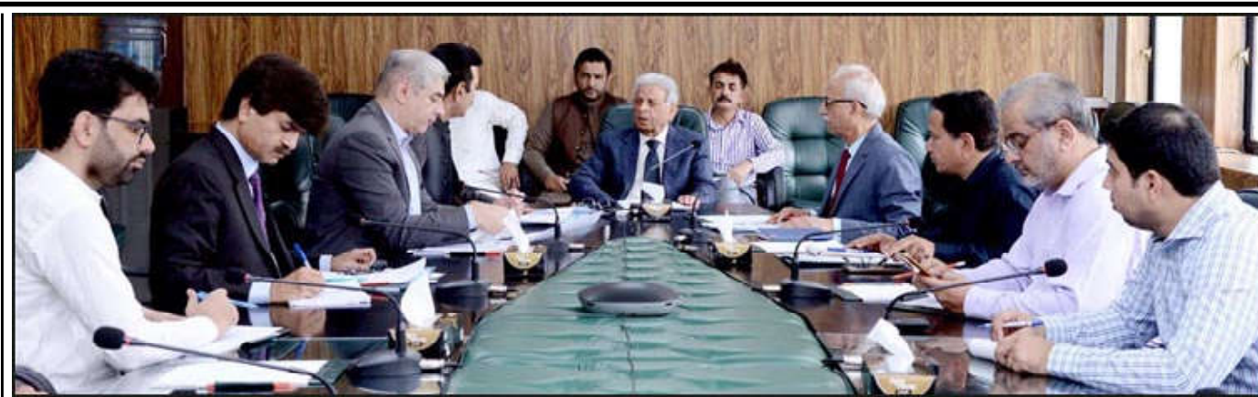
ISLAMABAD: Federal Minister for Industries Production and Food Security, Rana Tanveer Hussain being briefed by Commissioner Livestock Stock regarding Livestock Department.

The agriculture credit disbursement during the period from July-February, 2024 witnessed 33.6 percent growth as compared to the same period of last year, he said adding that during the period under review the current account deficit decreased by 74 percent and reached to $1.00 billion as against the deficit of 3.9 billion.