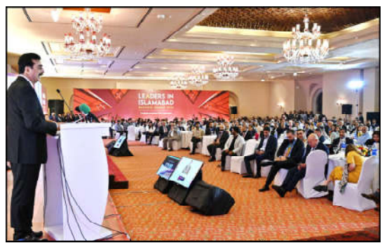
ISLAMABAD: Chairman Senate Syed Yousuf Raza Gilani addressing during Leaders in Islamabad Business Summit 2024 collaborating for Growth.

On the economic front, Yousuf Raza Gillani said that there is a need for a shift in policy paradigms to stimulate economic revival and growth, emphasizing collaboration between the government and business leaders.