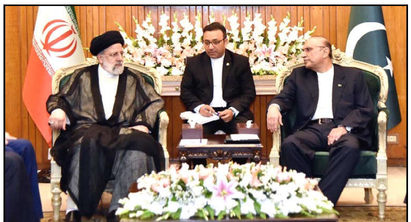
ISLAMABAD: President Asif Ali Zardari and the Iranian President, Dr. Seyyed Ebrahim Raisi, held a meeting, at Aiwan-e-Sadr.