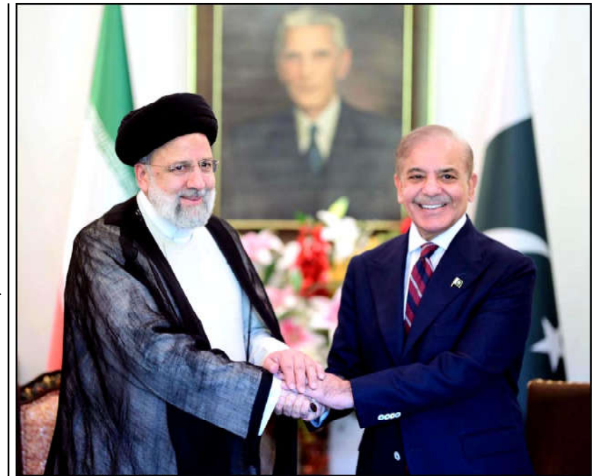
ISLAMABAD: Prime Minister Muhammad Shehbaz Sharif meets with Iranian President H.E. Dr. Seyyed Ebrahim Raisi.

The Iranian President believed that the position adopted by the people around the world and by the Palestinian resistance would surely be realized one day.