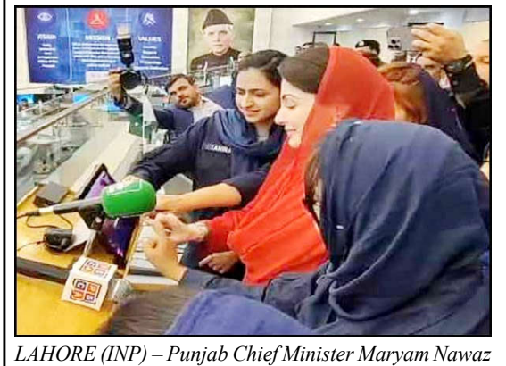
LAHORE (INP) — Punjab Chief Minister Maryam Nawaz on Monday inaugurated "Meri Awaz, Maryam Nawaz," the country's first virtual women police station dedicated to addressing all problems faced by women, including harassment, on a priority basis.

The virtual women police station was established at the Punjab Safe Cities Authority (PSCA) following the chief minister's special directives. During the inauguration, CM Maryam highlighted that women would no longer need to visit police stations unnecessarily after the establishment of the virtual women police station. Women can share their problems with complete confidentiality and trust, without revealing their names and addresses, through 15 calls, the women safety app's live chat feature, video call feature, Punjab Police app and the Punjab Safe Cities Authority web portal. The CM stated that the virtual women police station would provide guidance and assistance to women at all stages of FIR registration and trial. On special instructions of the chief minister, 100 modern emergency panic 15 buttons have also been installed across Lahore. These panic buttons installed in universities and colleges, markets, intersections and bazaars can be connected to the PSCA immediately by pressing them. Maryam also launched "CM Maryam Nawaz Free Wi-Fi" service at more than 50 locations across Lahore.