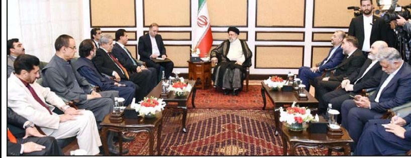
ISLAMABAD: Speaker National Assembly Sardar Ayaz Sadiq in a meeting with President of Iran Dr. Seyyed Ebrahim Raisi.

regional stability and prosperity. Expressing commitment to enhancing parliamentary cooperation, the chairman underscored the need for greater inter-parliamentary engagements and exchange programs aimed at bolstering the capacity and expertise of parliamentary staff. He also shared concerns over recent developments in Indian Illegally Occupied Jammu and Kashmir, highlighting the volatile situation and expressed gratitude for Iran's continued support towards the just cause of the Kashmiri people.