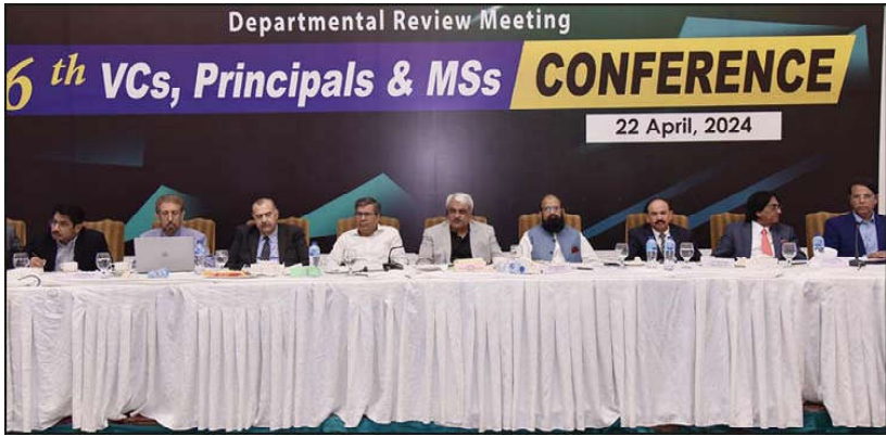
LAHORE: Provincial Minister for Health and Emergency Services Punjab Khawaja Salman Rafique addressing the participants of 6 th VCs, Principals and MSs conference.