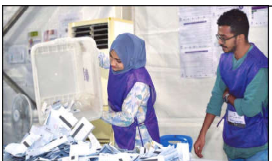
Officials count votes during the parliamentary elections, at a polling station in Maldives's capital Male.

during an Israeli raid on a refugee camp in the occupied West Bank. The Israeli army said it killed 10 people during the operation at Nur Shams camp. "Inside the Nasser Medical Complex there are mass graves dug by the Israeli occupation... we were shocked by the presence of bodies of 50 martyrs in one of the pits yesterday," said Mahmud Bassal, spokesman for the Gaza civil defence agency. "We are continuing the search operation today and are waiting for all graves to be exhumed in order to give a final number of martyrs." He said some of those killed had been tortured. "There were no clothes on some bodies, which certainly indicates (the victims) faced torture and abuse," Mr Bassal said.