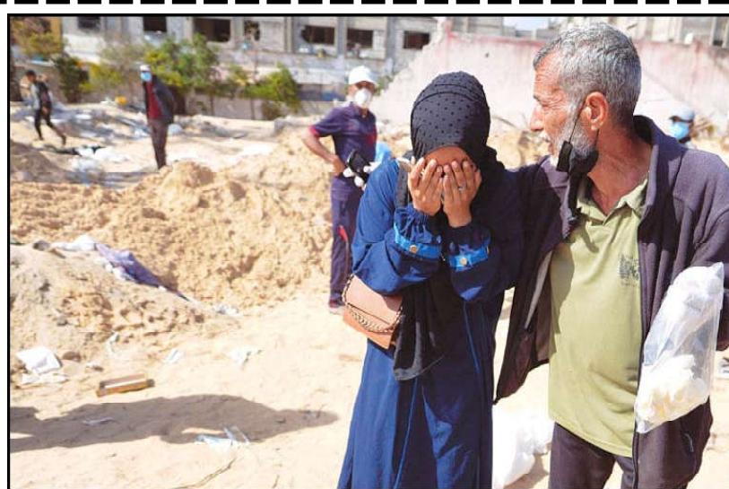
A grieving woman is consoled by a man after the body of her relative was discovered, buried by Israeli forces in a mass grave in the Nasser hospital compound in Khan Younis.

Greece will create two marine parks for the protection of sea mammals and birds — one in the Ionian Sea in western Greece and one in the central Aegean — has angered Turkey. Omer Celik, spokesman for Erdogan's ruling party, said last week that Ankara considers the creation of the marine parks "a step that sabotages the normalization process" in relations, and said Turkey would "in no way allow actions toward the declaration of marine parks in the Aegean Sea." Mitsotakis, speaking last week after a meeting of European leaders in Brussels, expressed surprise at what he described as "Turkey's totally unjustified reaction to an initiative which at the end of the day is of an environmental nature."