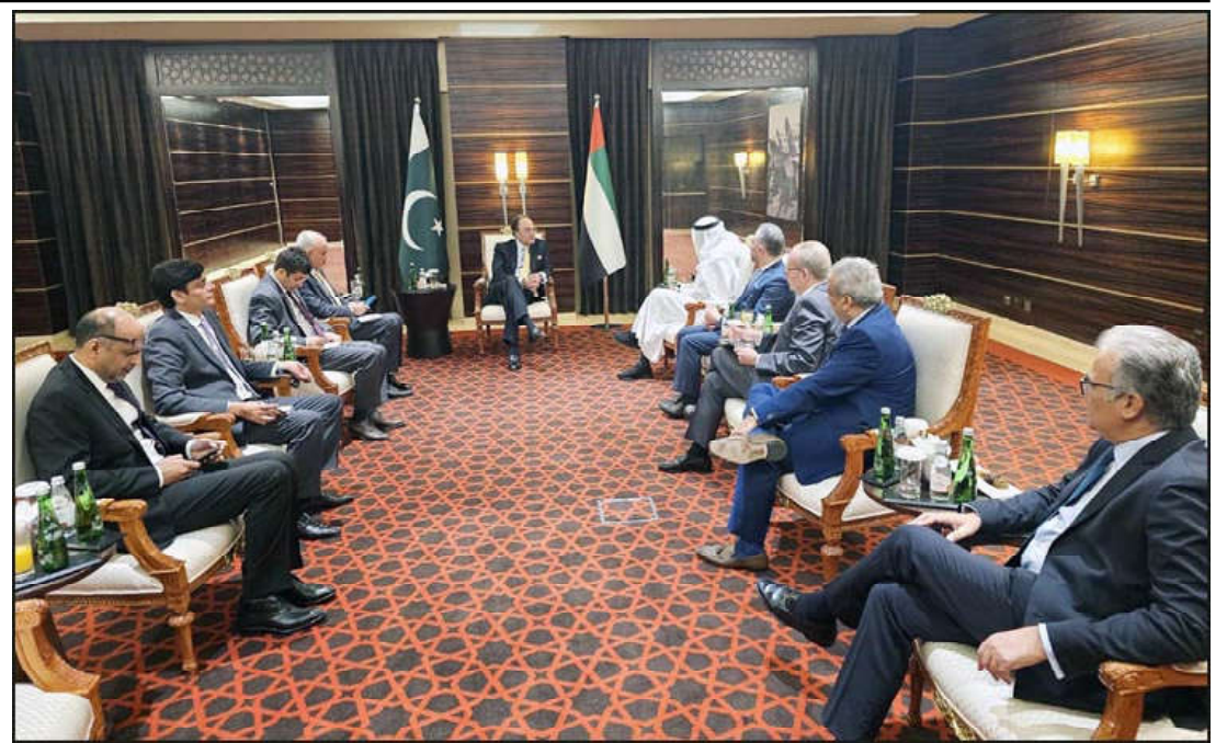
DUBAI: Finance Minister Muhammad Aurangzeb in a Meeting with Senior Officials of Mashreq Bank and First Abu Dhabi Bank.

country in the world with a significant youthful population, Pakistan recognized the critical importance of safeguarding food systems for future generations. Agriculture, he said, was the backbone of the country's economy, contributing substantially to its GDP and employing a significant portion of its labour force. Ambassador Usman Jadoon referred to Pakistan's 2022 devastating floods, which destroyed 4.4 million acres of standing crops, and said that the catastrophe led to a stark realization of the extreme vulnerability of food systems.