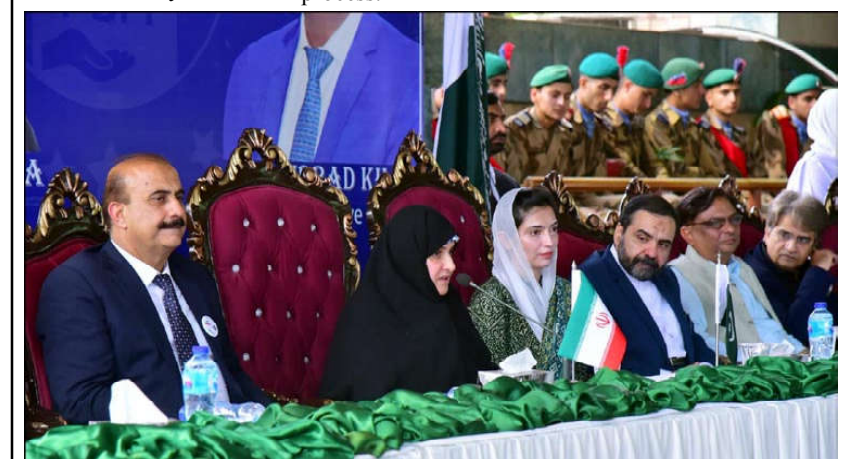
H.E. Dr. Jamileh Alamolhoda, wife of the Honourable President of the Islamic Republic of Iran paid a visit to Pakistan Sweet Home an orphanage for abandoned children across the country providing basic necessities of life including education and shelter Islamabad.

Sanauallah underscored that while the PML-N has consistently accepted electoral results, it has also diligently raised objections through proper channels. In contrast, he criticised PTI's approach, accusing its founder, Imran Khan, of attempting to undermine the electoral process.