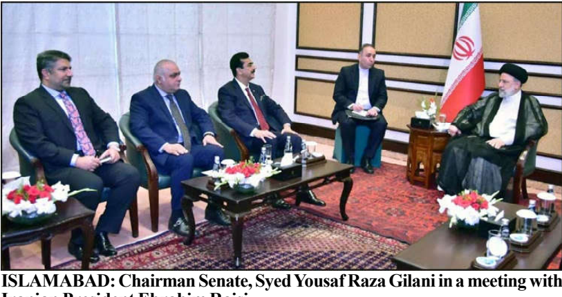
ISLAMABAD: Chairman Senate, Syed Yousaf Raza Gilani in a meeting with Iranian President Ebrahim Raisi.

acknowledged the critical importance of safeguarding the planet, its environment, and ecosystems. It highlights the detrimental impact of plastic pollution on Pakistan's environment. The resolution said the Ministry of Climate Change recognised the paramount importance of preserving the environment and ecosystems.