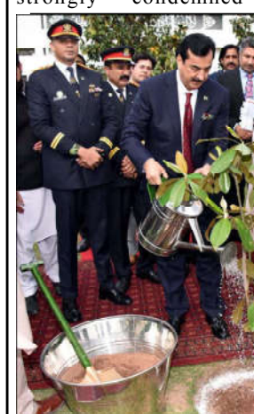
ISLAMABAD: Chairman Senate, Syed Yusuf Raza Gilani planting a sapling of magnolia tree in the lawn of the Parliament House.

President Zardari expressed deep concern over the worsening humanitarian situation in Gaza and strongly condemned