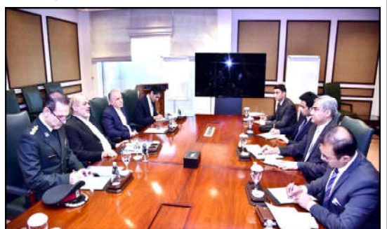
ISLAMABAD: Federal Minister for Interior Mohsin Naqvi in a meeting with his Iranian counterpart Dr. Ahmad Vahidi and Iran's Justice Minister Amin Hosein Rahimi.

They also agreed to cooperate in developing joint approaches to confront common challenges including the threat of terrorism.