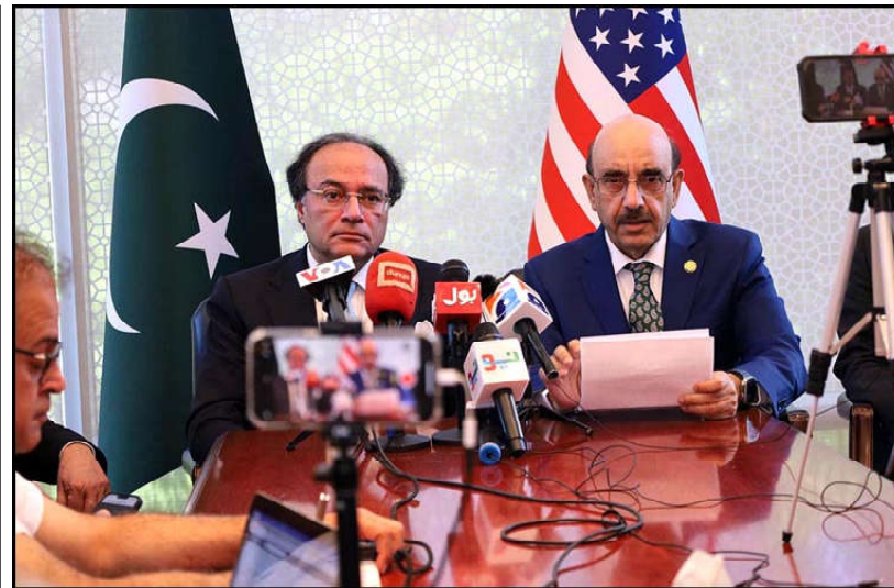
WASHINGTON DC: Finance Minister Mr. Muhammad Aurangzeb's interaction with Pakistani media at Pakistan Embassy.