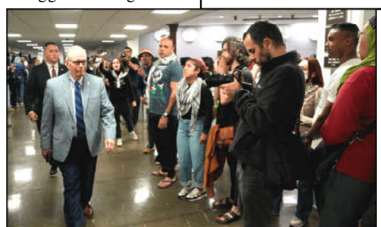
Lawmakers walk past pro-Palestinian protesters prior to a US House of Representatives vote on legislation providing $95 billion in security assistance to Ukraine, Israel and Taiwan, at Capitol Hill in Washington, US.

Monitoring Desk KYIV: Ukrainian President Volodymyr Zelenskiy expressed gratitude for the passage by the U.S. House of Representatives of a military aid bill for his country and said the assistance would save lives and "bring a just end" to the war with Russia. "I am grateful to the United States House of Representatives, both parties, and personally Speaker Mike Johnson for the decision that keeps history on the right track," Zelenskiy wrote on X. The president said the bill "will keep the war from expanding, save thousands and thousands of lives, and help both of our nations to become stronger." Minutes later, in his nightly video address, the president said the assistance "will be felt by our soldiers on the front lines" and praised the role of "American leadership" in preserving a rules-based international order.