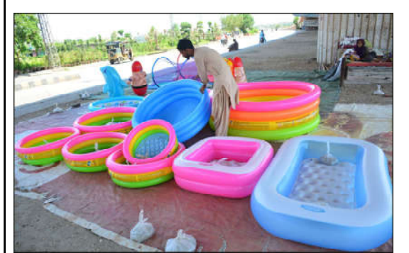
HYDERABAD: A vendor displaying the inflatable pools to attract the customers at roadside.

Faheemur Rehman Saigol said that the federal government raised the prices of petroleum products by up to Rs8.14 per liter this week, marking the second price hike in petroleum products this month. According to a notification, the price of petrol has been raised by Rs4.53 per liter, from Rs289.41 to Rs293.94 per liter.