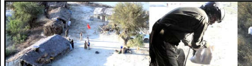
Pakistan Navy rescue teams air dropping ration bags to trapped people of Muradi, Dando and Kulanch near Gwadar.

Pakistan Navy Rescue teams immediately coordinated the efforts and air dropped ration bags to affected people of Muradi, Dando, Kulanch and adjoining isolated areas of Gwadar District. Pakistan Navy Sea King helicopters undertook multiple sorties to ensure ration supply to hundreds of stranded families.