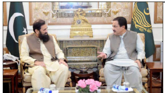
LAHORE: Deputy Chairman Senate Syedal Khan Nasir in a meeting with Governor Punjab Muhammad Balighur Rehman at Governor House.

to strengthen our democratic institutions for sustainable development of country. He said that the current leadership is taking concrete steps to address the challenges facing the country. Governor Punjab said that an economically self-sufficient, energetic Pakistan and a socially empowered society with high morals and mutual respect is our destination.