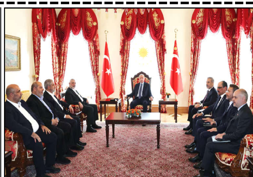
Turkey's President Tayyip Erdogan meets with Ismail Haniyeh, leader of the Palestinian Islamist group Hamas, in Istanbul, Turkey.

Monitoring Desk RAMALLAH: The Palestinian Authority will "reconsider" its relationship with the United States after Washington vetoed a Palestinian bid for full UN membership earlier this week, president Mahmud Abbas said on Saturday. "The Palestinian leadership will reconsider bilateral relations with the United States to ensure the protection of our people's interests, our cause, and our rights," Abbas told the official Palestinian news agency Wafa. Wafa said his remarks came "on the heels of the United States' use of veto power" at the UN Security Council. Thursday's vote saw 12 countries on the Council back a resolution recommending full Palestinian membership and two — Britain and Switzerland — abstain. Only the United States, Israel's staunchest ally, voted against, using its veto to block the resolution.