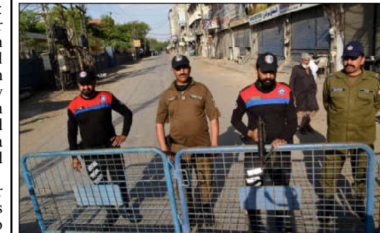
LAHORE: Police officials stand alert outside the polling station during the election 2024 at Barf Khana Chowk Railway Road.