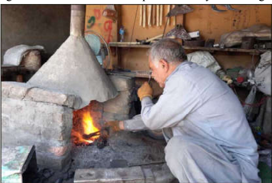
GILGIT: A blacksmith busy in making saw in traditional way on his work place at River view road.