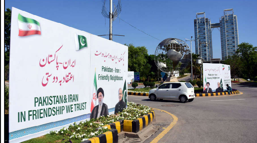
ISLAMABAD: The Constitution Avenue of Federal Capital decorated with Pak-Iran flags and banners ahead of visit of President of the Islamic Republic of Iran, Dr. Seyyed Ebrahim Raisi, undertaking an official visit to Pakistan from 22 to 24 April 2024.

ISLAMABAD (APP): The Election Commission of Pakistan (ECP) has introduced a proactive helpline, 051-111-327-000, for citizens to swiftly register and resolve by-election-related complaints round the clock. Official sources have confirmed that the helpline will assist in registering and resolving complaints, with the goal of improving accessibility and responsiveness in addressing concerns leading up to the by-elections. The ECP has established the Election Monitoring and Complaint Centre (EMCC) to facilitate.