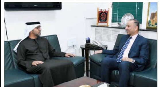
ISLAMABAD: Ambassador of UAE Hamad Obaid AlZaabi called on Federal Minister for Petroleum Dr. Musadik Malik.

The delegation thanked the prime minister for the warm welcome.