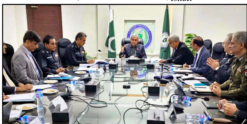
ISLAMABAD: Interior Minister Mohsin Naqvi chairing the meeting of National Action Plan Coordination Committee at NACTA Headquarters.