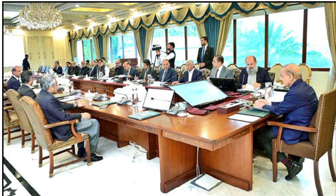
ISLAMABAD: Prime Minister Muhammad Shehbaz Sharif chairs a meeting regarding country wide Anti-smuggling drive.

Vol. XIV No. 92 Reg. mails-B/ID-445 Saturday April 20, 2024, Shawal 11, 1445 A.H. Ph: 2158688, 2158997 Pages 4: Rs. 12