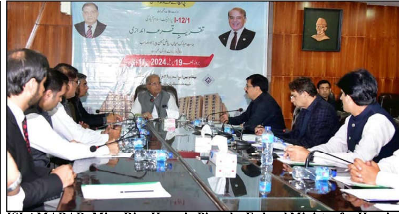
ISLAMABAD: Mian Riaz Hussain Pirzada, Federal Minister for Housing and Works attending the balloting ceremony of PHAF I-12/1 Apartments.

the last night's debate at the United Nations Security Council and its inability to reach consensus and recommend Palestine's membership of the UN to the General Assembly. We regret the U.S. decision to veto the draft resolution granting full membership of the UN to Palestine. We believe the time has come for admission of Palestine to the United Nations. This will be a step towards correcting the historic injustice suffered by the Palestinian people for over 75 years. It will affirm their right to self-determination. The people of Palestine have an inherent right to live in a sovereign, independent and contiguous Palestinian State within the 4 June 1967 borders and with Al-Quds Al-Sharief as its capital.