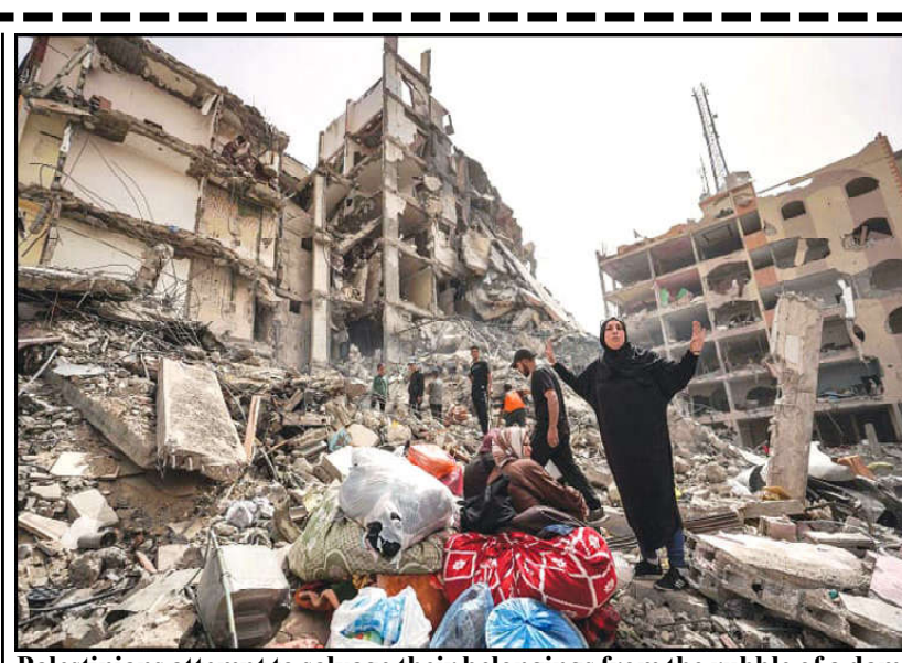
Palestinians attempt to salvage their belongings from the rubble of a damaged building in the city of Nuseirat, in central Gaza Strip.