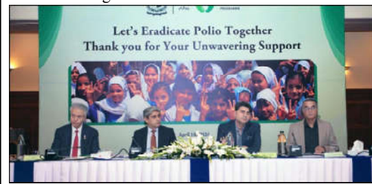
ISLAMABAD (APP): The National Emergency Operations Center for Polio Eradication on Friday apprised the donors on the progress of polio eradication efforts in the country. In this regard a brief-

The 7th Edition of LIIBS is jointly hosted by Nutshell Group and Unity Foods Limited, in collaboration with OICCI (Overseas Investors Chamber of Commerce and Industry), with Faysal Bank Limited as the Platinum partner, and InfraZamin Pakistan as the strategic partner.