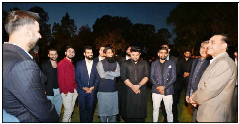
RAWALPINDI: General Syed Asim Munir, NI (M), Chief of Army Staff (COAS) interacting with players of Pakistan cricket team during an Iftar dinner hosted by him