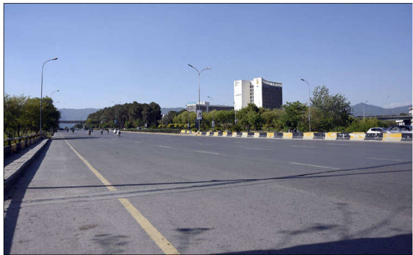
ISLAMABAD: A view of deserted Islamabad expressway due to Eid Ul Fitr Holidays in the Federal Capital.