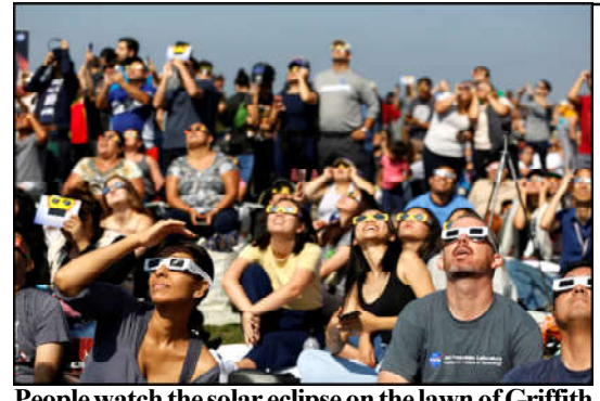
People watch the solar eclipse on the lawn of Griffith Observatory in Los Angeles, California, U.S.