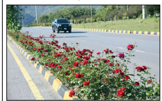
ISLAMABAD: A beautiful view of red rose flowers full blooming on a green belt at 7th Avenue in the Federal Capital.