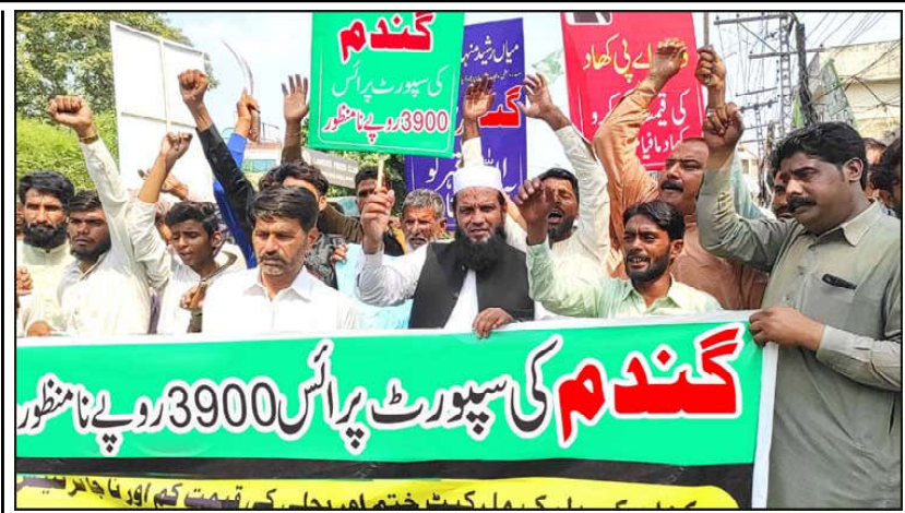
LAHORE: Members of Kissan Board Pakistan are holding protest demonstration against wheat support price, in Lahore.

ISLAMABAD (APP): Pakistani Rupee on Monday witnessed a devaluation of 02 paise against the US dollar in the interbank trading and closed at Rs277.94 against the previous day's closing of Rs277.92. However, according to the Forex Association of Pakistan (FAP), the buying and selling rates of the dollar in the open market stood at Rs277.3 and Rs280.4 respectively. The price of the Euro decreased by 09 paise to close at Rs301.07 against the last-day closing of Rs301.16, according to the State Bank of Pakistan (SBP). The Japanese Yen remained unchanged and closed at Rs1.83, whereas an increase of 10 paise was witnessed in the exchange rate of the British Pound, which was traded.