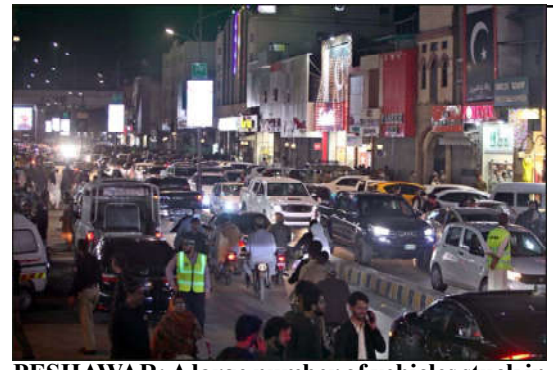
PESHAWAR: A large number of vehicles stuck in traffic jam at Saddar market while people busy in shopping as they are preparing for the occasion of Eid-ul-Fitar coming ahead, in Peshawar.