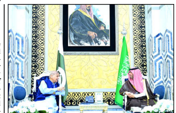
JEDDAH: Prime Minister Muhammad Shehbaz Sharif is seen off by Governor of Jeddah, Prince Saud bin Abdullah Al Jalawi at Jeddah International Airport.

LAHORE (APP): Prime Minister Muhammad Shehbaz Sharif, on Monday, arrived here after wrapping up his three-day visit to the Kingdom of Saudi Arabia (KSA). Earlier upon his departure at the Jeddah International Airport, the prime minister was seen off by Governor Jeddah Prince Saud bin Abdullah bin Jalawi, PM Office Media Wing said in a press release. During his visit, Prime Minister Sharif met with Crown Prince and Prime Minister of KSA Mohammed Bin Salman Bin Abdulaziz Al Saud and discussed further fortifying of the fraternal relations between the two brotherly nations and exploring avenues for enhanced collaboration across various sectors. The federal cabinet members and Punjab chief minister accompanied the prime minister during the visit. The prime minister performed Umrah and offered Nawafil inside Ka'aba as he was granted access inside 'Baitullah', as a special gesture.