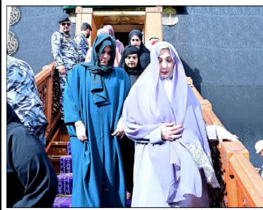
MAKKAH MUKARAMAH: Chief Minister Punjab Maryam Nawaz Sharif coming out of Khana Kaaba

ISLAMABAD (INP): The World Bank has approved $149.7 million dollars in financing for two projects in Pakistan, says in media reports. As per details, the funds were okayed to support the projects related to digital economy and improved flood resilience. This has been stated in a statement issued by the international financial institution. The allocated funding of 78 million dollars for the Digital Economy Enhancement Project is expected to enhance financial management through technology-driven solutions and data-driven decision-making. The investment in digital economy is also likely to streamline public services, increase transparency and foster economic growth. Simultaneously, the 71.7 million dollars allocation for Sindh Barrages Improvement Project is likely to ensure greater flood resilience.