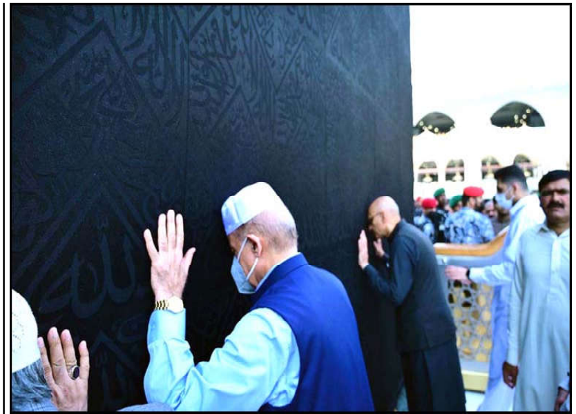
MAKKAH MUKARAMAH: Prime Minister Muhammad Shehbaz Sharif during Ziaaraat of Al Masjid e Haraam.