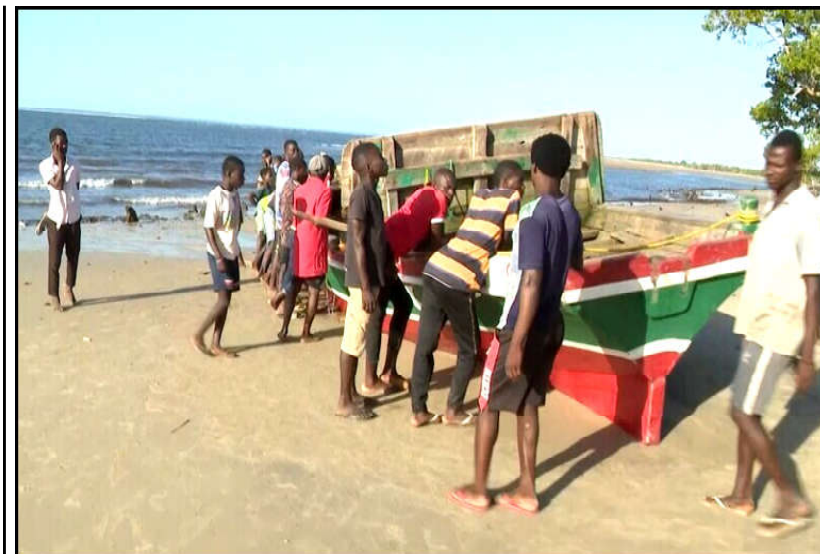
Boat that sunk off the north coast of Mozambique killing 96 people on the Island of Mozambique.