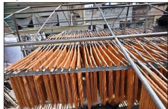
RAWALPINDI: A worker hanging vermicelli for dry at his workplace as demand increased for upcoming Eidul Fitr Festival.

Meher said that beyond these specific sectors, the delegation also emphasized the importance of strengthening overall bilateral trade cooperation between the two countries. By building upon existing economic ties and exploring new avenues for collaboration, they aimed to enhance mutual prosperity and contribute