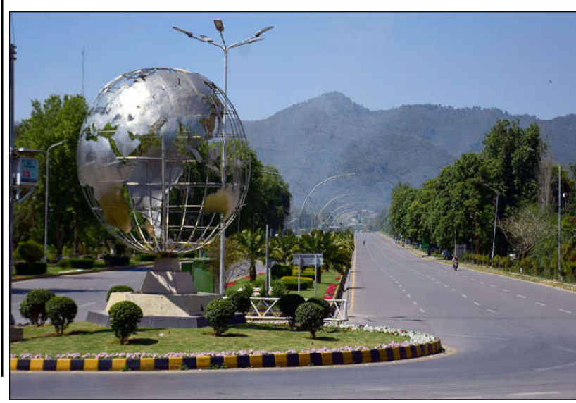
ISLAMABAD: A view of deserted Constitution Avenue during Sunday holiday in the Federal Capital.

This will enable the commencement of legal proceedings against the culprits. Victims are asked to submit their claims, along with required documents, to the office of the Director General, NAB Rawalpindi, the Investigation Officer at Investigation Wing-II, National Accountability Bureau (Rawalpindi), situated at Melody, Islamabad, G-6, Civic Centre. Contact details for inquiries include Fax: 051-9220832, Phone: 051-9222064, and email: rawalpindi@nab.gov.pk.