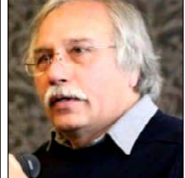
LAHORE, according to the family sources. The funeral prayers will be held in his hometown, Roshan Bheela in Kasur, at 10am on Monday.