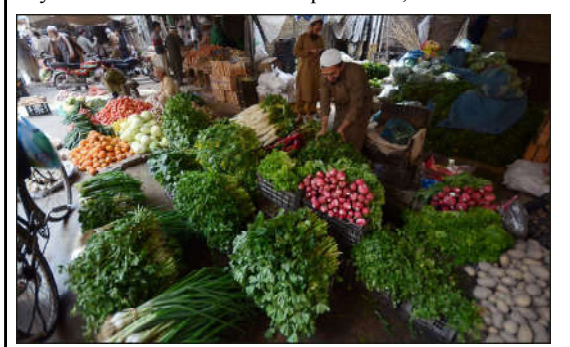
PESHAWAR: The shopkeeper is selling vegetables on city Sabzi mandi.