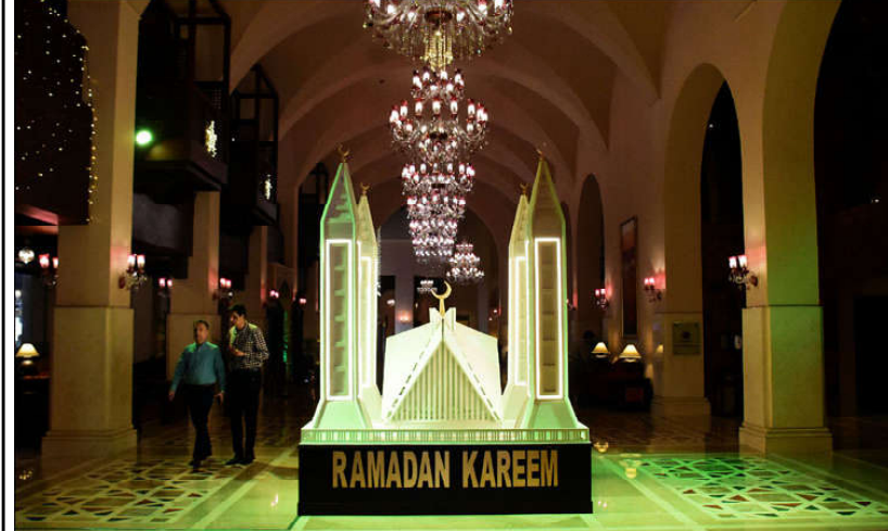
ISLAMABAD: A model of Faisal Mosque placed at a local hotel during Holy Month of Ramadan in the Federal Capital.

Sources said that all the post offices and courier services were directed not to open any 'suspicious' letter addressed to high-profile personalities.