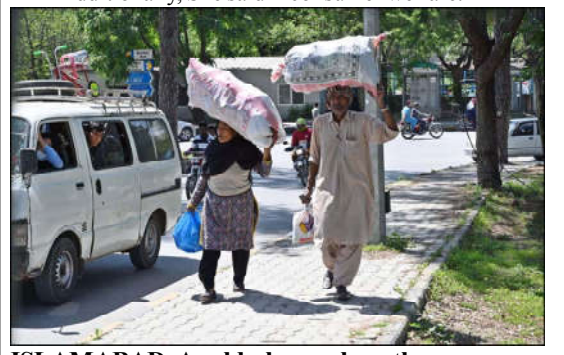
ISLAMABAD: An elderly couple on the way carrying bags on their head in Federal Capital.