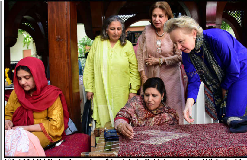
ISLAMABAD: Ambassador of Austria to Pakistan Andrea Wicke looking handmade work on a stall during Eid Bazaar, at a local hotel in Federal Capital.

ISLAMABAD (APP): Indus River System Authority (IRSA) on Sunday released 81,700 cusecs water from various rim stations with inflow of 84,100 cusecs. According to the data released by IRSA, water level in River Indus at Tarbela Dam was 1419.29 feet and was 21.29 feet higher than its dead level of 1,398 feet. Water inflow and outflow in the dam was recorded as 19,200 cusecs and 30,000 cusecs respectively. The water level in River Jhelum at Mangla Dam was 1101.50 feet, which was 51.50 feet higher than its dead level of 1,050 feet. The inflow and outflow of water was recorded 33,200 cusecs and 20,000 cusecs respectively. The release of water at Kalabagh, Taunsa, Guddu and Sukkur was recorded as 44,400, 34,100, 29,000 and 7,600 cusecs respectively. Similarly, from River Kabul, a total of 18,800 cusecs of water released at Nowshera and 7,700 cusecs released from River Chenab at Marala.