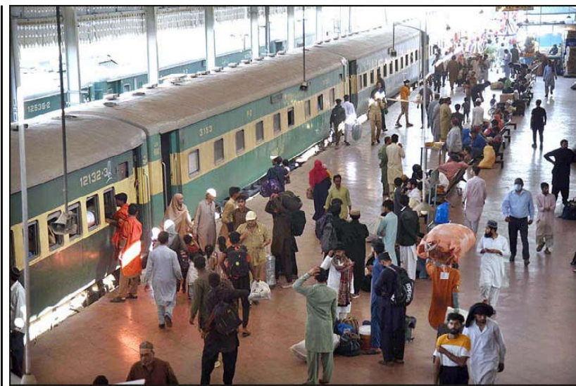
LAHORE: People boarding on train at Railway Station to leave for their hometowns to celebrate Eid-ul-Fitr with their loved ones.

officers to work with a renewed spirit of national reconstruction in view of the various challenges being faced by the province and focus on achieving the goals. He said that tourism and culture officers have to leave their offices and work side by side with the field staff for obtaining better results so that they could be aware of the ground realities of their respective fields. Likewise, he said development schemes should not be delayed in any way, while in case of unavoidable situations, financial or administrative difficulties should be directly brought to his notice so as to ensure its timely resolution at the highest level.