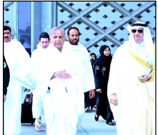
MAKKAH MUKARAMAH: Prime Minister Muhammad Shehbaz Sharif is being received by Ambassador of Saudi Arabia to Pakistan, Nawaf Al Saeed Al Maliki.

He had been fighting cancer and receiving treatment at Jinnah Hospital in