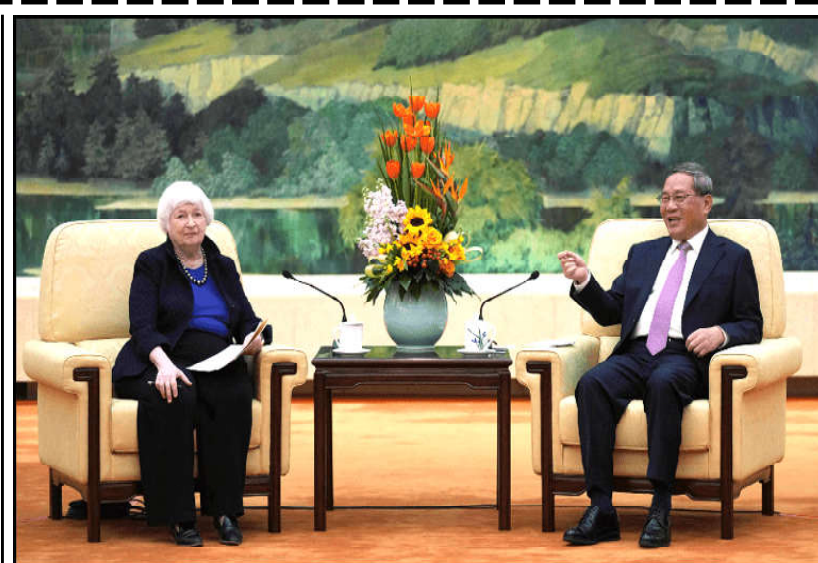
US Treasury Secretary Janet Yellen meets with Chinese Premier Li Qiang at the Great Hall of the People in Beijing.

"Local governments play a critical role, from boosting consumption to addressing overinvestment and Beijing of course has particular importance," she said. A senior treasury official told reporters on Saturday that Washington believes household spending needs to be a bigger part of China's economy. Speaking to professors from the Peking University National School of Development, Yellen said she was keen to hear their perspectives on "the potential long-term impacts of today's policy decisions".