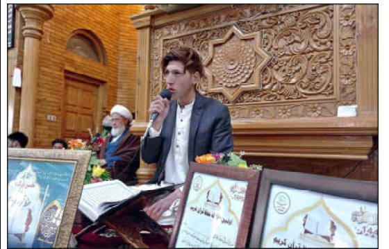
SKARDU: A participant reciting Holy Quran during the Husn-e-Qiraat and Hafiz Quran competition at Jamia Masjid Skardu-Baltistan in the Holy Month of Ramadan.