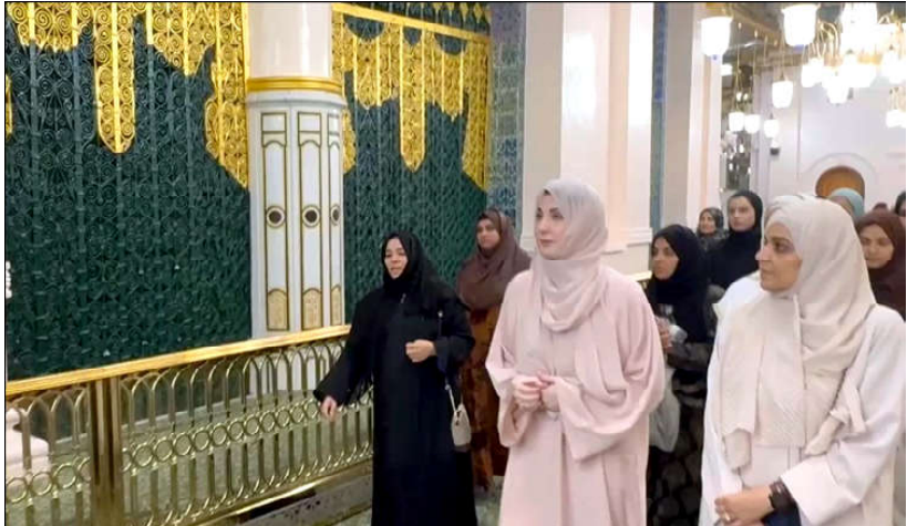
MADINA MUNAWWARAH: Chief Minister Punjab Maryam Nawaz Sharif paying respect at Roza-e-Rasool (SAWW)

Sanitization operation is being conducted to eliminate any other terrorist found in the area as the Security Forces of Pakistan are determined to wipe-out the menace of terrorism from the country.