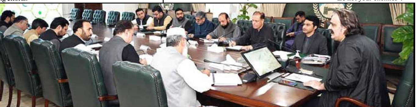
PESHAWAR: Chief Minister Khyber Pakhtunkhwa Ali Amin Khan Gandapur chairing a meeting of the Agriculture Department.