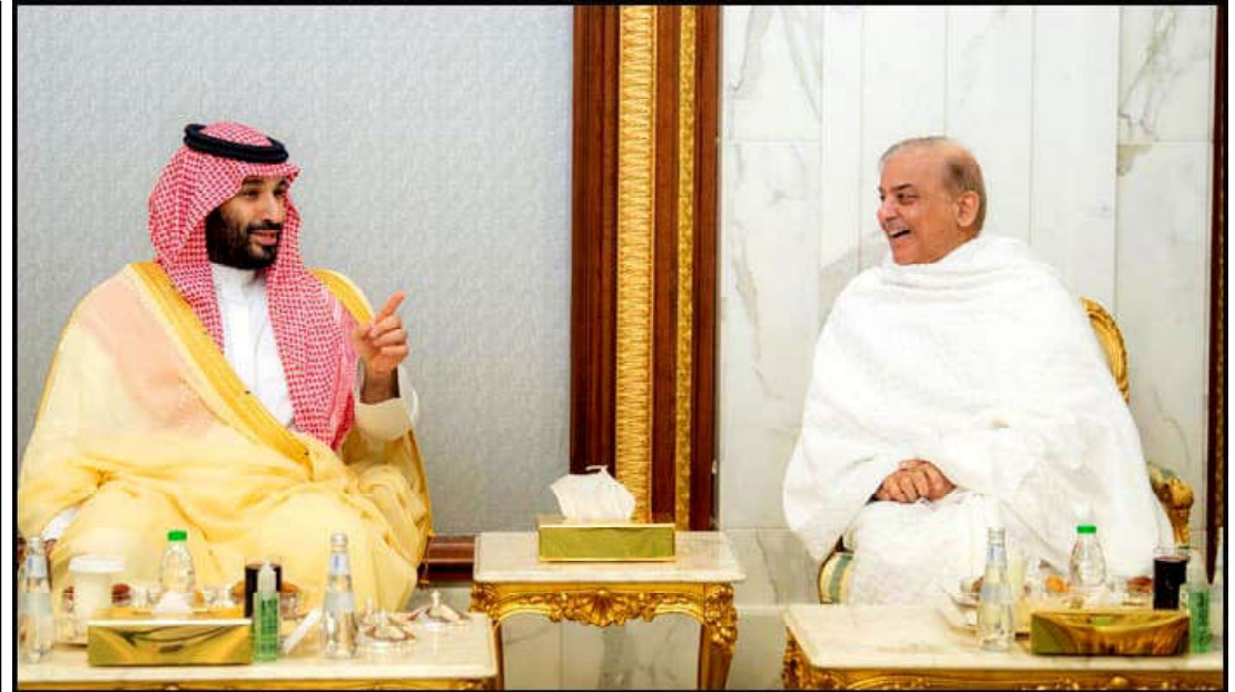
MAKKAH: Prime Minister Shehbaz Sharif meeting with Crown Prince Mohammed Bin Salman at Al-Safa Palace

During the visit of Saudi Arabia, Prime Minister Shehbaz Sharif will also meet Crown Prince Mohammed bin Salman bin Abdulaziz and discuss issues of mutual interest.