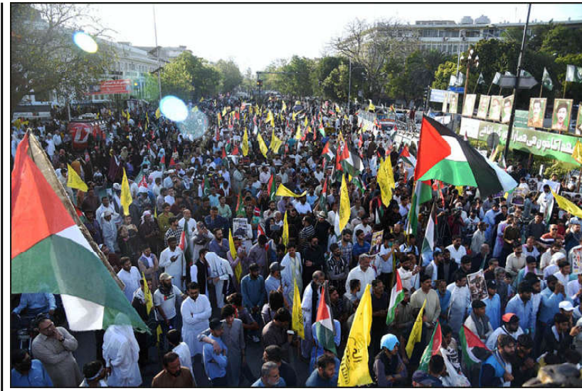
LAHORE: A large number of people participating in Al-Quds rally to express solidarity with the people of Palestine at Mall Road.

concerned to formally serve the notice to all unauthorized persons in this regard, adding that legal action would be taken against those who do not return the vehicles within the stipulated time frame. All such vehicles would be handed over to the police and other provincial departments on a need basis. He further directed that the defective and useless vehicles, currently parked at the warehouse of the Excise department, should also be auctioned in a transparent manner, and made it clear that these vehicles should not be handed over to anyone on political recommendation.