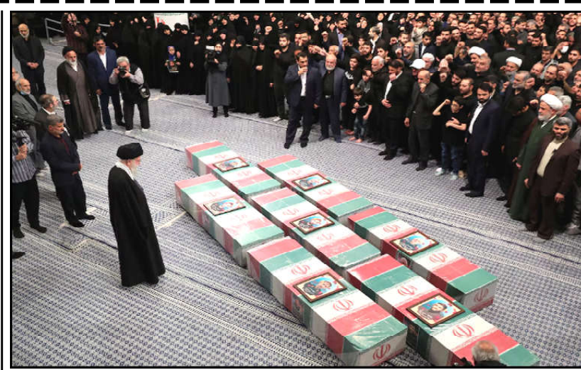
Iran's Supreme Leader, Ayatollah Ali Khamenei looks at the coffins of members of the Islamic Revolutionary Guard Corps who were killed in the Israeli airstrike on the Iranian embassy complex in the Syrian capital Damascus, during a funeral ceremony in Tehran, Iran.

Monitoring Desk BRUSSELS: The United States and European Union will continue to support Armenia and ethnic Armenians from the disputed Nagorno-Karabakh region, leaders from both sides of the Atlantic pledged as they were meeting with Prime Minister Nikol Pashinyan on Friday. Azerbaijan took control of the former breakaway region of Nagorno-Karabakh in September 2023, prompting a mass exodus of its ethnic Armenian population. "We're committed to further growing our support to Armenia's democratic and economic resilience," said U.S. Secretary of State Antony Blinken, adding Washington was backing the country's efforts for more food security, digital infrastructure and diversification of its energy sector. "And we will continue to support the 100,000 ethnic Armenians displaced from the Nagorno-Karabakh region. This is central to Armenia's long-term stability", Blinken added. Armenia is a treaty ally of Russia and traditionally Moscow's closest partner in the South Caucasus, but the two sides' relations have sharply deteriorated in recent months. Yerevan has sought to build ties with the West, blaming Russia for failing to defend it from Azerbaijan, its neighbour and longtime rival, as well as distancing itself from Moscow's war in Ukraine. Russia, Azerbaijan and Baku's close ally Turkey had criticised the Brussels meet-