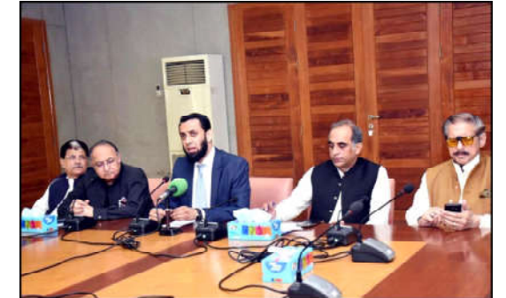
KARACHI: Mr. Attaullah Tarar, Federal Minister for Information and Broadcasting in a meeting with office-bearers of APNS.

He said health cards for medical treatment of journalists would be issued soon. Nobody would be allowed to violate rights of journalists and media work-