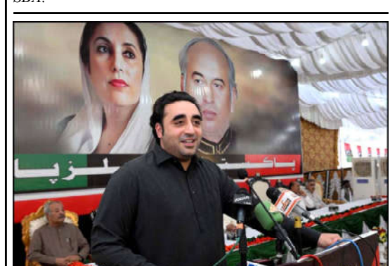
LARKANA: Chairman PPP Bilawal Bhutto Zardari addressing the Iftar organized in honor of Polling Agents, Polling Incharge and Constituency dignitaries of NA 194 Provincial Constituency PS 11 at Bhutto House Naudero.

The spokeswoman of the international lender gave an overview of rounds held between Pakistan and IMF and said: "So, on March 19, IMF staff and the Pakistani authorities reached staff-level agreement on the second and final review under Pakistan's Stand-By Arrangement, SBA."