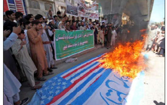
PESHAWAR: Participants are holding demonstration against USA and Israel as they are marking Youm-ul-Quds to show solidarity with people of Palestine, organized by National Ulama and Mashaikh Council outside Sunehri Mosque.