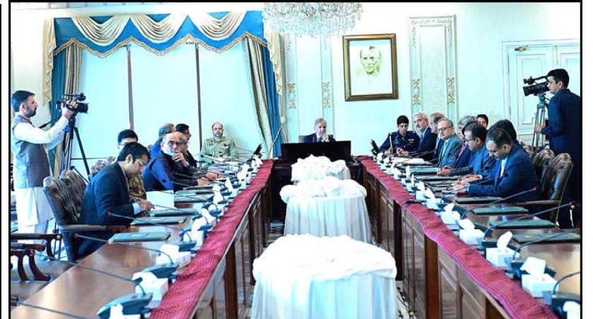
ISLAMABAD: Prime Minister Muhammad Shehbaz Sharif chairs a meeting regarding security situation in the country.

"It is critical to bring to justice the perpetrators, facilitators, financiers and sponsors of these extrajudicial and extraterritorial killings. India must be held accountable internationally for its blatant violation of international law," the spokesperson concluded.