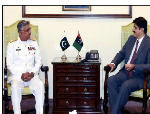
KARACHI: The Chief of Naval Staff Admiral Naveed Ashraf called on the Sindh Chief Minister Syed Murad Ali Shah at Chief Minister House.

At the moment, Gilani has the support of 24 senators from the PPP, 19 from PML-N, four from BAP, three from ANP, three independents and one from the National Party, taking the tally to 54.