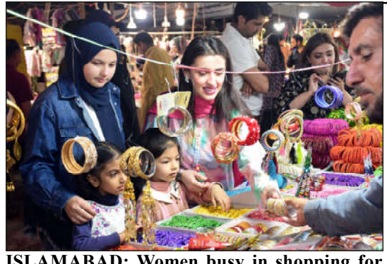
ISLAMABAD: Women busy in shopping for upcoming Eid ul Fitr Festival at a local market, in Federal Capital.

There are a number of innovative products that are today being smuggled into Pakistan due to high tariffs and this also creates a barrier for legal businesses to legally import and commercialise these products in Pakistan.