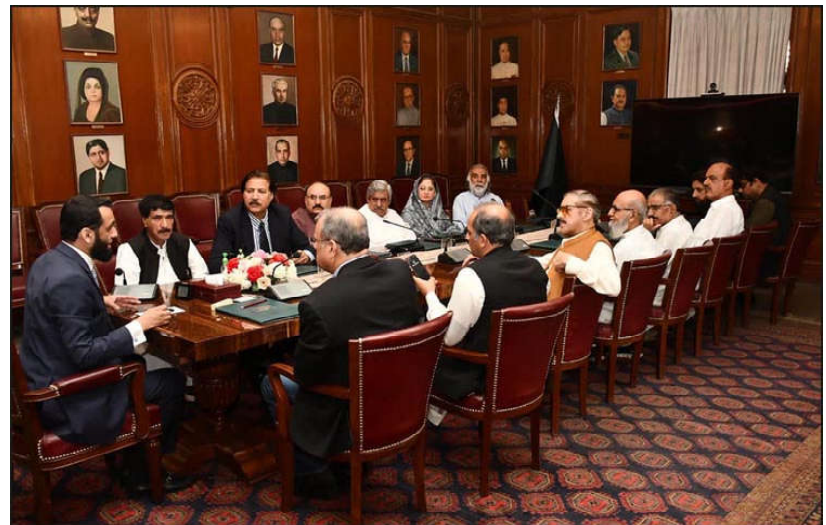
KARACHI: Mr. Attaullah Tarar, Federal Minister for Information and Broadcasting in a meeting with a delegation of CPNE.