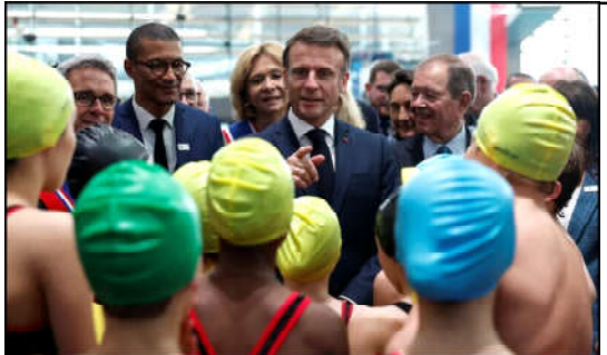
French President Emmanuel Macron talks to children after their swimming performance during the inauguration of the Olympic Aquatics Centre (CAO), a multifunctional venue for the 2024 Paris Olympic Games construction site which is under the management of the "Metropole Grand Paris" in Saint-Denis, near Paris, France.

Monitoring Desk DUBAI: Hamas official Osama Hamdan said on Thursday there has been no progress in Gaza ceasefire talks despite the Palestinian group showing flexibility. Hamdan said Israeli Prime Minister Benjamin Netanyahu was placing obstacles hindering both parties from reaching an agreement, and that he is "not interested" in releasing Israeli hostages. "The occupation government is still evading, and negotiations are stuck in a vicious circle," Hamdan said at a press conference held in Beirut. Egyptian and Qatari efforts, backed by the United States, have so far failed to achieve a ceasefire. While Hamas wants any ceasefire agreement to secure an end to the Israeli military offensive, Israel prefers a prisoners-for-hostage release deal, refusing to commit to ending its military campaign. In Gaza, Israeli bombardment continued to target areas across the Palestinian enclave, killing 62 people in the past 24 hours, the territory's health ministry said. The Israeli military released 101 Palestinians who had been detained by forces during the ground offensive in the past weeks and months. The detainees, many of whom complained of ill-treatment in Israeli jails, were freed through the Israeli Kerem Shalom crossing into the southern Gaza Strip. More than 33,037 Palestinians have been killed and 75,668 have been injured in Israel's military offensive on Gaza since Oct 7, the Gaza health ministry said in a statement on Thursday.