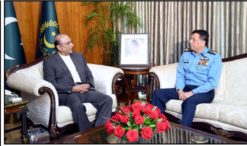
ISLAMABAD: Chief of the Air Staff, Air Chief Marshal Zaheer Ahmed Baber Sidhu, calls on President Asif Ali Zardari, at Aiwan-e-Sadr.