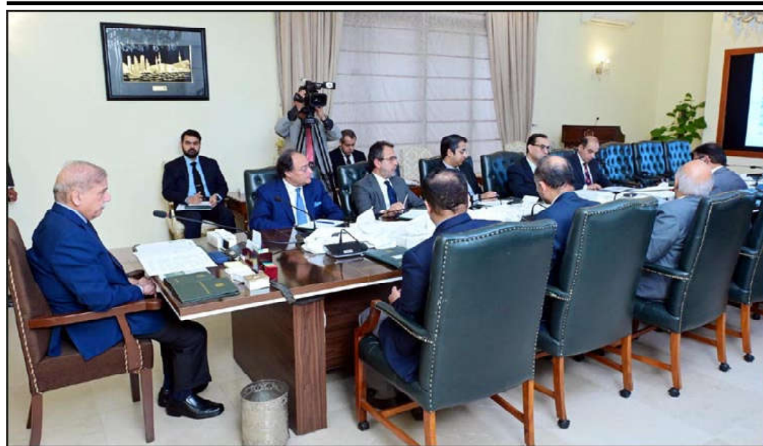
Prime Minister Muhammad Shehbaz Sharif chairs a sectoral meeting regarding Ministry of Finance in Islamabad.

ISLAMABAD (APP): Prime Minister Shehbaz Sharif Thursday directed that a comprehensive plan for increase in revenue should be prepared without putting burden on the common man.