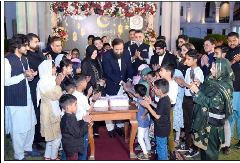
LAHORE: Governor Punjab Muhammad Balighur Rehman cutting the cake during Iftar dinner organized by Pakistan Youth Parliament in honour of children belonging to different Sweet Homes at Governor House Lahore.

should be taken to provide maximum facilities to the farmers and the GIS system should be used for the collection of water and other related taxes. The Chief Minister said that punishments and fines should be increased to prevent water theft and other illegal activities. The irrigation department should pay special attention to digitize all its affairs, Ali Amin Gandapur told the meeting. Set timelines in contracts for all works department development projects and penalties should be imposed on the contractor in case of non-progress on the contracts within the stipulated timelines, the CM warned.