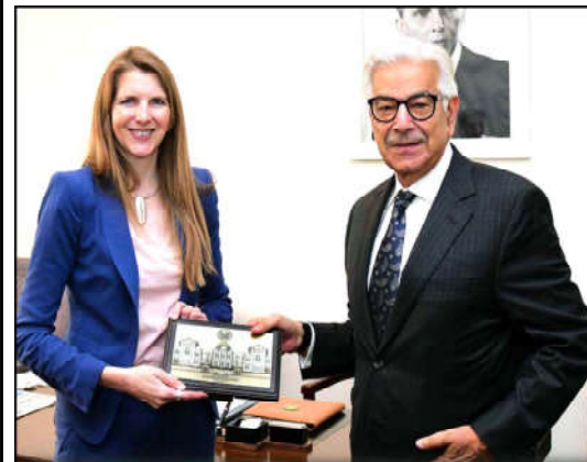
ISLAMABAD: Minister for Defence, Khawaja Muhammad Asif presenting a souvenir to British High Commissioner, Ms. Jane Marriott.

ISLAMABAD (APP) - British High Commissioner, Jane Marriott called on Minister for Defence, Khawaja Muhammad Asif here on Thursday. The defence minister expressed satisfaction over ongoing collaboration between the two countries for regional stability. Both sides stressed the need for expansion of defence and security ties between two countries. The minister and the high commissioner expressed satisfaction over ongoing collaboration between the two countries for regional stability. Both sides stressed the need for expansion of defence and security ties between two countries.