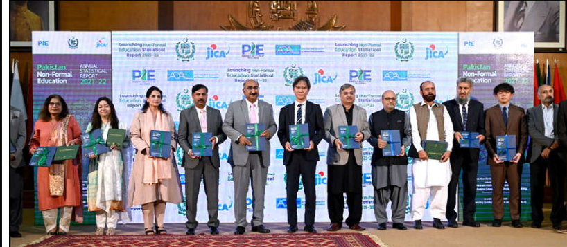
ISLAMABAD: The launching ceremony of Pakistan Non Formal Education Annual Statistical Report 2021-22 jointly organized by Pakistan Institute for Education-PIE, Ministry of Federal Education and Professional Training & JICA-AQAL Project at Allama Iqbal Open University.

ISLAMABAD (APP): Federal Board of Revenue (FBR) Spokesperson on Thursday said that all unregistered wholesalers, retailers, dealers and all shopkeepers must register by 30 April 2024 under Trader Friendly Scheme. He said that already registered shopkeepers don't need to re-register for the Scheme.