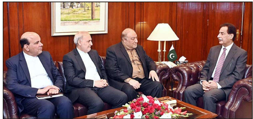
ISLAMABAD: Speaker National Assembly Sardar Ayaz Sadiq in a meeting with Iranian Parliamentary Delegation at Parliament House.

the Gaza Strip. Moreover, the resolution underscores the urgency of preventing the sale or transfer of explosives and other military equipment to Israel, emphasizing the need to curb the proliferation of arms that exacerbates the ongoing conflict in the region. The proposal has garnered widespread support from the majority of OIC member countries, reflecting a collective effort to address the longstanding humanitarian and security concerns stemming from the Israeli-Palestinian conflict. The resolution symbolizes a unified stance against the injustices and violations of international law perpetrated by Israel, particularly in its treatment of the Palestinian population.