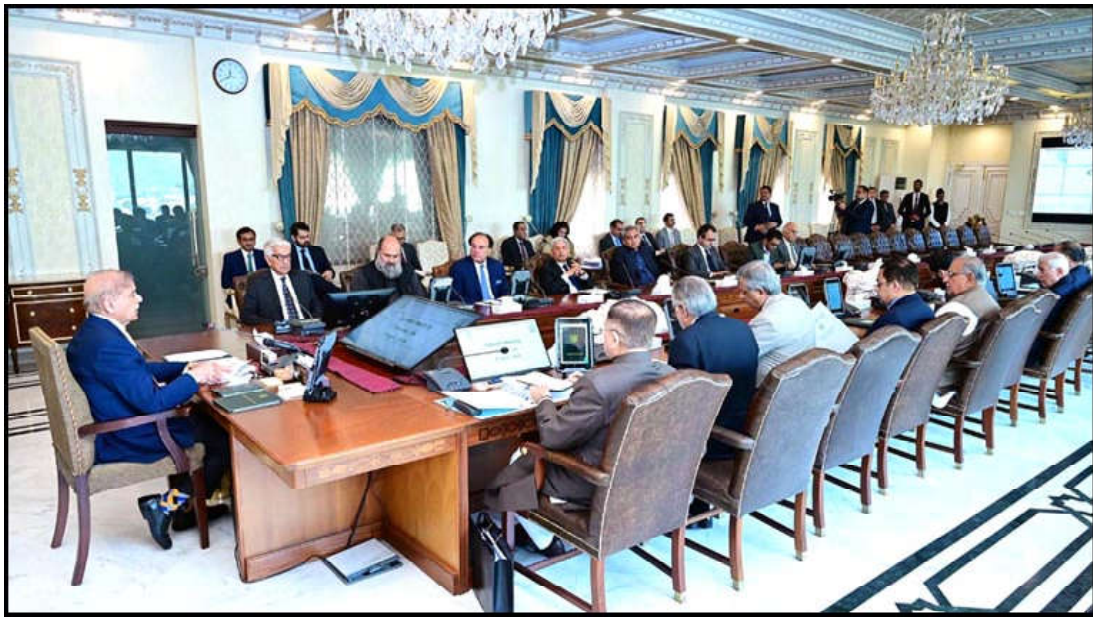
ISLAMABAD: Prime Minister Muhammad Shehbaz Sharif chairs a meeting of the Federal Cabinet.

Vol. XIV No. 81 Reg. mails-B / ID-445 Friday April 05, 2024, Ramzan 25, 1445 A.H. Ph: 2158688, 2158997 Pages 4: Rs. 12