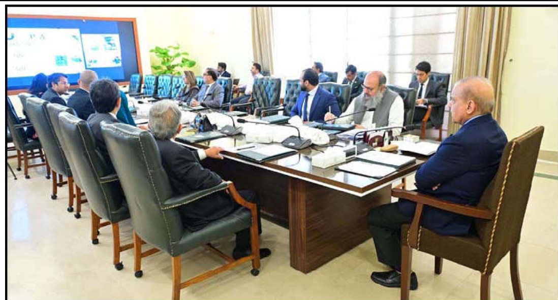
ISLAMABAD: Prime Minister Muhammad Shehbaz Sharif chairs a meeting regarding export sector.

World Bank's latest Pakistan Development Update titled Fiscal Impact of Federal State-Owned Enterprises, this subdued recovery reflects tight monetary and fiscal policy, continued import management measures aimed at preserving scarce foreign reserves, and muted economic activity amid weak confidence. The Update also