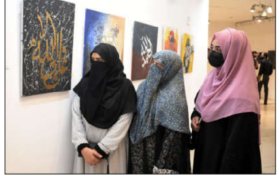
LAHORE: Students watching the calligraphy exhibition at Alhamra Art Council.

MULTAN (APP): field teams across the province. BISP was country's biggest social protection program and disbursement of Feb-Mar, third quarter of the ongoing fiscal year, was in progress to cover over 4.394 million registered families living below the poverty line.