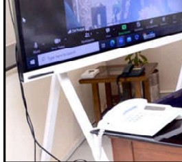
ISLAMABAD: Federal Minister for Power, Sardar Awaiz Ahmad Khan Leghari and Chief Minister Punjab Ms. Maryam Nawaz Sharif in a virtual meeting.