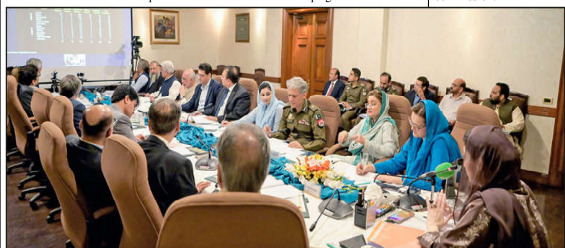
LAHORE: Punjab Chief Minister Maryam Nawaz Sharif chairing a special meeting focusing on electricity theft, established a task force to tackle electricity pilferage at the district level.