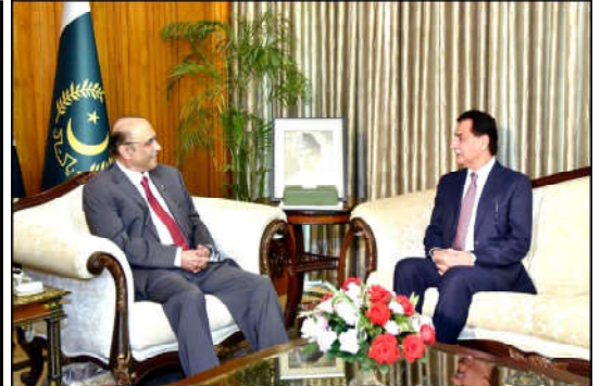
ISLAMABAD: Speaker National Assembly, Sardar Ayaz Sadiq, called on President Asif Ali Zardari, at Aiwan-e-Sadr.