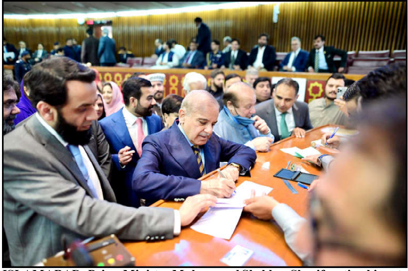
ISLAMABAD: Prime Minister Muhammad Shehbaz Sharif casting his vote at the Senate elections at Parliament House.

Vol. XIV No. 79 Reg. mails-B/ID-445 Wednesday April 03, 2024, Ramzan 23, 1445 A.H. Ph: 2158688, 2158997 Pages 4: Rs. 12