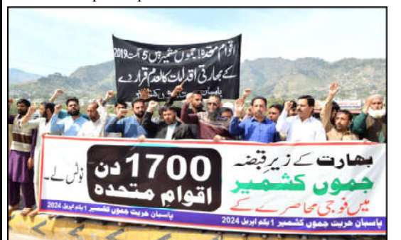
MUZAFFARABAD: Kashmiris protesting against Indian brutality and demanding UN to take action on completion of 1700 days of Indian military siege on occupied Kashmir in the city.

Wang Wenbin remarked that China firmly safeguards the safety and security of Chinese nationals, projects and institutions overseas. "China will provide necessary assistance to Pakistan in the investigation of the case," he said.