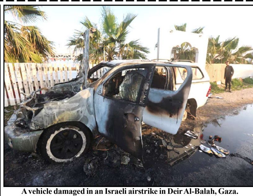
A vehicle damaged in an Israeli airstrike in Deir Al-Balah, Gaza.

WASHINGTON: President Joe Biden and Chinese President Xi Jinping discussed Taiwan, artificial intelligence and security issues Tuesday in a call meant to demonstrate a return to regular leader-to-leader dialogue between the two powers.