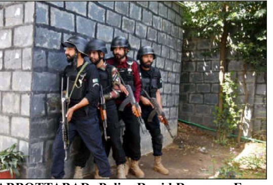
ABBOTTABAD: Police Rapid Response Force officials are taking part in mock exercise as a practice to defend in perception of any terrorist attack, held in Abbottabad.