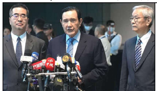
Taiwan's former president Ma Ying-jeou speaks to journalists ahead of his visit to China at the Taoyuan International Airport in Taoyuan.

TEHRAN: Iran's President Ebrahim Raisi on Tuesday condemned a deadly air strike blamed on Israel against his country's consular annex in Damascus, saying the "cowardly crime will not go unanswered".