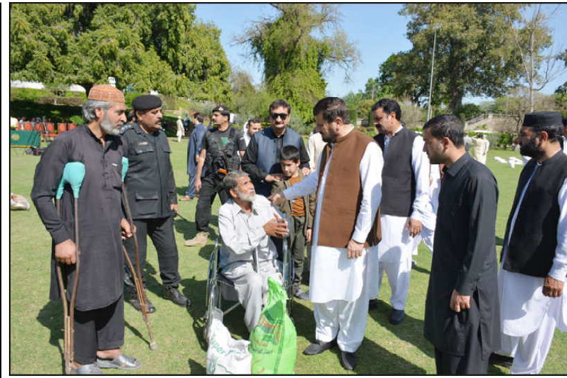
PESHAWAR: Governor Khyber Pakhtunkhwa Haji Ghulam Ali meeting with an elder disabled citizen during Ramzan ration distribution ceremony.

transgender in the burial of a community member as people did not allow them to perform the last rituals of the deceased in their respective graveyards. Chief Minister Ali Amin Gandapur also held out assurance of inviting the transgender community to the CM house for a meeting with him. It merits a mention here that Governor Haji Ghulam Ali in a unique gesture of humility and humbleness, spent his Sunday holiday with 300 transgender of Peshawar by extending them special invitations for visiting the Governor House to share their problems and receive Ramzan Food packages.