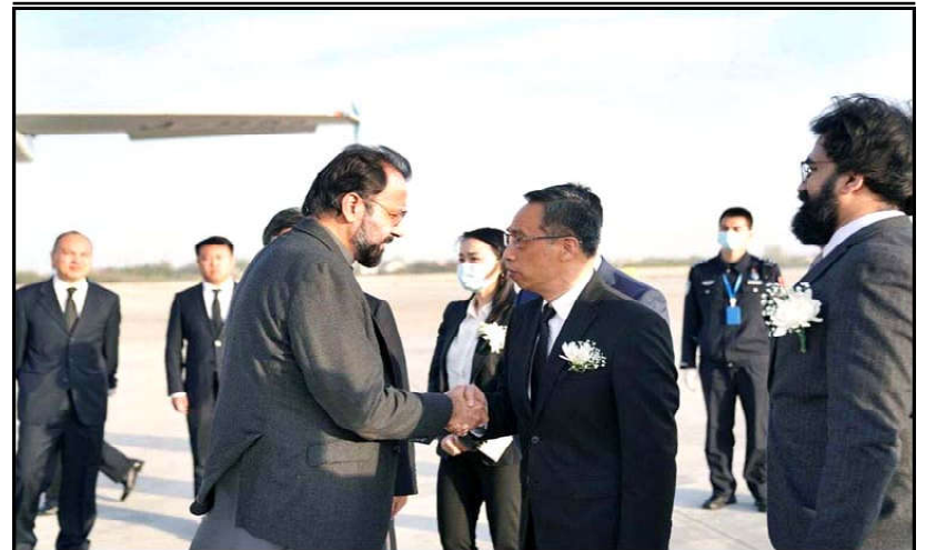
WUHAN: To express solidarity with the government and people of China, Chaudhry Salik Hussain, Federal Minister for Overseas Pakistanis and Human Resource Development arrived in Wuhan, China, on the special flight that carried the mortal remains of five Chinese personnel, who died in a terrorist attack on 26 March, 2024.

larger bench headed by the CJP will take up the case on Wednesday. Justice Mansoor Ali Shah, Justice Yahya Afridi, Justice Jamal Mandokhail, Justice Atiq Minallah, Justice Musarrat Hilali and Justice Naem Akhtar Afghan will be the members of the larger bench. The hearing will take place at 11-30am on Wednesday.