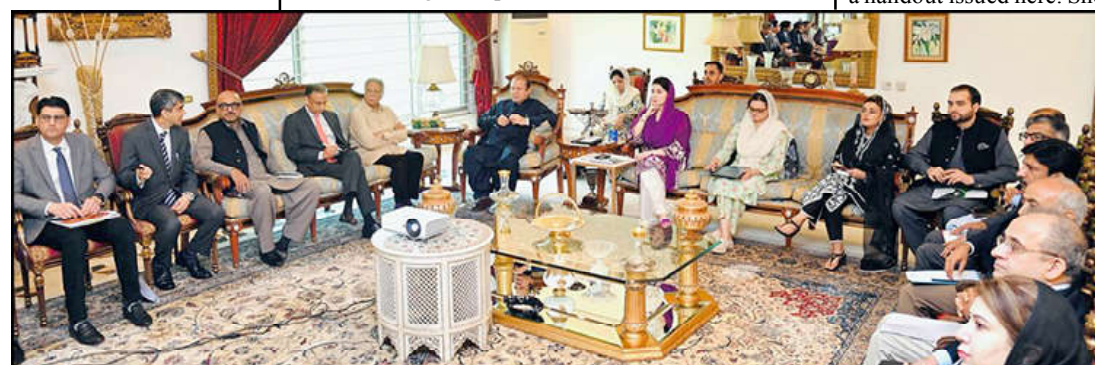
LAHORE: Chief Minister Punjab Maryam Nawaz and Quaid PML-N Muhammad Nawaz Sharif presiding over a meeting regarding Agriculture Department.

However, Asif expressed cautious optimism for a turnaround within the next 18 to 24 months, citing the government's strategic policies as the beacon of hope.