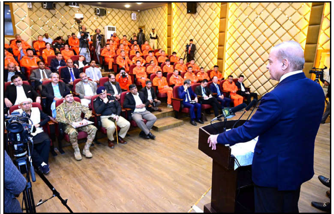
Prime Minister Muhammad Shehbaz Sharif addresses the Chinese Engineers and government officials at Kass camp of China Gezhouba Group Company (CGGC).

He also assured the Chinese leadership, the people and the Chinese ambassador that all foolproof security arrangements would be made for the Chinese people working and supporting a prosperous and developing Pakistan.