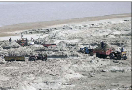
MULTAN: Labourers are busy loading sand on the tractor trolleys from the dry bed of the Chenab River.

supply, green urban spaces and integrated solid waste management. Besides Peshawar, the project is also going on in four cities of the KP including Mingora, Kohat, Mardan and Abbottabad. "Water Sanitations Services Peshawar (WSSP) is working in 5 operational zones of Peshawar. In these zones, there are 34 water tanks (water reservoirs) in which 23 will be reconstructed while 10 will be rehabilitated" said in the briefing. However, for collection of garbage, small and large loaders will be used aimed at cleaning the city, no waste touching the ground and for climate friendly disposal of solid waste. The ministers were further informed that those water reservoirs will be solarized where there is no issue of space.