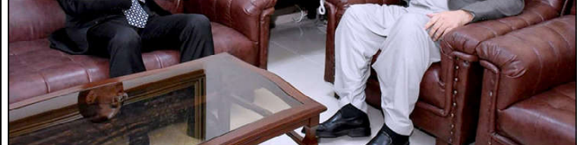
ISLAMABAD: Federal Minister for Commerce, Jam Kamal Khan and Ambassador WADA Mitsuhiro in a meeting to discuss ways to strengthen trade relations and mutual trust between Japan and Pakistan.

It would help attract private investment in crucial sectors like roads, housing, healthcare, education, water & sanitation, and technology, following a programmatic approach to implement core policy, legal and institutional reforms and build capacity within relevant institutions to ensure long-term sustainability. "It aligns with Pakistan's Vision 2025 pillars, which aim to transform Pakistan's economy into one of the top 10 in the world by 2047."