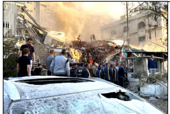
Smoke rises after what the Iranian media said was an Israeli strike on a building close to the Iranian embassy in Damascus, Syria.