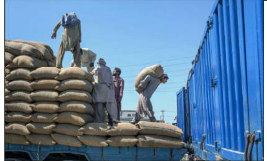
ISLAMABAD: Laborers busy unloading wheat sacks from delivery truck at grain Market in the Federal Capital.