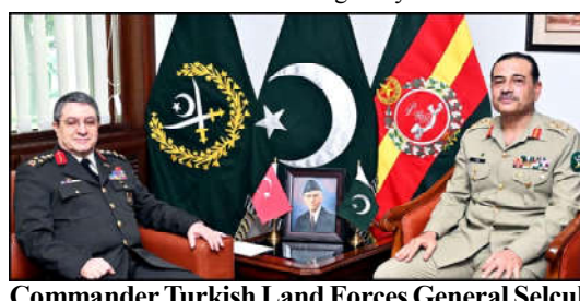
Commander Turkish Land Forces General Selcuk Bayraktaroglu meeting with Chief of Army Staff General Asim Munir at General Headquarters in