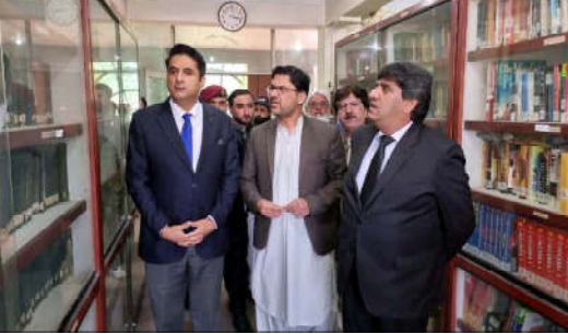
QUETTA: Justice of the Balochistan High Court (BHC), Shaukat Ali Rakhshani being briefed by Hamza Shafqat Commissioner and Administrator Quetta during his visit to Sandeman Library of Metropolitan Corporation.

The minister announced an additional onemonth extension for training completion and salary ficers, and their families, increments for officers.