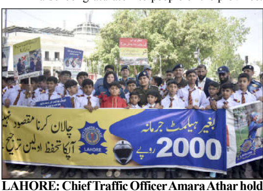
a banner along with students during Traffic Awareness walk (Use Helmet) at Faisal Chowk in the Provincial Capital.