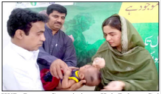
HUB: Deputy Commissioner Hub Rohana Gul Kakar inaugurating anti-polio drop