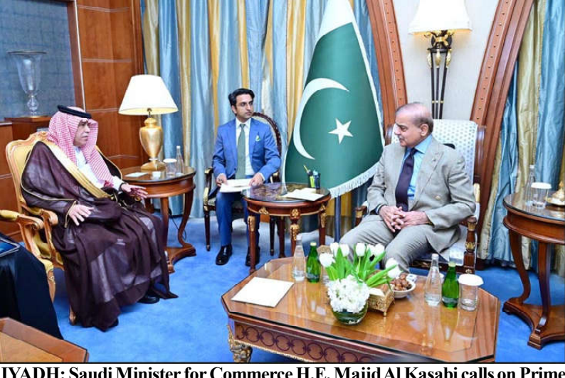
RIYADH: Saudi Minister for Commerce H.E. Majid Al Kasabi calls on Prime Minister Muhammad Shehbaz Sharif.