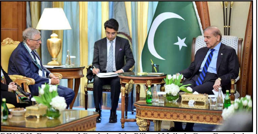
RIYADH: Founder and Co-chair of the Bill and Melinda Gates Foundation Bill Gates calls on Prime Minister Muhammad Shehbaz Sharif on the sidelines of a special meeting of the World Economic Forum.

Condemning the human rights violations and the atrocities being committed by the Indian occupation forces in IIOJK, he called upon the international community to put pressure on India to end human rights violations being committed by its security forces and implement the UN Security Council resolutions.