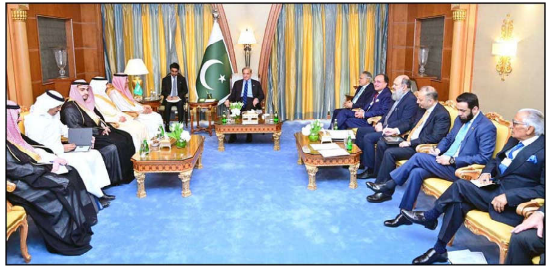
RIYADH: Saudi Minister for Finance H.E. Mohammad Al Jadaan calls on Prime Minister Muhammad Shehbaz Sharif on the sidelines of a Special Meeting of the World Economic Forum.

The prime minister also met the Saudi Minister for Industry. The Saudi minister for industry expressed keen interest for collaboration with Pakistan in the fields of agriculture, mining, information technology and other areas and informed about the progress made in this regard. The Saudi minister said he was in contact with the Saudi private companies regarding investment in Pakistan and the representatives of these companies would soon visit Pakistan.