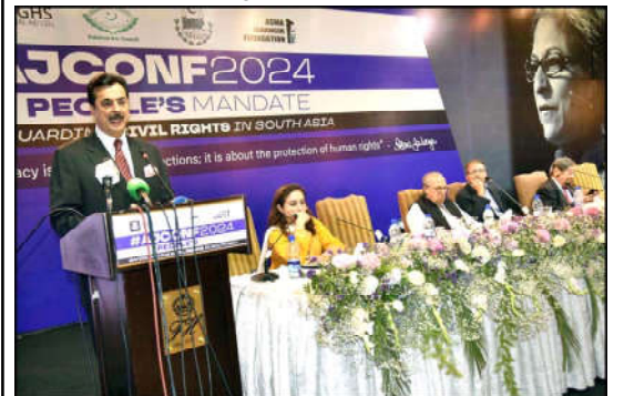
LAHORE: Chairman Senate, Syed Yusuf Raza Gillani addressing to Asma Jahangir conference.

for supporting Pakistan in securing the USD 3 billion Standby Arrangement (SBA) from IMF last year that was about to be completed. The IMF Executive Board is expected to meet on April 29 to decide on the final tranche of USD 1.1 billion under SBA. The IMF chief appreciated the prime minister's leadership for timely securing the SBA last year. Both sides also discussed Pakistan entering into another IMF program to ensure that the gains made in the past year were consolidated and its economic growth trajectory remained positive. IMF MD shared her institution's perspective on the ongoing program with Pakistan, including the review process.