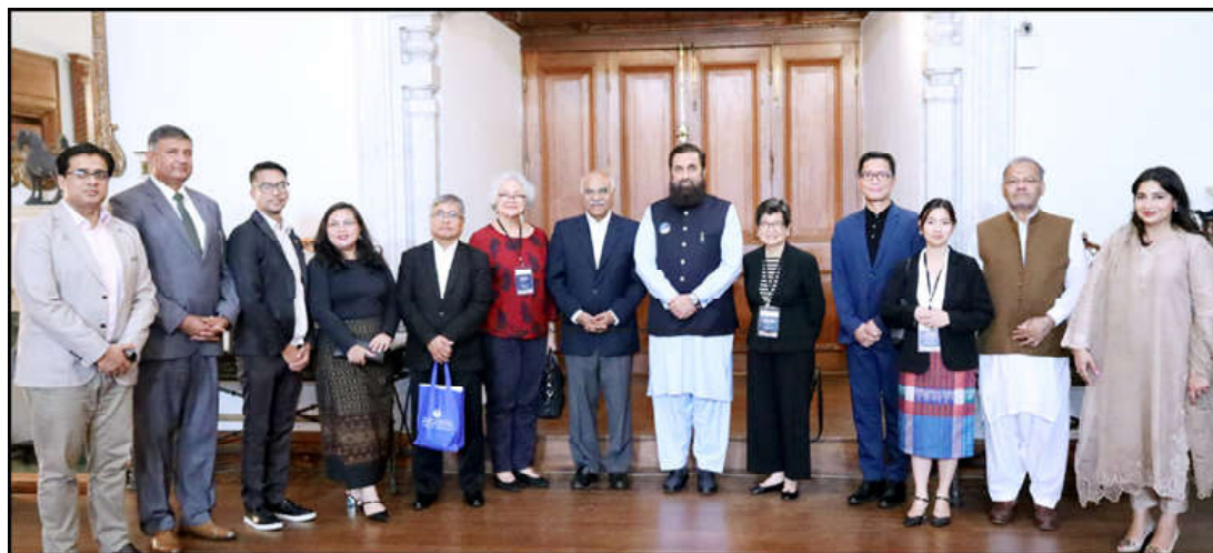
LAHORE: Governor Punjab, Muhammad Balighur Rehman in a group photo with the delegation of Ramon Magsaysay Award Foundation at Governor House.

the government in poverty alleviation and social development. Governor Punjab said that people to people contact is very important in the relations between the two countries. He said that many foreign delegations meet him and tell him that got a different perception about Pakistan from media before visiting, but they found it otherwise.