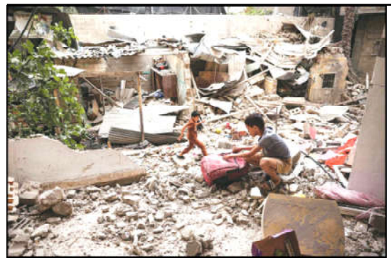
A Palestinian child salvages objects from the debris of a house destroyed by overnight Israeli bombardment in Rafah area of southern Gaza Strip.

put out fires at several energy facilities in the western regions of Lviv and Ivano-Frankivsk, which border Nato members Poland and Romania. After strikes on energy facilities in the central Dnipropetrovsk region, running water supplies were disrupted in President Volodymyr Zelensky's hometown of Kryvyi Rih, officials said. Ukrainian air defences brought down 21 of the 34 incoming missiles, the commander of the air force said in a statement. None of the facilities hit was identified by name, a security measure intended to prevent Russia quickly assessing the impact of its strikes. Russia denies targeting civilians, but says the Ukrainian energy system is a legitimate military target.