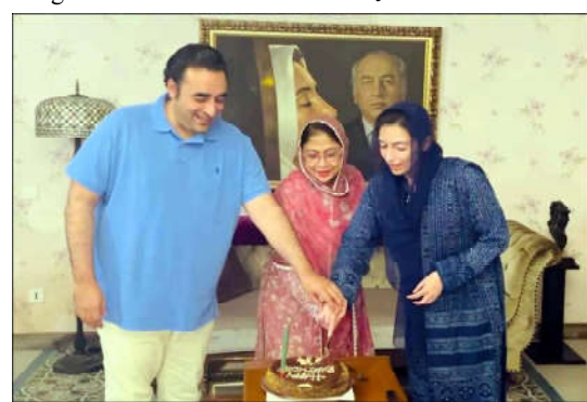
KARACHI: Peoples Party (PPP) Women Wing President, Faryal Talpur cutting her birthday cake along with Bilawal Bhutto Zardari, PPP Chairman and Aseefa Bhutto Zardari, First Lady held at Bilawal House.