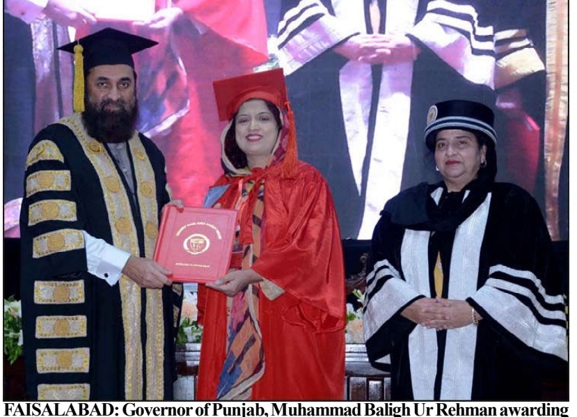
degrees among the successful students during the 4th Convocation of Government College Women University Faisalabad (GCWUF).

chief justice to visit the High Court Bar Association Multan at the earliest. The leaders of the lawyers apprised the chief justice of the issues faced by the bar associations in the Multan division and discussed matters of mutual interest. They praised the initiatives taken by the chief justice for the convenience of lawyers and litigants and offered suggestions for the welfare of the bar associations. President of the High Court Bar Association Multan requested the chief justice to increase the number of