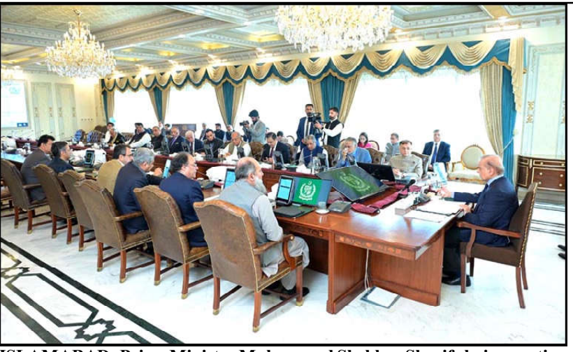
ISLAMABAD: Prime Minister Muhammad Shehbaz Sharif chairs meeting