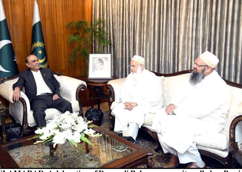
ISLAMABAD: A delegation of Dawoodi Bohra community called on President Asif Ali Zardari, at Aiwan-e-Sadr.

Board of Revenue (FBR) had old and obsolete systems which needed to be However, he main- replaced to increase the tax government will perform 'major surgical operation' potential to earn extra revenues worth hundreds of House, he said that he had rooted flaws in the implementing reforms in ordered to form an inquiry country's economy, he its system.