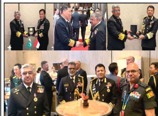
Chief of the Naval Staff Admiral Naveed Ashraf interacting with Naval Heads of various Navies during 19th Western Pacific Naval Symposium in Qingdao China.

"Locals of the area appreciated the operation. The sanitization operation is being carried out to eliminate terrorists, if any, found in the area as security forces are determined to wipe out the menace of terrorism from the country," the ISPR said.