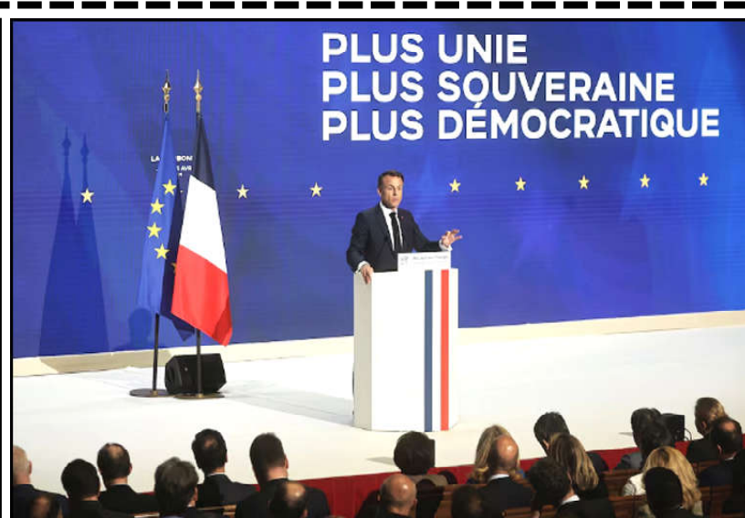
French President Emmanuel Macron delivers a speech on Europe in the amphitheatre of the Sorbonne University in Paris, France.

torrential rains triggered floods that caused chaos across the city, blocking roads and bridges and engulfing homes in slum districts. Kenyans have been warned to stay on alert, with the forecast for more heavy rains across the country, while officials said people living in the most vulnerable areas would be relocated. "The government will do whatever it takes, apply all the required resources in terms of money and personnel to make sure that lives are not lost and the people of Kenya are protected from this disaster," Deputy President Rigathi Gachagua told a press briefing. Meanwhile, the UN humanitarian response agency OCHA said in an update this week that in Somalia, the Gu (April to June) rains are intensifying with flash floods reported since April 19.