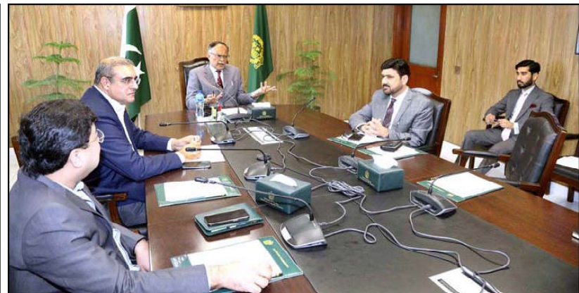
ISLAMABAD: Federal Minister for Planning Development & Special Initiatives, Professor Ahsan Iqbal chairs a meeting to review progress over CPEC Joint Group Works and upcoming 13 JCC.

Chairman Senate Syed Yusuf Raza Gillani referred all the bills to the concerned senate standing committees for detailed deliberation.