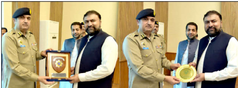
QUETTA: Chief Minister Balochistan Mir Sarfraz Bugti and Inspector General Motorway Police Salman Chaudhry exchanging souvenirs

Earlier, the Minister was briefed about the performance of police besides other related matters. It was informed that work is going on the safe city project in other districts of the province.