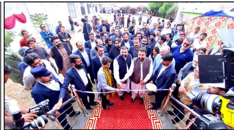
QUETTA: Chief Minister Mir Sarfraz Bugti and Assistant Secretary General UNDP Kanni Wignaraja inaugurating UNDP-assisted project of construction of houses built for the flood affected people in the province.

She mentioned that we are assisting the government in resettlement of the flood affected people as well as alternative sources of energy, rules of law and sustainable development goals (SDGs) in the province under UNDP.