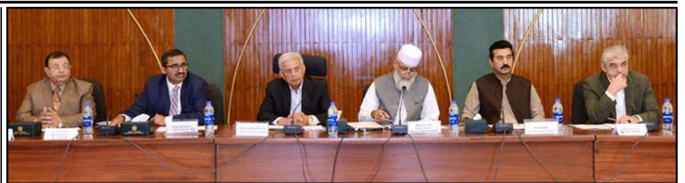
ISLAMABAD: High-powered Federal Committee on Agriculture (FCA) mandated to oversee strategic measures for ensuring food security in the country, held its meeting under the Chairmanship of Rana Tanveer Hussain, Federal Minister for National Food Security & Research.

The meeting discussed in details responsible use of social media platforms, said a news release.