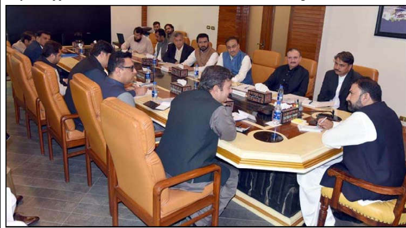
QUETTA: Balochistan Chief Minister, Mir Sarfraz Bugti chairing a review meeting of Welfare Board's Affair.

CJP Qazi Faez Isa remarked when the foundation of something is wrong then it happens so. The thing cannot sustain.