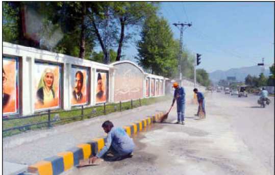
ABBOTTABAD: Workers of Water and Sanitation Services Company Abbottabad (WSSCA) are cleaning and collecting solid waste during cleaning drive campaign at the Main KKH road in Abbottabad.

relevant authorities to commence work on this project. He further instructed them to ensure the completion of all necessary arrangements for tendering the CRBC Left Canal Project by July of the current year. The Chief Minister emphasized that the CRBC Left Canal Project is indispensable for the food security of the province and highlighted its importance for the country's food security. He stressed the need for early completion without any further delay. The Chief Minister stated that the provincial government would provide funds on a priority basis for projects, considering the economic viability of the project.