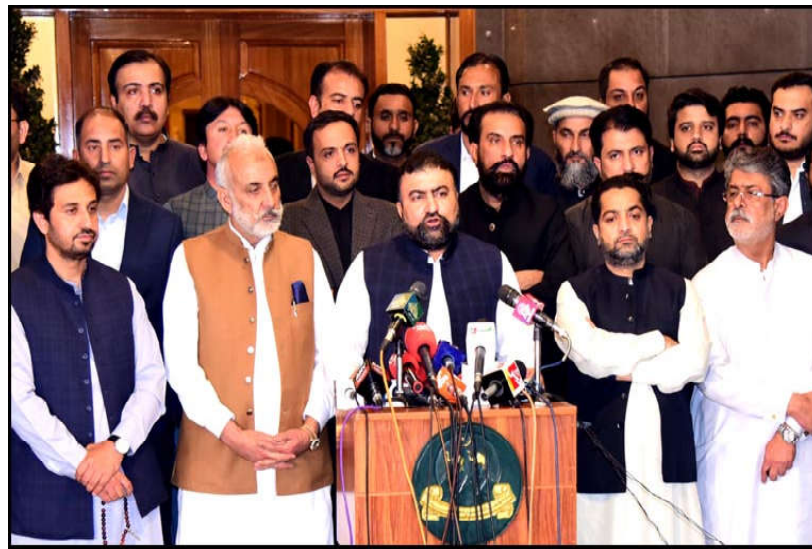
QUETTA: Chief Minister Balochistan Mir Safaraz Bugti talking with mediemen. Provincial Ministers are also present

In a petition submitted to National Electric Power Regulatory Authority (NEPRA) on behalf of XWAPDA power distribution companies (DISCOs), the CPPA-G maintained the actual cost of electricity remained Rs 9.38 per unit against reference fuel charges of Rs 6.44 per unit for the month of March.