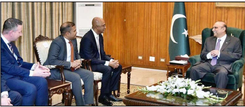
ISLAMABAD: A delegation of Air Asia Aviation Group (AAAG) called on President Asif Ali Zardari at Aiwan-i-Sadr.