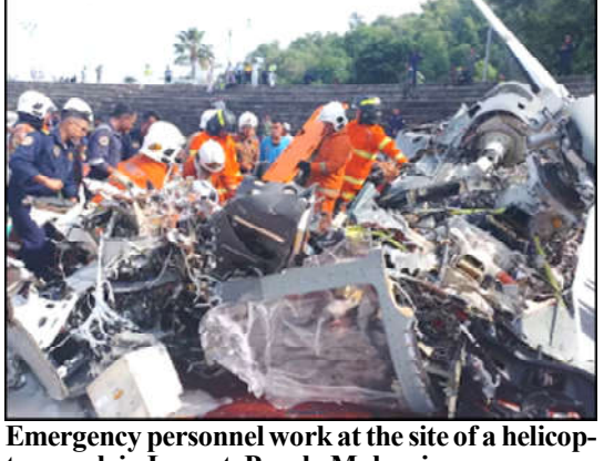
Emergency personnel work at the site of a helicopter crash in Lumut, Perak, Malaysia.