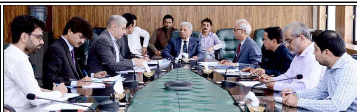
ISLAMABAD: Federal Minister for Industries Production and Food Security, Rana Tanveer Hussain being briefed by Commissioner Livestock Stock regarding Livestock Department.

The agriculture credit disbursement during the period from July-February, 2024 witnessed 33.6 percent growth as compared to the same period of last year, he said adding that during the period under review the current account deficit decreased by 74 percent and reached to $1.00 billion as against the deficit of 3.9 billion.