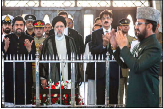
KARACHI: Iranian President Dr. Seyyed Ebrahim Raisi along with others paying homage to Quaid-e-Azam Muhammad Ali Jinnah during ceremony held at Jinnah Mausoleum in Karachi.

The Iranian President thanked Prime Minister Muhammad Shehbaz Sharif and Chief Minister Punjab Maryam Nawaz Sharif for the cordial hospitality during his visit.