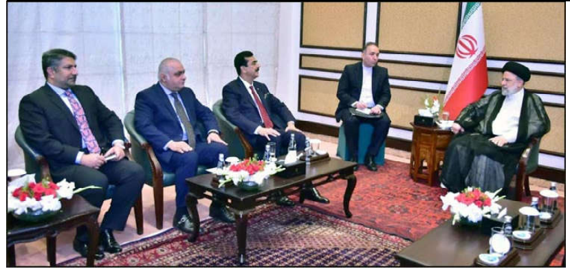
ISLAMABAD: Chairman Senate, Syed Yousaf Raza Gilani in a meeting with Iranian President Ebrahim Raisi.

He also shared concerns over recent developments in Indian Illegally Occupied Jammu and Kashmir, highlighting the volatile situation and expressed gratitude for Iran's continued support towards the just cause of the Kashmiri people.