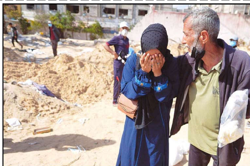
A grieving woman is consoled by a man after the body of her relative was discovered, buried by Israeli forces in a mass grave in the Nasser hospital compound in Khan Younis.

In March 2023, China mediated an agreement under which Iran and Saudi Arabia restored full diplomatic relations that were cut since 2016 over Riyadh's execution of a Shi'ite Muslim cleric and the subsequent storming of the Saudi embassy in Tehran.