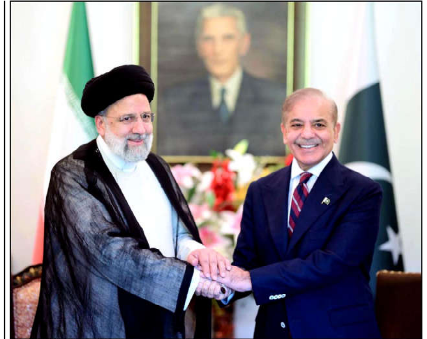
ISLAMABAD: Prime Minister Muhammad Shehbaz Sharif meets with Iranian President H.E. Dr. Seyyed Ebrahim Raisi.

The Iranian President believed that the position adopted by the people around the world and by the Palestinian resistance would surely be realized one day.