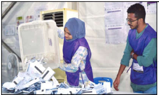
Officials count votes during the parliamentary elections, at a polling station in Maldives's capital Male.

Omer Celik, spokesman for Erdogan's ruling party, said last week that Ankara considers the creation of the marine parks "a step that sabotages the normalization process" in relations, and said Turkey would "in no way allow actions toward the declaration of marine parks in the Aegean Sea." Mitsotakis, speaking last week after a meeting of European leaders in Brussels, expressed surprise at what he described as "Turkey's totally unjustified reaction to an initiative which at the end of the day is of an environmental nature."