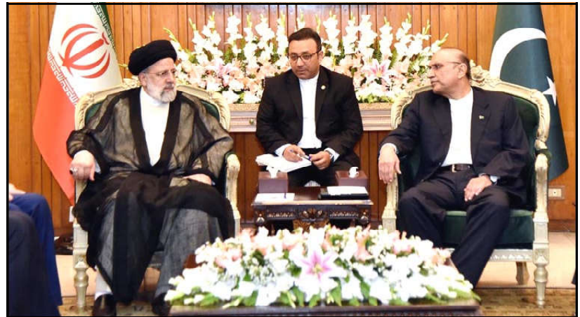
ISLAMABAD: President Asif Ali Zardari and the Iranian President, Dr. Seyyed Ebrahim Raisi, held a meeting, at Aiwan-e-Sadr.

The Minister also directed to ensure enforcement of biometric system in all the institutions.