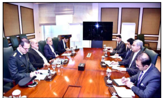
ISLAMABAD: Federal Minister for Interior Mohsin Naqvi in a meeting with his Iranian counterpart Dr. Ahmad Vahidi and Iran's Justice Minister Amin Hosein Rahimi.

They also agreed to cooperate in developing joint approaches to confront common challenges including the threat of terrorism.