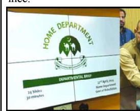
QUETTA: Home Minister Mir Ziaullah Lango presiding over a meeting regarding law and order situation in the province

They also discussed the matters about women empowerment in the province.