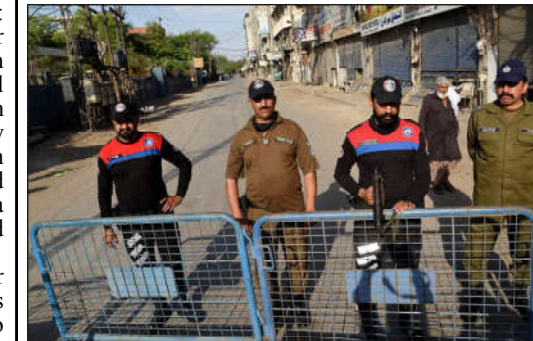
LAHORE: Police officials stand alert outside the polling station during the election 2024 at Barf Khana Chowk Railway Road.