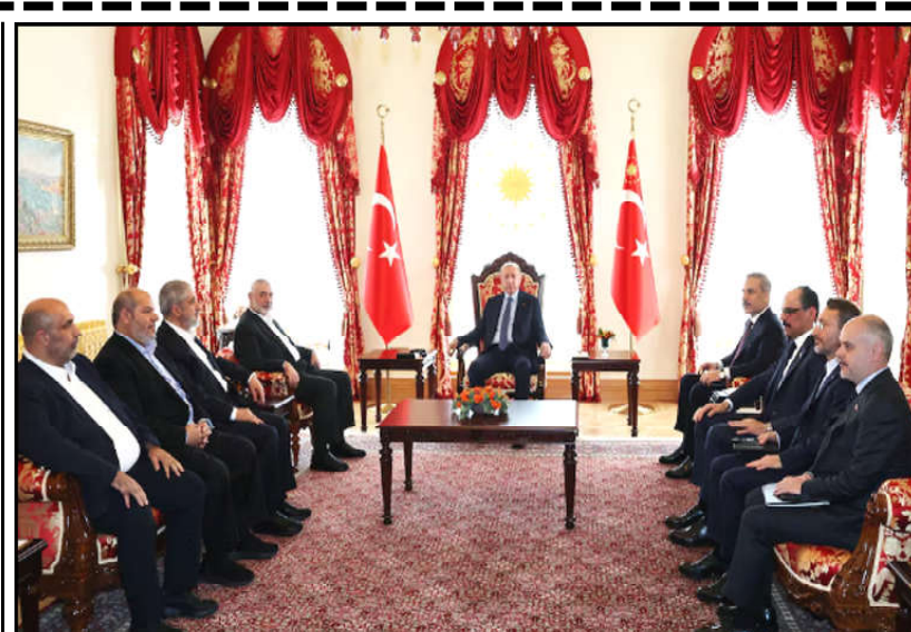
Turkey's President Tayyip Erdogan meets with Ismail Haniyeh, leader of the Palestinian Islamist group Hamas, in Istanbul, Turkey.

Monitoring Desk RAMALLAH: The Palestinian Authority will "reconsider" its relationship with the United States after Washington vetoed a Palestinian bid for full UN membership earlier this week, president Mahmud Abbas said on Saturday. "The Palestinian leadership will reconsider bilateral relations with the United States to ensure the protection of our people's interests, our cause, and our rights," Abbas told the official Palestinian news agency Wafa. Wafa said his remarks came "on the heels of the United States' use of veto power" at the UN Security Council. Thursday's vote saw 12 countries on the Council back a resolution recommending full Palestinian membership and two — Britain and Switzerland — abstain. Only the United States, Israel's staunchest ally, voted against, using its veto to block the resolution.