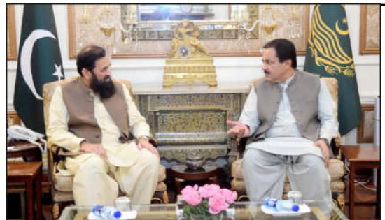
LAHORE: Deputy Chairman Senate Syedal Khan Nasir in a meeting with Governor Punjab Muhammad Balighur Rehman at Governor House.

to strengthen our democratic institutions for sustainable development of country. He said that the current leadership is taking concrete steps to address the challenges facing the country. Governor Punjab said that an economically self-sufficient, energetic Pakistan and a socially empowered society with high morals and mutual respect is our destination.