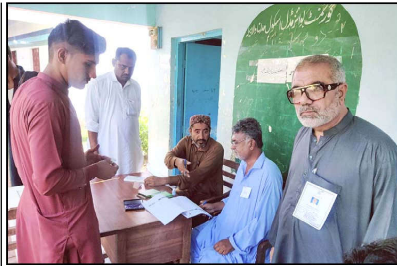
The ballot casting process is underway at a polling station during the By-Election in PB-22 constituency in Lasbela

Elections were originally scheduled for 23 constituencies. However, the results of two seats, one national [NA-207 Shaheed Benazirabad] and one provincial [PS-80 Dadu], had already been announced.