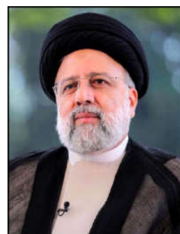
and Karachi, where he would hold talks with the provincial leadership. The Iranian president would be accompanied by his spouse, the foreign min-

During his stay, Raisi will meet President Asif Ali Zardari, Prime Minister Shehbaz Sharif, Senate Chairman Yousaf Raza Gilani and National Assembly Speaker Sardar Ayaz Sadiq, the statement said, adding that he was also scheduled to visit Lahore