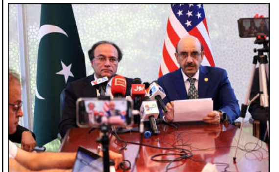
WASHINGTON DC: Finance Minister Mr. Muhammad Aurangzeb's interaction with Pakistani media at Pakistan Embassy.

Pakistan is requesting a "larger and longer" multi-billion-dollar loan programme from the IMF and discussions are underway with the Fund's officials, the finance minister said, without specifying how much the nation was trying to secure.