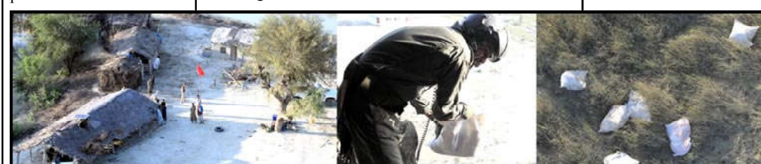
Pakistan Navy rescue teams air dropping ration bags to trapped people of Muradi, Dando and Kulanch near Gwadar.

through local sources that large number of people were stranded into houses due accumulated water in vicinity and were in immediate need of ration supplies. Pakistan Navy Rescue teams immediately co-ordinated the efforts and air dropped ration bags to affected people of Muradi, Dando, Kulanch and adjoining isolated areas of Gwadar District.